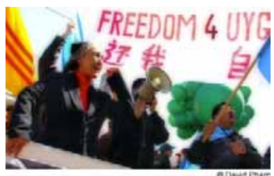
Chinese protestors for Uyghur freedom

Kazakhstan has largely avoided the ethnic conflict that has affected other countries in the region. This threat appeared most severe during the first decade of the independent era, when tensions between the Russian and Kazakh communities mounted over issues such as nationality, official language policy, and access to economic opportunities. A large-scale outmigration of Russian and other non-Kazakh ethnic groups occurred