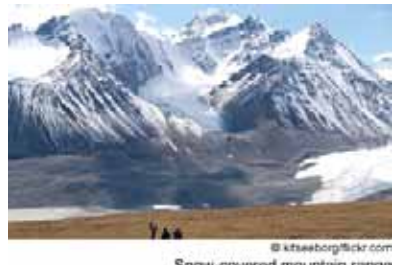
Snow provered mountain range

Kazakhstan is a large, geographically diverse country in Central Asia. Although it has an extensive shoreline on the Caspian Sea, it is blocked from ocean access. The country's terrain varies from fertile, grassy steppes in the north to barren desert in the south, and a depression below sea level in the west, to high mountain peaks in the east. In the ancient era, travelers passed through the region via the Silk Road—a network of trade routes that