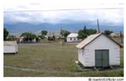
Chinese-Kazakh border region

Kazakhstan's relations with China are largely founded on energy extraction and delivery contracts; these deals serve to meet the extensive energy demands of China, the world's 2nd largest consumer of oil and 12th largest consumer of natural gas. Chinese companies, notably the state-owned China National Petroleum Corporation (CNPC), have invested in numerous Kazakhstani oil fields over the last several years. This process has corresponded with the development of the Kazakhstan–China oil pipeline, which will connect oil fields in the Caspian Sea region to facilities on the Kazakhstani-Chinese border. This extensive, three-stage pipeline is partially under construction; its unfinished middle section—spanning central Kazakhstan—is scheduled for completion in 2011. In 2006, the eastern portion of the pipeline opened, allowing for the initial flow of Kazakhstani oil into China. China China einterests have also signed several natural gas deals with Kazakhstan; these projects include the construction of a major pipeline running from Turkmenistan to China via Kazakhstan. An estimated one third of the pipeline's capacity will be filled by Kazakhstani natural gas exports.