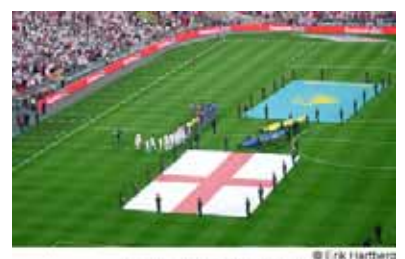
Socoer game, Kazakhstan vs. England

Today, soccer, known elsewhere as football, is an extremely popular spectator sport. The country's professional league, now known as the Premier League, was founded shortly after independence. The Soviet legacy is evident in Kazakhstan's participation in various Olympic events, including speed skating and ice hockey, both of which are quite popular. The massive Medeo skating rink in Almaty hosts these activities. Other winter