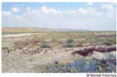
Mentar Kibernes Arral Since schools

While the Soviet-created network of irrigated cotton plantations remains one of Kazakhstan's biggest cash crops, it comes at high cost. The Aral Sea's shrinkage proved disastrous to the local environment, economy, and population. As the moderately saline sea lost most of its freshwater input from the rivers, it became increasingly salty. The higher salt and mineral concentration made the water undrinkable and eradicated the native fish