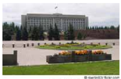
Government building in Almaty

Asian Development Bank (ADB), Commonwealth of Independent States (CIS), Collective Security Treaty Organization (CSTO), Eurasian Economic Community (EAEC), Euro-Atlantic Partnership Council (EAPC), European Bank for Reconstruction and Development (EBRD), Economic Cooperation Organization (ECO), Food and Agriculture Organization (FAO), General Confederation of Trade Unions (GCTU), International