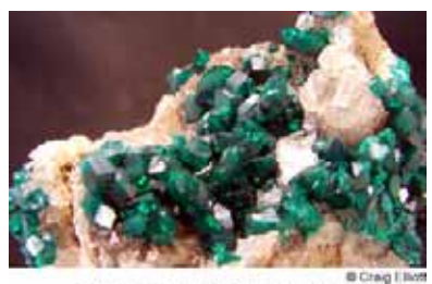
optase minerals from Karaganda Province

In addition to fossil fuels, Kazakhstan possesses massive reserves of other mineral resources, the extraction and processing of which have contributed greatly to the nation's industrial output. The country has major deposits of iron ore, lead, copper, chromite, gold, zinc, bauxite, manganese, and uranium. Its reserves of the latter resource are particularly rich; Kazakhstan is thought to possess roughly 20% of the world's total uranium supply.