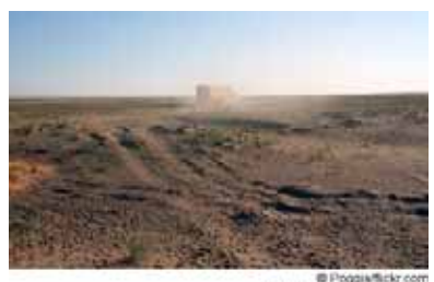
Desert in Kazakhstan

Spanning central and southern Kazakhstan, from the far west to the southeastern mountains, semi-desert and desert terrain covers over two thirds of the nation's territory. From north to south, the region's ground cover transitions from grasslands to shrublands, with substantial areas of barren desert and smaller regions of irrigated cropland or pasture around water sources. The region generally consists of flat lowlands, although higher