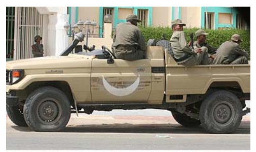
After the coup

Maaouya Ould Ahmed Taya, Haidalla's successor, had served as prime minister and minister of defense under Haidalla after the 1981 coup attempt. He served in those roles until 1984, when he was ousted in one of Haidalla's increasingly frequent government reshufflings. Taya subsequently came to power after leading the December 1984 coup against Haidalla. He retained his position as leader of Mauritania for more than two decades.