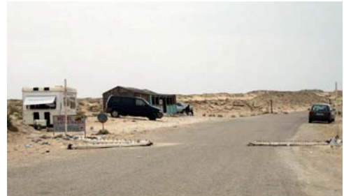
Border crossing into Mauritania

Although Mauritania does not directly border Morocco proper, it does share an extensive border with Western Sahara, which Morocco has exerted de facto control over for more than three decades.<sup>360</sup> The two countries had very tense relations during the 1960s, and it was not until 1970, a decade after Mauritania became independent, that Morocco abandoned all territorial claims to Mauritania. The Western Sahara conflict during the last half of the 1970s embroiled both nations in a guerilla war. Eventually, militarily weak Mauritania signed a peace treaty with Western Sahara's Polisario Front in August 1979.<sup>361</sup>