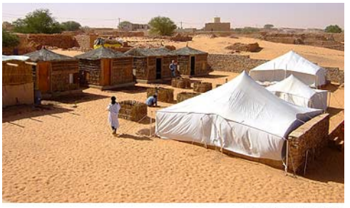
© John Spooner Chinguetti tourism down

Attacks by suspected Islamic militants that killed four French tourists on Christmas day in December 2007 caused the cancellation of the famed Paris-Dakar road rally in 2008. The off-road race—which traditionally