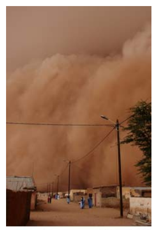
Blinding dust storm

The Sénégal River, which forms the boundary between Mauritania and Senegal for about 515 km (320 mi), is Mauritania's only permanent waterway.<sup>25</sup> It flows through a valley up to 19 km (12 mi) wide that is completely filled by the river during the flood season. After the flood