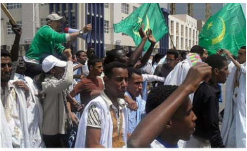
Youth protest in Nouakchott

As noted in The Economist in 2008, "[w]hile the rest of Africa seems to be slowly ridding itself of its penchant for coups, Mauritania seems to be perfecting its ability to stage them." <sup>410</sup> Mauritania has had two military coups since August 2005 and five altogether since independence. The 2008 coup, in which a democratically elected civilian president was removed from power after trying to fire several senior military officers, triggered an onslaught of protest and sanctions from all corners of the world. The rapidly called 2009 presidential election, won