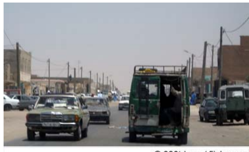
Streets of Nouadhibou

Nouâdhibou lies halfway down the Râs Nouâdhibou peninsula near Mauritania's northern border with Western Sahara. Its location on Dakhlet Nouâdhibou, one of West Africa's largest coastal bays, has made it an important port city since the French colonial era, when it was known as Port Étienne.<sup>52,53</sup> Nouâdhibou is the center of Mauritania's fishing industry. In addition, it plays an even more important economic role as the location from which Mauritania exports its valuable iron ore to steel mills in China and Europe.<sup>54</sup> A special port facility south