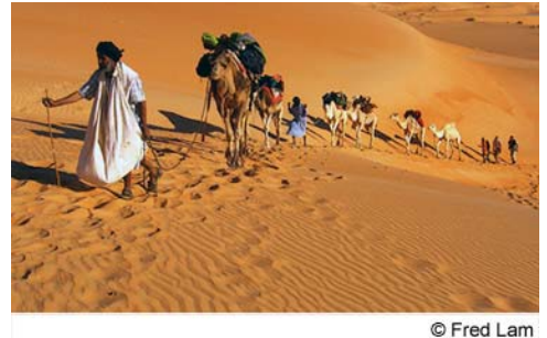
Camels in the desert

Much of modern-day Mauritania consists of the Sahara Desert, one of the more inhospitable areas to human habitation on Earth. Thousands of years ago, however, the climate of the Sahara region was considerably different. Grasslands and rivers predominated, supporting populations of large mammals such as elephants and hippopotamuses.<sup>85</sup> Agriculture and livestock herding took place in areas that today support little or no vegetation.