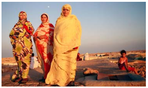
Sahrawi refugees

Algeria has long been the most prominent regional supporter of the Polisario Front, whose headquarters are at the refugees camps clustered around the western Algerian oasis town of Tindouf, situated near both the Western Saharan and Mauritanian borders.<sup>382, 383</sup> Relations between the two countries, especially during the 1970s and 1980s, have been heavily influenced by the Western Sahara conflict and the related rift between Morocco and Algeria.<sup>384</sup> Algeria and Mauritania broke off diplomatic relations in 1976 during the Western