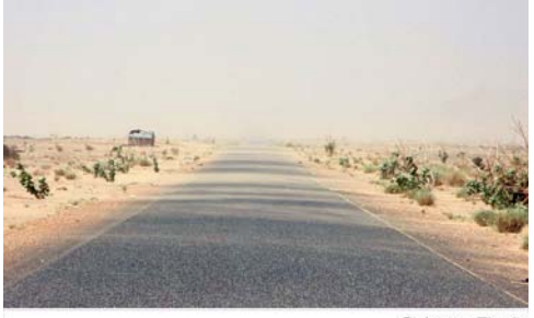
Sandy roads in Mauritania

of these herders increasingly became the exception rather than the norm.<sup>65</sup>