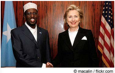
Shariif & Hillary Clinton

Since 2002, the U.S. has partnered with Mauritania and several neighboring countries in counterterrorism programs. The initial program was the Pan-Sahel Initiative (2002–2004), followed by the Trans-Sahara Counter-Terrorism Partnership (TSCTP; 2005–present). The latter program is noteworthy for its "holistic" approach to counterterrorism. In addition to focusing on training and equipping local military and law enforcement groups, the program strengthens economic, democratic, and good-governance capacities in order to inhibit extreme Islamist philosophies from spreading.<sup>356, 357</sup>