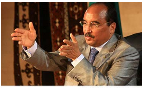
President Aziz

Aziz assumed leadership of the Mauritanian government amid widespread international condemnation of the latest coup, the fifth in Mauritania's post-independence history.<sup>176</sup> The African Union placed financial and travel sanctions on Mauritania in early 2009, following earlier suspensions of financial aid by France, the United States, and the World Bank.<sup>177, 178</sup> In July 2009, new presidential elections were held, with Aziz winning a plurality of the vote in the first round.<sup>179</sup> (Due to a Mauritanian law forbidding military officials from running for the