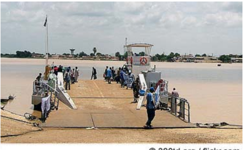
Crossing the Senegal River

Excluding the Western Sahara conflict, the closest Mauritania has ever come to war with one of its neighbors came in 1989–1991, when Senegal and Mauritania narrowly avoided armed hostilities. The crisis was set in motion by a dispute over grazing rights in the Sénégal River valley that quickly escalated and spurred ethnic violence. Beydane ("white Moor") Mauritanian shopkeepers in Senegal were forced to flee northward, while Sengalese in Mauritania fled in the other direction. Ultimately, each country began deporting the other's