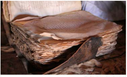
© Christophe André 12th Century writing

The religious division between elements of the Sanhadja Confederation sparked a remarkable, if short-lived, political movement during the early 11th century. Around 1039, Abdallah ibn Yassin, a Berber Islamic theologian, was recruited by the chief of the Djodala (one of the Sanhadja Berber groups) to help instill a more orthodox practice of Islam among the other Sanhadja Berbers.<sup>98</sup> Ibn Yassin's austere form of Islam was far from wholeheartedly embraced by the Djodala. After a