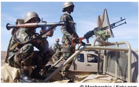
Military prepares for al-Qaeda

Mauritania's strongest terrorist threat comes from al-Qaeda in the Islamic Maghreb (AQIM). This organization was originally founded in 1998 as the Salafist Group for Preaching and Combat (GSPC by its French acronym), a splinter group of the Algerian-based Armed Islamic Group (GIA).<sup>398</sup> The GSPC's original goals, like that of the GIA, were the overthrow of Algeria's military government and the establishment of an Islamic state in its stead. The primary difference between the two groups was that the GSPC initially did not consider civilians to be legitimate targets for its attacks.<sup>399</sup>