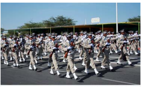
Mauritanian military

Although Mauritania's total forces are not large in number, the nation's military has long taken a front row seat in the political affairs of the nation. Only two of Mauritania's noninterim heads of state since independence—presidents Moktar Ould Daddah (1960– 1978) and Sidi Mohamed Ould Cheikh Abdellahi (2007– 2008)—have not been active or former military leaders.<sup>395</sup>