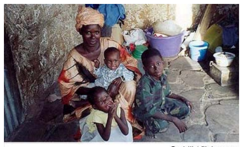
Bambara women and children

Language has long been divisive in Mauritania. Classical Arabic is the nation's official language, although the Hassaniyya dialect is used by the majority of the Moorish population. The constitution also recognizes Fulani