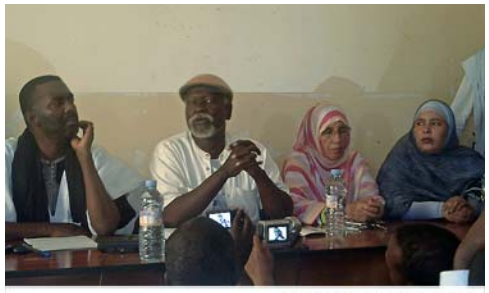
Activist push for action

Mauritania's legacy of slavery has been ethnically divisive among white Moors, black Moors, and black Africans. At some points in Mauritania's history, tensions and fears between the white Moors and the black Africans have spilled over into ethnic-based violations of human rights. One such case occurred in 1989–1991 during the conflict with Senegal, a period in which many black African Mauritanians were forced to leave the country and tens of thousands of black Africans were purged from the military and government. The