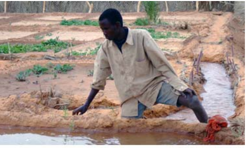
© John Spooner Mauritania food production

When the French pulled out of Mauritania in 1960, the newly independent nation had little to show for its decades of colonial rule. France largely ignored the Mauritanian colony until after World War II and did not begin construction of a capital city until 1958.<sup>186, 187</sup> Only limited transportation was developed under French rule, and virtually nothing was done to develop the country's economic resources.<sup>188, 189</sup> Large deposits of iron ore and copper, along with rich fishing grounds off the coast, remained largely untapped.