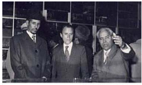
Mohammed Haidalla, Mauritania 1983

Salek became leader of a new 20-man military regime known as the Military Committee for National Recovery (CMRN;), but he was unsuccessful in extracting Mauritania from the Western Sahara conflict. Salek's desire for a comprehensive agreement that included both Morocco and the Polisario Front also proved infeasible, given Morocco's resistance to a settlement.<sup>143</sup> He also showed bias toward Moors in his appointments to a National Consultative Council, which contributed to increasing ethnic tensions during the early months of 1979.<sup>144</sup>