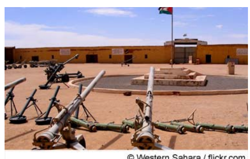
Sahrawis war museum

Previous to the Agreements, in 1973, anti-colonialist sentiment within Western Sahara sparked some of the indigenous Sahrawis to form the Polisario Front.<sup>138</sup> This organization initially fought against Spanish control of the Western Sahara region and later targeted Morocco and Mauritania after the signing of the Madrid Agreements. Daddah seemingly misread the threat posed by the Polisario Front, which immediately began a guerilla war against militarily weak Mauritania that