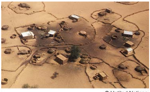
Village struck by drought

Mauritania has become a classic case study of the global problem of desertification. The nation's numerous droughts in the 1970s and 1980s did not, by themselves, lead to desertification.<sup>70</sup> Overgrazing of the sparse vegetation that helped protect the fragile soil of Mauritania's arid and semiarid regions also contributed.<sup>71</sup> In addition, much of Mauritania's southern forest cover has been cleared for farmland or used for fuel.<sup>72</sup> Between 1990 and 2005, Mauritania lost almost 36% of its already limited forest cover.<sup>73</sup>