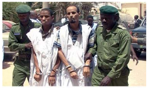
Al-Qaeda spies captured

Much publicity has been given to the Trans-Sahara region in recent years as terrorism analysts try to identify areas susceptible to becoming "safe havens" for violent Islamist groups.<sup>345, 346</sup> Most of Mauritania—along with Mali, Niger, and southern Algeria—lies within this Trans-Saharan region; all of these countries, with the exception of Algeria, are among the poorest in the world and have limited resources for policing extensive desert regions.<sup>347, 348, 349</sup>