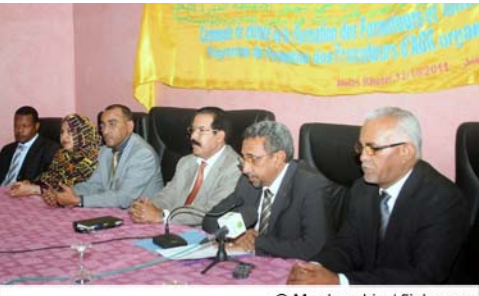
Aid to businesses

Mauritania is generally not viewed as an easy country for foreign investors to operate in, ranking 165th out of 183 countries on the World Bank's 2010 Doing Business measure.<sup>248</sup> Bureaucratic red tape, political uncertainties, terrorism risks, infrastructure weaknesses, and corruption have hindered foreign investment in most economic sectors.<sup>249</sup> The most notable exceptions have been oil and mineral companies, who have provided roughly 80% of the total foreign investments in Mauritania.<sup>250</sup> The fishing, banking, and telecommunications sectors have