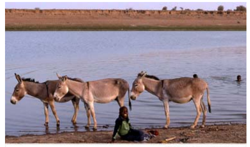
Boys at the Senegal River

The Gorgol and Karakoro Rivers are the primary tributaries of the Sénégal River that lie within Mauritania, but neither river flows year-round.<sup>29</sup> The Gorgol River enters the Sénégal River near Kaédi and is dammed upstream for irrigation purposes.<sup>30</sup> The Karakoro River joins the Sénégal River upstream from the Gorgol River's confluence with the Sénégal, near a point where the boundaries of Mauritania, Mali, and Senegal meet. The Karakoro forms the Mali-Mauritania border for most of its length.