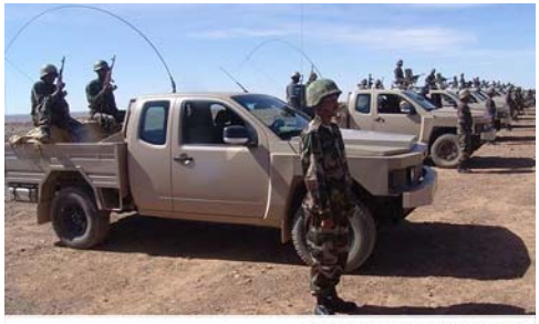
Protecting the Mali border

The terrorist organization al-Qaeda in the Islamic Maghreb (AQIM) operates with impunity in these remote