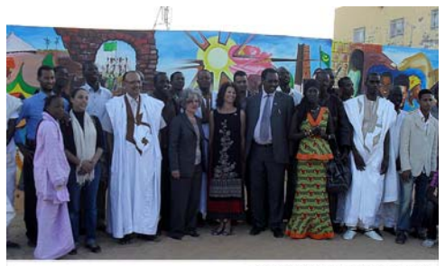
Celebrating Independence

The country of Mauritania, like so many African nations, is a colonial construct. Its modern borders were defined by European treaties and the decisions of French administrators rather than by the territories of local peoples. Modern Mauritania has one foot in the Arabized regions of North Africa and one foot in the western sub-Sahara, where wealthy ancient black kingdoms thrived during the Middle Ages. Since gaining independence in 1960, the country has been challenged by ethnic clashes within its borders, regional fighting involving