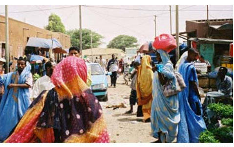
Streets of Nouakchott

Prior to Mauritanian independence, Nouakchott was a small coastal fishing village near a French fort.<sup>35, 36</sup> It was chosen as Mauritania's capital primarily because of its central location between the mostly black African population residing in the Sénégal River Valley, and the Arab-Berbers (white Moors) and the descendants of their slaves (black Moors) living in the northern and central interior.<sup>37, 38</sup> Originally developed to accommodate a population of 15,000, this number has ballooned. In the 1970s severe drought in the Sahara drove a large