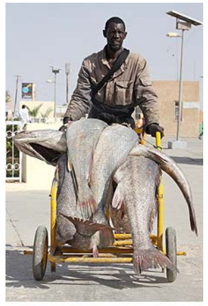
Catch of the day

While fish is not a major part of the typical Mauritanian diet, fishing provides a significant portion of Mauritania's economic output. It is the second-largest source of export revenue (behind only iron ore).<sup>199</sup> Foreign fishing vessels dominate this sector. Their access to Mauritanian coastal waters is licensed through several bilateral and international agreements with the Mauritanian government.<sup>200</sup> The fees and taxes from these licenses contribute a great deal to the national