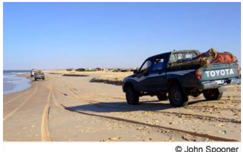
Old coast road

Mauritania's vast Saharan expanses have long created difficult and expensive challenges for opening the nation's interior to economic development. When Mauritania became independent in 1960, there were no paved roads and only 204 km (127 mi) of graded track running between Nouakchott and Rosso.<sup>255</sup> The situation slowly but steadily improved, most notably with the completion in 1985 of the "Road of Hope," which linked Nouakchott with eastern Mauritania. In 2004, Mauritania's two largest cities, Nouakchott and