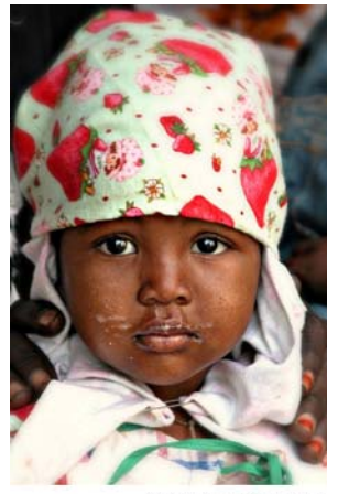
Mauritanian girl

Arranged marriages, common in some Islamic countries, occur less frequently in Mauritania, where the law requires the consent of both parties.<sup>310, 311</sup> Polygamy is legal under Mauritanian law, which follows