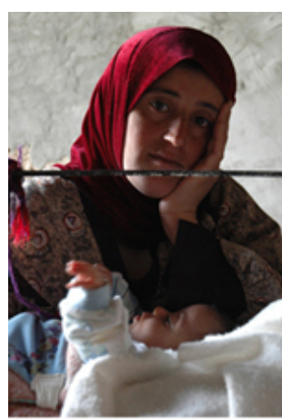
Woman with baby

Palestinian society typically relegates women to the domestic sphere and frowns upon women entering the workforce. Women are expected to honor their fathers and husbands through obedience and submission. Although women have been actively engaged in the organizations and movements aimed at Palestinian liberation, Palestinian authorities have not made gender issues a major priority. Estimates indicate that nearly one-quarter of Palestinian women suffer domestic abuse. Those claiming sexual abuse must endure virginity tests, even against their will. Honor killings, in which male family members murder their female relations if they are thought to have dishonored the family, are treated lightly. 385