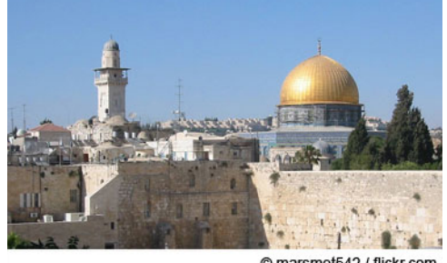
Dome of the Rock

Egyptian mastery over Palestine continued for more than two centuries until 1517, when the Turkish Sultan Selim I conquered Mamluk Egypt, including Palestine. He