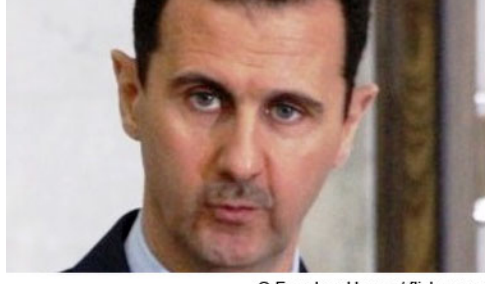
Syrian President Assad

The turbulence gripping North Africa and the Middle East in the aftermath of the Arab Spring of 2011 has created an unstable and unpredictable environment throughout the Levant. Palestinian terrorist organizations that have historically relied upon Syria for funding and arms face the uncertainty of whether such support will continue if the Assad regime falls. <sup>505</sup>