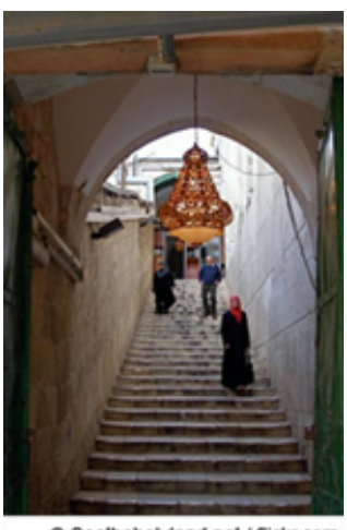
Tombs of the Patriarchs

The Palestinian Territories have long been contested space. Ethnic groups, religious groups, and empires have vied for control of this strategically important area. Abrahamic faiths (including Judaism, Christianity, and Islam) consider these territories to be part of their holy land. As such, ancient animosities continue to define internal and external relations. The most profound of these is the struggle between the Palestinians and the Israelis. The former are a people of mixed ancestry, with familial connections to the ancient Phoenicians and Arabs, and are primarily followers of Islam. (There is a small population of Christians among the Palestinians.) The latter are overwhelmingly Jewish and trace their lineage to the ancient Jewish kingdoms of Judah and Israel. They believe that their god set aside this land for them exclusively. But in the modern context, most of their families arrived in the area only in the last two centuries. Throughout the ages, these two peoples have lived alongside one another while their relationship has vacillated between acceptance and outright hostility—the theme of much of their recent history.