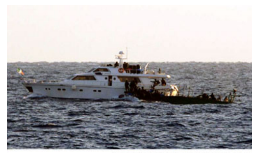
Blockade of Gaza

Though the West Bank is not blockaded, it still depends upon Israel for much of its energy and goods. Moreover, stringent restrictions on Palestinian workers crossing into Israel have dampened the West Bank economy. Strained