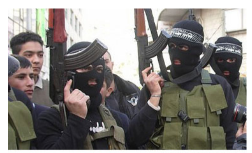
al-Agsa Brigade terrorists

The group was active in the clashes between pro-Fatah and pro-Hamas elements during the conflict that followed the 2006 election. 476 Al-Aqsa's Gaza units were crushed in the early stages of the Fatah-Hamas conflict. Many either joined Hamas or affiliated themselves with local clan militias. After Hamas seized control of Gaza, many Al-Agsa operatives were integrated into the Palestinian Authority's security forces. But the organization continues to carry out terrorist attacks. 477 Smaller groups