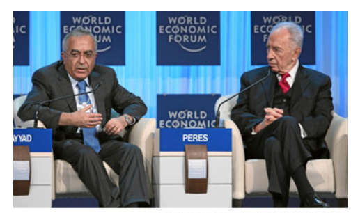
Favvad and Peres

Relations between Israel and the Palestinian Authority have been a source of mutual frustration and animosity, but have progressed some over the years. Yet the relations between Israel and Hamas remain tenuous at best. Because Israel does not consider the Palestinian Territories an independent state and the Territories do not operate as such, it is difficult to characterize Palestinian-Israeli relations as those between two independent states. Rather, their interactions are currently more akin to the internal relations between two entities (or three, given