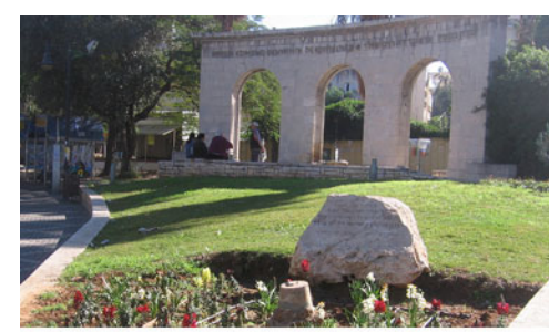
Monument to Rothschild

From 1876 to 1877, Palestinian parliamentarians from Jerusalem, elected under the new Ottoman Constitution, attended the first session of that body in Istanbul. This