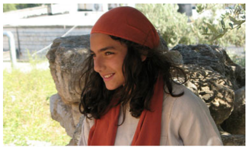
Girl in traditional clothes

Though many Palestinian youths and men commonly wear Western attire, older and more conservative men wear kaffiyehs , traditional headdresses. <sup>377</sup> Such headdresses originally functioned as protection from the sun; however, in the modern context the kaffiyeh serves as a symbol of Palestinian nationalism. The late Palestinian leader Yasser Arafat was seldom seen without a kaffiyeh . <sup>378, 379</sup>