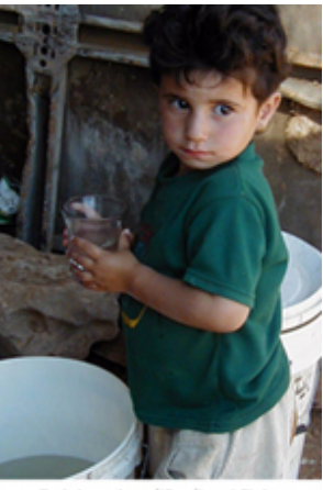
Drinking water

Another subterranean water source, the mountain aquifer, lies east of the coastal aquifer beneath the Samarian Highlands and Judaean Hills. Much of the mountain aquifer recharges itself, but many of the natural discharge areas lie within Israel. Thus, a high percentage of mountain aquifer water is used by Israel, which has been an ongoing concern for the Palestinian Authority. This fact has severely complicated efforts to establish an Israeli-Palestinian peace. 21