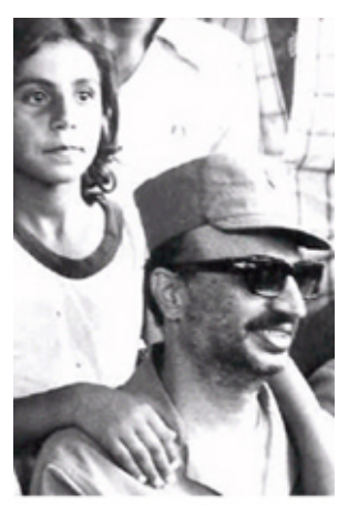
King Hussein of Jordan

In 1978, after years of increasing cross-border attacks from Lebanon to Israel, Fatah fighters killed dozens of Israeli civilians in the Coastal Road Massacre. In response, the Israeli Defense Force launched Operation Litani, seizing control of southern Lebanon in an effort to drive out Palestinian militants and establish a buffer zone. A subsequent 1982 Israeli invasion of Lebanon forced the PLO to evacuate and relocate to Tunisia. 262, 263