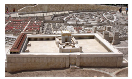
Model of Temple Mount

Much of what we know about the history of the region has relied upon Biblical accounts in the Old Testament and has been substantiated by archaeological and historical research. Archaeological evidence suggests that prehistoric peoples populated the area and engaged in agriculture as far back as 8000 B.C.E. <sup>165</sup> By 2750 B.C.E., the ancient Phoenicians had founded Tyre in modern Lebanon and settled along the eastern Mediterranean coast, including what is today the Gaza Strip, and named their territory Canaan. <sup>166</sup> By 1250