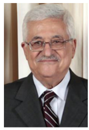
President Mahmoud Abbas

In November 2011, President Abbas met with Hamas political leader Khalid Meshal in Cairo, Egypt. The two agreed to move forward with elections in the Palestinian Territories scheduled for 2012. Although talks continue between Palestinian and Israeli peace negotiators, neither party has been willing to make the concessions necessary to arrive at a mutually acceptable agreement. 286, 287