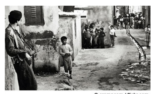
Watching stone throwers

A series of negotiations between Israeli and Palestinian representatives culminated in the 1993 signing of the Oslo Accords, creating the Palestinian Authority (PA) and providing for Palestinian control of the Gaza Strip and the West Bank. Under terms of the agreement, the PLO renounced the use of terrorism. The following year, Yasser Arafat became the first leader of the Palestinian Authority. 267, 268 Confident in his position, at the 2000 Camp David Summit he flatly rejected terms offered by Israeli Prime Minister Ehud Barak that would have created an independent Palestinian state. 269, 270