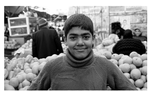
Ramallah market

The Palestinian service sector accounts for nearly 83% of GDP, and employs 56% of the workforce in the West Bank and 79% of the workforce in the Gaza Strip. 308, 309 Social services, healthcare, and government are the key service components. Government accounts for more than one-quarter of the