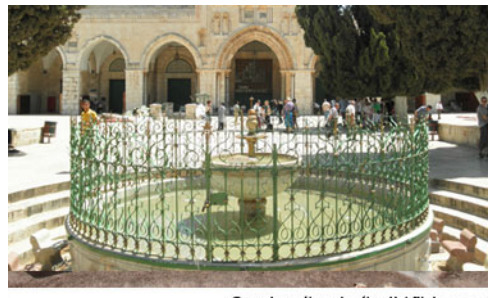
Al-Agsa Mosque

Then in 750, the Abbasid caliphs conquered the area and ruled most of Palestine from Baghdad until 1258. 178 But