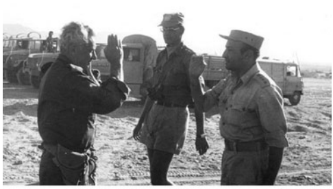
Egyptian and Israeli Generals

On October 6, 1973, in a surprise joint attack upon Israel launched on a major Jewish holiday, Egypt and Syria pushed into the Sinai and Golan Heights. Israel responded by driving the Syrians back to the outskirts of Damascus and cutting off the Egyptian Third Army in the Sinai—significantly weakening the Palestinians' staunchest supporters. <sup>258</sup>