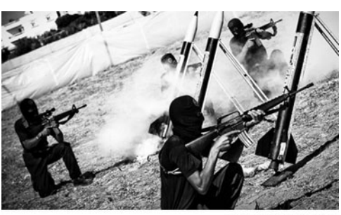
Hamas militants

In the Gaza Strip, all the police agencies are filled with Hamas-affiliated militants and terrorists. The Civil Police is staffed by those police who were already in uniform when Hamas seized control of the Gaza Strip in 2007 and were not affiliated with Fatah. Other members were drawn from the Executive Force, an armed Hamas faction. The Security and Protection service provides VIP protection. The Internal Security Service operates as Hamas' intelligence agency. It is known to harass pro-Fatah citizens and operatives. The