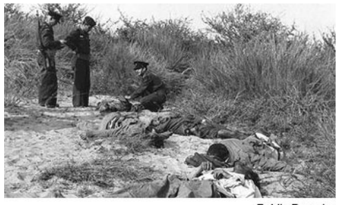
Public Domain Operation Black Arrow

The Law of Return, passed by the Israeli parliament (Knesset) in 1950, declared the right of all Jews to immigrate to the new Jewish state and provided assistance with settling therein, profoundly altering the demography of Israel and creating a need for additional land. 237 To the detriment of the Palestinians, infighting among the Arab states further weakened hopes of regaining independence. Following rumors that Lebanon and Jordan were discussing a joint peace agreement with Israel separately from their Arab allies, Palestinian