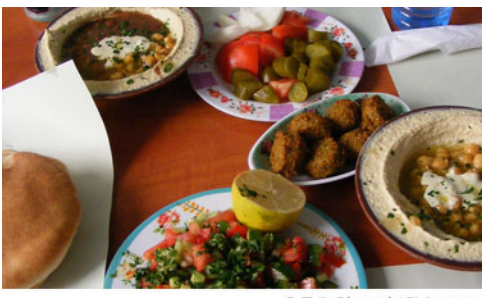
Palestinian cuisine

Palestinian cuisine reflects the region's turbulent history, drawing upon traditions from the empires that vied for control of the area. Arab, Persian, Egyptian, Turkish, and European influences have merged with local traditions to create a unique culinary tradition. Despite the small area of the Palestnian Territories and historical Palestine, there are discernable regional variations in Palestinian dishes. For example, Gazans are known to use more hot spices and to rely more