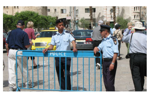
Police officers in Bethlehem

One provision of the Declaration of Principles ("Oslo Accords") signed in 1993 by Israel and the PLO was to amalgamate more than a dozen Palestinian forces from the various militant and terrorist organizations into a national security force under the auspices and command of the Palestinian Authority. But most of these paramilitary groups retain their membership in and their loyalty to the various organizations (e.g., Fatah, al-Aqsa Martyrs Brigades). Hamas' military wing serves as the sole security force for the Gaza Strip. 455, 456