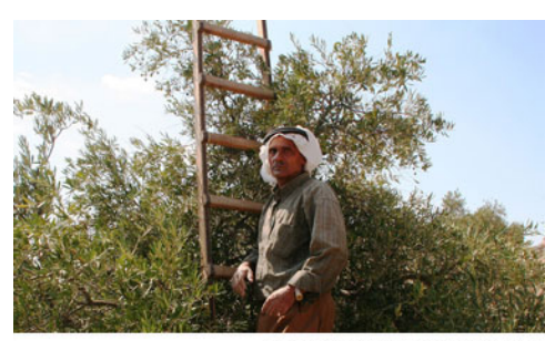
Olive Harvest near Nablus

According to the Palestinian Central Bureau of Statistics, more than 72% of imports in 2008 were from Israel. 319 The main imports were chemicals, consumer goods, construction materials, food, and petroleum, totaling USD 3.6 billion. The most important export commodities comprise fruit, olives, stone, and vegetables; however, they only generate about USD 518 million, leaving a trade deficit of more than USD 3 billion. 320, 321 For the 2008 fiscal year, foreign direct investment was a mere USD 1.34 billion. The security