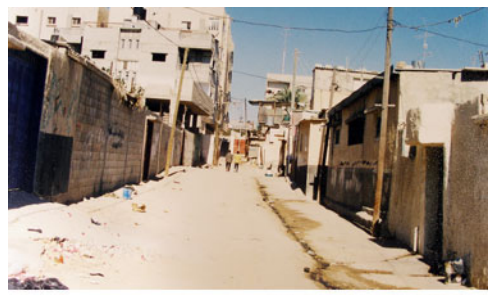
Open sewers in refugee camp

The major environmental concerns facing the Palestinian Territories relate to the availability of fresh water, which is inadequate to provide for the needs of the Palestinian people. Compounding the matter is the increasing salinity of aquifers, poisoning what little fresh water does exist. Improper sanitation in the major cities and refugee camps has further contaminated water resources. Recurrent droughts, soil degradation, and desertification also have been problematic. 163, 164