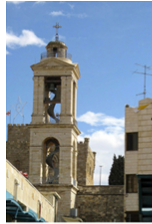
Bethlehem

Compounding the city's security situation are the four refugee camps within the municipality or nearby: al-Duheisha, al-Arroub, al-Aida, and Beit Jibrin. These camps have a combined population of more than 29,000 refugees. <sup>77</sup> The camps are prime recruiting grounds for the various Palestinian militant and terrorist organizations.