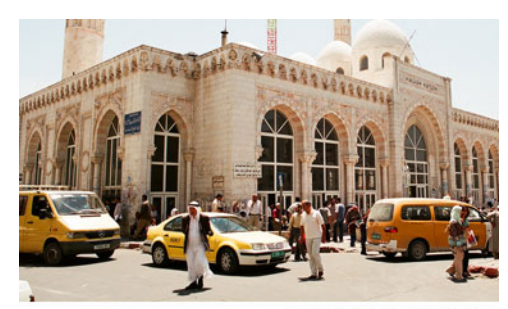
Mosque in Ramallah

Islam is a monotheistic religion, meaning that its followers believe in a single deity. The Muslim community, or umma , calls this deity Allah. The Arabic term islam means "to submit" or "to surrender." Therefore, a Muslim is one who submits to the will of Allah. <sup>339</sup> Muslims believe that Allah revealed his message to the Prophet Muhammad, a merchant who lived in Arabia from 570 to 632 C.E. They consider Muhammad to be the last in a long line of prophets including Abraham, Moses, and Jesus. Allah's message,