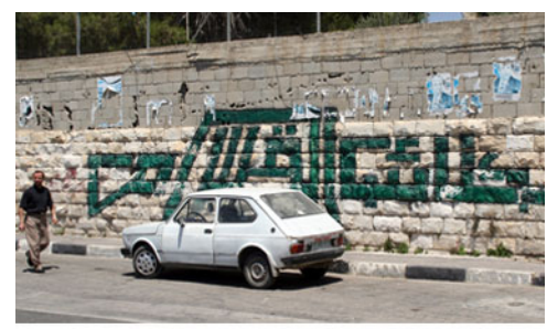
pro-Hamas graffiti

Formed in 1987 at the beginning of the First Intifada, the group is based primarily in the Gaza Strip. Hamas seeks to liberate Palestine and create an Islamist state under shari'a law. Its armed wing, the Izz al-Din al-Qassam Brigades, was established in 1992. Under the political leadership of Khaled Mashal, Hamas seized control of the Gaza Strip in early 2007, after the fighting that emerged when Hamas won the 2006 Palestinian legislative elections. The de facto Hamas government for the Gaza Strip is headed by Ismail