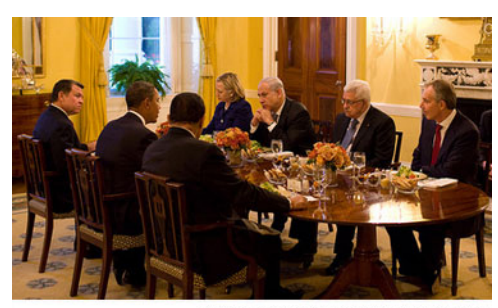
Middle East meeting

Within minutes of the establishment of the modern state of Israel, the United States recognized the new nation. From that instant, the United States has long been an ally of Israel and has played a leading role in negotiations between Israel and Palestinian factions, especially the Palestine Liberation Organization (PLO) and later the Palestinian Authority. Today, as part of the so-called "Quartet"—the European Union, the United Nations, Russia, and the United States—American diplomats have actively sought the means to bring