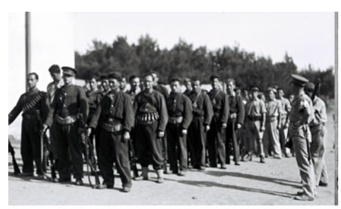
Special Night Squads

Protesting British administration and ongoing Jewish immigration, Palestinians revolted and resorted to armed conflict during the second half of the 1930s. 213 In an attempt in July 1937 to calm Palestinian unrest, the Palestine Royal Commission in Britain (also known as the Peel Commission) proposed the division of the British Mandate into a Jewish state, an Arab state, and Britishcontrolled enclaves, including Jerusalem. The proposal called for the forcible transfer of populations to ensure that the states were divided strictly along ethno-religious