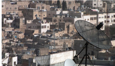
Hebron

Sectarian violence has long been a common occurrence in Hebron. In August and September 2010, Hamas killed four Jewish settlers in the city administered by the Palestinian Authority. 46 The Syrian-based Abu Musa group attacked Jewish settlers near Hebron in September 2010.<sup>47</sup>