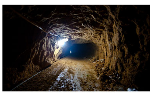
Border tunnel

After the 1948 Arab-Israeli War, Egypt gained control of the Gaza Strip and administered the territory until the 1967 Six-Day War with Israel. Under the terms concluding that regional conflict in which Syria and Jordan also lost territory, Israel occupied the Gaza Strip and the Sinai Peninsula up to the Suez Canal. The Suez Canal, completed in 1869, is an important shipping lane connecting Africa and Asia through 100 miles of Egyptian desert. Egypt regained control of the canal in 1974 through negotiations with Israel brokered by U.S.