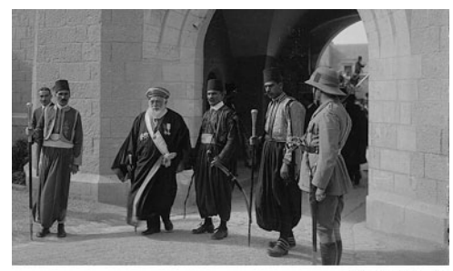
Public Domain Chief Rabbi during Mandate

The First Palestinian National Congress met in Jerusalem during early 1919. The delegates sent correspondence to the Paris Peace Conference firmly rejecting the Balfour Declaration and demanding full independence for Palestine, which they considered part of Syria. 206 Despite this appeal to the Wilsonian principle of selfdetermination, the demand was unmet.