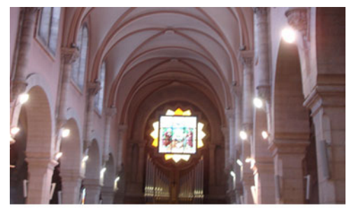
Church of the Nativity

Christianity grew out of the teachings of Jesus, who followers believe was the son of god and the savior of humankind. Its holy texts are the Old Testament and the New Testament, with the latter held to relate the prophetic fulfillment of the former. Many Christians believe the New Testament is the final and complete revelation from their deity to humanity. They further believe that Jesus died on a cross to save humanity from its sins. On other doctrines and theology, the various branches of the faith differ, often quite drastically. 348, 349