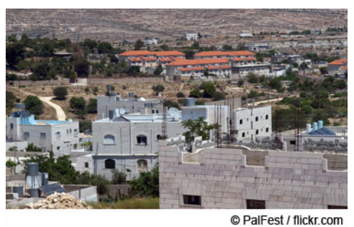
Qiryat Arba settlement

Islamic and Palestinian terrorist groups are not the only such organizations operating in the region. Loosely organized Jewish militant groups also have been responsible for terrorist attacks. Perhaps the most notorious group is Kahane Chai. It was formed in the early 1990s, with roots in the Kach Party, an ultranationalist Zionist political party in Israel. Popular among the Jewish settler communities, the group was believed to have carried out a number of attacks on Palestinian civilians. The group is known to have