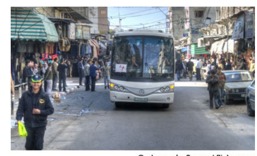
Gaza City

This city serves as the administrative center for the de facto Hamas government that currently controls the Gaza Strip. Located on an important trading route connecting Egypt with Palestine and points beyond, Gaza has a long history as a crucial port. Control of the city has changed hands among the various empires of the ages including the Egyptians, Assyrians, Babylonians, Greeks, Romans, Byzantines, Arabs, and Israelis. The city fell to the Ottomans in 1517. Still, its proximity to Egypt provided close cultural ties, and the city and surrounding area