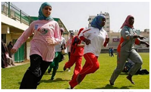
Soccer in Gaza

Since 1996, the Palestinian Territories have officially competed in the Summer Olympics. Although competitions between Palestinian and Israeli teams have been strained since Palestinian terrorists massacred Israeli athletes during the 1972 Olympic Games in Munich, today Israel trains Palestinian