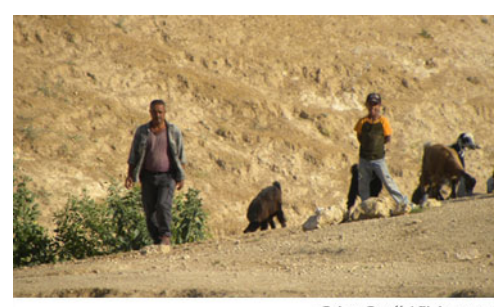
Palestinian shepherds

Agriculture, once the backbone of the Palestinian economy, accounts today for about 4% of gross domestic product (GDP) and employs about 16% of the workforce in the West Bank and 5% in the Gaza Strip. <sup>296</sup> The loss of territory in the 1948 Arab-Israeli War, along with Israeli-imposed restrictions on water usage and access to markets, have contributed to agriculture's decline. About 17% of the land in the West Bank and 29% of the land in the Gaza Strip are suited to growing crops. Major agricultural products include beef,