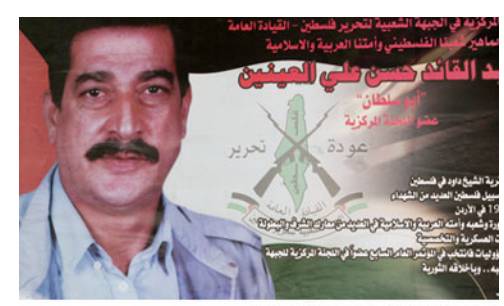
PFLP-GC poster

Also known as the Jihad Jibril Brigades, this group formed in 1968 when Ahmed Jibril rejected the PFLP's more moderate position on negotiating with Israel. The Syrian-based organization operates primarily out of Lebanon and is active in the refugee camps there. The group espouses a Pan-Arabist, nationalist, left-wing ideology. It has been active in Libya and Egypt, and conducted attacks in Scandinavia and Germany. The PFLP-GC pursues training with other groups and is thought to have received flight training from Libya