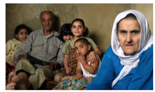
Refugees in Lebanon

Lebanon is home to about 500,000 Palestinian refugees and hosts a dozen UN-administered refugee camps. 434 The country also is the base of operations for numerous Palestinian and international terrorist organizations. These groups played a significant role in the 1975– 1990 Lebanese civil war and have subsequently clashed with the Lebanese government on occasion. 435