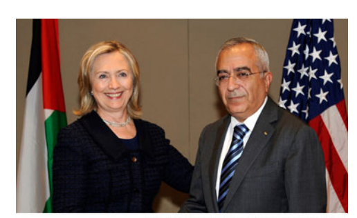
PM Fayyad and Sec. Clinton

The security situation in the Palestinian Territories is unlikely to improve significantly in the immediate future. Although talks between the Palestinian Authority and Hamas in late 2011 seemed to have paved the way for elections in 2012, indications at the time of this writing are that the elections will be delayed, perhaps indefinitely. This could easily ruin the developing reconciliation movement between the two Palestinian factions, leaving the two territories under rival governments. If so, the Palestinian economy will continue to flounder.