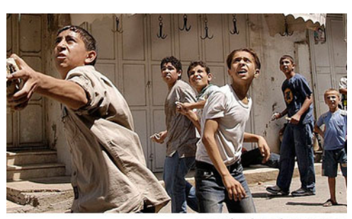
Palestinian unrest

The security situation in the Palestinian Territories is one of the world's most unstable.. The terrorist organization Hamas serves as the de facto government of the Gaza Strip. Terrorists associated with Hamas and Fatah are active in the Gaza Strip and the West Bank, launching artillery attacks from within the Territories. Israeli Defense Forces frequently make incursions into the Palestinian Territories, targeting terrorists, demolishing buildings, and causing collateral damage. Fighting among the various Palestinian militants exacerbates the insecurity.