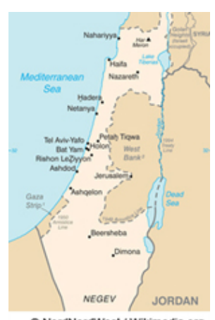
O NordNordWest / Wikimedia.org Map of Palestinian Territories

Today, the two Palestinian territories have significantly different geographic features. The Gaza Strip is a short but strategic stretch of flat coastal plain along the eastern Mediterranean Sea, bordered by Israel to the north and east (51 km, 32 mi) and Egypt to the south (11