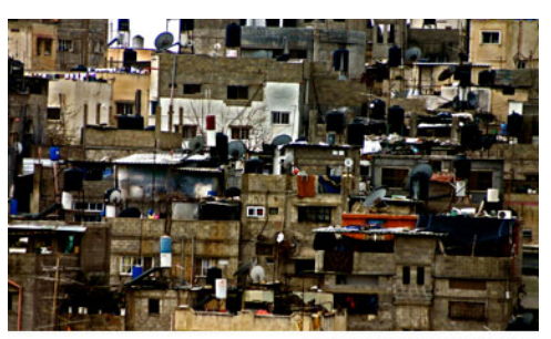
Tulkarm Refugee Camp

Of the 4.2 million residents of the West Bank and the Gaza Strip, almost 2 million live in refugee camps within the Palestinian Territories (about 771,000 in the West Bank; more than 1 million in the Gaza Strip). 78, 79 The United Nations established almost all the 27 refugee camps during and following the 1948 Arab-Israeli War. Today most of the facilities continue to be administered by the UN Relief and Works Agency for Palestine Refugees (UNRWA), which has become the largest UN agency.80