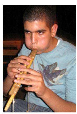
Palestinian flute

Another clarinet, the arghul , is a single-reed instrument with double pipes of unequal length. The shabbaba is a reed flute with five or six holes. It is historically associated with shepherds and folk music but, like other woodwinds, has been used in contemporary music. The darbukah , shaped like a goblet, is a small hand drum common throughout North Africa and Western Asia. Along with the daff , a singled-headed drum also common in much of the Islamic world, the darbukah supplies a dynamic and energetic beat for Palestinian music. Holes with the darbukah supplies a dynamic and energetic beat for Palestinian music.