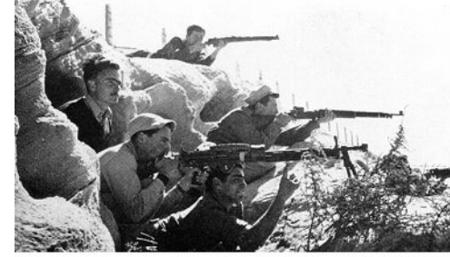
Haganah fighters

immigration to Palestine resumed, as many European Jews who had witnessed the Holocaust turned to Zionism. 223 The British administrators cracked down on Jewish militants and accused Zionist leaders around the world of cooperating with terrorist groups in Palestine, naming the Haganah among these groups. This marked a continued deterioration of relations between British authorities and the Zionist movement. 224