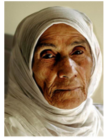
Elderly woman

Palestinian cuisine has many features in common with the cuisines of Syria and Lebanon, but historic influences from Egypt and Europe make Palestinian recipes unique.