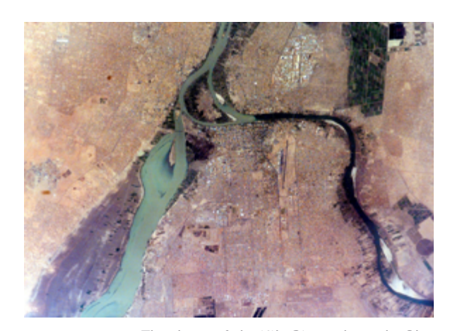
The shape of the Nile River where the Blue and the White Nile Rivers meet

The Nile River valley begins just north of Khartoum, where the White Nile and the Blue Nile meet. The last tributary of the Nile, the Atbara, enters just before the river meanders through the Nubian Desert. The Great Bend—located in northern Sudan—is a curve in the Nile that follows a southwestern course for 300 km (186 mi) before flowing north toward Egypt.<sup>9,</sup> <sup>10</sup> Eventually the Nile empties into the Mediterranean Sea, where it flows into several channels along the valley.<sup>11</sup>