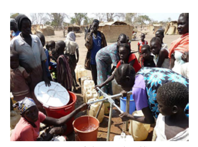
Sudanese at the public water pump

The United Nations has identified Sudan as one of the least democratic countries of the world and as one of the most extreme