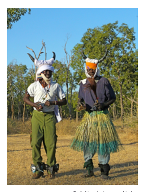
Spiritual dance, Nuba

The rugged granite slopes of the Nuba Mountains lie in the Kordofan region of central Sudan.<sup>31</sup> The Nuba Mountains are home to the isolated Nuba people (who are not related to the Nubian people farther north on the border with Egypt).<sup>32</sup> Many non-Nubian Sudanese withdrew to the narrow valleys of the Nuba Mountains seeking refuge from the civil war, persecution, and the Arabization imposed by the central government. Nuba clan members, who may be Muslim, animist, or Christian, speak over 100 different dialects.<sup>33</sup> Their small villages have access to water year-round, which helps support farming and livestock. Since 1992, when the Khartoum government began to pursue a program of eradication of the Nuba people, the Nuba have remained largely disenfranchised.<sup>34, 35</sup>