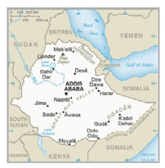
Map of Ethiopia

Ethiopia, where the Blue Nile originates, has been a source of support for the Sudan People's Liberation Movement/Army (SPLM/A) in retaliation for Sudan's historical backing of anti-Ethiopian groups and Islamic fundamentalists.<sup>60, 61, 62</sup> However, in 2016 Ethiopia discontinued support for the SPLM/A.<sup>63</sup> Mutual antagonism toward Eritrea has further strengthened Ethiopian-Sudanese relations; yet disputes over the demarcation of their shared border pose a threat to the relationship.<sup>64</sup>