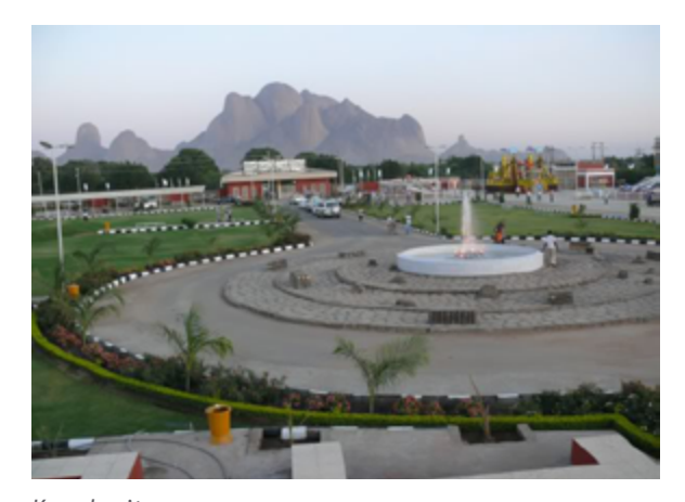
Kassala city

Kassala is situated on the Ethiopian Plateau, with the Taka Mountains providing a picturesque backdrop.<sup>41</sup> The Kassala and Mokram mountains, east and south of the city, help create a cooler climate for this town of nearly 300,000 people.<sup>42</sup> The indigenous population is a mix of tribes, including the Nubians, Beja, Rashaida, Hausa, and Fulani.<sup>43</sup> The city, once a major hub for trading cotton, is now the main market for fruit, which abound in the city.<sup>44</sup>