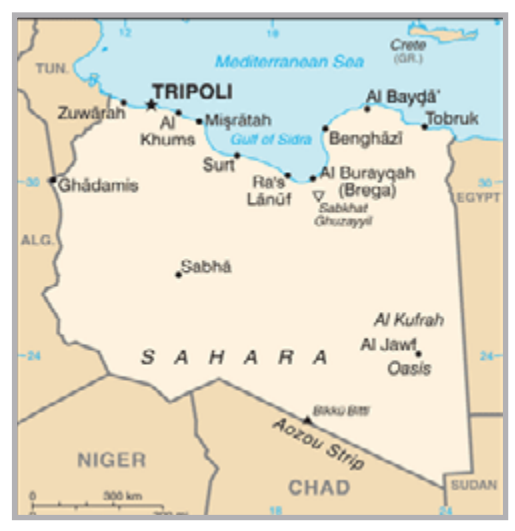
Map of Lybia

Relations between Libya and Sudan began to fall apart in the 1970s.<sup>39</sup> The presidents of both countries, al-Nimeiri in Sudan and Muammar Qaddafi in Libya, staged "bloodless revolts" against colonial governments. Both were leaders in the Free Officers movements that had trained in Egypt at one time or another.<sup>40, 41</sup> However, the two men never established a close rapport. During the early 1980s, cross-border raids from Libya into Sudan occurred in response to Sudan's role in supporting counterrevolutionary forces in Libya. Libya alleged that transmitters in the northwest of Sudan were used to broadcast anti-Qaddafi propaganda into Libya. After