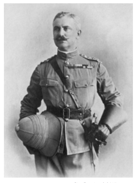
Sir Reginald Wingate Governor-General of the Sudan Wikimedia Common

In 1911, the British launched the Gezira Scheme, an irrigation project between the two Niles. With the 1925 completion of Sennar Dam, the Gezira Scheme was enlarged, and cotton became the mainstay of the Sudanese economy. At the same time, Egypt declared independence and the British retained Sudan. 18, 19