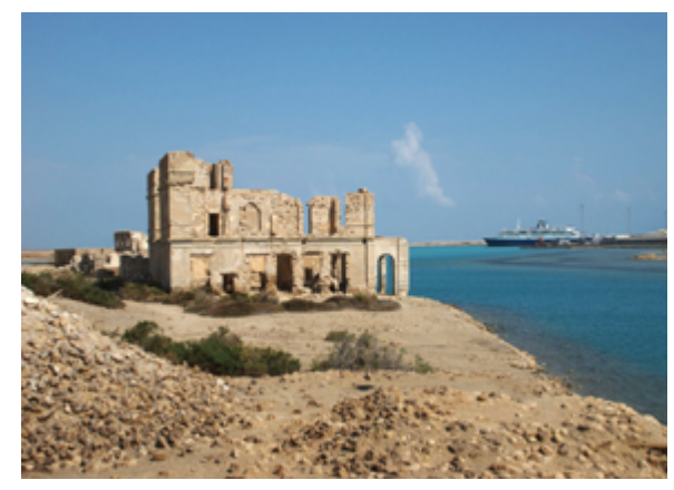
Red Sea coast

to Egypt. The coastal plain ranges in width from 24 km (15 mi) in the north to 56 km (35 mi) in the south.8 The coastal stretch of sea has three depth zones: the shallow reef, less than 50 m (164 ft), the deep shelves, at 500-1,000 m (1,640-3,280 ft), and the central trench at a depth of more than 1,000 m (3,280 ft). The temperatures of the Red Sea are evenly distributed at different depths, ranging from 26.2-30.5 and 23.9-25.9 degrees Celsius.