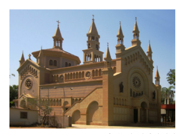
St. Matthew's Cathedral

Christianity has a long history in Sudan and South Sudan, dating back to the Christianization of ancient Nubia during the 2nd century. The Coptic Church gained adherents in the region before the Byzantine era. Many conflicts have erupted among the Muslims in the north and Christian and animist groups in the south. Today, southern Sudan is home to the country's minority Christian population, which includes members of the Roman Catholic and Anglican churches. Christians