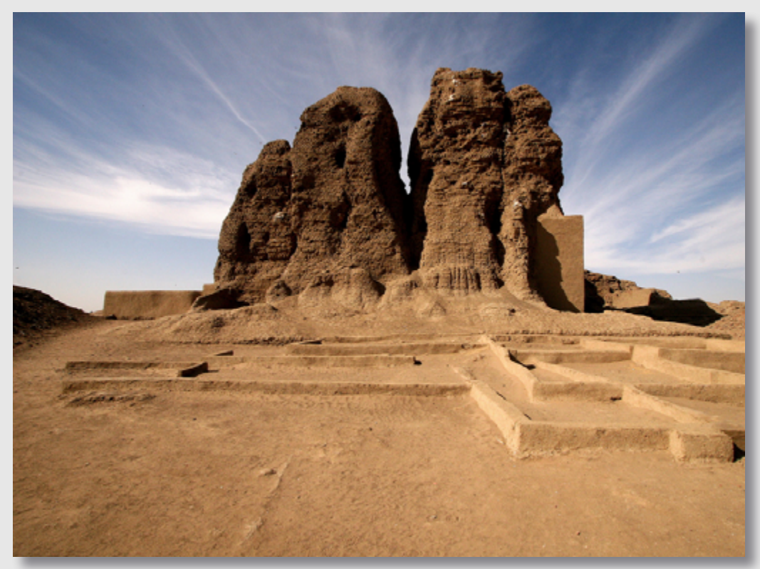
Large mud brick temple, known as the shrek or Western Deffufa, in the ancient city of Kermar