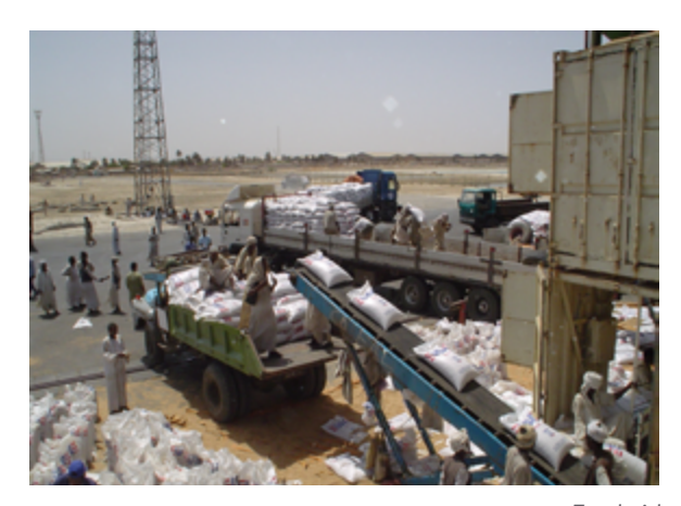
Food aid

Sudan's national debt is the result of failed projects, decades of civil war, and a sporadic economy. Outstanding loans in the 1970s led to a national debt of USD 13 billion by 1990. In 1993, Sudan defaulted on a loan, which prompted the World Bank to deem Sudan unable to borrow from the International Development Association (IDA). The International Monetary Fund has designated Sudan as a Heavily Indebted Poor Country (HIPC). For 10 years, the World Bank suspended development funds