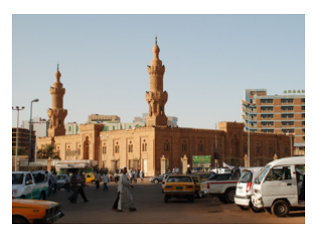
Great mosque in Khartoum city

Founded in 1821, Sudan's capital is located in the center of the country. Throughout the British colonial period, it was an administrative center. The name Khartoum literally means "elephant's trunk" and refers to the shape between the two Niles before they converge. Today, Khartoum has a population of over 6 million and is an urban center that includes North Khartoum and Omdurman, the old city and legislative capital. Khartoum is also the commercial, economic, and administrative center of