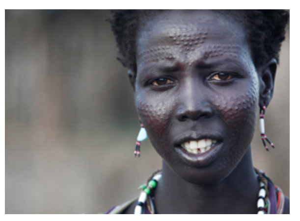
Nuer Tribe women, South Sudan

Nuer tribes make up the second-largest group in South Sudan and are a minority in the southern states of Sudan.<sup>27</sup> Nuer tribes rely on lineage for political order.<sup>28</sup> The Nuer base their livelihood on herding and bartering cattle.<sup>29</sup> In fact, cattle are of such great importance and significance that they form the basis of what amounts to an alternative regional economy. The Nuer farm vegetables and grains.<sup>30</sup>