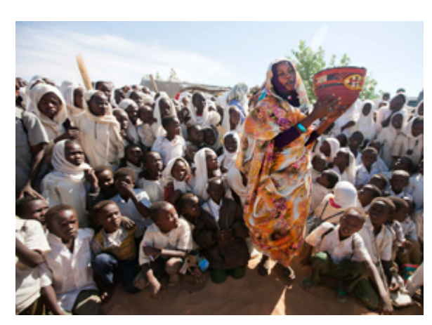
A campaign "Together to Protect Women from Violence", North Darfur

The U.S. State Department rates Sudan as a Tier 2 and 3 country, meaning it does not comply with the minimum standards for eliminating human trafficking, nor is it making an effort to do so. 140 Sudan continues to be a source country, transit state, and destination for men, women, and children trafficked for the purposes of forced labor, domestic servitude, and sexual exploitation. 141 Sudan is also taking children from neighboring countries for military purposes. 142 These child soldiers are forced to cook, clean, and fight for