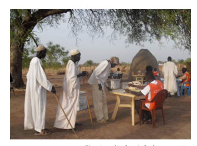
Elections for South Sudan secession

The status of South Kordofan, a Sudanese province that remained part of Sudan after South Sudan's secession, remains a problem. Many of the state's residents are ethnically tied to groups in South Sudan and are loyal to the Sudan People's