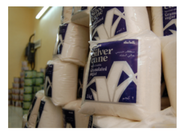
Kenana sugar exported to the rest of Africa and Europe

The Gezira Scheme made it possible for a variety of agricultural products to be grown in Sudan, including sugarcane. How that began in 1962 as a single operation has grown into big business. Today, Sudan has five sugar factories, including one of the largest producers of white sugar in the world, the Kenana Sugar Company (KSC). KSC produces sugar for export and domestic use and uses the waste products to make molasses and tar-like burnable fuel, like ethanol, further increasing the company's commercial viability. 17, 18