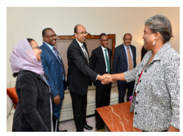
Assistant Secretary of State for African Affairs Linda Thomas-Greenfield greets the Sudanese delegation

Foreign direct investment in Sudan rose sharply in the early 1980s with the discovery of oil and the creation of numerous companies involved in oil exploration and extraction. Two free trade zones, the Suakin Free Zone and the Aljaily Free Zone, were established to attract foreign investors. Following U.S. sanctions and withdrawal of World Bank funding, foreign investment came to a standstill. Although there were plans for a stock exchange in 1962, the Khartoum Stock Exchange did not emerge until 1994, when the country was