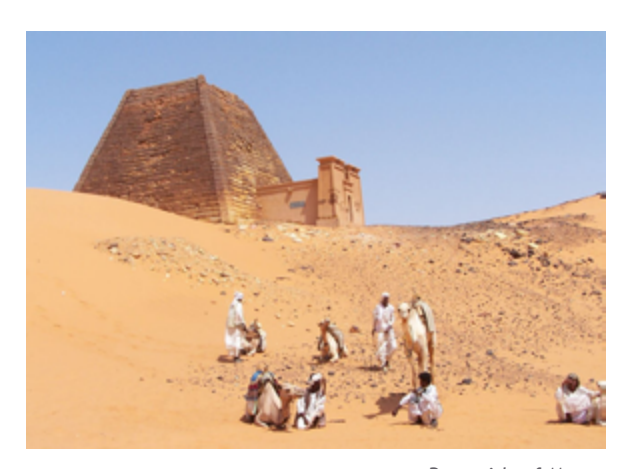
Pyramids of Meroe

Tourism in Sudan has suffered for decades because of instability caused by the civil war. <sup>37</sup> However, since the signing of the peace agreement in 2005, tourism has begun to expand. <sup>38</sup> The country's largest attraction is the Red Sea coast, a major destination for coral reef diving and underwater photography. <sup>39</sup> The Sudanese government established the Sanganeb National Marine Reserve, the first Sudanese reserve on the Red Sea. <sup>40</sup> Divers can descend on coral reefs and observe an