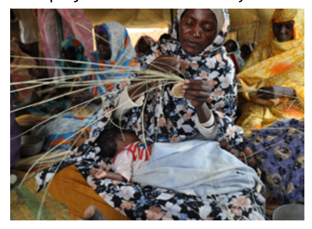
Basket Weaving

infrastructure and shortages in critical areas such as imported components, skilled workers, and energy supplies. Complicating the picture is the fact that most of the proven oil reserves are in the south of the country.<sup>21</sup> With the secession of South Sudan, oil revenues that were previously divided equally between the north and the south no longer support Sudan's economy. This is a source of contention between the two nations.<sup>22</sup>