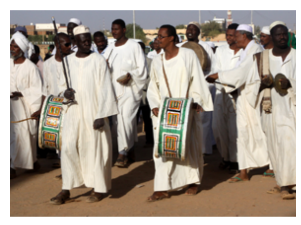
Sufi dervishes in Omdurman

Most Sudanese are Sunni Muslims and adhere to the Five Pillars of Islam:<sup>36</sup> 1) shahada, or the profession of one's faith; 2) salat, or prayer at five specific times each day; 3) zakat, or the giving of alms; 4) sawm, or fasting during the month of Ramadan; and 5) hajj, or the pilgrimage to Mecca. In countries where it is the dominant religion, Sunni Islam has a decentralized leadership and is a large part of the legal, political, and economic systems.<sup>37</sup> Whereas Shi'ites looked for divinely inspired leaders, the