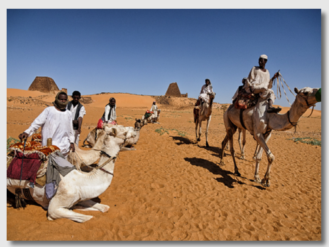
Pyramids of Meroe