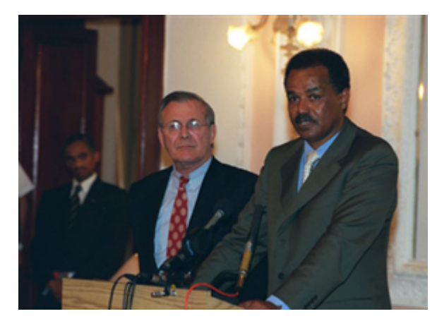
Isaias Afewerki, President of Eritrea

Sudan's relations with its smallest neighbor, Eritrea, continue to be unstable. Since 1993, when Eritrea brought accusations at the UN Security Council that Sudan supported the Eritrean Islamic Jihad Movement, Eritrea has supported the SPLM/A. In 2000, Eritrea and Sudan signed an agreement to reestablish political ties, but those bilateral relations were short-lived. Sudan collaborated with Yemen and Ethiopia to combat terrorism in the Horn of Africa. However,