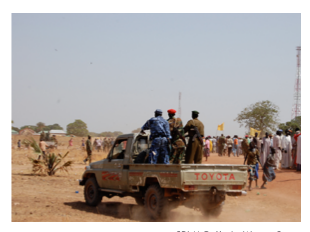
SPLM Rally in Warap State

Some intelligence sources indicate that tens of thousands of African Sudanese are now internally displaced persons (IDPs), or refugees, in Ethiopia. Additionally, some