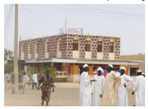
Armed Janjaweed walking through the marketplace, Geneina

Africans in Darfur from sympathizing with those in the South. 125 Many young Sudanese Arabs trained at camps in Libya before joining the militia. 126 Throughout the 1990s, the Janjaweed aided the government in quelling uprisings in the west of Sudan. The Janjaweed also occupied villages and farmland, further exacerbating tensions with the local population. 127 Although the government denies supporting the Janjaweed, it has yet to fulfill any agreement to disarm them. 128, 129, 130