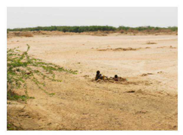
Two very young girls trying to find some water in the dry stream, Telkuk town

of 2001.<sup>50</sup> Nine bird species and two plant species are also on the list. The Sahara oryx no longer exists in the wild.<sup>51</sup> National Park officials have seen the buffalo and elephant populations decrease by 90% and suspect that Janjaweed militias are killing these animals.<sup>52</sup> Nevertheless, the tiang and white-eared kob antelopes, numbering at least one million, still live throughout the savanna region. Their movements constitute one of the largest migrations of animals in the world.<sup>53</sup>