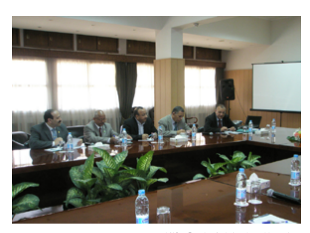
Nile Basin Initiative Meeting

Water security concerns have significantly defined Sudanese-Egyptian relations. 146 Because Sudan has the ability to restrict the flow of the Nile, which would be devastating to Egyptian agriculture and commerce, the Egyptian government has assisted Sudan in building canal projects aimed at increasing water flow to the White Nile by draining the swamps of southern Sudan and South Sudan. 147 Some reports indicate that while Egyptian leaders have offered such incentives, they have