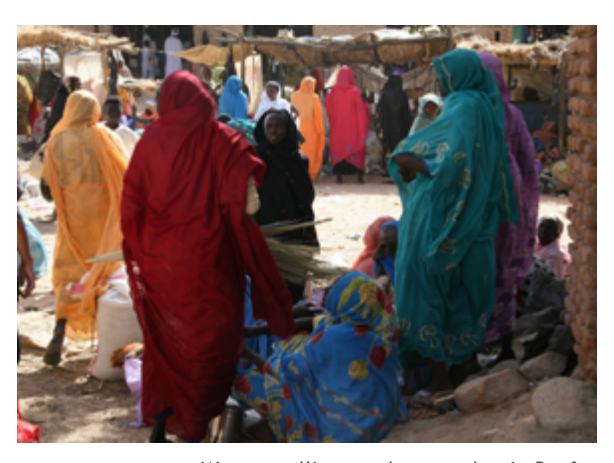
Women selling goods at market in Darfur

In this Muslim majority country, people's lives are determined by Islamic customs.<sup>71</sup> Women face job discrimination in Khartoum, even though such discrimination is constitutionally prohibited.<sup>72</sup> Women who are educated and in the workforce may still need to revert to a traditional role in the home, taking care of the family and children.<sup>73, 74</sup> Although a Muslim man is free to marry a non-Muslim woman, all Muslim brides must marry a Muslim man.<sup>75</sup>