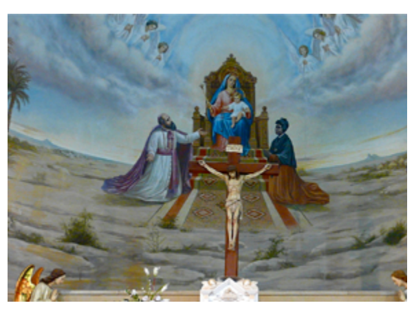
Mural in Cathedral of El Obeid

Although by the fourth century Sudan was surrounded by Coptic Christian nations to the north and to the southeast (Egypt and Ethiopia, respectively), it was not until the sixth century that all of Sudan came under Christian influence. The three states that once made up the Kushite Kingdom of Meroe—Nobatia (Ballanah), Muqurra, and Alwa—fell under Christian influence at different times. According to written accounts, missionaries from the Byzantine Empire brought the gospel to the Kushites