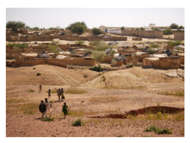
Sudanese refugees camp in Chad

The Darfur crisis began in March 2003 as two rebel groups, the Sudanese Liberation Movement/Army (SLM/A) and the Justice and Equality Movement (JEM), attacked government troops in northern Darfur. These two groups were heavily supported by Darfur's local population. The central government fought back, destroying villages and mosques. With the support of the central government, Arab tribes in Darfur formed the Janjaweed militia. These nomadic Arabs had clashed with the