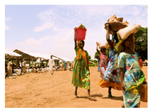
Refugees from Darfur in Sam Ouandja, Northeast of the Central African Republic

Although the length of the border between Sudan and the Central African Republic (CAR) was greatly reduced when South Sudan seceded, the remaining border is still porous and there is considerable movement between the two countries. <sup>56</sup> In May 2002, during clashes over land use, border movement resulted in the death of dozens of Sudanese herders. <sup>57</sup> Sudan maintains the clashes were tribal matters; the CAR claims the Sudanese men were poachers. Nevertheless, the Sudanese government supports the president of the