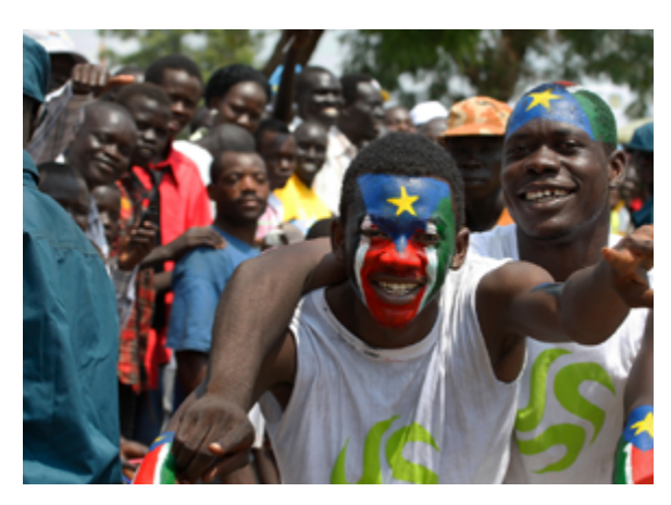
outh Sudan Independence Day celebrations

Of particular interest is Abyei, a special administrative unit, currently held in common between Sudan and South Sudan. Both nations claim the oil-rich area, and a referendum over its future was scheduled for January 2012. However, Sudan has unilaterally postponed the vote, citing ongoing violence in the area. In 2011, Ethiopian peacekeepers deployed to Abyei, but they have not been able to contain the violence.<sup>38, 39</sup>