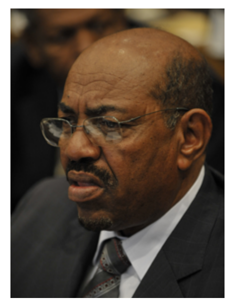
Omar Hassan Ahmad al-Bashir, President of Sudan

The transitional government of the newly named Republic of Sudan was headed by General Suwar al-Dahab. In the elections of 1986, and amid allegations of gross polling fraud, a civilian government under Sadiq al-Mahdi was elected. Nevertheless, government policy toward the Christian minority and the south remained unchanged. Opinions toward non-Muslims polarized, and in a 1989 coup the New Islamic Front of General Omar Hassan al-Bashir came to power.<sup>26</sup>