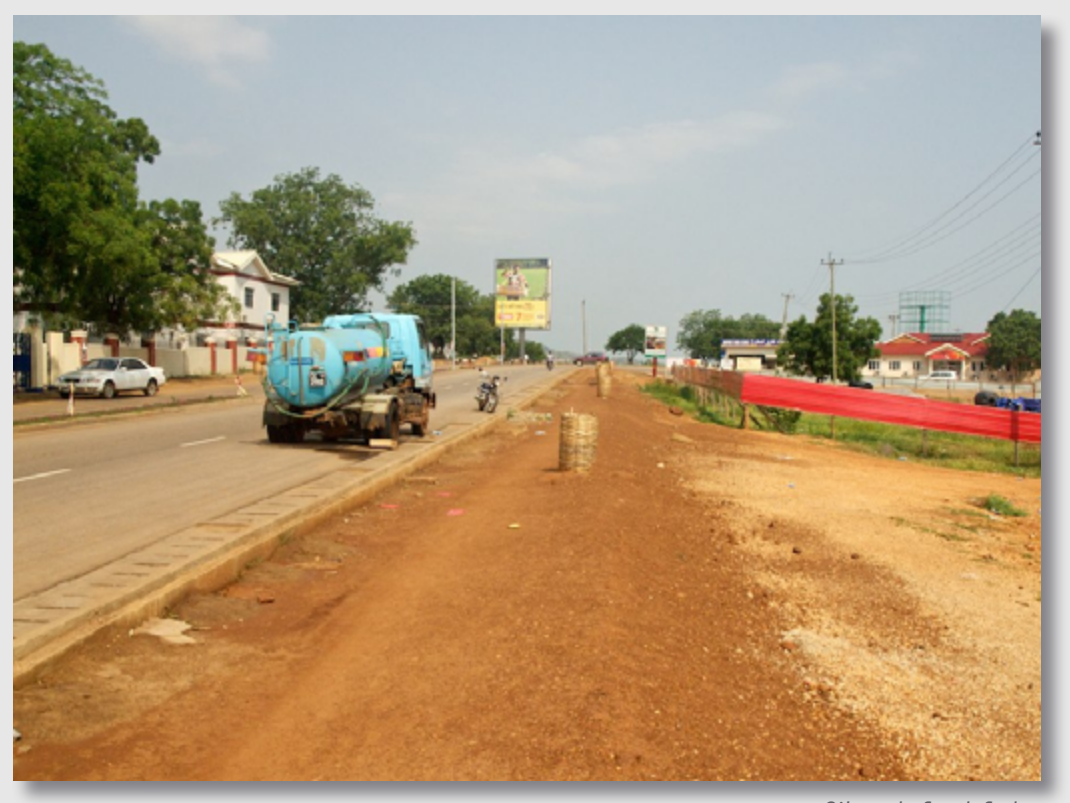
Oil truck, South Sudan