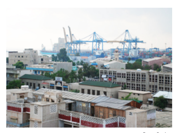
Port Sudan

Since 1906, Sudan's port on the Red Sea has handled the majority of the country's foreign trade. It is the principal seaport of Sudan situated along the Red Sea.<sup>37</sup> Port Sudan is home to an international airport and an oil-refining facility. The city has a population of approximately 410,000 and is known for its beaches and scuba diving.<sup>38, 39</sup> Important nearby sites include Sanganeb National Park which has a living reef, and two archeological sites, the Sesibi and Sedeinga Temples.<sup>40</sup>