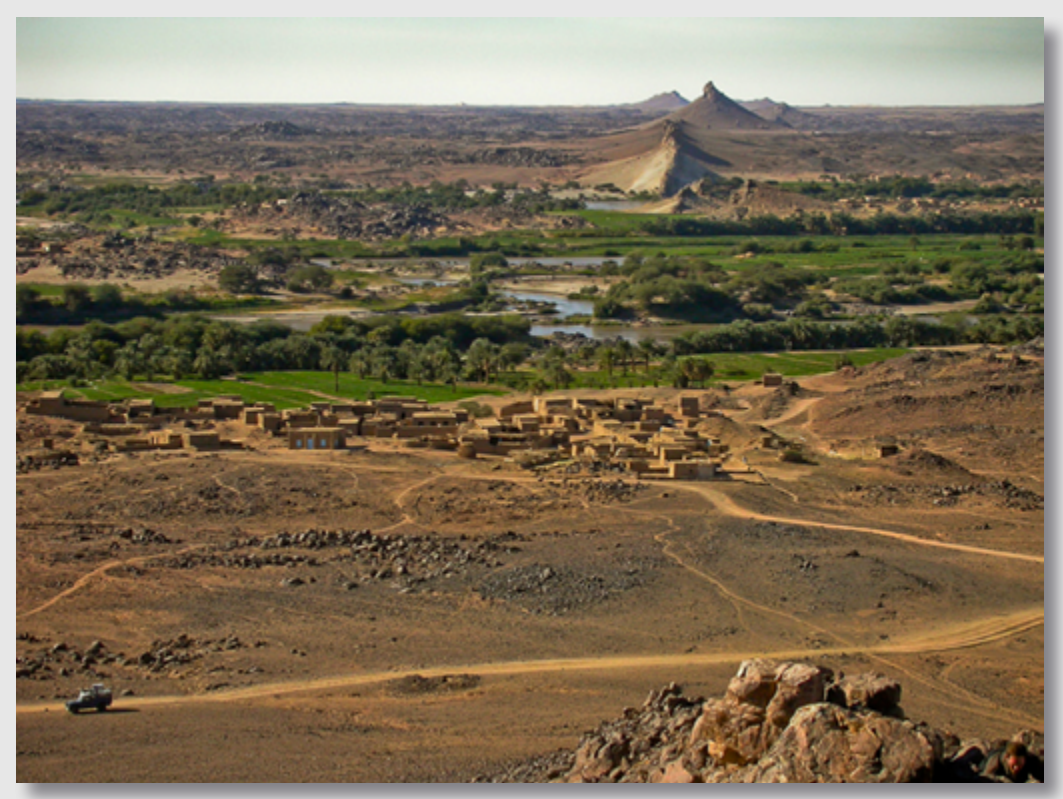
Kirbekan, Northern Sudan