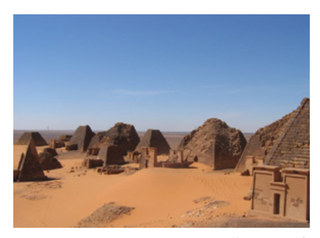
Meroe pyramids

During the sixth century B.C.E., an indigenous Pharaonic dynasty regained control over Egypt and began to move troops south. In 593 B.C.E. Egyptians under Psamtik II invaded the Kush kingdom in Napata.<sup>4</sup> The capital was moved farther south to Meroe during the third century B.C.E. Meroe (a region bounded by the Nile, the Atbara River, and the Blue Nile) was much more fertile than Napata. It was