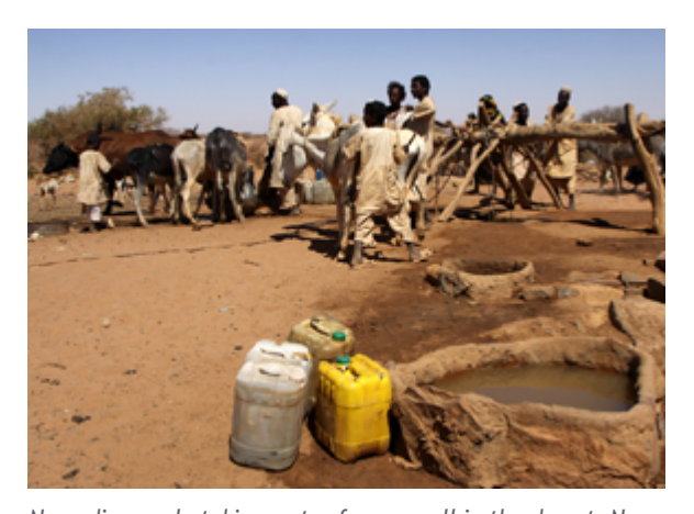
Nomadic people taking water from a well in the desert, Naqa

Sudan's deserts have limited supplies of potable water. Water supplies in many areas are contaminated and are sources for countless diseases as well as breeding sites for malarial mosquitoes. According to United Nations reports, more than one-third of all hospitalizations are caused by waterborne parasites. However, the discovery in 2007 by NASA of what appeared to be the vestiges of a massive underground lake in the Darfur region may present a solution to this problem.