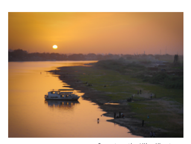
Sunset on the Nile, Khartoum

All bodies of water in Sudan flow into the Nile River. The Blue and White Nile meet at Khartoum and flow northward toward Egypt. The large S-shaped curve known as the Great Bend directs the water northward, then southwest and north again. Tectonic plate movement may have formed the cataracts in the upper portion of the Nile. 19 Originally, there were six classical Nile cataracts between Aswan, Egypt, and Sabaluka (north of Khartoum), all of which prevented boats from navigating the Nile