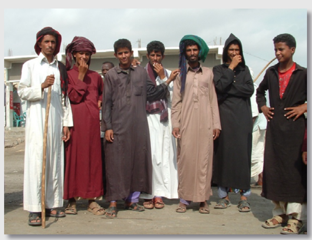
Diversity of Sudanese in Suakin, Eastern Sudan