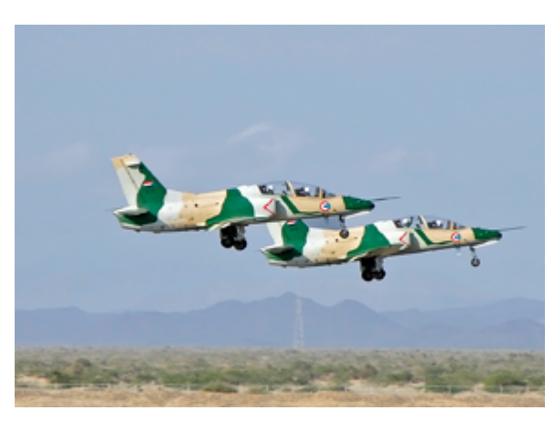
Sudanese Air Force Hongdu JL-8, Port Sudan Airport

Estimates from 2004 place the troop strength of the Sudanese air force at approximately 3,000.<sup>108</sup> Using its oil revenues, Sudan embarked on a significant upgrading of its air force in the late 1990s and early 2000s.<sup>109</sup> The most sophisticated upgrades included Russian MiG-29 multirole fighters and Mi-24/35 attack helicopters; Chinese-made A-5C attack aircraft and K-8 armed trainers; and Belarusian Su-25 attack aircraft.<sup>110</sup>