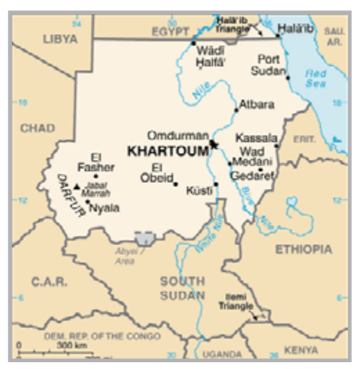
Map of Sudan and neighboring countries

The border between Sudan and Egypt spans 1,276 km (793 mi).<sup>28</sup> On 1 January 1956, Since Sudan gained independence from Egypt in 1956, the relationship between the two countries has