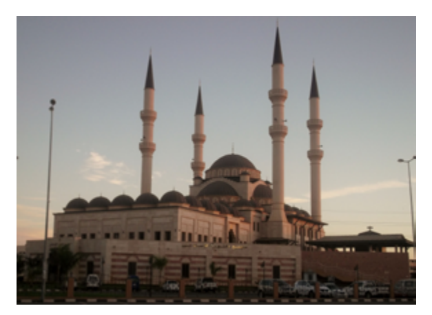
An Nour Islamic compound, Khartoum Bahri

taxes and slaves. For 300 years, the people of northern Sudan dealt with constant terror and the infighting among the kashif themselves.