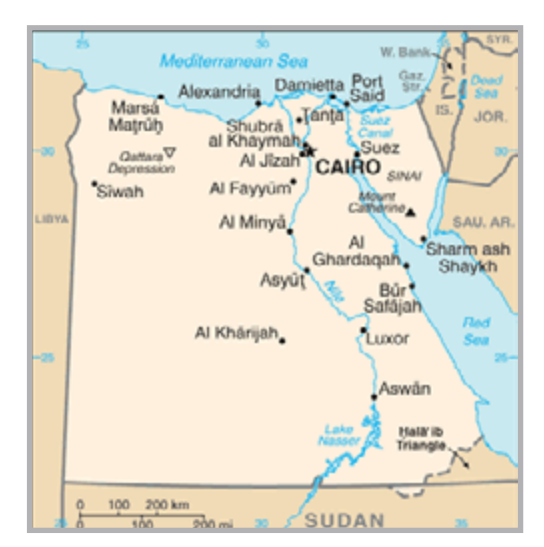
Map of Egypt and the Hala'ib Triangle CIA

A more hotly contested dispute focuses on Egypt's development of the Hala'ib Triangle, a small oil-rich area bordering the Red Sea.<sup>34, 35</sup> Egypt claims the area, according to the 1899 Anglo-Egyptian Treaty, and is developing it economically.<sup>36</sup> Sudan claims that amendments to the treaty in 1902 and 1907 shifted the border farther north. In 1995, skirmishes over this area resulted in deaths on both sides. Sporadic clashes have continued.<sup>37, 38</sup>