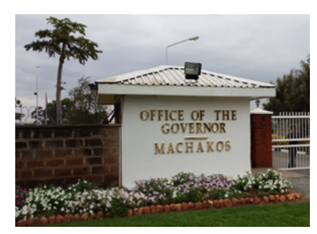
Office of the Governor, Machakos County, Kenya

In July 2002, an end to the civil war that began in 1983 seemed near. The Machakos Protocol was signed in Machakos, Kenya, by both parties. The agreement had been brokered through African and international intervention between the Khartoum government and representatives of John Garang's Sudan People's Liberation Movement/Army (SPLM/A). This document defined the role of state and religion, and the right of the south to self-determination. Throughout 2003 and 2004, the government