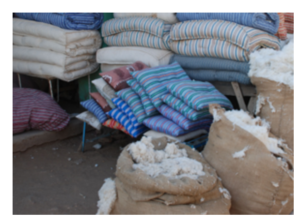
Cotton in Wad Medani market

Although cotton had been grown as a commercial crop in Sudan since 1905, the Gezira scheme and the Sennar Dam helped make it one of Sudan's most significant cash crops.<sup>8</sup> Most cotton is grown on large state-managed farming tracts, with a small percentage grown by private farmers.<sup>9</sup> Cotton makes up a sizeable portion of Sudan's exports; some cotton is used domestically in textile factories.<sup>10</sup>, <sup>11</sup> Currently, Bangladesh, China, Pakistan, and India are the largest importers of