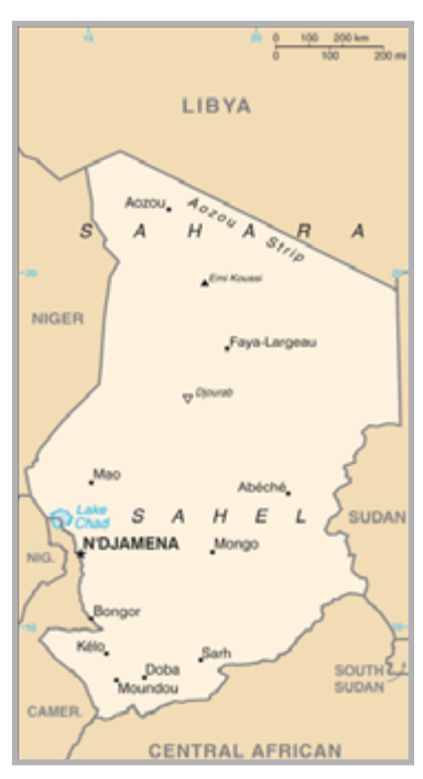
Map of Chad CIA

Further complicating the situation between Chad and Sudan, the violence in Darfur affects tribes with ties to Chad, leading many to seek shelter in Chad, thus bringing the Chadian government into the crisis.<sup>51</sup> Chad's covert and overt support for the Justice and Equality