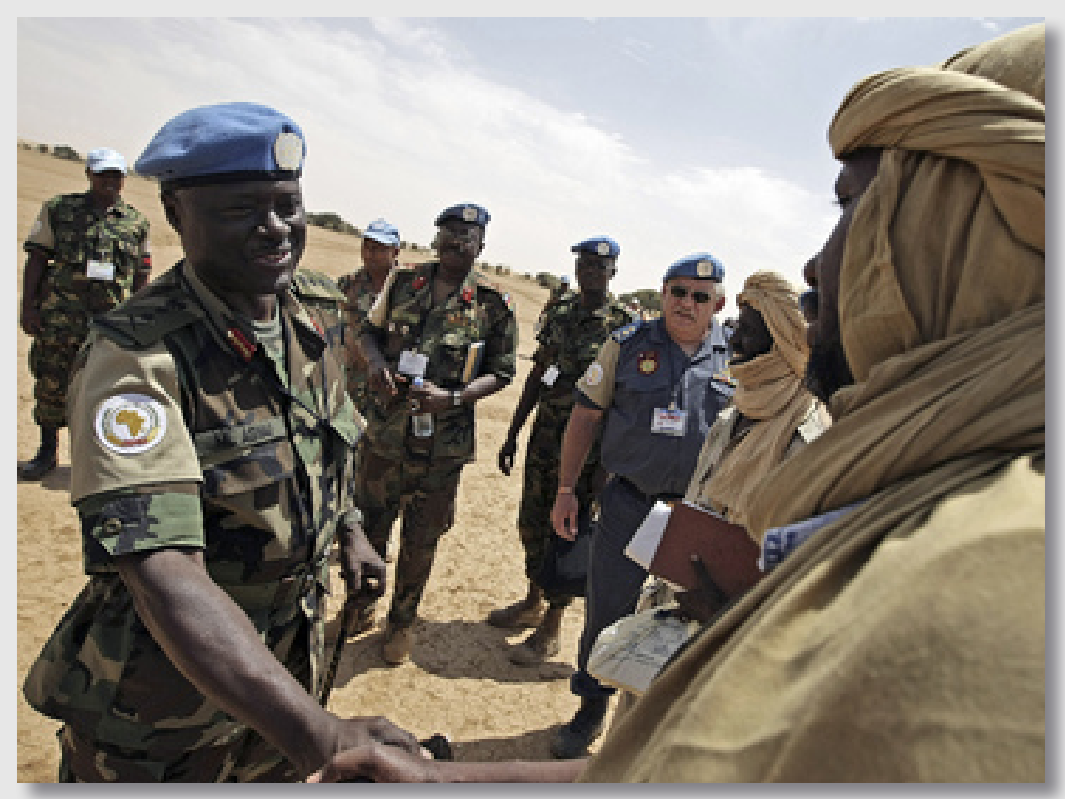
UNAMID shaking hands with SLA commander