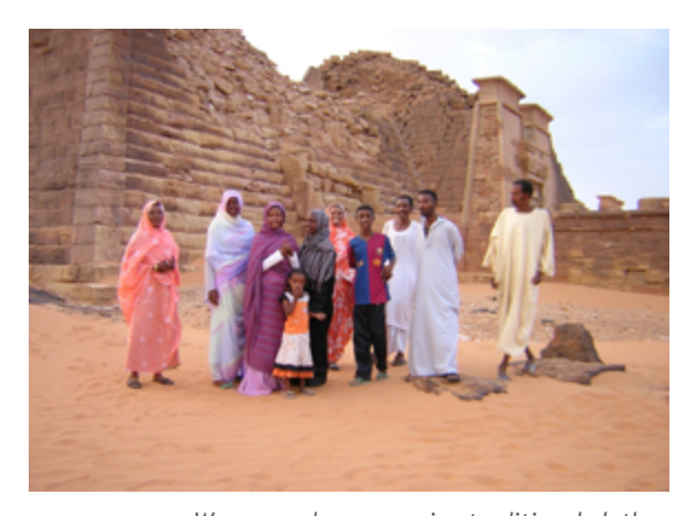
Women and men wearing traditional clothes

Somewhat resembling an Indian sari, the Sudanese tobe is a long piece of fabric wrapped around the body. 66 Women frequently wear this traditional garment over other clothing when they venture out of the home. 67 The tobe is prescribed attire for Sudanese women, dictated by the country's laws. 68 Many men wear a jallabiyah, a long flowing white robe, with a turban or small cap. While the wearing of these customary garments prevails in rural areas, many urban dwellers wear Western clothes. 69, 70