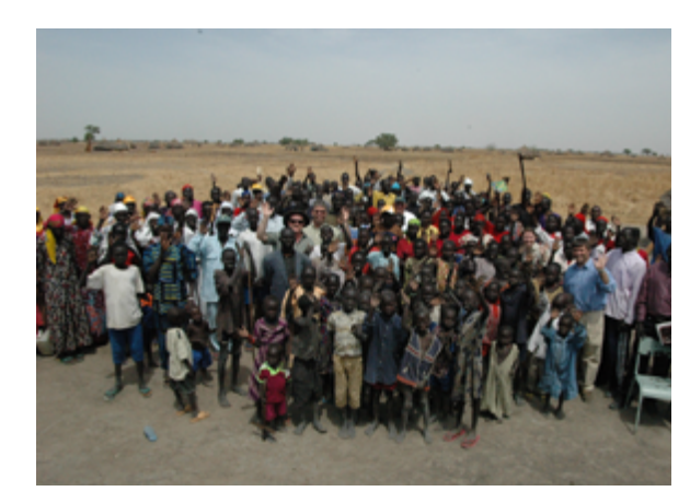
Dinka people

The Dinka tribe is the largest ethnic group in South Sudan.23 The Dinka inhabit much of the disputed areas of South Kordofan, Abvei, and the Blue Nile states. They call themselves the moinjaang, or "people of the people."24 The Dinka have traditionally herded cattle, fished, and farmed in the al-Sudd region. Their way of life remains unchanged, with women tending to the agricultural chores and men taking care of the cattle. Dinka society greatly values honor and dignity. Dinka tribes solve problems by involving all, women included, in public forums. 25, 26