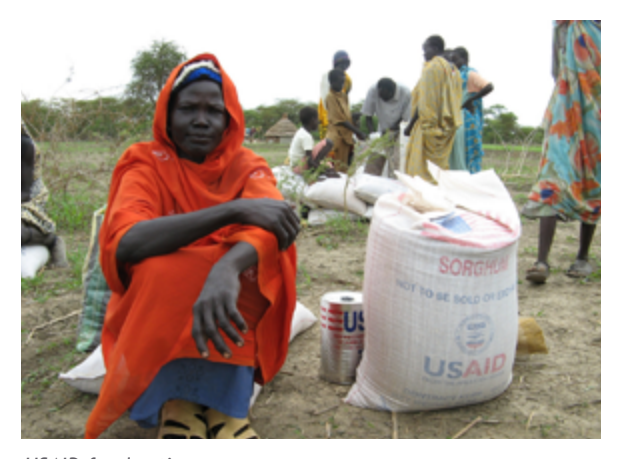
USAID food rations

Relations between Sudan and the United States have long been turbulent. Any improvement will be contingent on resolution of the conflicts in Sudan. Volatile relations between the two countries began in 1967 when Sudan cut ties with the United States over American support for Israel. Ties were briefly strengthened in 1971 when President Jaafar Muhammad al-Nimeiri suspected Soviet support in the attempted overthrow of his government. However, only two years later, in March