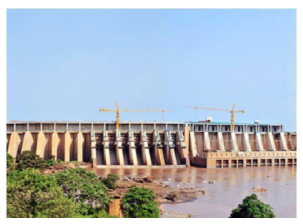
Roseires Dam

sector is being developed exclusively by an international consortium, the Greater Nile Petroleum Operating Company (GNPOC), jointly operated by China, India, Malaysia, and Sudan.<sup>24, 25</sup> However, the secession of South Sudan has significantly complicated development because nearly all the proven oil reserves are in South Sudan and all the oil refineries are in Sudan.<sup>26</sup> These refineries are situated in El Obeid, El Gaily, Khartoum, and Port Sudan, along a 1,400 km (870 mi)-long pipeline.<sup>27</sup>