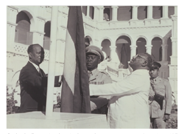
Sudan's flag raised at independence ceremony, Jan. 1st, 1956

When Sudan's independence was established, Arab Muslims occupied most of the influential government posts, although they made up only 39% of the country's total population. The predominantly Christian immediately south was alienated. Two years after independence, Lieutenant General Ibrahim Abboud staged a coup that ushered in a six-year military dictatorship. His emphasis on Arabization of the south further fueled the southern opposition toward the Muslim government