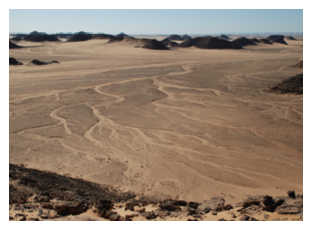
Nubian desert

The Libyan and the Nubian deserts—divided by the narrow but fertile Nile River Valley—cover the north of Sudan. The Libyan Desert is mostly sand dunes and makes up the northeastern part of the Sahara that extends to Libya, Egypt, and Sudan. Mount al-Uwaynat, the highest point of the desert at 1,934 m (6,345 ft), is located where these three countries converge.<sup>4</sup> The Nubian Desert stretches from the Nile to the Red Sea. This sandstone plateau is rocky with few sand dunes and many wadis, or dry