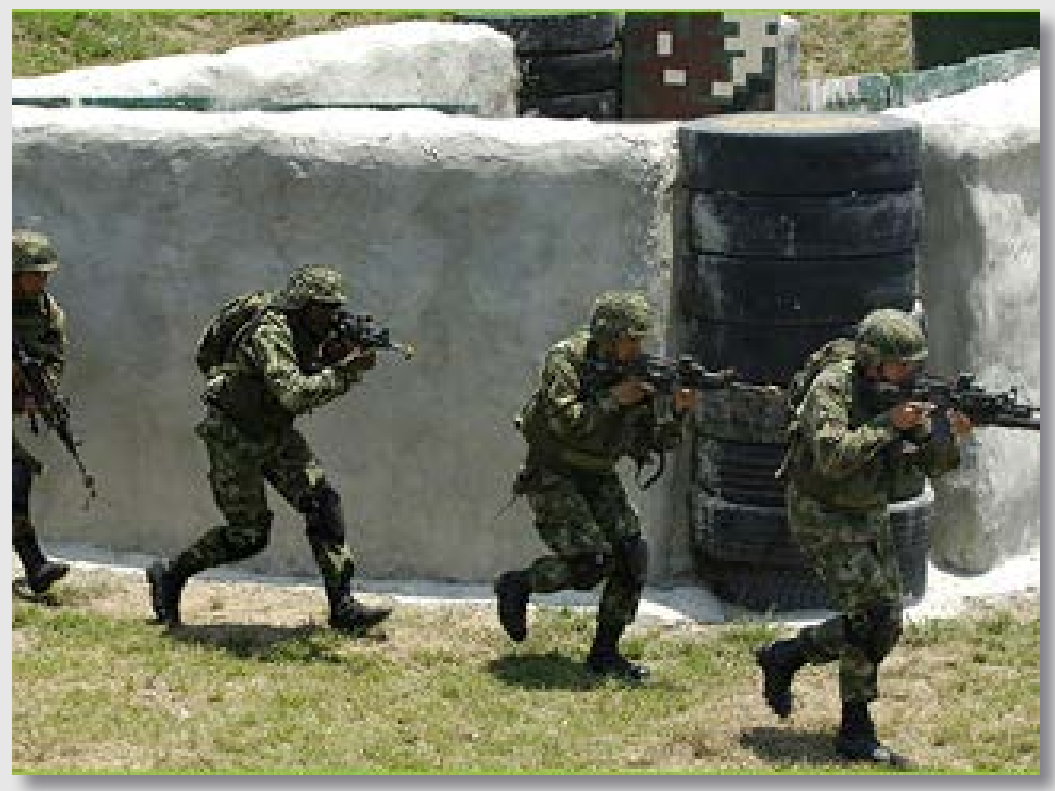
Colombian Special Forces