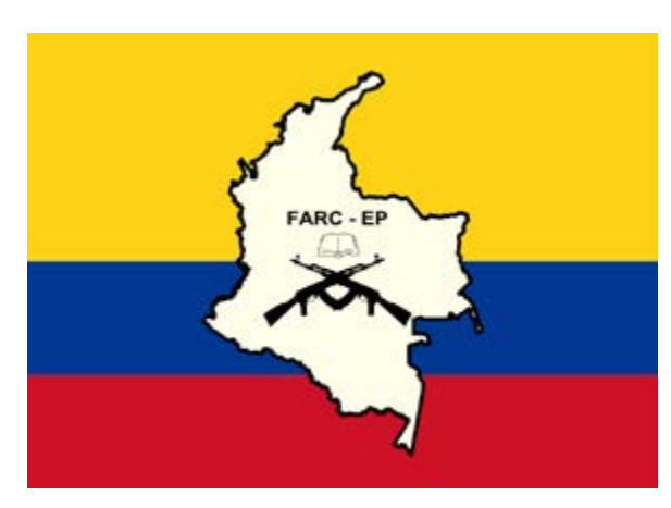
Flag of the FARC-EP, a Colombian guerrilla group

Colombia during the 1980s and 1990s was inundated by a wave of violence and political intimidation that sprang from the activities of increasingly powerful drug cartels. In the mid-1990s, the cocaine cartels operating out of Medellín and Cali were successfully broken up. 120, 121, 122 The drug trade did not, however, completely cease. It continued in a more decentralized fashion frequently embedded into the operations of the remaining guerrilla groups in the country, such as FARC. 123, 124 Colombia's military,