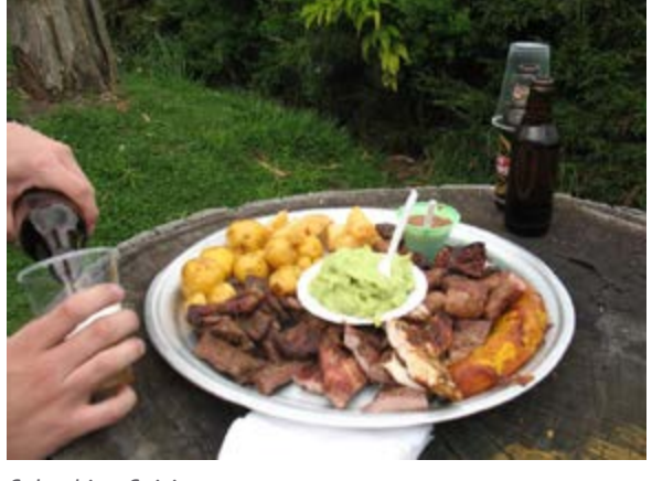
Colombian Cuisine

Colombian food has been heavily influenced by Spanish cuisine but it also bears the hallmarks of its neighbors such as Mexico, Brazil, Argentina and Peru.<sup>34</sup> Present at nearly every meal are starchy vegetables such as potatoes, arracacha (a root vegetable resembling a parsnip), yam, and cassava.<sup>35</sup> Popular meats include beef, chicken, and pork, although fish is often eaten on the coastal areas.<sup>36</sup> Frying is the most common cooking technique.<sup>37</sup>