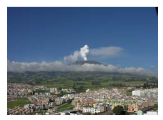
Volcano near Le Galeras, Colombia

Colombia's volcanic peaks are part of the Andean Volcanic Belt, a section of the Ring of Fire that is made up of numerous volcanic mountain chains along the continental margins of the Pacific Ocean. 153 In the Andean Volcanic Belt, the eastward-moving oceanic Nazca plate is pushed beneath the westward-moving continental South American plate. This produces a chain of volcanoes that extend northward all the way to central Colombia. 154, 155