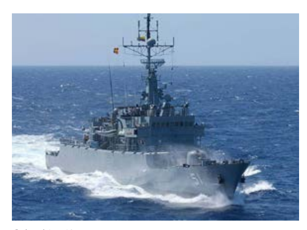
Colombian Navy

Colombia has a small navy numbering 33,800 sailors including 26,600 marines, 200 coastguards, and 100 naval aviators. The navy is under commander of the armed forces and, like the army, divided into several commands serving five naval zones. Both the Colombian Marine Corp and the ARC headquarters are in the capital. The ARC is charged with protecting and defending parts of the Caribbean Sea, the Pacific Ocean, and 35 navigable rivers in the country.