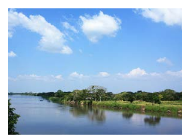
Río Magdalena

Colombia has an extensive network of rivers, of which the economically most important has historically been the Río Magdalena. The Magdalena River originates in the Andes and flows 1,497 km (930 mi) northward between the Cordillera Central and Cordillera Oriental before entering the Caribbean coastal lowlands, where it flows into the sea near the city of Barranquilla. The extensive Magdalena River Basin covers nearly one-fourth of Colombia's land area. 49, 50, 51, 52 The 1,349 km (838 mi)