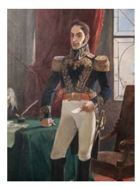
Simon Bolivár

Regional rivalries and infighting over the form of central government soon preoccupied the leaders of the newly autonomous regions. Some favored a loose, provincially oriented federalist system while others argued for