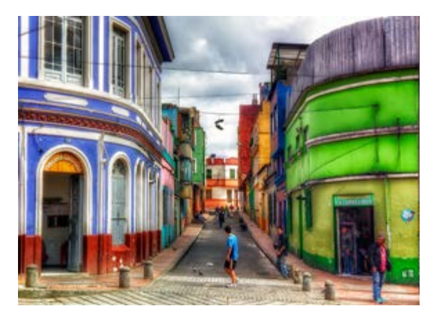
Colorful architecture in Bogotá

Situated in a highland basin of the Cordillera Oriental, Bogotá is one of the highest capital cities in the world. The city was founded as Santa Fé de Bacatá by the Spanish explorer/conquistador Gonzalo Jiménez de Quesada in 1538. The new Spanish settlement was located on the site of Bacatá, the center of the indigenous Muisca culture. Bacatá was soon corrupted to Bogotá. By 1717, Santa Fé de Bogotá had become the capital of the new Spanish Viceroyalty of el Nuevo Reino de Granada ("the New Kingdom of