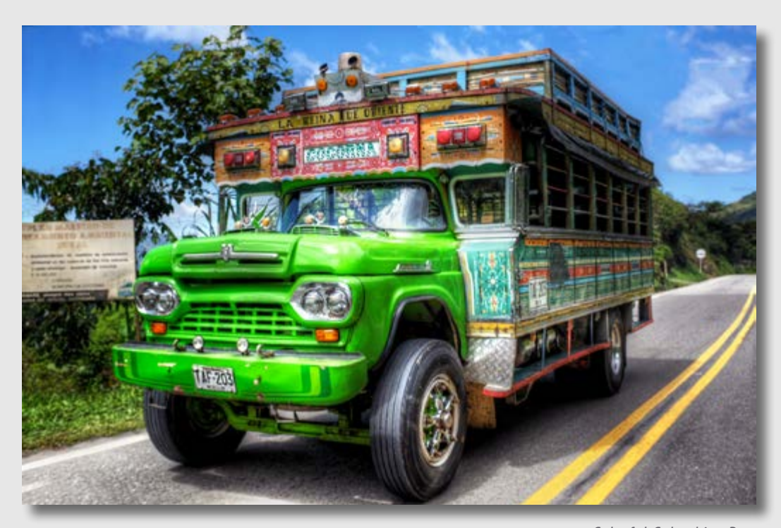
Colorful Colombian Bus