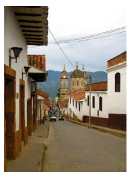
Cordillera Oriental town of Socorro

During the second half of the 18th century, colonists became increasingly dissatisfied with the economic and tax policies in New Granada. Protests erupted eventually culminating in the Comunero Revolt of 1781.50, 51 This spontaneous rebellion began in the small Cordillera Oriental town of Socorro as a reaction against rising tobacco and polling taxes. Ultimately, it spread all the way to Santa Fé de Bogotá, where the rebels presented a list of 35 demands, including greater participation of American-born Spaniards (criollos) in governmental administration and increased protections for the lands of the indigenous people. 52, 53, 54