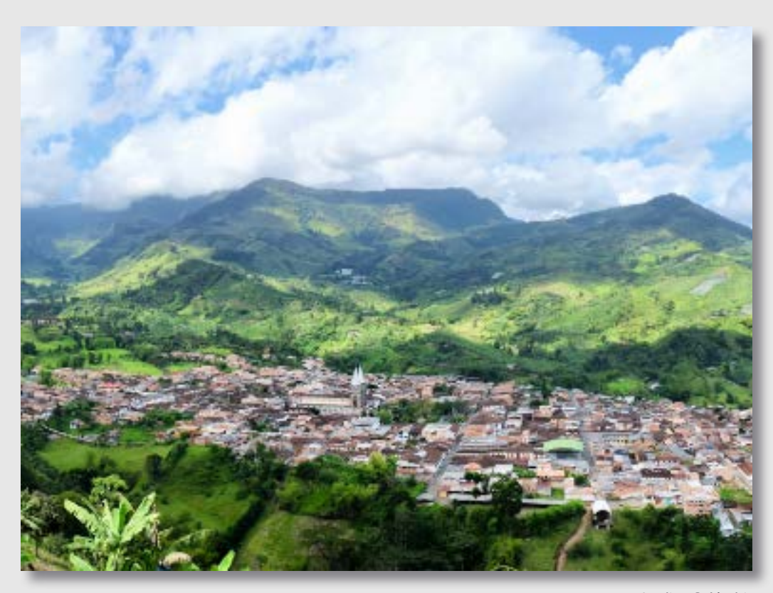
Jardin, Colómbia