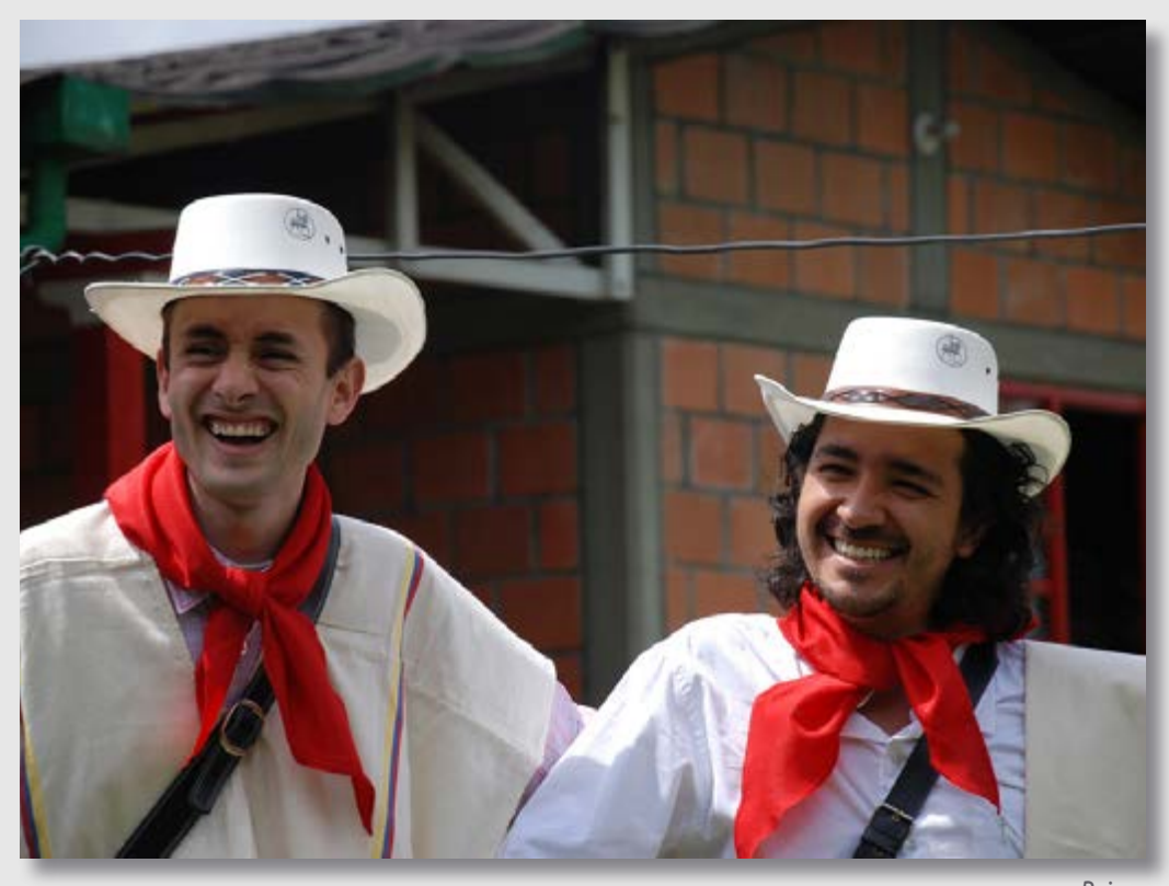
Paisas