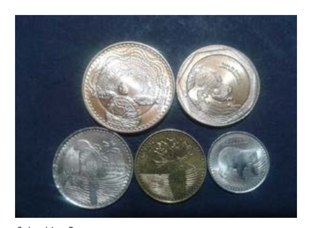
Colombian Pesos

Colombia's unit of currency is the Colombian peso; the official abbreviation is COP. As of late November 2015, USD 1 was equal to roughly COP 3,023.<sup>110</sup> Prior to September 1999, the Colombian peso followed a slowly moving exchange rate band that was pegged to the dollar. The national bank has since allowed the exchange rate to float, to help achieve national economic goals.<sup>111, 112</sup>