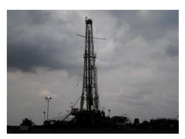
Oil rig

Colombia enjoys a wealth of natural resources, especially in areas related to energy production. Of these, oil is the most mature industry, with the first oil field having been discovered in 1918.<sup>45</sup> Colombia is currently the third-largest producer of oil in South America.<sup>46</sup> Much of the nation's production capacity is concentrated in the foothills of the Andes as well as the eastern jungles of the Amazon. Another main refining center is located in the Los Llanos region.<sup>47</sup> The nation's refining capacity