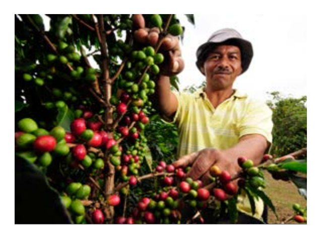
Coffee farm worker

Between 2001 and 2015, Colombia averaged nearly 12% unemployment. The situation is improving but unemployment remains relatively high. In September 2015, Colombia's unemployment rate stood at 9%. 134, 135 Some experts argue that Colombia has the second-highest natural rate of unemployment in South America behind only Argentina. But unemployment varies by group. For example, the unemployment rate for women is generally six points higher than that for men indicating a