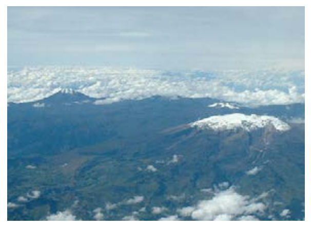
Snow-capped mountains of Colombia

Separating the western and eastern regions of the country are the northern ranges of the Andes Mountains. Within Colombia, the Andes divide into three roughly parallel branches. Moving from west to east, these are the Cordillera Occidental, the Cordillera Central, and the Cordillera Oriental. Steep river valleys divide the three Cordilleras; the Río Cauca lies between the Cordillera Occidental and the Cordillera Central, and the Río Magdalena separates the Cordillera Central from the Cordillera Oriental.