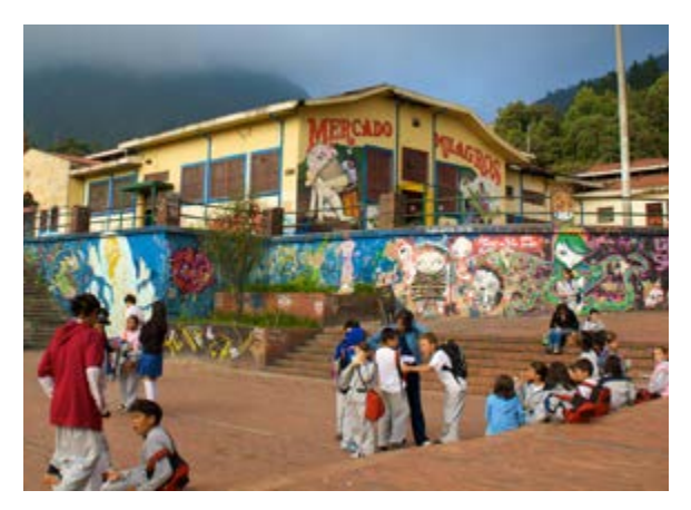
School children in town

Educational levels have risen sharply in a relatively short time (although, as with all such measures, there is a large gap between urban and rural figures). In 1999, for example, 54% of children of secondary school age were actually attending secondary schools, and by 2014 that had increased to roughly 90%. 126