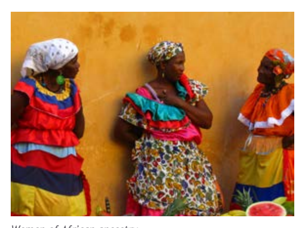
Women of African ancestry

Most Colombians are descended from three broad groups. There are the indigenous tribal peoples ("Amerindians") whose ancestors inhabited Colombia prior to the Spanish conquest. Another group is the white Europeans, most of whom are of Spanish origin. Then there are the black Africans who were brought to Colombia as slaves during the colonial era. As a result of several centuries of intermarriage, roughly three quarters of Colombians have a mixed heritage. It is estimated that 58%