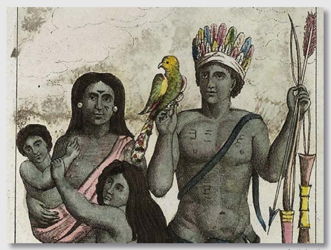
Carib family