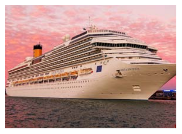
Cruise ship

The widely publicized violence springing from Colombia's guerrilla groups, their paramilitary adversaries, and ruthless drug rings dampened its tourism potential until recently. Colombia has successfully battled its negative international impressions and improved security it the nation resulting in significant growth in tourism. Since 2006, Colombian tourism has increased 87% and averaged about 5.5% growth in the last three years. 93, 94, 95, 96 Tourism receipts directly accounted for 1.7% of Colombia's