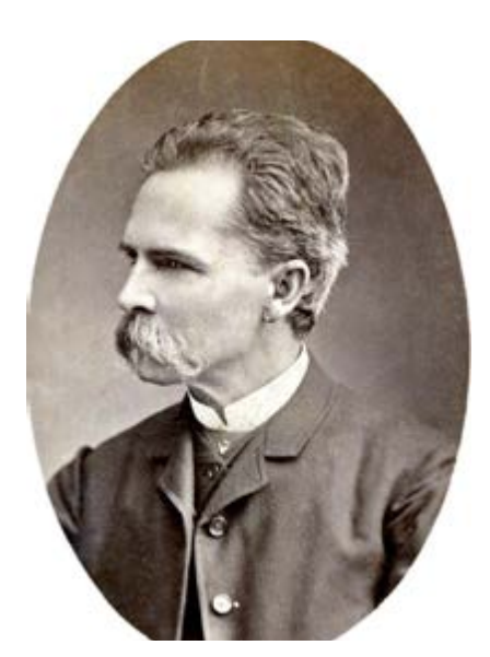
Jorge Isaacs

Isaacs' contemporary, Rafael Pombo (1833-1912), was a poet and diplomat and is frequently referred to as the father of Colombian romanticism, a style popular during the 19th century. 79 Pomboalso was a children's writer, and his whimsical stories and fables are as popular and widely read today as they were during his time. 80