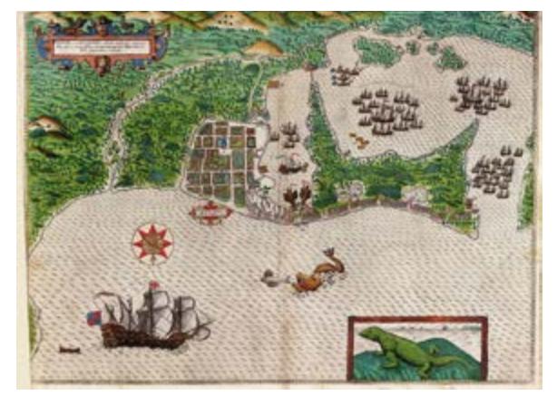
Map of Cartagena, 1585

Colombia's Caribbean coast was dominated during the early colonial period by the port of Cartagena, where gold was the principal export and slaves the most valuable import. After 1650, the Canal del Dique helped provide a cheap all-water route inland from Cartagena to the river ports of the Magdalena, but poor maintenance inhibited the canal's usefulness for long periods of time.<sup>42, 43, 44</sup>