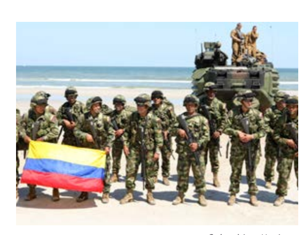
Colombian Marines

Colombia's armed forces number 298,000 personnel divided among the Army (Ejército Nacional), Navy (Armada Nacional), and Air Force (Fuerza Aérea Colombiana). 91 Years of battling rebel groups has helped make Colombia's armed forces one of the most mobile and effective counter-insurgency forces in the world. The armed forces is now working on increasing its effectiveness in conventional warfare, cyber warfare, and organized criminal activities. 92, 93 The armed forces' top military commanders