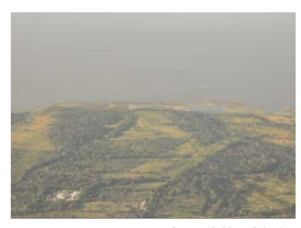
Cocaine fields in Colombia

Colombia's most trying security issues with its neighbors are now with Venezuela and Nicaragua. The decreasing security