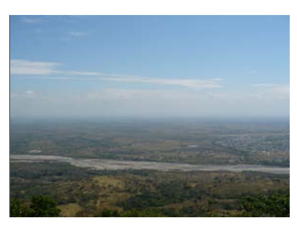
The plains of Colombia

West and north of the Andes ranges, the mountains descend into plains that lie along Colombia's Pacific and Caribbean coasts. The relatively narrow Pacific coastal lowlands receive ample precipitation and support rainforest conditions. The Caribbean coastal lowlands vary in climate and terrain, from rainforest in the southwestern parts to near- desert conditions on the Guajira Peninsula in the far northeast. Both coasts feature mangrove swamps along low-lying tidal areas.<sup>21, 22, 23</sup>