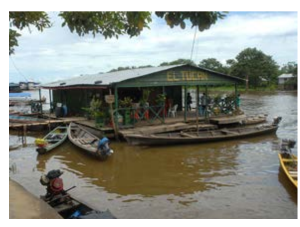
Three-way border: Brazil, Colombia and Peru

Both Peru and Colombia have long faced similar problems with guerilla movements and cocaine trade. In southern Peru, the