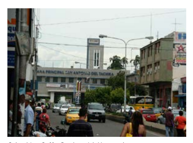
Colombian CoffeeBorder with Venezuela

During the last decade Venezuela and Colombia have had stormy, off-and-on political relations. The long-running guerilla war in Colombia has been a significant contributor to these tensions, as both FARC and ELN, the primary combatants against the Colombian government, have had a strong operational presence in the border region between the two countries. Colombia has long accused Venezuela of supporting these insurgent groups. The border and the same as the guerilla groups, have also operated on both sides of the border.