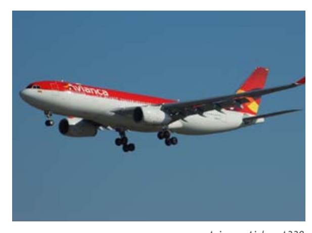
Avianca Airbus A330

Colombia has over 874 km (543 mi) of rail lines but much of the railway system is