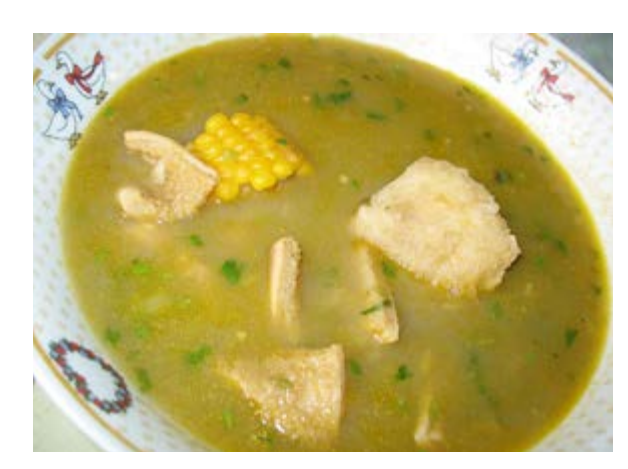
Barranquilla - Sancocho de mondongo

Soups are a popular dish in Colombia.<sup>41</sup> The soup course is often the stew-like sancocho, which mixes meat or fish with large pieces of potatoes, plantains, and/or cassava root, sliced pieces of corn on the cob, and other vegetables.<sup>42, 43</sup> In Bogotá, ajiaco is the traditional soup. It consists of chicken, three types of potatoes (one is the small, yellow Andean potato known as papa criolla), and sliced corn on the cob discs. The soup is distinctively flavored with the herb guascas, which in much of