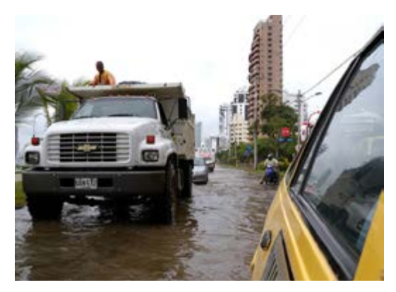
Flooding in Cartagena

Drought is becoming an increasingly severe problem for the nation. Climate change has reportedly contributed to drought, reducing river flow and leaving some reservoirs at 40% capacity. The provinces of La Guajira and Casanare have been particularly hard hit. The most recent drought in Casanare led several reservoirs to dry up and killed over 20,000 animals. <sup>169, 170</sup> In 2014, droughts in La Guajira province triggered riots demanding the government do more to help ease the water shortage. <sup>171</sup>