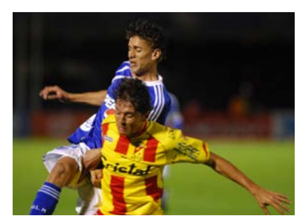
Competition on the soccer field

An increasing number of golf courses in Colombia, as well as the worldwide professional success of Medellín native