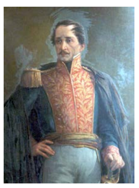
Francisco de Paula Santander

On the other side were supporters of Bolívar, as well as moderate liberals who favored a more moderate stance toward the military and the church. These two groups formed the New Granadan Conservative Party. In the 1836 presidential election, a moderate candidate, José Ignacio Márquez, narrowly defeated Santander's hand-picked successor candidate. General José María Obando. In 1840, an angry Obando staged a rebellion in southern Colombia that spread to most of the populated areas of New Granada and continued until May 1842.81 This so-called "War of the Supremos" helped cement the strong political divisions emerging between the "liberals" and "conservatives."82