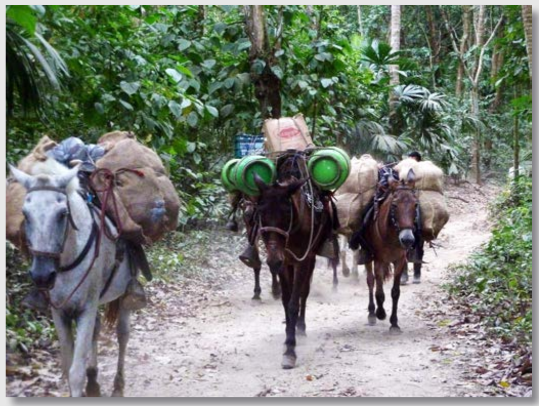
Coffee carrying pack mules