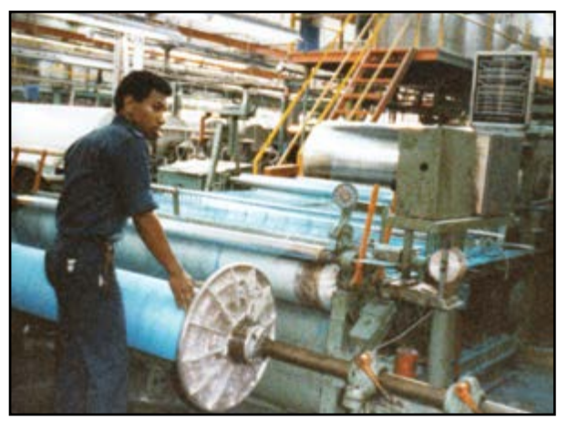
Textile worker in Medellin

In the 1990s, Colombia's economy became more reliant on its manufacturing and industrial sector. Trade barriers were lowered, in part, to expand exports beyond agricultural products—mainly coffee. Today, Colombia's main industries include textiles, food processing, oil, clothing, beverages, chemicals, and cement.<sup>33, 34</sup> Industrial output presently makes up 36% of Colombia's gross domestic product (GDP) and employs about 21% of the population.<sup>35</sup>