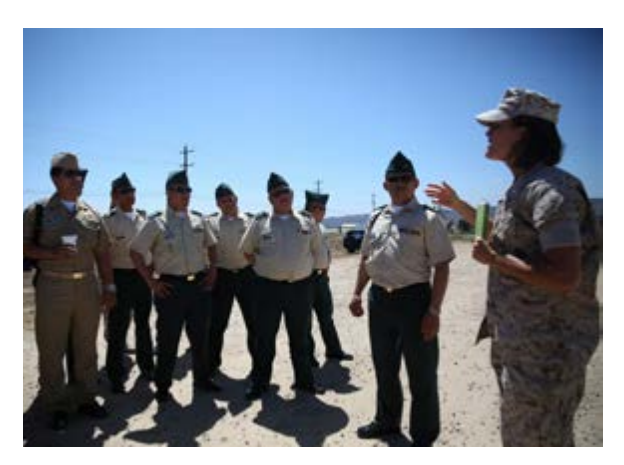
US and Colombian military meet

Colombia is a key U.S. ally and relations with the United States are strong and friendly. The two nations share strong economic, political, and military relations with each other.<sup>17, 18</sup> The two nations have signed agreements on trade, environmental protection, energy, and other issues which have spurred cooperation.<sup>19</sup> The United States is Colombia's major trading partner with the most recent balance of trade favoring the United States.<sup>20, 21</sup> Through September 2015, total trade between the