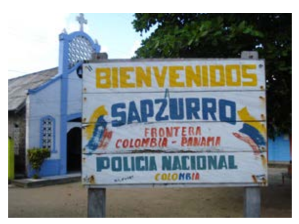
Border with Panama

Historical relations between Panama and Colombia have been good. Relations were strained briefly in October 2014 when Colombia accused Panama of being a "tax-haven" but soon warmed.<sup>45, 46, 47</sup> This tiff underscored the importance of Panama as a business and trading partner. Panama is Colombia's third-largest export destination.<sup>48</sup> In 2013, the two countries signed a free-trade agreement designed to bolster trade.<sup>49</sup>