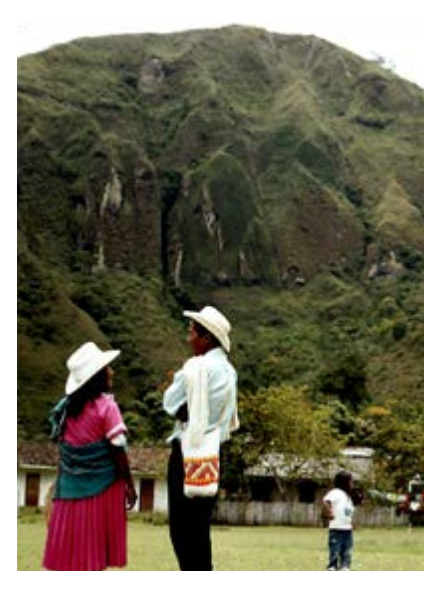
Indigenous Páez people

As many as 180 indigenous languages continue to be spoken in Colombia. Some of these languages are only active among several dozen speakers. <sup>13, 14, 15</sup> The most robust of Colombia's indigenous languages is Wayuu (also known as Wayuunaiki or Guajiro), which is still spoken by over 100,000 people on the Guajira Peninsula. <sup>16</sup> It is one of the few indigenous languages that is increasing in use. <sup>17</sup> Other active native languages with more than