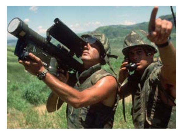
Colombian Army

All Colombians, regardless of sex, between the ages of 18 and 24 are obliged to register and undergo medical examinations to determine their fitness for military