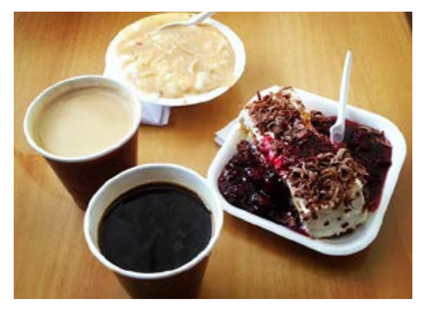
Colombian Coffee

Desserts are quite popular in Colombia. Some of the most popular include brevas con arequipe (figs stuffed with toffee), cocadas (made with shredded coconut and sugar), and torta de tres leches (a three milk cake). 54 Some desserts are associated with particular holidays or special occasions. One such dessert is natilla, a sweet custard-like concoction thickened with cornstarch that is frequently served during Christmas time. 55