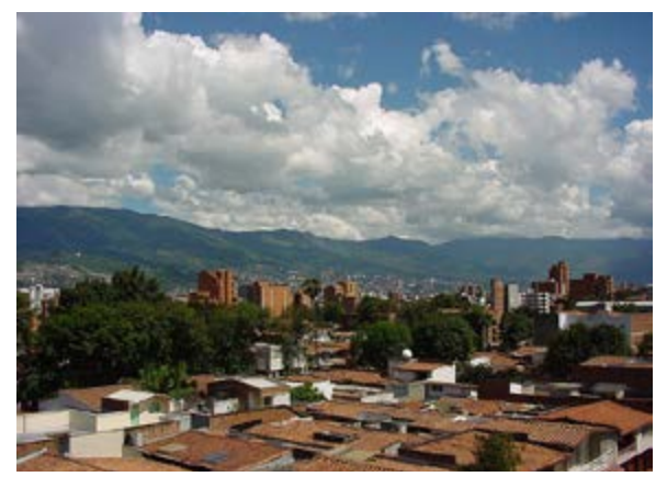
Medellín, Colombia

Medellín sits at an elevation of 1,500 m (5,000 ft) along the Porce River in northwestern Colombia. Founded as a mining town in 1675, for much of its first two centuries the city was a sleepy provincial backwater, serving as the capital of Antioquia Department. 96,97 The city's first major growth spurt came during the late 19th century, when it became a marketing center for the nearby coffee plantations that were emerging as part of a colonization effort. The railroad soon arrived, and then,