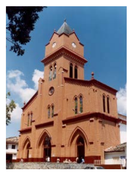
Catholic church

Other religions in Colombia have significantly fewer adherents. Colombia's Jewish population is estimated between 2,500 and 5,000 people, mostly in Bogotá.<sup>25, 26</sup> Animist religions are still practiced in some of the more