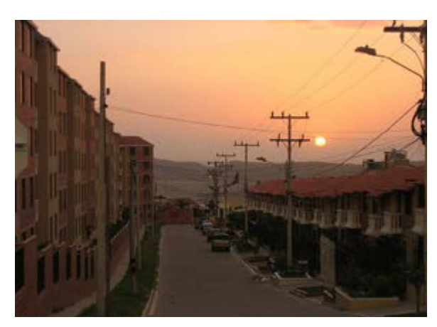
Barranquilla, Colombia

Barranquilla is Colombia's largest coastal city and the nation's leading port on the Caribbean Sea. It lies 15 km upstream from the mouth of the Río Magdalena.<sup>111, 112</sup> For much of the city's early history, its importance as a port was overshadowed by Cartagena, which captured much of the river trade via the Canal del Dique (constructed by the Spanish, beginning in 1650). In the 1890s, a 15-km (9-mi) railway was completed, linking Barranquilla to the ocean pier at Puerto Colombia, the foremost