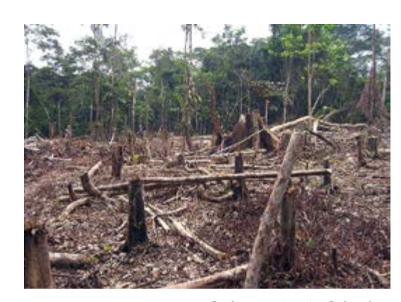
Deforestation in Colombia

Colombia holds one of the world's great depositories of forest lands, containing a vast variety of animal and plant life. Deforestation is an ongoing concern, despite the fact that over half of Colombia's total land area. 132, 133 The government's lack of authority in some of Colombia's most forested regions, where guerrilla and paramilitary groups have concentrated their activities, partially explains why the efforts to define vast protected areas have often failed. 134, 135 Some of the threats to