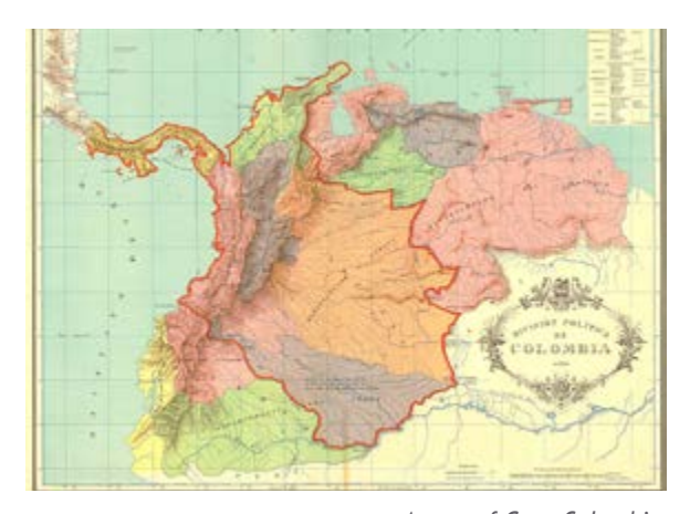
A map of Gran Colombia

Approximately three years later, in 1819, Colombia became part of the Republic of Greater Colombia which also included Ecuador, Panama, and Venezuela. The new nation dissolved within nine years, however, when Ecuador and Venezuela left the alliance. As tensions frayed the region, violence became a matter of course through the 19th century which saw eight civil wars. As the liberals and conservatives jockeyed for power in Colombia, the political instability finally erupted into a