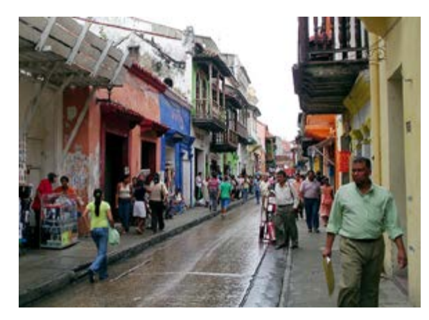
Brief rain shower in Cartagena

Most of Colombia lies within 10° of the equator; thus, seasonal differences in temperature are minimal.<sup>28, 29, 30</sup> Altitude defines the temperature of each region. At an elevation of 2,640 m (8,660 ft), Colombia's capital of Bogotá is located in a tierra fría (cold ground) zone [roughly 1,800 to 3,600 m (5,900 to 11,800 ft)], where the average monthly high temperatures vary only from 18 to 20°C (64 to 68°F) for the entire year. Average monthly low temperatures for Bogotá modestly fluctuate from 9 to 11°C