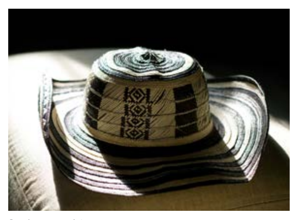
Sombrero vueltiao

Traditional handcrafts thrive in Colombia where approximately one million people make their livelihood in the sector. About 60% of Colombian artisans live in rural areas and 65% are women. <sup>104</sup> Popular crafts include ceramics, wood carving, metal works, baskets, jewelry, and textiles that reflect their cultural traditions. <sup>105</sup> Many of these items continue to be made using techniques that have changed little over the centuries. <sup>106</sup>