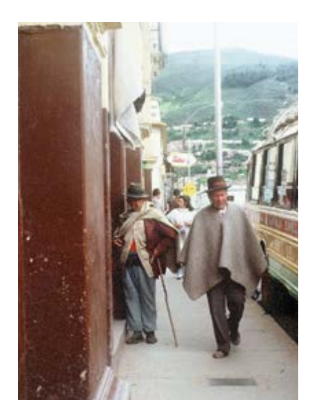
Gentlemen wearing ruanas

Modern Colombians, especially urban dwellers, dress much the same as anywhere else in the Western world. In rural areas, clothing is more likely to be homemade and is often worn in the fields and at home. In these agricultural regions, men's shirts and women's skirts are usually loose-fitting for greater comfort. More elegant versions of peasant clothing are sometimes seen, but usually only during holiday festivals or folklorico events. In cooler areas of the interior highlands, men and women may wear the traditional ruana, a woolen poncho that runs from basic monochromatic peasant style to more colorful versions for middle- and upper-class women. 57, 58