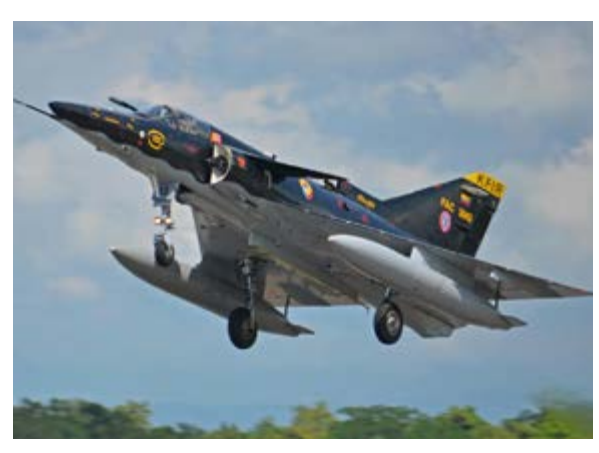
Colombian Air Force

Colombia's air force has a current troop strength of 14,500 and is among the most experienced air force in the region. 121 The air force has two fighter squadrons, three counterinsurgency squadrons, a reconnaissance squadron, and a transport squadron. The main air base is Germán Olano Military Air Base at Palanquero. The other major bases are in Bogotá, Barranquilla, and Cali. 122 The force's primary roles are the defense of national airspace, natural resources, and the provision of air support