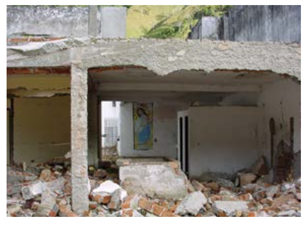
Aftermath of a FARC attack

(Fuerzas Armadas Revolucionarias de Colombia, or FARC)