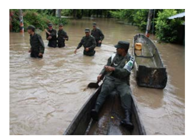
Colombian National Police Flickr / Policía Nacional de los colombianos

Colombia's National Police force (Policia Nacional/PNC) numbered approximately 168,000 officers in 2012. They are heavily militarized and maintain a presence in all of the nation's administrative districts. The PNC exhibits a paramilitary-like organizational structure. The force is armed with light infantry weapons, armored vehicles, helicopters and fixed wing aircraft, and Special Forces. The role of the military and the police is often confused leading to significant rivalries between the two forces. <sup>74,75</sup>