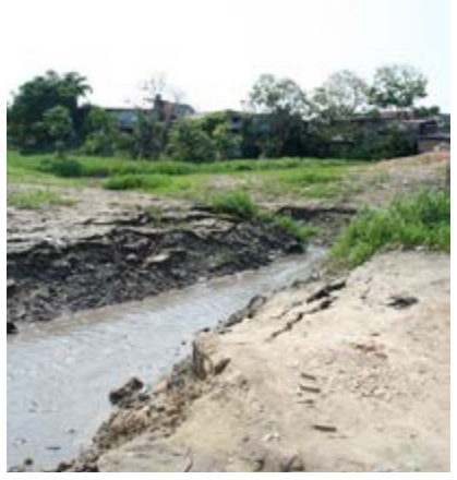
Stream seperating Brazil and Colombia

Overall, political relations between the two nations have improved in recent years.<sup>25, 26</sup> New relations are based primarily on trade and investment rather than on rebel groups and counter-insurgencies.<sup>27</sup> In October 2015, the two presidents signed several economic agreements. Trade between Colombia and Brazil has been growing in recent years. In 2014, bilateral trade reached USD 4 billion.<sup>28</sup> The balance of trade strongly favors Brazil. The value of Brazil's exports into Colombia was roughly 68% higher than Brazil-bound Colombian exports.<sup>29</sup>