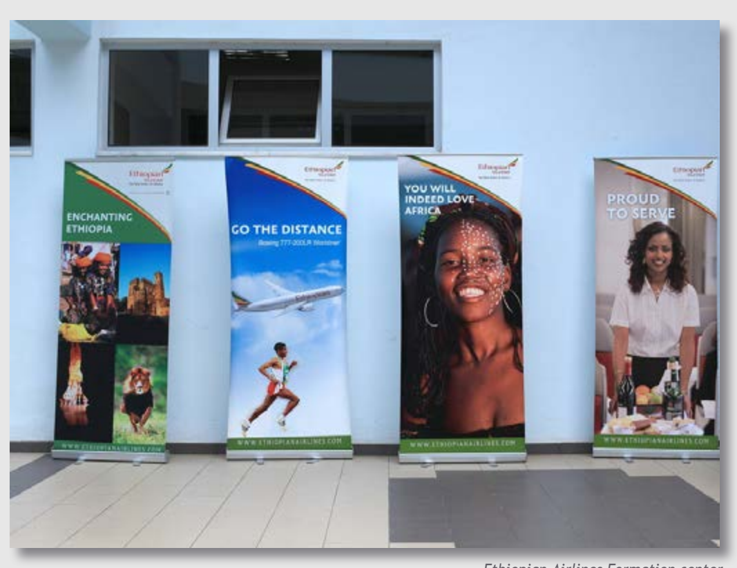
Ethiopian Airlines Formation center Flickr / francediplomatie