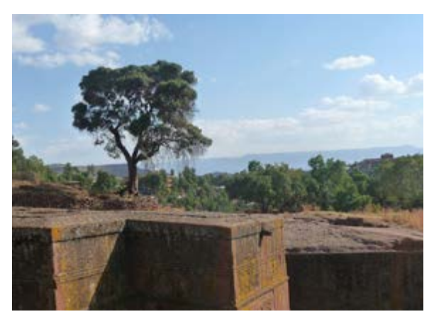
Church of St. George

Although Ethiopia has natural and cultural attractions that could form the basis of a strong tourism industry, the country's civil wars, droughts, famines, and conflicts with its neighbors have made it difficult for extensive tourism development to take hold. In 2011, only 523,000 travelers visited the country, placing it 17th in international visitors among African nations.<sup>95</sup> The primary cultural attractions are in the northern part of the Western Highlands in the ancient imperial capitals of Aksum,