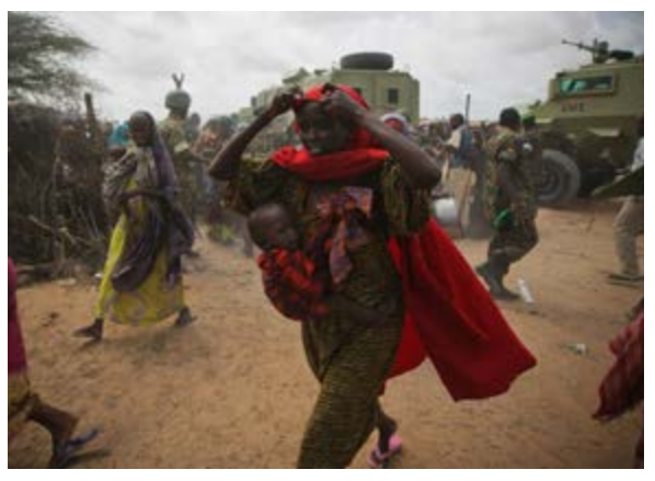
Famine in Somalia

Politically fractured Somalia is a major focus of Ethiopian foreign and military affairs. The Ethiopian government has deployed troops backing the Somali government.<sup>79</sup> Much of southern Somalia fell under the control of the Islamist insurgent group known as al-Shabaab.<sup>80</sup> Ethiopia worried that the group would threaten Ethiopia's stability, thus Ethiopian troops invaded Somalia in 2006, attempting to reinstate the Transitional Federal Government (TFG).<sup>81</sup> Although the attempt limited