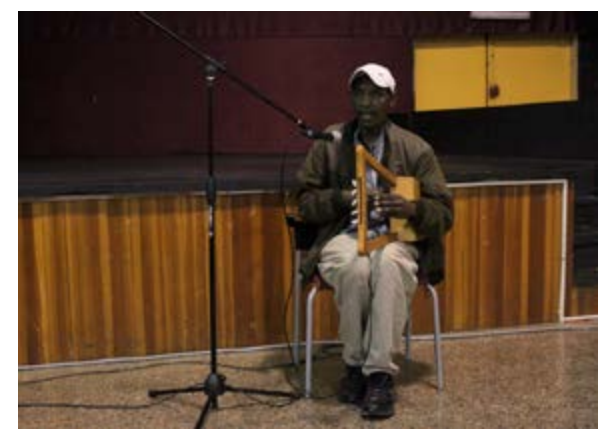
Ethiopian Dance Workshop

Ethiopia has a diverse musical tradition. Christian music began in the sixth century and is still sung in the Ge'ez language. Religious music remains popular throughout the nation and is sung in many of the major languages including Amharic, Oromo, and Tigrayan.<sup>166</sup> The roaming singers known as azmaris ("minstrels") have a long tradition within Ethiopia. Over centuries the azmari repertoire has evolved from music for religious liturgies to more secular themes, with lyrics often