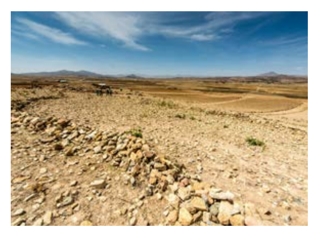
Adi Gudom Landscape

Ethiopia is roughly twice the size of Texas and has one of the most varied and rugged topographies in Africa.<sup>18, 19</sup> The country is divided into four geographic regions. Much of the nation is a high plateau, punctuated by mountain ranges and river chasms. This region, known as the Ethiopian Highlands, is further divided into western and eastern sections by the Great Rift Valley. Except for parts of the Great Rift Valley and some of the river canyons, the Highlands region lies above 1,500 m (4,921 ft).<sup>20, 21, 22</sup> The