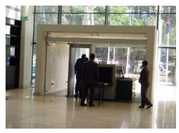
Security Check

The Ethiopian government and military face numerous challenges in maintaining stability. Ethiopian forces face threats from groups inside and outside its borders. Current and future concerns over water, dealing with drought and famine, reducing poverty, and building the economy all factor into the success of the nation.<sup>177, 178, 179</sup> Ethiopia ranks at moderate to high risk for political violence and instability on several important indices.<sup>180, 181, 182</sup> Nevertheless,