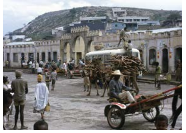
Dire Dawa

Dire Dawa, meaning "empty plain" in Amharic, is an apt description of the dry, mostly flat expanse north, east, and west of the city.<sup>121</sup> The city's population is composed mainly of ethnic Oromo, Somali, and Amhara.<sup>122, 123</sup> Dire Dawa was a long-time caravan center. It began its modern development in 1904 when it became the rail terminus for goods from the port of Djibouti. Today, Dire Dawa exists primarily as a trading center for the surrounding region. Major industries include textiles,