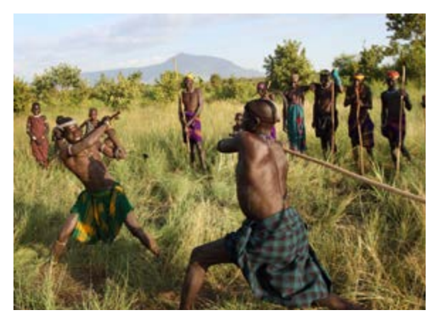
Ethiopian Tribes

The central Ethiopian government has long been dominated by members of the Amhara ethnic group. The present governing coalition, the Ethiopian People's Revolutionary Democratic Front (EPRDF), is an alliance of parties representing the Oromo Peoples' Democratic Organization (OPDO), the Amhara National Democratic Movement (ANDM), the Southern Ethiopian Peoples' Democratic Movement (SEPDM), and the Tigrayan Peoples' Liberation Front (TPLF).<sup>134</sup> Recognition of Ethiopia's ethnic diversity led to the creation