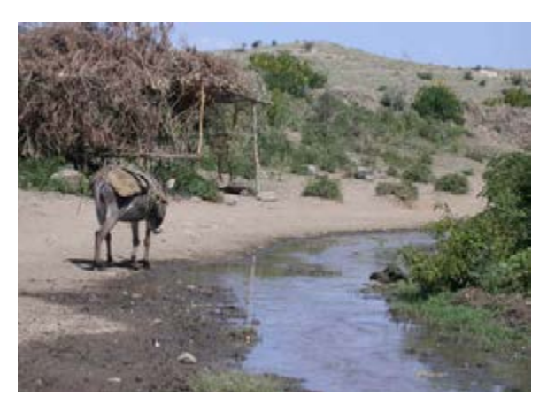
Awash River Basin

Pollution, especially in Addis Ababa, is a serious concern.<sup>172</sup> Most of the air pollution is caused by aging motor vehicles.<sup>173, 174, 175, 176</sup> In addition to air pollution, the capital is plagued by garbage and waste pollution. Garbage collection and disposal is a longstanding problem. About 35% of the city's solid waste is never collected; rather, it is dumped wherever people find space.<sup>177, 178, 179, 180</sup> Water and sanitation problems are also severe. The current sewer system in the capital is woefully inadequate for the