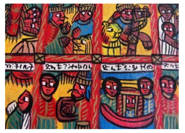
Ethiopian Painting

By 1960, Haile Selassie was entering his fourth decade of rule. Increasing discontent with the slow pace of economic development began to fester, especially among the country's college students.<sup>109</sup> An aborted coup d'état in 1960 was staged by the Imperial Bodyguard, but was quickly foiled by the country's military. This signaled that Haile Selassie's reign was increasingly vulnerable to challenge.<sup>110</sup> Student protests intensified during the decade; uppermost among the protesters' concerns were official corruption and the lack of progress on land reform.<sup>111</sup> A devastating famine in 1972-74 triggered a series of teacher, student, and taxi strikes, as well as mutinies in the country's armed forces.<sup>112</sup> Reforms were initiated, but they came too late to reverse the damage.<sup>113, 114, 115</sup>