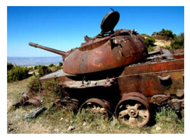
Remains of Civil War

Peace, unfortunately, did not last for long. In 1998, Eritrean forces occupied the Badme border region, which, like the rest of the Ethiopia-Eritrea border, has never been formally demarcated and was still claimed by both countries.<sup>147</sup> War broke out and lasted for more than 2 years. A peace agreement was signed in December 2000, but the underlying border issue has yet to be resolved and tensions between the two countries are still high, as reflected in cross-border incursions by both sides.<sup>148</sup>