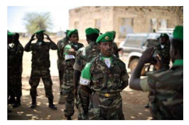
Ethiopian Soldiers

The Ethiopian National Defense Force (ENDF) is composed of four branches: the Ground Forces, Air Force, Police, and Militia.<sup>118</sup> With its approximately 182,000 personnel, it is one of the largest military forces in Africa.<sup>119, 120</sup> The Army (Ground Forces), with its estimated 150,000 troops, composes more than 80% of the entire ENDF.<sup>121, 122</sup> The persistent threats to national security, as well as the activity in Somalia, have helped the army maintain