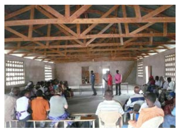
Ethiopian Delegates in Kenya

Although there has been frequent cross-border violence between rival ethnic groups in recent years, Kenya and Ethiopia have a long tradition of generally peaceful relations.<sup>62</sup> Today, they enjoy cordial bilateral relations due to a shared perception of threat posed by Somalia.63,64 Much of the border violence is related to the custom of cattle- and sheep-rustling by