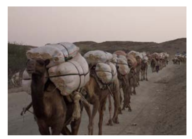
Salt Trade Caravan 38

Other products that bring in significant amounts of Ethiopian export revenues are oilseeds, leather, pulses, meat and meat products, fruits and vegetables, live animals, qat , gold, and cut flowers.<sup>78,</sup> <sup>79</sup> Approximately 38% of exports during 2013–14 were destined for Europe, with the largest markets in Switzerland, The Netherlands, and Germany. About 35% of exports went to Asian markets, with the largest shares going to China, Saudi Arabia, Israel, and the United Arab Emirates. About 23% of Ethiopian exports found their way