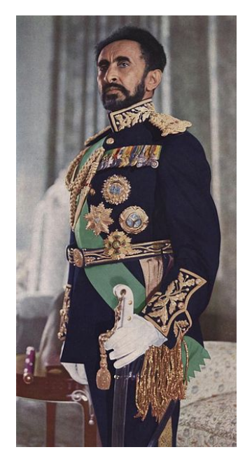
Haile Selassie

Italy, under Benito Mussolini, acted upon its ambitions to control Ethiopia. In October 1935, Italy invaded Ethiopia from its bases in Eritrea. In April 1936, the