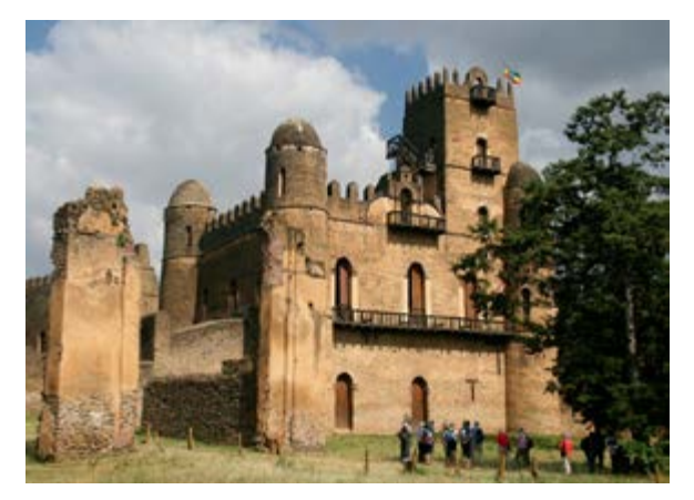
The Camelot of Africa

About the same time, the Ethiopian empire faced a new threat from the south. The Oromos, who are a nomadic pastoralist tribe related to the Somalis, began migrating northward and westward from the region of modern-day Kenya.<sup>50, <sup>51, 52</sup> As a result, the Ethiopian empire and its revenues contracted. An Oromo state developed between the Christian Ethiopians of the Western Highlands and the Muslim Sultanate of Adal. Eventually, a wall was built around the Adal capital of</sup>