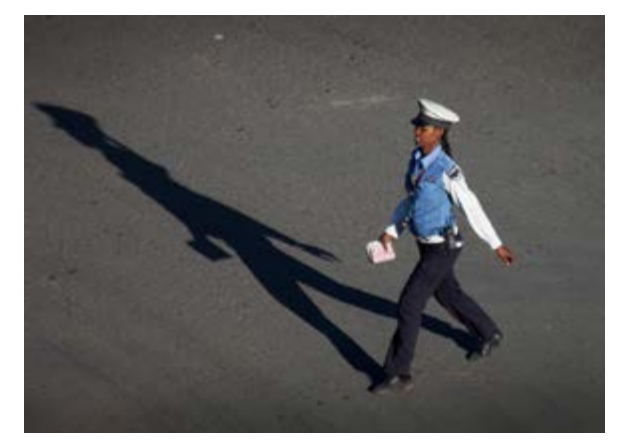
Community Police Officer

Ethiopia's 16,<sup>700</sup>-member Federal Police Force is under the auspices of the Federal Police Commission.<sup>108, 109</sup> Each of the nation's nine states also has a regional police force under civilian authorities. The total number of these regional forces is about 34,<sup>000</sup>.<sup>110, 111</sup> Local militias also operate with varying degrees of coordination and cooperation with the police forces.<sup>112</sup> The Federal Police play a major role in border security and internal security, particularly in counterterrorism. The Anti-Terrorism