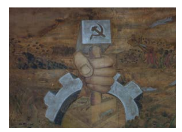
Derg Communist Artwork

poses no serious risk to the federal government, but is a source of local instability.<sup>143</sup> The EPPF engages only in low-level activity, including raids on government convoys.<sup>144</sup>