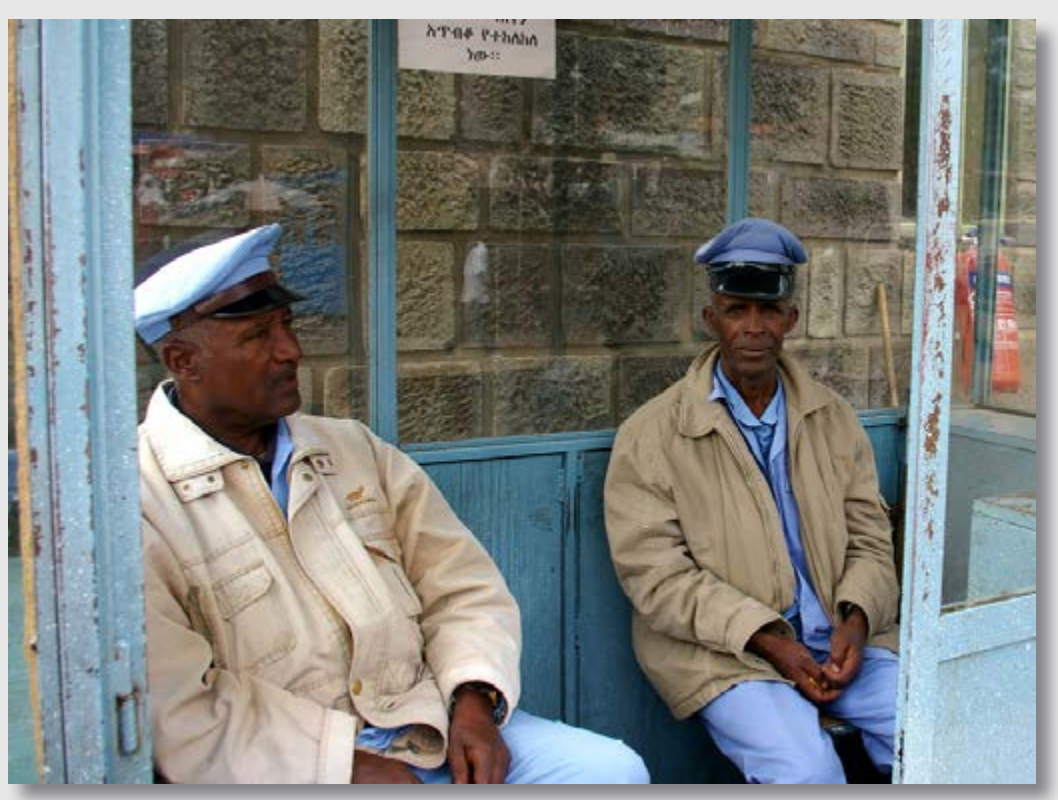
Security Men