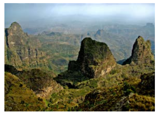
Semien mountains

northern Western Highlands.<sup>50, 51, 52</sup> The Bale Mountains, including Mount Batu and Tullu Demtu, tower over 4,000 m (13,123 ft) and lie to the south on the other side of the Great Rift Valley.<sup>53, 54</sup> The Choke Mountains lie between Addis Ababa and Lake Tana.<sup>55, 56</sup> Overlooking Ethiopia's sprawling capital of Addis Ababa is Mount Entoto. Although not one of Ethiopia's highest peaks, it is famous as the location of the palace of Menelik II, who moved his capital to the area in the 1880s, before becoming emperor.<sup>57</sup>