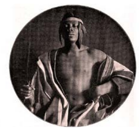
An Ethiopian Chief

Sometime around the seventh century B.C.E., people speaking the Semitic language Ge'ez established a community in the Northern Highlands, in the region now known as Tigray.<sup>22, 23</sup> Several hundred years later, an important kingdom emerged around the modern city of Aksum.<sup>24</sup> The Aksumite kingdom, which developed between the second century B.C.E and the second century C.E., was a trading center, facilitated by its ties to the Red Sea port of Adulis.<sup>25, 26, 27, 28</sup> Around the beginning of