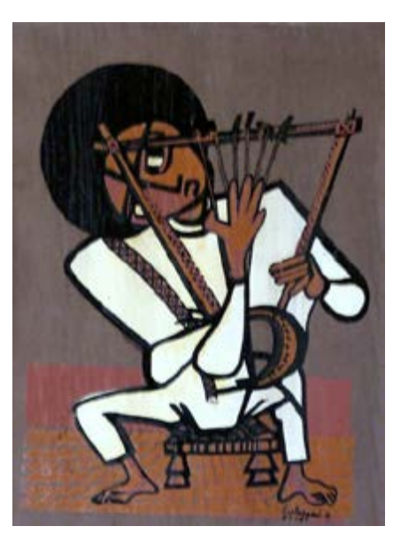
Paintings on Walls

Classical Ethiopian painting follows one of two styles: that of the religious tradition of the Ethiopian Orthodox Church and that of the secular folk art tradition.<sup>161</sup> Church wall-painting has a long history in Ethiopia, as far back as before the seventh century. A distinct characteristic of Orthodox Christian iconic imagery is its two-dimensional linear "folk" style.<sup>162</sup> Good characters are shown in full face, with both (overlarge) eyes visible. Evil characters are displayed in profile and have only one eye visible. Black lines clearly delineate the contours of characters.<sup>163, 164, 165</sup>