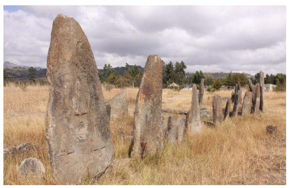
Bek'oji, Oromia

Ethiopia's upper Great Rift Valley has often been referred to as the "cradle of humanity" due to the number of important fossils discovered there.<sup>16, 17</sup> The most famous of these discoveries occurred in 1974 in the lower Awash River valley, where the fossilized skeleton of a new species ( Australopithecus afarensis ) was unearthed. This fossilized skeleton has been dated to 3.2 million year old, and for