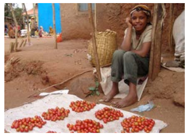
Oromo Girl with Tomatoes

Ethiopia is one of the world's poorest countries with a per capita income of approximately USD 370.<sup>118</sup> Even when measured against the rest of Sub-Saharan Africa, Ethiopia has an extremely low standard of living, ranking 173rd out of 195 countries.<sup>119</sup> Although progress has been made in eliminating poverty, in 2012 approximately 37% of Ethiopians survived on less than USD 1.25 per day. Roughly 72% managed on USD 2 per day.<sup>120, 121</sup> Some progress has been made in major indicators