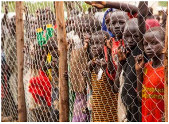
Sudanese Refugee Boys

There has been little time to build a clear strategy toward the new nation since the establishment of South Sudan in July 2011. Twelve memoranda of understanding were recently signed between representatives of the two nations. The memoranda include issues of trade, transportation, education, and strategic partnership relations. Sudan and Ethiopia agree to establish a free trade zone on their border.<sup>92</sup> Although the two nations remain committed to working together to forge peace and security in the