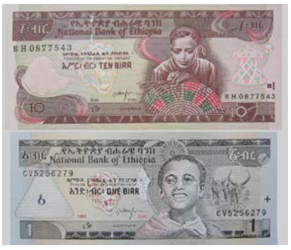
Ethiopian Bank Notes

The National Bank of Ethiopia (NBE), headquartered in Addis Ababa, is Ethiopia's central bank. Founded in 1906, as the Bank of Abyssinia under the control of the