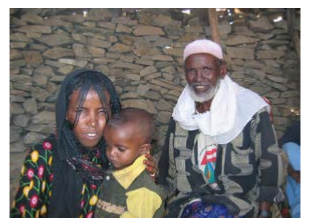
Afar tribe

was the dominant livelihood. Little is known of their origins, but there are two main divisions: the Red Afar ( Asayahumara ) and the White Afar ( Adoyahmara ).<sup>55</sup> Their language and culture share elements with the Somalis and the Oromos.<sup>56</sup> The Afar are mainly Sunni Muslims, although they continue to practice some of their traditional animistic beliefs.<sup>57</sup> As nomads, they spread Islam.<sup>58</sup> Though some remain nomadic, others have been forced to diversify their livelihood and adopt a