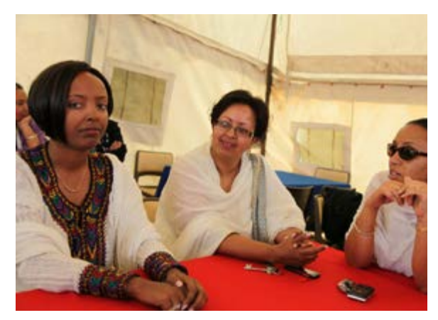
ILRI Addis Staff Traditional Dress

Western-style clothes are common in cities, but traditional clothes are worn in the countryside.<sup>128</sup> Clothing in the cooler highlands tends to be heavier, while in the warmer lowland regions light cotton is common.<sup>129</sup> A universal item of clothing for Ethiopians is the shammas , a type of cotton shawl.<sup>130, 131</sup> Shammas made from a heavier weave are known as gabis , whereas netellas are made from a light, gauze-like cotton fabric. On formal occasions, men wear the netella around their waist.