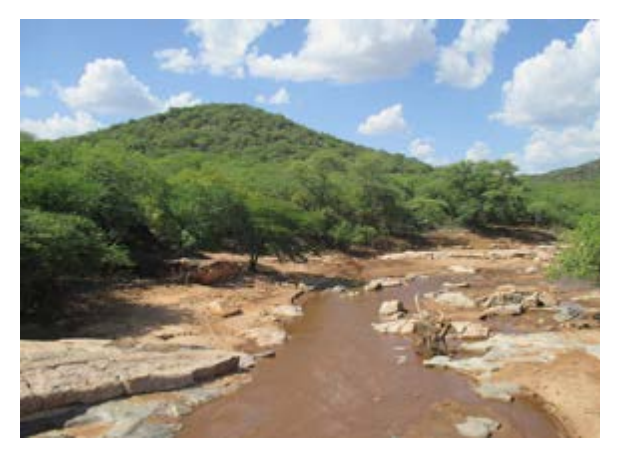
Dawa River

Some rivers in the Western Highlands flow eastward into the Great Rift Valley. The most important by far is the Awash River, which originates west of Addis Ababa and enters the Great Rift Valley near the city of Nazret. It then flows toward the northeast to terminate in Lake Abbe on the Djibouti border.<sup>102, 103</sup> The lower stretch of the Awash River is a world-renowned archaeological site where Lucy, perhaps the most famous hominid fossil (if no longer the most ancient), was found.<sup>104, 105</sup>