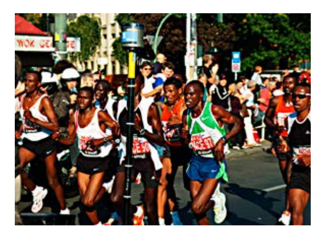
Ethiopian Runners

Ethiopian distance runners are much more successful in the international sports arena.<sup>176</sup> At the 2004 Summer Olympics<sup>7</sup> 7