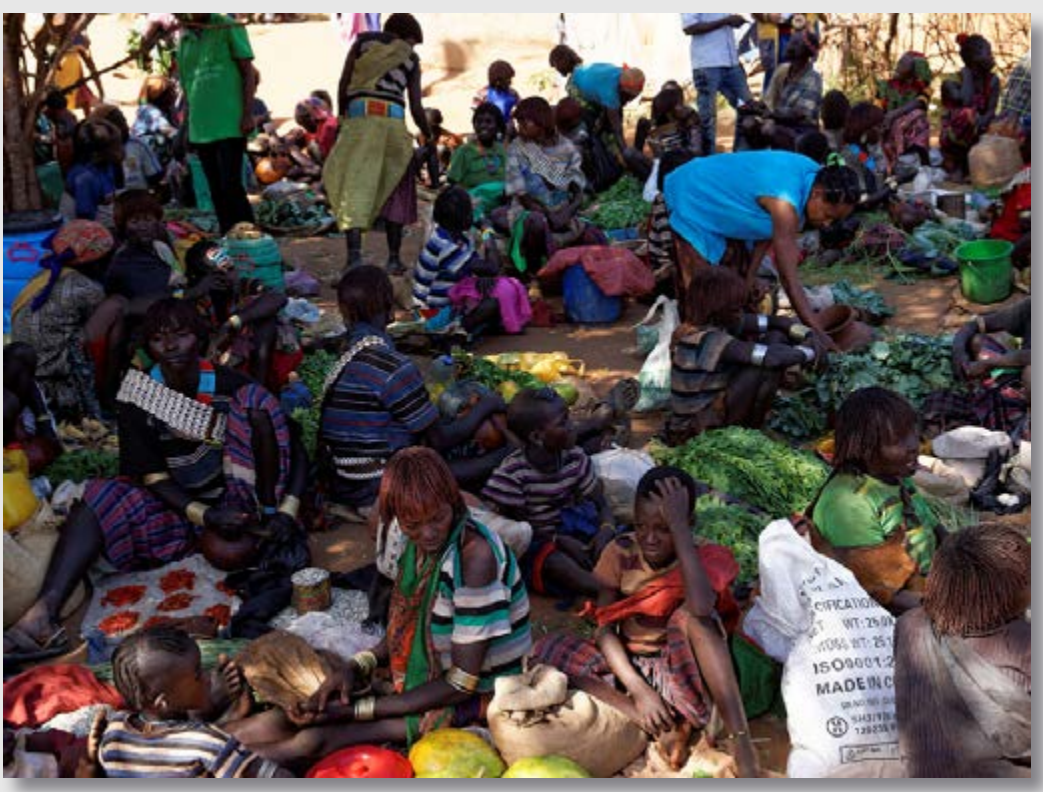
Jinka Market Flickr / www.j_pics.info