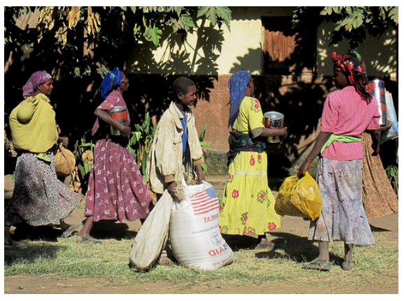
Ethiopians receiving help from USAID

Poverty-driven food shortages, recurrent drought, and soil degradation continue to afflict Ethiopia.<sup>159</sup> In 2001 drought forced the government to appeal for international food aid for over 3 million of its citizens. As the year progressed, the number of Ethiopians affected by the famine reached 4.5 million. In 2012, famine once again gripped the nation as the Belg rains, which usually occur between February and May, failed to materialize. Nearly 4 million Ethiopians were in need of humanitarian aid to survive.<sup>160</sup> The Somali region was the hardest hit, followed by Oromiya, Tigray, and Amara. Continued food shortages in 2013, led to social unrest, and in 2014, famine again threatened the nation after two years of below-average rainfall.<sup>161</sup> El Niño induced drought in 2015 led to further serious risk to the country's stability and by 2016, more than 10 million people required emergency food assistance.<sup>162, 163</sup>