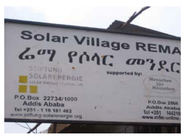
Solar Energy

Ethiopia presently has no oil or natural gas fields in production. Recently, a London-based oil company announced they had struck oil near the border with Kenya, and projected that Ethiopia could have 2 to 3 billion barrels of oil reserves. The company is also conducting explorations in the areas of Ogaden, Omo, and Gambella.<sup>50, 51</sup> African Global Energy announced an oil and gas discovery in 2013.<sup>52</sup> The country has large reserves of oil shale, especially in the Oromia Regional State, which