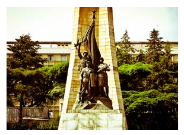
Derg Monument

In 1977-78, the Mengistu-led Derg leadership initiated a particularly brutal response to terrorist attacks being carried out by a rival socialist movement in the country. The Red Terror, as this governmental counteraction came to be known, resulted in the deaths of thousands of people.<sup>124, 125, 126</sup>