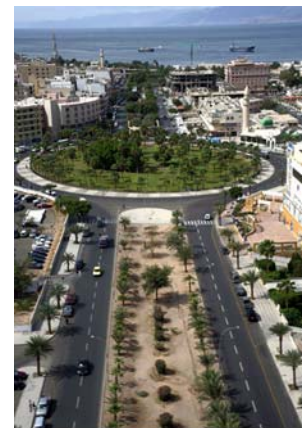
City of Aqaba

Lying in southern Jordan on the banks of the Red Sea, Aqaba thrives because of its geographic location. Tourism and trade are the dual pillars of Aqaba's economy and are possible because of the Gulf of Aqaba. Diving and snorkeling are especially popular as are the city's beaches, all of which lead to Aqaba's unique position as the "aquatic playground" of Jordan. 47 Aqaba's large seaport has been improved since Jordan gained independence and added deepwater facilities in 1961. The port is now the central hub for the country's exports and imports. The city was once a fortified Ottoman post and gained notoriety when British officer T. E. Lawrence led a band of Arab warriors to take the city in 1917. As of 2009, the population of Aqaba was roughly 108,000. 48, 49