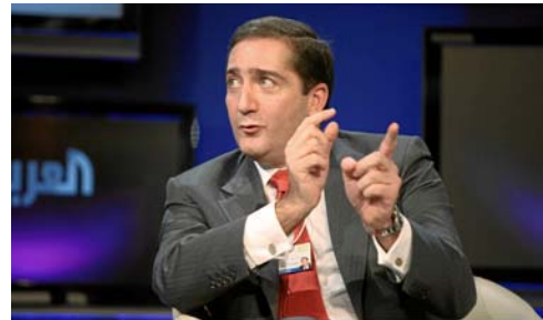
Former Prime Minister Samir al-Rifai

Jordan's economic future depends on a number of factors. Internal and external stability are vital for continued growth. Jordan will need to continue its economic integration in the region, including its potential membership in the GCC, while finding stability with its immediate neighbors. Additionally, economic reforms of the last decade will need to continue, especially because of a growing youth population.