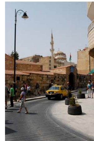
Rainbow Street, Amman, Jordan

Sunni Muslims constitute 92% of the population. 233, 234 Less than 2% of the total population is Shi'ite or Druze. 235 Shi'ites set themselves apart from Sunnis by rejecting the early leaders of the Muslim community after Muhammad's death except his cousin and son-in-law, Ali, whom