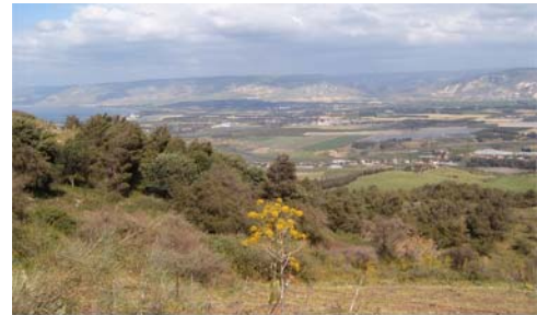
Jordan Valley

Jordan's climate varies across its different regions, though the country as a whole is noted for its arid, warm climate. Western Jordan has a Mediterranean climate, but the climate becomes more continental in eastern Jordan. 15 Most of the country's rain falls in the northern highlands, leading to the highest population concentrations in these areas. 16 The vast desert steppe zone receives less than 150 mm (5 in) of rainfall a year. 17 Only 3% of Jordan's land receives more than 300 mm (12 in) of rain a year, the minimal amount of water needed to grow rain-fed wheat. 18 Jordan's dry season is during the spring and summer months, between April and October.