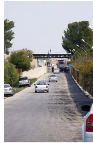
Jordanian-Syrian border

Jordan depends on Syria's Mediterranean port, Latakia, especially for the import of European goods. The popular unrest in Syria in 2011 disrupted Jordanian use of this port and halted much of the limited interaction between the two countries. This increased the cost of Jordan's imports, which must reach the country by other means. 302