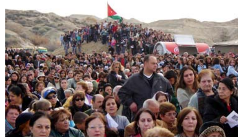
Christian Iraqi refugees

Prior to the U.S. invasion of Iraq in 2003, Jordan had strong relations with its eastern neighbor. Jordan's King Hussein supported Saddam Hussein for many years, largely because of Jordan's economic dependence on Iraq. When Iraq invaded Kuwait in 1990, Jordan hesitated to take sides or condemn Iraq, thereby angering not only the United States but also some of Kuwait's Arab allies. After the Gulf War, Jordan and Iraq remained close. Their deals to provide oil for Jordan for less than market prices helped to sustain Jordan's economy throughout the 1990s and during the early 21st century. 290, 291