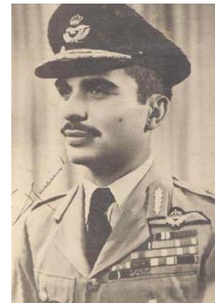
King Hussein

Following Abdullah's assassination, the crown passed to his eldest son, Talal. But he suffered from mental illness and was unfit to rule. In August 1952, parliament deposed Talal (who accepted the decision and lived quietly outside of Istanbul until he died 20 years later) and appointed Talal's 17-year-old son to take his place. 114, 115 Young Hussein was formally crowned a year later when he came of age, and spent his early years on the throne securing his power. An attempted coup in 1957 convinced Hussein to remove Palestinian nationals from the legislature and to ban political parties. With the growing regional influence of Egypt's Gamal Abdul Nasser and a coup that killed King Faisal II of Iraq (Hussein's cousin), Hussein grew anxious and reached out to Britain and the United States for support; both countries responded with financial and military aid, helping Hussein secure his position. 116, 117