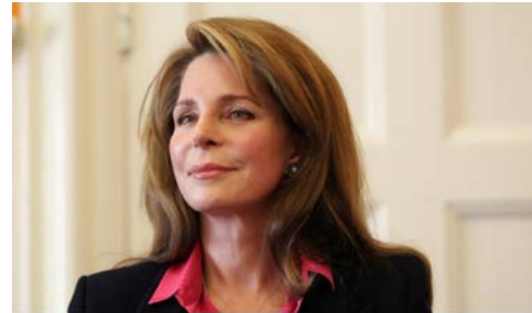
Queen Noor of Jordan

Jordanian society is the product of many different influences. The country is largely a modern creation from the ashes of the Ottoman Empire, with a monarchy that prior to World War I did not inhabit any Jordanian territory. Modern Jordan developed while it was surrounded by neighbors with greater regional power and influence. To survive, Jordan was forced to make alliances, largely with the West, and has depended on these alliances for decades. As a result, Jordanian society has a greater degree of openness to the Western world than that found in much of the Middle East. In fact, Jordan's previous queen was American-born, and much of the population speaks English.