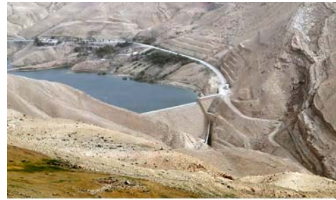
© Bernard Gagnon Al Mujib Dam

Jordan's primary environmental concern is its scarcity of water; it is one of the world's most water-deprived countries. In Jordan, the average person has access to less than 200 cubic m (52,834 gal) of fresh water a year (in the United States the number is more than 9,000 cubic m [2,377,548 gal] a year, 45 times greater). 50 This amount is only exacerbated by an ever-growing population. When the Emirate of Transjordan was established in 1921, the population of the country was 225,000; today Jordan's population is approximately 6.5 million. 51, 52 As Jordan faces the challenge of providing water for a population nearly 30 times larger than less than a century ago, it must do so with water sources that have diminished over that same period.