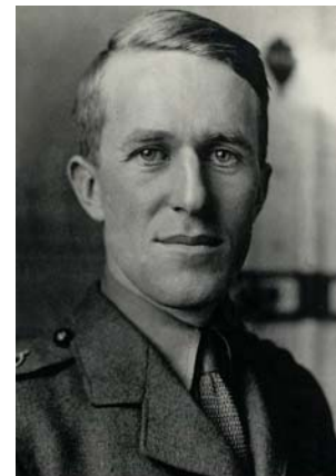
T.E. Lawrence

By the 16th century, the region fell to the Ottomans, who controlled the east bank of the Jordan under the provincial authority of Damascus. 88, 89 Despite a new Ottoman jurisdiction, Jordan remained largely ignored except as a crossroads. Its status as a stop along the way between more influential centers gave the region its new name: Transjordan. Beginning in the 19th century, Ottomans took more interest in Transjordan and settled refugees there, including Circassians. 90, 91