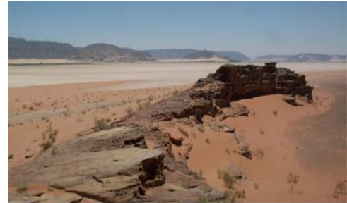
Wadi Rum Desert

Further complicating Jordan's water shortages, the region is subject to crippling droughts. 58 Such droughts, caused by low rainfall and exacerbated by diminishing rivers and ground water, destroy crops and kill livestock. 59 Having learned from past drought years, the Jordanian government now carefully monitors rain levels and projected precipitation. When moisture levels are low the government has responded by digging emergency wells. 60