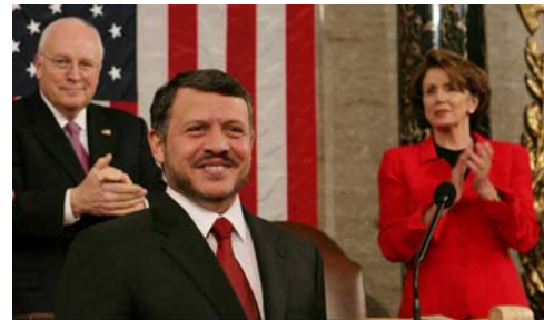
Abdullah addresses US Congress

United States relations with Jordan have been strong for more than 60 years. Only when Jordan failed to condemn Saddam Hussein's invasion of Kuwait in 1990 did the relationship falter. Jordan regained the United States' favor throughout the 1990s by distancing itself from Iraq and increasing its role in Arab-Israeli peace. Relations have been especially strong since the terrorist attacks of 11 September 2001, because the two countries work together contributing to each other's security. 280