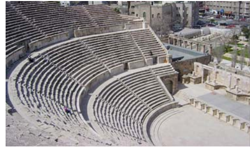
Roman theatre in Amman

Competing external imperial powers determined much of Jordan's history in the following centuries. In the eighth century B.C.E. the region fell to the Assyrians of Mesopotamia to the east (modern Iraq). Israelites were deported and Jordan was divided into Assyrian provinces. Eventually the Assyrians fell to the Babylonians (a competing Assyrian neighbor also from modern Iraq), who took Israelites as slaves in 588 B.C.E. Cyrus the Great of Persia (modern Iran) conquered Babylon in 530 B.C.E. and the Persians allowed Israel and Jordan a