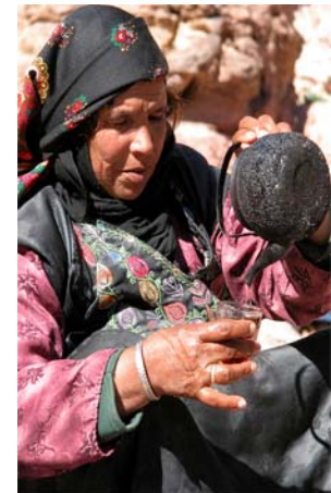
Traditional woman's dress

Women have gained some space in the government sphere. Beginning in the 1960s, women held appointed government positions. In the 1980s, women began running for elected office, and a woman was first elected to parliament in 1993. In 2003, the government introduced a quota of six seats for women in parliament, and in 2010, the government began to consider increasing the quota. 260 As of 2006, Jordan and Morocco were the only countries in the Arab world to have quotas for women in parliament. 261 Jordan's queens have also prominently advocated public issues, including establishing funds to create income-generating projects for women. 262