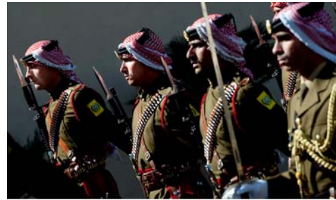
Jordanian soldiers

Jordan spends 8.6% of its gross domestic product (GDP) on military expenditures annually, the fourth-highest proportion in the world (only Oman, Saudi Arabia, and Qatar spend a higher percentage of their GDP on defense). 316