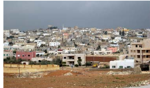
Refugee camp at Madaba

Jordan is surrounded by countries with superior military capabilities and differing political ideologies, agendas, and allegiances. Syria, to the north, is a longtime client of Iran, while Saudi Arabia, to Jordan's south and southeast, views Iran as a regional competitor and its hegemonic goals as threatening. Iraq once supported Jordan economically, but since Saddam Hussein's fall, privileged economic deals to Jordan have largely disappeared. Jordan has also contended with Iraq's instability as hundreds of thousands of refugees have come to Jordan since the U.S. invasion in 2003. In 1994, Jordan became only the second Arab country to make peace with Israel, its western neighbor, but that peace can be tenuous while Israeli-Palestinian tensions flare.