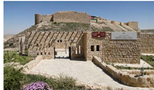
Crusader Castle, Shoubak

Islam reached the Jordan River Valley and its surrounding region early in the religion's history. Muhammad directed an expedition into southern Jordan in 629–630 in which Jewish and Christian communities submitted to the growing power from the south. During the next few years, Muslim forces penetrated Jordan, coming into conflict with Ghassanids and Byzantines. These forces, under the command of Khalid ibn al-Walid, dealt a serious blow to the Byzantines in 636 at the Battle of Yarmuk. The Byzantines could no longer hold their Syrian provinces and retreated to Anatolia (modern Turkey). 79, 80 The Arabs divided their new territory into provinces: the area primarily west of the Jordan River was known as Jund al-Filastin (the military province of Palestine) and the area to the east was known as Jund al-Urdunn (the military province of Jordan). 81