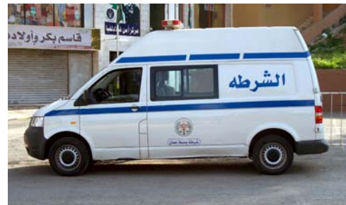
Jordanian Police van

In Jordan's first decades, the military maintained internal security because of its organization and capabilities. By the 1950s, however, responsibility for public security shifted to the interior ministry. Today, Jordan has a centralized police force, known as the Public Security Directorate (PSD), under the Ministry of the Interior. The Urban Police, Motorway Police, Desert Patrol, and the country's prison service are all included in the PSD. 311, 312 Jordan's PSD is one of the best-trained police forces in the Middle East, and has a response time in the capital of 3 to 5 minutes. 313