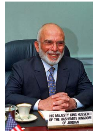
King Hussein of Jordan

The 1980s brought Jordan economic troubles and volatile relations with the PLO. Jordan had always relied on foreign aid, but by the early 1980s, Jordan was receiving USD 1.179 billion from its Arab neighbors, an amount 16 times larger than at the time of the 1973 war. 135 This high level of support could not last because regional instability throughout the 1980s reduced the wealth of Jordan's neighbors. Poor economic policies in Jordan only exacerbated the problem. By the end of the decade, the country had the world's largest foreign debt per capita. 136