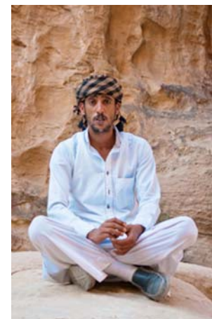
Petra man in traditional dress

Despite Jordan's strong ethnic unity, Jordanian society is divided along nationalist lines. The majority of the country is Palestinian, most of whom (or their parents or grandparents) came to Jordan following conflicts with Israel in 1948 and 1967. Although many Palestinians have been disaffected by the Jordanian government (a disgruntled Palestinian assassinated the first monarch, King Abdullah, in 1951), Jordan is the