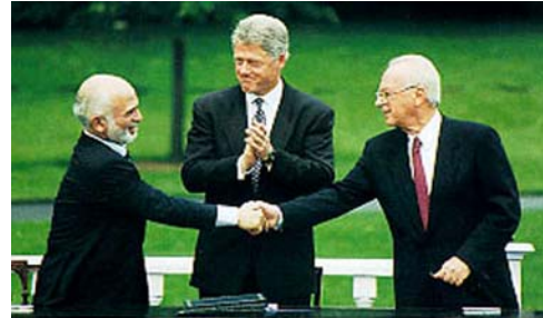
Israel-Jordan peace negotiation

In 1994, Jordan became only the second Arab country (after Egypt) to sign a peace accord with Israel. As of 2011, no other Arab governments have joined them. Jordan's peace with Israel, on the heels of the Oslo Accords, was initially designed to be a "warm peace," going beyond the security arrangements of the Israeli-Egyptian peace to include economic and cultural ties. 304