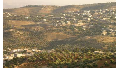
Olive farms in Jerash

Jordan's agricultural sector is small, in accordance with the geography and climate. Only 3.3% of the arid landscape is arable, and the country has just 820 sq km (317 sq mi) of irrigated land. 160 It is largely because of the unproductive landscape that Jordan suffered so greatly from its 1967 loss of the West Bank, which had fertile land and accounted then for 40% of GDP, including 60% of Jordan's fruit and vegetable output and more than one-third of grain production. 161 Today Jordan's agricultural sector accounts for just 3.4% of GDP and employs only 2.7% of the labor force. 162