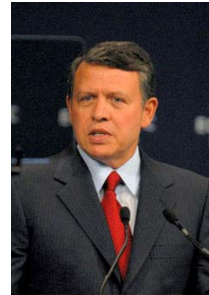
King Abdullah II

Since his ascension to the throne, Abdullah has initiated free-market reforms and has overseen an opening of the political space. The economy has stabilized as a result of increased trade efforts, privatization, and financial liberalization. Yet the country faces long-term economic challenges and remains dependent on foreign aid. 145 Jordan has held parliamentary and local elections under Abdullah, though some doubt their utility. 146