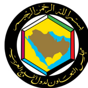
Gulf Cooperation Council logo

Even though the Saud family drove Jordan's Hashemite dynasty out of the Hijaz region (including Mecca and Medina) of modern Saudi Arabia, the two countries were on good terms after World War II. Relations cooled in 1990 when Jordan refused to condemn Iraq's invasion of Kuwait. Saudi Arabia responded by stopping all grants to Jordan, restricting Jordanian imports, and terminating low-priced oil sales. 286