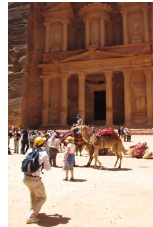
The treasury in Petra Jordan

Revenues from tourism are subject to market and political instabilities. The global economic downturn that began in 2008 slowed tourism to Jordan in 2009, though other areas of its economy were insulated. 176 Safety and security, which are important issues in a volatile region, are vital to Jordan's tourism sector. The sector has grown significantly since Jordan made peace with Israel in 1994, but the regional unrest of 2011 deterred tourists. According to the