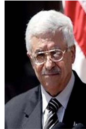
Prime Minister Mahmoud Abbas

The United Nations estimates that 2 million Palestinian refugees live in 10 camps in Jordan. Jordan gives most of these refugees Jordanian citizenship. Additionally, the people descended from those who left Palestine during the 1948 war or the Six-Day War of 1967 brings the total number of Palestinian-Jordanians to roughly 60% of the total population. Therefore, the Jordanian government sees the continuing Israeli-Palestinian conflict as an ongoing threat to the nation's stability. 310