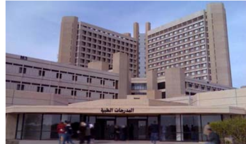
Jordan University and Hospital

The per capita GDP in Jordan was USD 5,400 in 2010, ranking 144th out of 228 countries. (Per capita GDP in the United States was USD 47,200, ranked 11th in the world.) 204 Officially, the country has an unemployment rate of 13.4%, although some estimates place the number much higher, and 14% of the population lives in poverty. 205 High costs of living cause many to look for jobs outside of Jordan; some Gulf countries, for example, offer salaries that are three to four times higher than those in Jordan. Sources estimate that more than 600,000 Jordanians work abroad, primarily in the Gulf. 206