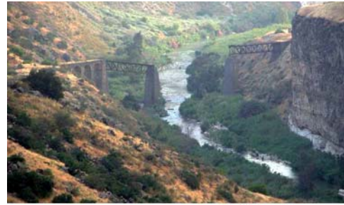
Yarmuk river, northern Jordan

Jordan has less available water than almost every country in the world, and many of its neighbors are nearly as dry. In 2010, Jordan's water availability met only 44% of its demand, and by 2040 it is estimated that Jordan's water availability will meet just 30% of demand. 327