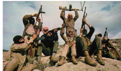
© Thomas R. Koeniges Palestinian liberation fighters

Viewing the Arab defeat in the 1967 war, many Palestinians turned to terrorist tactics. 123 Many were openly antagonistic toward Hussein's government, resulting in PLO hostilities in Jordan, not just in Israel. Tensions mounted in September 1970 when the Popular Front for the Liberation of Palestine hijacked several commercial airplanes. 124 After transferring the passengers, the terrorists blew up three of the planes at Dawson's Field in Zarqa, Jordan. Hussein responded by declaring martial law. The passengers of the hijacked planes were ultimately secured but the violence of the ensuing conflict, in which thousands were killed, prompted Palestinians to refer to the month as Black September. 125 Shortly thereafter, Hussein drove PLO guerrillas out of Jordan into Lebanon. 126, 127