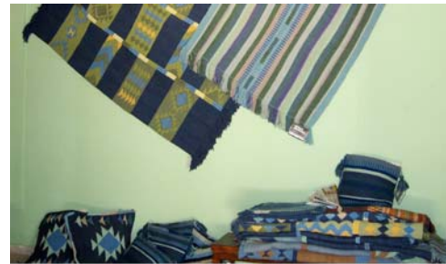
Woven goods

Handicrafts are Jordan's most traditional and prominent form of art, and represent the long history of a society characterized by small villages and nomads. Among the crafts, perhaps none is better known than Bedouin weaving. Bedouin women have become masters of woven goods from small bags to large tent panels. Ragm patterns have backs that are characterized by loose threads. Nagash patterns, conversely, run both horizontally and vertically and are made so that both sides are considered fronts. Weaving is especially common in late summer as field work winds down. 268, 269