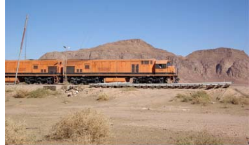
Aqaba Railway Corporation

Because of Jordan's lack of natural resources, the country has a negative trade balance: the cost of its imports exceed the revenue from its exports. Primary exports include clothing, chemicals, pharmaceuticals, phosphates, and potash. Major imports include machinery, petroleum, iron, and food. Jordan finances its trade imbalance through foreign grants, loans, and investments. Revenue from tourism also helps offset the trade deficit. 188, 189