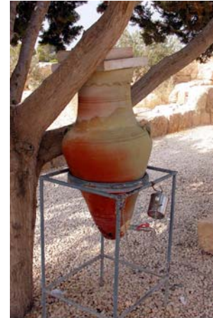
Precious water storage

Unlike many of its Arab neighbors, especially those in the Persian Gulf, Jordan does not have oil reserves driving its economy. Jordan is a net importer of oil and has been for decades. In 1980, Jordan imported roughly 40,000 barrels of petroleum a day, but by 2009, that number climbed to almost 100,000 barrels a day. Even at the peak of Jordan's oil production in the mid-1980s, it only produced 1,000 barrels a day. Today its production is virtually nonexistent at roughly 20 barrels a day. 180