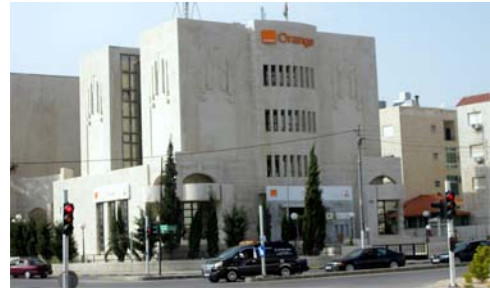
Jordan Telecom Group / Orange

The first decade of the 21st century saw major economic reforms that included shifts toward privatization. King Abdullah II attracted foreign investment by privatizing state-owned companies. 211 Although some privatization began before Abdullah, it has been under his watch that privatization has received the greatest attention. The government's goals in pursuing privatization were to optimize efficiency and attract foreign investments. 212