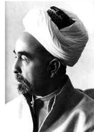
King Abdullah I

Britain continued to play a strong role in Transjordan through its first years. Although Britain solved a short-term political problem by installing Abdullah under a British mandate, it also created new economic problems. 104 Transjordan was a country devoid of resources. From the outset of the mandate, Britain paid Abdullah a yearly stipend. Abdullah's fiscal responsibility proved lacking even as Britain provided two-thirds of Jordan's revenue, prompting Britain to place stronger controls on its aid. 105, 106 In 1923, Britain fully recognized Transjordan but retained control of financial, military, and foreign affairs. Only after World War II did the country gain full independence. 107