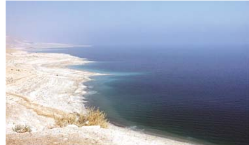
The Dead Sea in Jordan

Some challenges, such as threats of terrorism, create further opportunities for bilateral and multilateral cooperation. Military and intelligence cooperation have become hallmarks of U.S.-Jordan relations. Intelligence cooperation has also strengthened ties with Iraq and Saudi Arabia. Jordan will continue its cooperative counterterrorism efforts in hopes of keeping itself safe from external and internal threats. 336