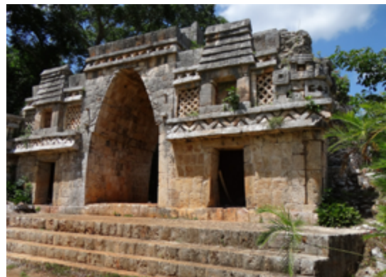
Mayan building

During Mexico’s classic period, the dominant civilizations were the Maya who settled throughout the Yucatán Peninsula and south into Guatemala, and the rulers of Teotihuacan in the Valley of Mexico. The Mayans, like the Olmecs, lived in many decentralized city-states; thus, they were difficult to conquer. 31 Archaeologists once believed that the early Mayans were peaceful and abandoned their cities because of environmental disaster or external attack. However, more recent