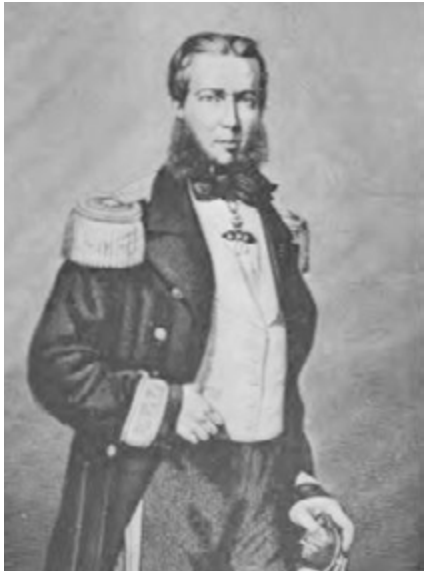
Maximilian, Archduke of Austria

The Church threatened to excommunicate anyone trying to purchase property at auction. A three-year civil war ensued. Conservatives rebelled against the liberal government, taking control from Mexico City. Liberals fled to Veracruz where they organized an opposition government and continued to issue anti-clerical reform laws. 132 In some places, priests who refused sacraments to liberals were shot. In others, doctors who treated liberal soldiers were killed. Liberal forces finally retook Mexico City in January 1861, and Juárez was elected president later that year. 133