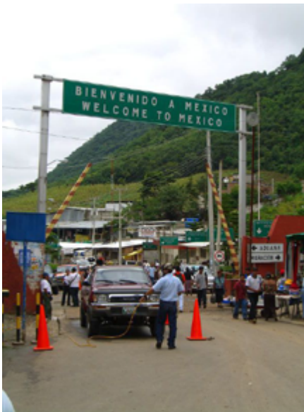
Mexico-Guatemala border

Guatemala lies southeast of Mexico, at the political divide between North and Central America. 60 Guatemala considered the Mexican state of Chiapas part of its territory until 1883, when it signed a treaty recognizing Chiapas as part of Mexico. 61 Today, the 958 km (595 mi) Guatemala-Mexico border is partly defined by the Usumacinta River, which flows northwest from Guatemalan highlands to the Bay of Campeche in the Gulf of Mexico. 62 Though much shorter than the Mexico-U.S. border, the jungle climate and volcanic terrain make it a more difficult border to manage. Several Mexican cartels have crossed into Guatemala threatening security in the region. 63, 64, 65, 66