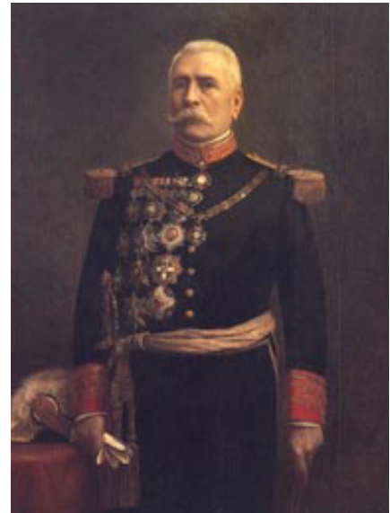
José de la Cruz Porfirio Díaz

He achieved his vision of “order and progress” for Mexico through attracting foreign investment in minerals, oil, railroads, and land. 140 The accompanying industrialization of agriculture and manufacturing disenfranchised the working classes. This resulted in the first large wave of emigration from Mexico to the United States, and setting the stage for internal revolt. 141, 142 Díaz used the Rurales , a federal rural police force established by Juárez, to quell unrest and enforce elections. 143, 144, 145