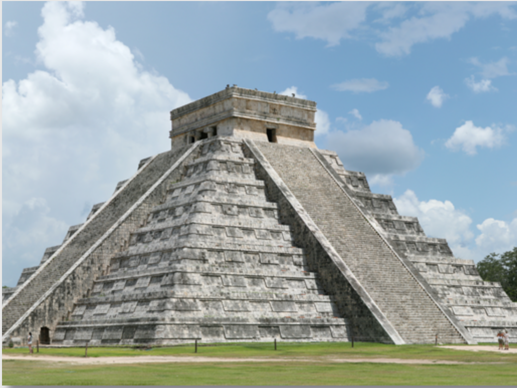
Chichen Itza