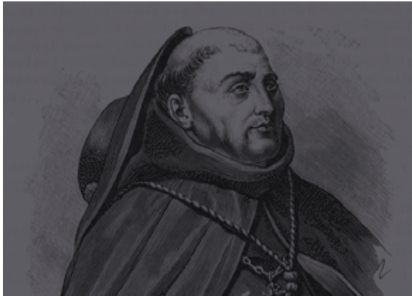
Juan de Zumarraga first bishop

In 1493, colonization of the New World became justifiable when Pope Alexander VI made the Spanish crown responsible for the souls of New Spain. 66 By 1524, Franciscan friars arrived in Veracruz to begin the work of conversion, claiming 9 million baptisms by 1537. The colony's first bishop, Juan de Zumárraga, arrived in 1528 with the title "Protector of the Indians," a role that placed priests at odds with secular officials for centuries, even as Roman Catholicism became the state religion. 67, 68, 69