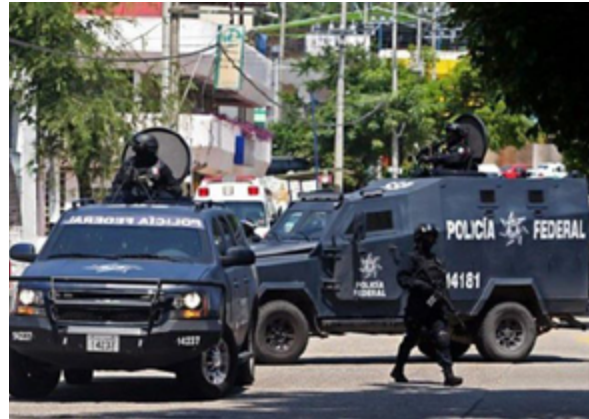
Mexican Federal Police

For nearly four decades, police reform has occupied the attention of every Mexican president. 88 In recent reforms, federal police forces were reorganized in attempts to reduce corruption and increase effectiveness against transnational criminal threats. In 1999, federal highway, fiscal, and immigration forces merged with a brigade of military police into the Federal Preventive Police, which handles serious crimes such as kidnapping and trafficking in humans, arms, and drugs. 89