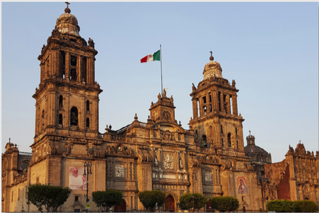
Catedral Metropolitana, Mexico City