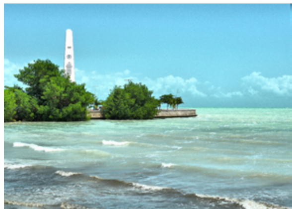
Chetumal Bay border crossing

Belize lies south of the Mexican state of Quintana Roo, on the east coast of the Yucatán Peninsula facing the Caribbean Sea. 44 The Belize-Mexico border follows the Rio Hondo, which flows northeast into Chetumal Bay. Belize's Ambergris Cays extend south from Mexico's Xcalak peninsula to separate the bay from the Caribbean Sea. In the 1890s, Britain, as administrator of then-British Honduras, granted Mexico maritime transit rights in perpetuity from the port of Chetumal through Belizean waters to the open seas. 45, 46