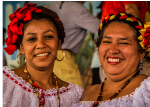
Mestizo women Tuxtla Chico, Mexico

Mexico’s mestizo population stems from the union of Spanish soldiers with indigenous women, who were often taken as servants or slaves. Couplings also occurred between Spanish and Aztec nobility, and indigenous men and Spanish women. 22 Mestizo was the racial catch-all category for anyone not of “pure” Spanish or Indian blood. Recent scholarship has pointed out how ideas of mestizaje evolved to embrace and to obscure the mixing of local peoples and Europeans with Africans, Asians, and other Americans who arrived as slaves and freed slaves, sailors and soldiers, adventurers, or refugees. 23, 24, 25 By the time of the Revolution in the early 20th century, mestizaje was a part of a mexicanidad defined by culture and class as much as race. 26, 27 Analysts have noted Mexicans becoming mestizo by changing cultural characteristics such as appearance, language, work habits, or family relationships. 28, 29 Mestizos have also adapted such characteristics in order to gain the wealth and power of the Mexican upper class. 30, 31