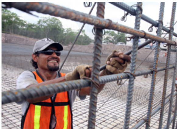
Mexican laborer

Over the last two decades, Mexico's economy has become more reliant on manufacturing. 151 Mexico's formal economy jobs require skills, and working conditions and benefits are regulated by strict labor laws. The formal economy, though generating roughly three-quarters of the national GDP, employs only 40% of the labor force. On the other hand, Mexico has a large informal economy that, in 2014, accounted for 26% of Mexico's GDP and employed 60% of the labor force. 152, 153