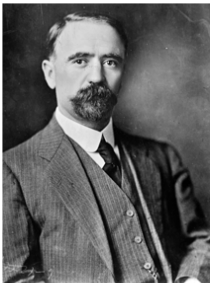
Francisco Madero

In the 1910 presidential election, Francisco Madero opposed Díaz. Madero came from a privileged family. He attended the University of California at Berkeley and worked in family business before entering politics. 146 Madero lost the 1910 election, fled the country to avoid arrest by Díaz, and issued the Plan de San Luis Potosí , which called Mexicans to revolt. 147, 148 Regional resistance to the Porfiriato had been developing for some time under the lead of men such as Francisco “Pancho” Villa in the north and Emiliano Zapata in the south. 149, 150, 151