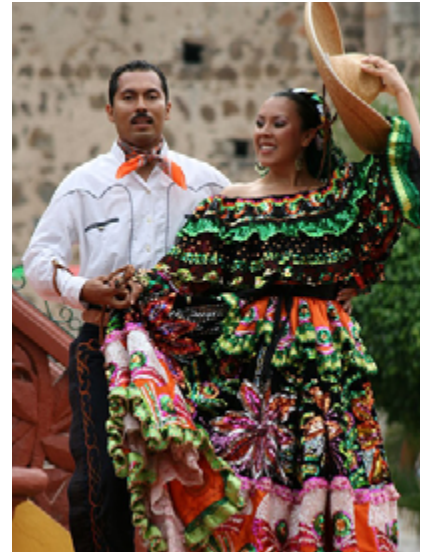
Jarabe Tapatio

In the performing arts, early 20th century educators taught a “national canon” of regional music and dance. By mid-century the Ballet Folklorico de Mexico was touring internationally with these expressions of mexicanidad . Dances include the jarabe tapatio (“Mexican Hat Dance”), and musical styles include the string and brass mariachi music of Jalisco, the Afro-Cuban influenced harp sounds of son jarocho from Veracruz, and the marimba bands of Oaxaca. Nineteenth century German immigrants contributed the button accordion and polka beat to dance and song of the norteña music style. 180, 181, 182