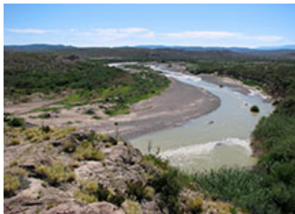
Rio Bravo, Mexico-Texas border

Mexico has close to 150 rivers, about 70% of which empty into the Pacific Ocean. The majority are small regional waterways that are largely unnavigable. 37 The Rio Bravo (called the Rio Grande in the United States) marks the northern border with Texas, and is one of the largest and longest rivers in Mexico. 38 The Rio Hondo marks the southern border with Belize, and the Usumacinta marks the border with Guatemala. 39, 40 The Rio Colorado (Colorado River) flows from the United States into the Gulf of California, separating the Baja California Peninsula from the mainland state of Sonora. 41 Most rivers are in the south, and flow from the Sierra Madres to the east and west coasts. Mexico's longest river, the Lerma (2,730 km/1,700 mi), flows inland to Mexico's largest lake, Chapala, supplying water and hydroelectricity to nearby Guadalajara, Mexico's second-largest city. 42, 43 Although many Mexican rivers are not navigable, dams provide irrigation for crops, water for settled populations, hydroelectric power, and flood control. 44, 45 Rivers that run beneath the limestone of the Yucatán Peninsula are famous among divers and explorers. 46