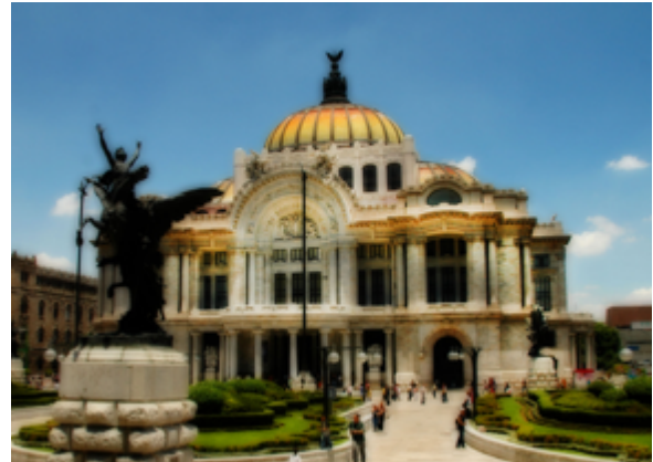
Palacio de Bellas Artes, Mexico City

Mexican visual art is most famously represented in the Muralist movement of Diego Rivera, David Alfaro Siqueiros, and Jose Clemente Orozco. Siqueiros wrote: "Art must no longer be the expression of individual satisfaction (which) it is today, but should aim to become a fighting educative art for all." 168 Mexican murals appear throughout North America in public buildings such as the Detroit Institute of the Arts and the Pacific Stock Exchange in San Francisco. 169, 170, 171 Mexico City's