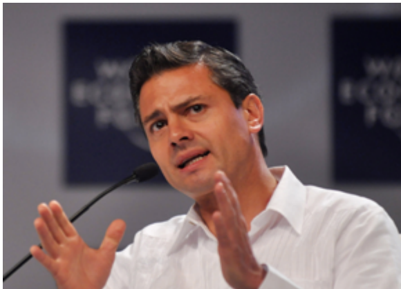
President Enrique Peña Nieto

Peña Nieto quickly launched a series of reforms and pledged to reduce Mexico's dependence on oil and gasoline. The president also promised to increase foreign investment and bring the drug cartels under control. In 2012, Mexican security forces captured the head of the Sinaloa Cartel, Joaquín Guzmán (a.k.a. "el Chapo"). 207 Guzmán escaped with the help of prison officials and remained at large until January 2016. 208, 209, 210