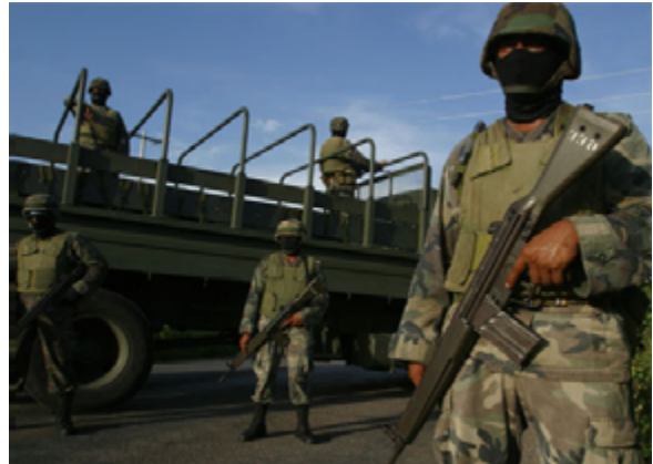
Mexican Army

Mexico's army is a light infantry force. The focus on internal security has compromised conventional fighting capacity. Nearly 30,000 troops are deployed to assist with conventional law enforcement activities, mostly against drug cartels. In addition to the three infantry brigades, two armored brigades, and one paratroop brigade, there is also a Disaster Case Reaction Force capable of deploying within 72 hours to assist with natural disasters. 116 The country is divided into 12 military regions further subdivided in 46 military zones. Each of these zones has at least one cavalry regiment and infantry battalion. 117 Morale among the soldiers in Mexico's army is low but has been increasing among non-commissioned officer ranks in recent years. To increase morale, the government enacted a number of measures including pay raises, expanded healthcare, and better training. Professionalism within the army is among the highest in Latin America. 118