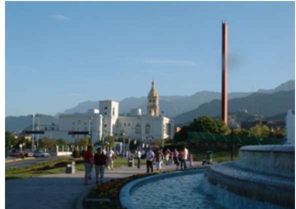
Monterrey cityscape

Monterrey is the capital of the state of Nuevo León. 87 Most of the state's population lives in the Monterrey metropolitan area. Located in the high desert foothills of the Sierra Madre Oriental, the city is both one of the warmest and one of the coldest in Mexico. 88 Flash floods, particularly during hurricane season, kill pedestrians and vehicle drivers every year. 89 For most of the 1500s, the area's Chichimeca peoples resisted colonization, but in 1596 the Spanish finally established a permanent settlement at the present site. In 1846, the Battle of Monterrey was the first major conflict of the Mexican-American War. Monterrey developed as a trade nexus between San Antonio, Tampico, and Saltillo and became a city of international commerce, and later heavy industry. Major products are steel, cement, glass, and auto parts. 90, 91 The Cuauhtémoc Moctezuma brewery also houses Mexico's Baseball Hall of Fame. 92, 93