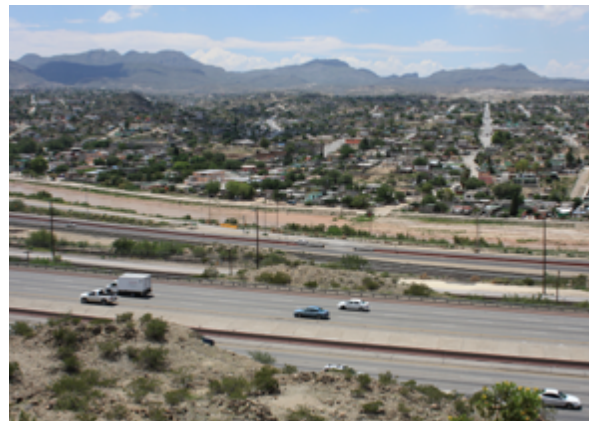
El Paso and Juarez

The stereotypical sleepy Mexican border town has been largely replaced by the transnational urban sprawl, a populated area where economies, infrastructure, and environment are shared across a political boundary. Their location on the United States border fueled the growth of these cities in the 20th century, as did international economic agreements. 111 These agreements include the Bracero program (which invited Mexican farmhands to work temporarily in the U.S.) from the 1940s, the Border Industrialization program (which encouraged maquiladoras along the border) from the 1960s, and the North American Free Trade Agreement (NAFTA) since 1994. Unfortunately, their location on the U.S. border also makes these cities targets for international criminal activity. 112 Juárez suffered an average of nearly nine murders a day in 2010, but the city has become safer in recent years with the end of the violence between the Sinaloa and Juárez cartels. 113 Crime rates and violence remain high, however. 114