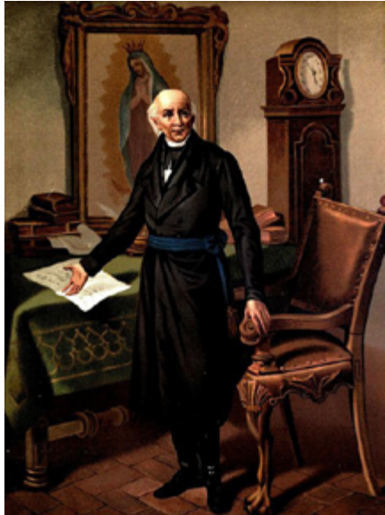
Don Miguel Hidalgo

Father Miguel Hidalgo y Costilla was a freethinking and free-living criollo in the town of Dolores, Guanajuato. Fearing arrest for his discussions of independence in literary and social clubs, he gathered his Indian parishioners on September 16, 1810 and exhorted them to action. 91 Shouts of “Long live the Virgin of Guadalupe!” and “Death to bad government!” and “Down with the gachupines! ” called for independence from Spain and unleashed mass violence against elites, as in the massacre at the Alhóndiga in Guanajuato. 92, 93 Loyalists captured Hidalgo; the Church excommunicated him. A firing squad executed him in 1811. The heads of Hidalgo and three compatriots were hung in cages at the four corners of the Alhóndiga where they remained on display for 10 years. 94, 95 The insurgents, now led by