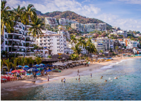
Puerto Vallarta

In 1518, the Spanish first landed at Veracruz, on the Gulf of Mexico near the Totonac Indian city of Cempoala. A year later, Spaniard Hernán Cortes named the port town for the Catholic holy day of Good Friday when he first landed (in Spanish Good Friday is Veracruz, the day of the “true cross”). Veracruz became a city of plantations and slaves, as well as the port where gold and silver mined throughout the region was loaded onto ships bound for Spain. Today, Veracruz has more than half