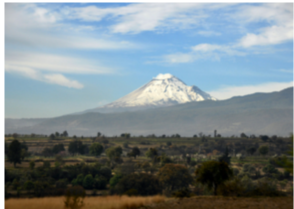
Popocatepetl Volcano

The rugged landscape of Mexico is the result of tens of millions of years of geologic activity due to its location over the junction of several tectonic plates. 15, 16 High deserts and scrublands cover the north, including much of Baja California, which is Mexico's northwest peninsula that extends from Tijuana 1,300 km (800 mi) south into the Pacific Ocean. This peninsula creates the Gulf of California on its east coast. Two mainland mountain ranges, the Sierra Madre Oriental and the Sierra Madre Occidental, run north to south along the east and west coasts. With an average altitude of 900-2,400 m (3,000-7,900 ft), the ranges separate the high central plateau from grassy lowlands on the Gulf of Mexico and forested lowlands on the Pacific Ocean. The Sierra Madre Occidental contains the Copper Canyon complex where Barrancas , several times the size of Arizona's Grand Canyon, include the deepest canyon in the Western Hemisphere. 17, 18 At the south end of the central plateau, the Trans-Mexican Volcanic Belt extends east and west across the country. 19, 20 Among the volcanoes are Pico de Orizaba in the east, Mexico's highest point (5,611 m/18,406 ft); Popocatépetl (5,426 m/17,802 ft), which threatens Mexico City; and Colima (3,850 m/12,631 ft) in the west, Mexico's most active volcano. 21, 22, 23