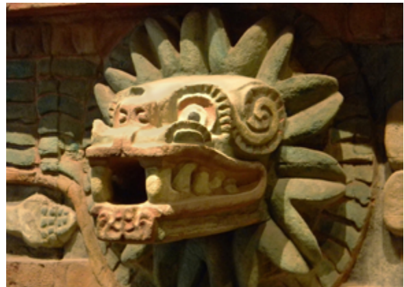
Aztec Quetzalcoatl head Caption / Copyright

From 900, the Toltecs controlled Teotihuacan and sites to the north from their capital Tula. The Toltecs continued to worship Quetzalcoatl, but paired him with the war god Tezcatlipoca. 42 When Tula fell in the 12th century, several independent city-states arose in central Mexico and interacted with Mayans in Yucatán. 43, 44