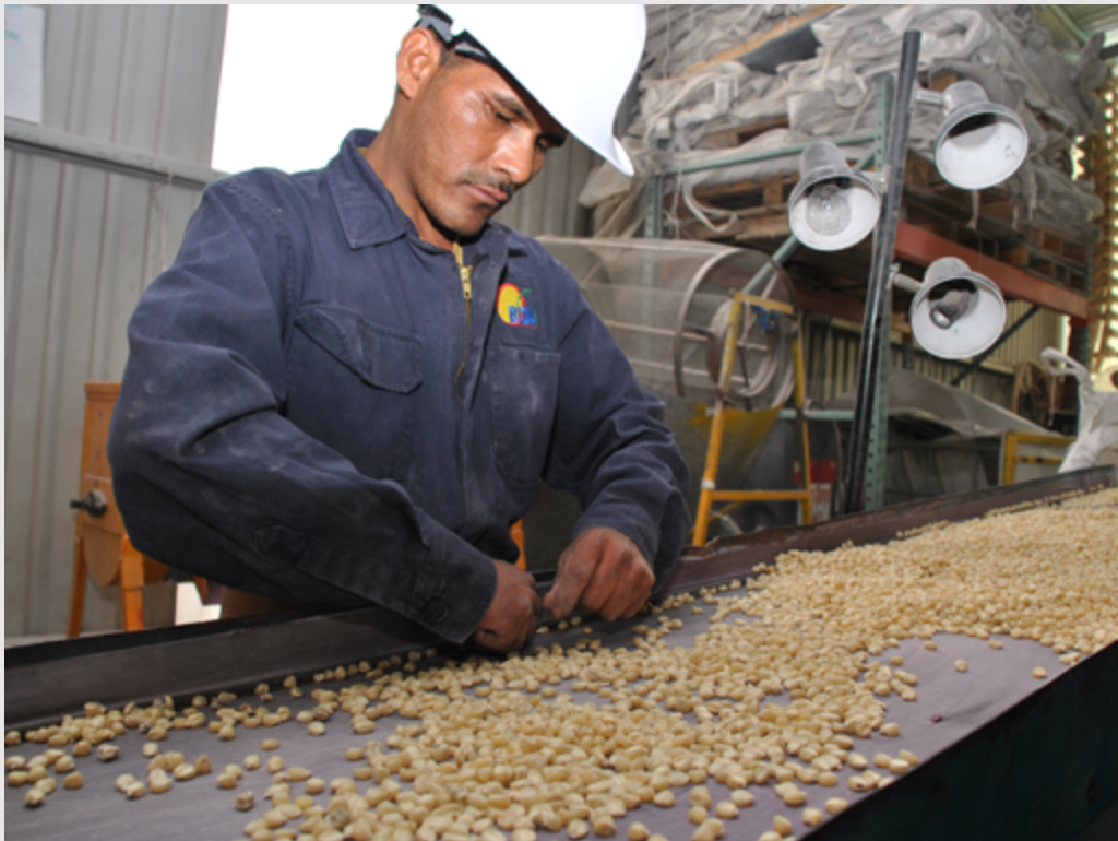
Maize processing