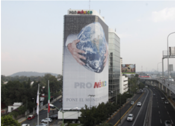
International development ProMéxico

Mexico has long struggled to balance economic nationalism with private, especially foreign, ownership and investment. In the 1980s, the government ended support for land reform and agricultural subsidies, labor unions, and import substitution industrialization. 159 Privatization and government regulation reform since the 1990s have improved business operations and opportunities, but in some shifts of public-to-private ownership from the state to Mexican