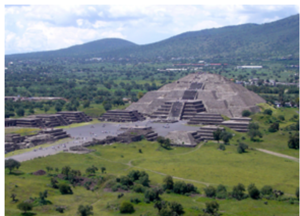
Teotihuacán pyramid of the moon

The first Mexicans were descendants of nomadic groups who crossed the Bering Land Bridge from Asia at the end of the last Ice Age. Although the exact dates of their migration remain in question, some believe they arrived as early as 40,000 years ago. Experts generally agree that these people camped in central Mexico and butchered mammoths as recently as 9000 B.C.E. 17 As the post-Ice Age environment changed, humans slowly began to domesticate wild