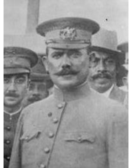
Álvaro Obregón

The Revolution cost Mexico close to a million lives (more than 2 million factoring in those who fled north). 161, 162 It ended officially with the election of Álvaro Obregón to a one-term presidency in 1920, but violence continued for the next decade. In 1923, Obregón ordered Pancho Villa's ambush and killing. A few years later, Obregón himself was killed shortly after engineering constitutional changes to permit his reelection to a presidential term lengthened to six years. Obregón's killer was part of the Cristero Rebellion of 1926-1929, an uprising of conservative, church-loving peasants against the liberal, anti-clerical government policies of the preceding decades. 163, 164