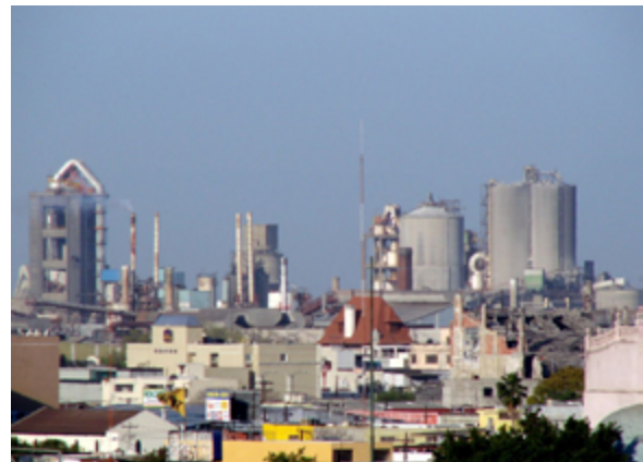
CEMEX plant Monterrey, Mexico Flickr / Hector Martinez f

Mexican workers built the oldest and largest pyramids in the Western Hemisphere, and today construction is part of the industrial economic sector that employs almost one-quarter of the workforce and accounts for roughly 32-34% of the GDP. 45, 46, 47 Mining, manufacturing, and energy production are also included in this sector. Mining was the most important colonial industry—Mexico produced as much silver as the rest of the world combined in the 18th century, and returned to the position of the world's number one silver producer in 2010, where it remained in 2015. 48, 49, 50, 51 Other minerals are iron, sulfur, fluorite, zinc, copper, manganese, mercury, bismuth, antimony, cadmium, phosphates, gold and uranium. 52, 53, 54