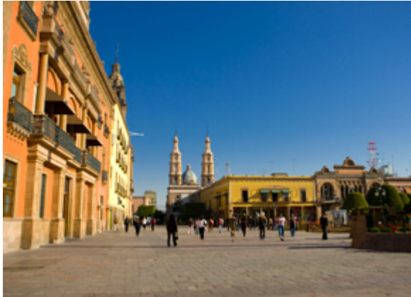
Plaza Principal, León

León sits in the Sierra Madre Occidental on the west side of the state of Guanajuato. Since 1910, León has been the largest city in the state famous for the Grito del Dolores that is celebrated as Mexico's Independence Day. 102 In a place first occupied by the Chupícuaro people thousands of years ago, the Spanish founded León in 1576 as a defensive settlement. 103 The city experienced violent struggle during the war for independence and the later revolution, and in 1946 members of