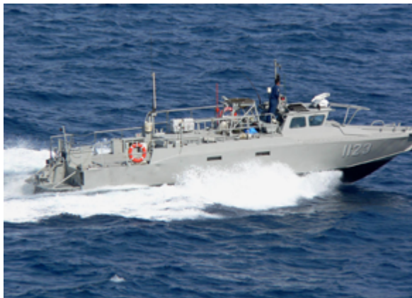
Mexican Navy

Mexico's navy, which includes a force of roughly 24,000 marines, is an efficient coastal patrol force with approximately 143 naval craft including 6 frigates, 2 destroyers, 21 coastal defense craft, 2 missile-armed corvettes, and 11 mine warfare vessels. 119, 120 The navy is in the process of updating and expanding its fleet including the recent purchase of three new patrol vessels. 121, 122 The navy also has three Special Forces Units with a high state of readiness. One force is present on the Pacific coast, one on the Gulf coast and the third in Mexico City. 123 The navy is concerned mainly with fighting organized crime within the country including interdicting illegal drug shipments and intelligence gathering. Conventional forces and capabilities are minimal. 124