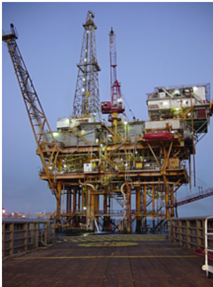
PEMEX oil platform off coast

“Black Gold” replaced precious metals as Mexico’s most valuable natural resource following the expansion of the railroads during the rule of Porfirio Díaz. Foreign oil companies became a primary source of government tax revenue during the Revolution. Industry growth slowed after the 1917 Constitution claimed national ownership of all subsurface resources, and reversed for a time after nationalization created PEMEX in 1938. 62, 63 (Retaliatory boycotts by expropriated oil companies led Mexico to trade oil with Germany and Italy just before World War II.) PEMEX became a symbol of economic nationalism, putting short-term domestic needs ahead of long-term trade potential, and benefitting corrupt management as much as the public good.