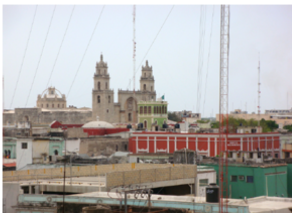
Mérida, Mexico

Mérida, the state capital of Yucatán, lies just above sea level within the Chicxulub crater, 35 km (22 mi) inland from the Gulf of Mexico on the northwest Yucatán Peninsula. The Mayan pyramids of T'ho are incorporated into many of the Spanish colonial buildings that fill the historic city center, and Mayan languages have influenced local Spanish dialects. Through the centuries, peninsula Mayans often ignored or rebelled against Spanish and later Mexican claims of empire.