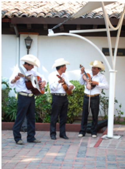
Huasteca trio at Watercolor Museum

Mexican popular culture often makes fun of the government and the upper class, and resists those authorities who try to censor or absorb it. Corridos are a musical example—songs that comment on events from the point of view of local, often “marginal” communities. 183, 184 Corridos of the Revolution applauded the outlaw Pancho Villa and the rebel Emiliano Zapata. Recent narcocorridos cast drug lords as outlaw heroes, or criticize the “narcoculture” that fuels international drug trafficking. 185, 186, 187 In print, populist engraver Jose Guadalupe Posada produced satirical calaveras (skeletons) of the Mexican society of his time that still have artistic and political appeal. 188, 189, 190