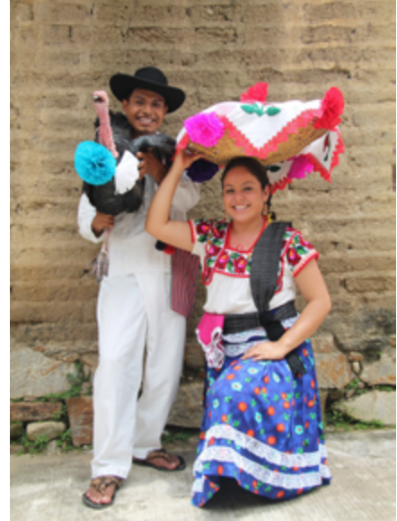
Languages of Mexico

Mexico is home to speakers of some 300 languages but only 68 are officially recognized by the government and enjoy coequal national status with Spanish. 32, 33, 34, 35 About a million speakers of indigenous languages are monolingual, especially among the Mayans in Yucatán and Chiapas. 36 Spanish is the first language of 93% of the population, and the shared national language that links Mexico to one of the largest language communities in the world. 37, 38 A Mexican dialect of Spanish probably began to develop in the 18th century. Among other distinctions, Mexican Spanish is more open to borrowings (from Nahuatl to English) than other international forms. Regional dialects also exist within Mexico. Attitudes toward Spanish have a residue of colonial identity: 84% of Mexicans consider Spanish an important marker of Mexican national identity, but only 29% think Mexico City is home to the ideal Spanish, compared to 39% who look to Madrid. 39 Mexican Spanish is likely to dominate the future through mass media—Mexican telenovelas (television soap operas) transmit colloquial speech throughout the world. 40