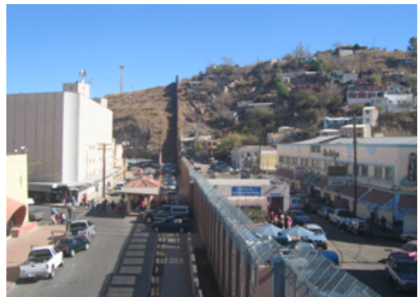
USA/Mexico border Nogales, AZ

For the last 30-40 years, Mexico's relations with the United States have centered on economic ties. Since the implementation of the North American Free Trade Agreement (NAFTA) in 1994, Mexico has become the United States' second-largest trading partner. Many U.S. factories have relocated to Mexico creating dissension between the two countries. Ironically, the increased trade that resulted from NAFTA has generated commercial disputes. 19