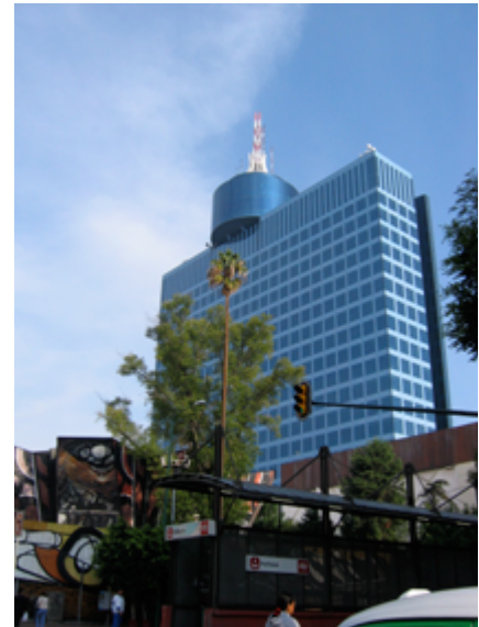
WTC tower Mexico City

Trade has connected Mexico's many indigenous groups to each other for 4,000 years and to the world economic system since the 16th century. 77 Barter-based markets and street vendors serve local communities and attract tourists as part of the large informal economy that operates beyond government control. 78 Today, Mexico is the 15-largest export economy in the world but low oil prices have helped create a trade deficit. 79, 80 About 80% of Mexico's export trade is with the United States. Nearly half of its imports come from the United States followed by China (17%) and Japan (4%). 81