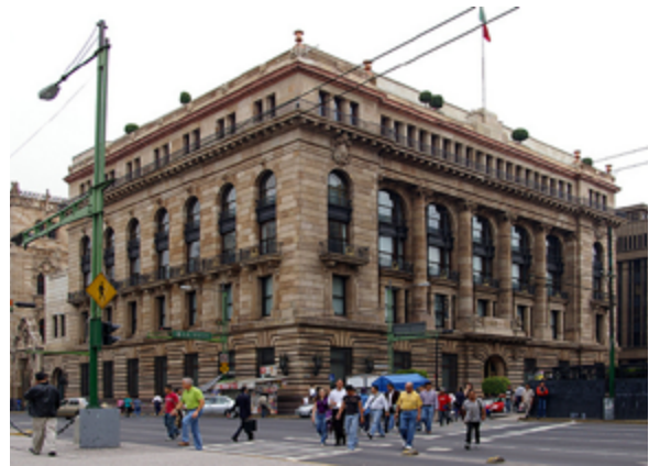
Central Bank of Mexico

Banking has a checkered history in Mexico. Formal financial institutions were rare through the 19th century. (A notable exception is the National Pawnshop, Monte de Piedad , established in 1775, which continues to operate as a non-profit loan institution.) 117 Private banking began largely as a foreign enterprise—the Bank of London and Mexico, Mexico’s oldest existing private bank, was established in 1864. In 1884, the government tried to control banking by creating a national bank (Banamex), nearly liquidating the Bank of London and Mexico in the process. 118,