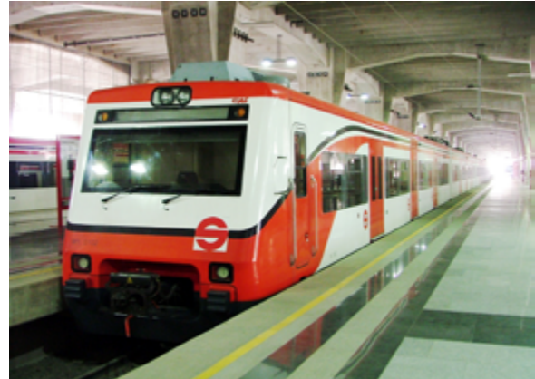
Commuter train Mexico City

Aiming for future free trade agreements, Mexico's ports move an average 3 million 20-foot container equivalent units (TEU) annually to destinations including "interesting opportunity areas" such as India, Australia, Russia, Turkey, and South Africa. 103 Domestic airlines serve mostly middle- and upper-class Mexicans; Mexico-based and international airlines fly to most major cities in the United States, Canada, Europe, Japan, and Latin America. 104 Much of Mexico's transportation industry was nationalized for most of the 20th century, and the results of recent privatizations have been mixed. 105, 106