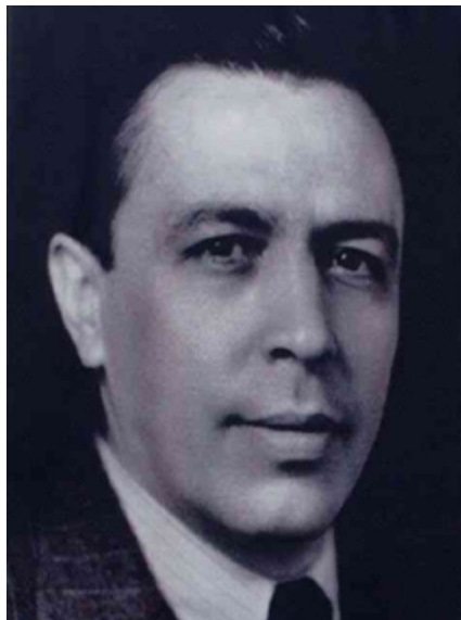
Manuel Gómez Morín, founder of PAN

Mexico participated in World War II with an air squadron in the Philippines and 15,000 soldiers in the armed forces of the United States. 184 Industries grew to supply war materiel, and braceros (agricultural guest workers) traveled north to keep up agricultural production on the home front. To continue post-war economic development, PRI government policies promoted social modernization (to assimilate indigenous peoples) and domestic industrialization (to replace imports with locally produced items). 185, 186, 187 In the 1960s, economic nationalization (utilities, auto industry) and internationalization ( maquiladoras ) disproportionately benefitted a wealthy few. 188 Such policies and actions often set the government against peasant farmers and labor unions, and opposition political parties appeared, starting with the Partido Acción Nacional (PAN) in 1939.