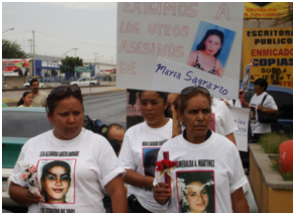
Protesters demanding justice

Domestic violence against is rampant in Mexico which ranks in the top 20 nations for worst violence against women. 144, 145, 146 In 2011, Mexico's national household survey reported rates of domestic (partner) violence against women at 46%, but more recent estimates run as high as 67%. 147, 148 Violence against women outside the home is equally troubling, particularly that attributed to drug cartels. 149, 150, 151 In 2015, the federal government found violence against women to be so egregious that it issued a "gender alert" as a response to high numbers of murders and disappearance among Mexican women. 152 Emergency measures have been implemented to protect women and guard against the violence in Mexico. The area of Edomex, on the northern fringe of the city, has been declared the most dangerous place to be a woman in all of Mexico. 153, 154