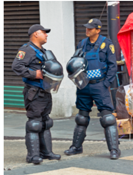
Mexico City riot police

Mexican police forces are estimated to be between 410,000 and 544,000 strong. Each of Mexico's approximately 2,457 municipalities has its own force. The National Public Security System (SNSP), established in 1995, aids in the coordination and distribution of public security affairs between municipalities and the federal government. 76 The municipal police forces constitute the largest percentage of police in the nation. 77 The quality of the police forces across Mexico's 31 states is highly variable. In some states, corruption and incompetence among the police force is rife. In other states, forces compare favorably with those in developed Western nations. 78, 79 The policía preventiva maintain public order, while the policía judicial investigate crime. 80, 81 The Federal Police, which replaced the Federal Preventative Police (PFP) in 2009, are responsible for handling federal crimes, including drug trafficking. 82, 83 In 2013, President Enrique Peña Nieto announced plans to reform the security forces. His plan replaced the federal police and put them under the control of the Ministry of the Interior. He also created a national gendarmerie which began operation in 2014 with 5,000 officers. 84, 85, 86, 87