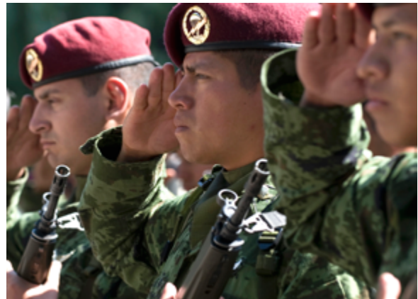
Military Armed Forces of Mexico

The Mexican Military has between 270,000 and 276,000 active members and supplemented with an estimated 76,500 to 93,000 reserve forces. 101, 102 The largest branch is the Army with approximately 203,000 active personnel, followed by the Navy (36,200), the Marines (24,100) and Air Force (12,700). 103 Mexico's military has constitutional authority to defend the integrity of Mexico's territory against external aggression; defend against internal disruption; and defend the civilian population during natural disasters or other emergencies. 104, 105 Recently, defense against internal aggression has moved to the forefront, as witnessed by operations against guerillas in Chiapas and Guerrero states since the 1990s and against transnational crime organizations (TCOs) in 10 Mexican states since 2006. 106, 107 As a result, conventional fighting capabilities have suffered. Today's military is dependent on obsolete equipment and armor. There is no indication that this situation will change radically in the near future. 108, 109, 110