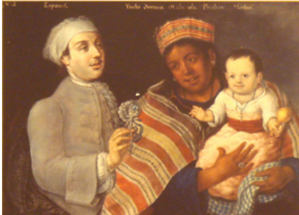
Mestizo 1770

Ancestry and class stratified colonial society. At the top were Spanish-born peninsulares (later called gachupines , a pejorative term). Ranked slightly lower were the criollos , individuals of Spanish heritage who were born in Mexico. Beneath these elite españoles were mestizos , individuals of mixed Spanish-indigenous parentage. (La Malinche gave birth to the iconic mestizo , Martín Cortés.) 77 A century after conquest, the number of mestizos in Mexico (130,000) roughly equaled that of