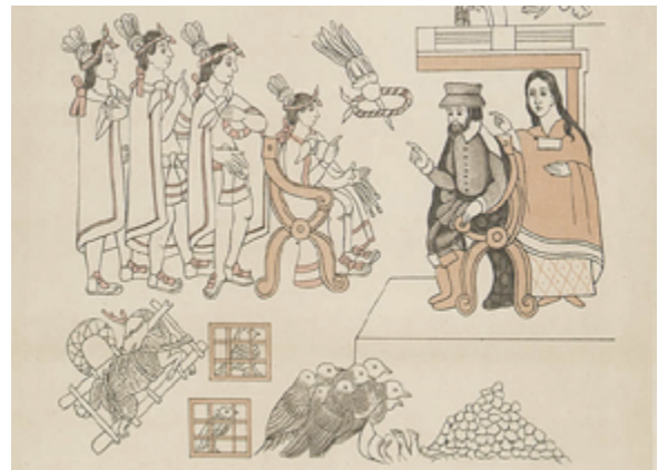
Moctezuma meets Cortez

In 1519, Hernán Cortés arrived at Veracruz—a veteran of Spanish expeditions to the Caribbean and the Yucatán. Though he lacked royal authority to explore and trade, he was prepared for conquest with cannon, horses, dogs, and soldiers. 54, 55, 56 As he traveled inland, he met a local woman whom the Spanish came to call Doña Marina (now also known as La Malinche), a former slave who spoke Nahuatl (the lingua franca of the Aztec Empire) and Spanish. When he reached Tlaxcala, he first fought, then allied with the Tlaxcalans against the Aztecs. 57, 58 (The Tlaxcalans and La Malinche are considered traitors in many Mexican histories for aiding the Spanish conquest of the Aztec Empire.) 59 As Cortés approached Tenochtitlan, lookouts described him as an incarnation or emissary of the god Quetzalcoatl who had been banished to the east by the god Tezcatlipoca in the time of the Toltecs. 60