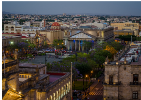
Guadalajara at dusk

South of the Tropic of Cancer and 1,524 m (5,000 ft) high, Guadalajara is a region of “eternal spring.” 75 Named for the hometown of conquistador Nuño de Guzmán, the Spanish established Guadalajara at its present site in 1542, after a 10-year struggle with local peoples. 76 It is now the capital of Jalisco state and the cultural center of western Mexico, closely associated with mariachi music. 77 Business products range from traditional huaraches (leather sandals) to information technology electronics and beer. Host to the 2011 Pan American Games and the annual International Book Fair, Guadalajara also claims the largest colony of United States expatriates in Mexico. 78, 79, 80 The Hospicio Cabañas is a UNESCO World Heritage Site that preserves a 19th century Roman Catholic hospital-orphanage-poorhouse. The site is now a state-sponsored cultural institute. 81