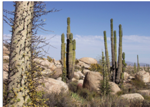
Baja California Mexico desert

Altitude balances latitude in much of Mexico. Elevation defines three climatic temperature zones: tierra caliente ("hot land") below 600 m (2,000 ft), where average summer highs may approach 40°C (104°F); tierra templada ("temperate land") from 600 m (2,000 ft) to 1,800 m (5,900 ft), where average temperatures range between 10°C (50°F) and 22°C (72°F); and tierra fria ("cold land") above 1,800 m (5,900 ft), where average winter lows drop below freezing. 30, 31