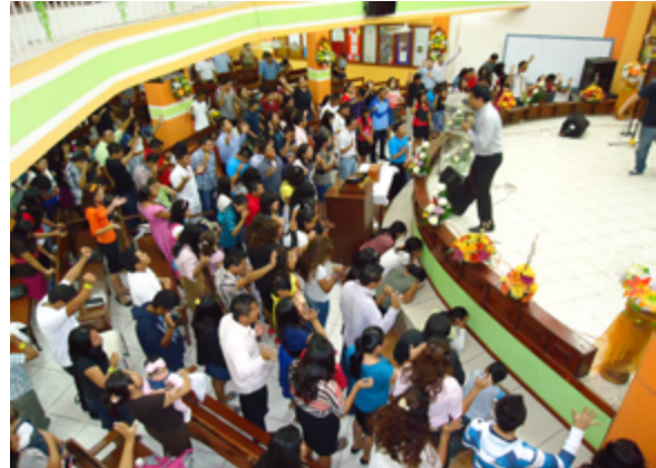
Pentecostales Cancu, Mexico

Today, roughly 8% of the nation is Protestant. 66 Although traditional Protestant groups such as the Lutherans, Methodists, and Presbyterians had been in Mexico since the 1800s, it was not until the years between 1970 and 1990 that Protestant church growth exploded. Much of the growth was due to active recruitment by non-traditional groups such as the Assemblies of God, Seventh Day Adventists, Mormons, and Jehovah's Witnesses. 67 Today, Mexico is second only to the United States in the number of Mormons which is estimated to be roughly 1.4 million. 68