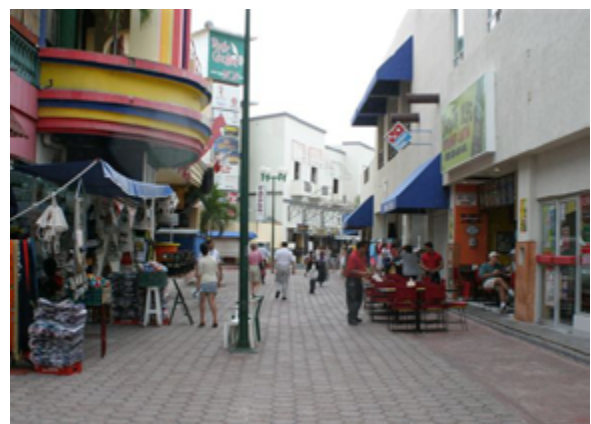
Mexican outdoor mall

Mexico's "upper middle developed country" ranking is based on a per capita income of USD 9,870, only one-fifth of the United States average of USD 55,200. 143 The rankings hide high levels of income inequality and poverty. Mexico has the highest level of inequality among the 34 OECD nations. The richest 1% of the population controls 43% of the national wealth. The richest 10% of the Mexican population earns more than 30 times what the poorest 10% earn. The poorest 20% of the population has an average worth of USD 80. Roughly half of the nation lives below the poverty line. 144, 145 Average daily wages in December were just MXN 292 (roughly USD 16). 146, 147 According to the government's well-being standards, USD 175