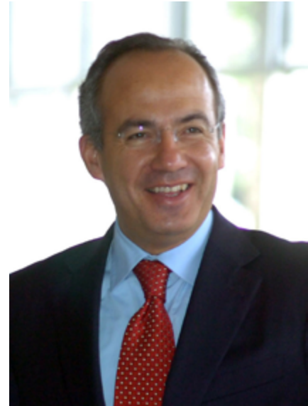
President Felipe Calderón

He launched a series of security operations against the cartels, which escalated the violence and led to the deaths of 47,000 people. 202, 203, 204 By 2012, the drug cartels were firmly entrenched and Mexico's economy was worsening. Mexicans were tired of unfilled PAN promises and elected the former governor of the state of Mexico, PRI candidate Enrique Peña Nieto as their new president. 205, 206