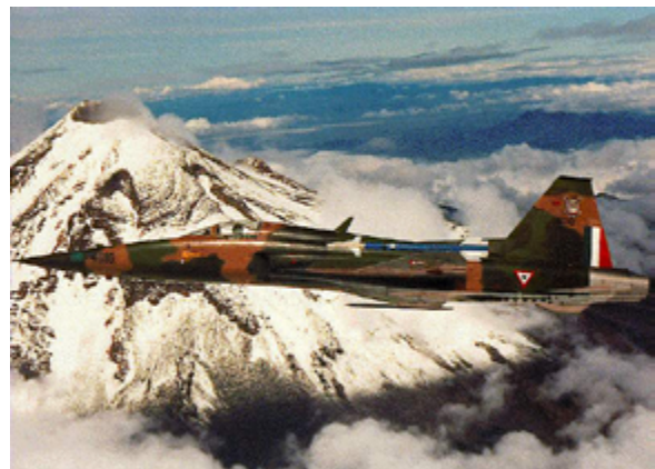
Mexican Air Force F-5 Tiger

Mexico's Air Force is equipped with a total of roughly 400 aircraft including 6 fighter/interceptor craft, 42 fixed-wing attack craft, 189 helicopters, and 239 transport aircraft. 128 FAM has some, but incomplete, autonomy from the army. The force is efficient and well trained with a mission largely confined to anti-narcotics operations and natural disaster response. 129 The force is largely male but in 2008, the first female aviator graduated from aviator training in 2011. The FAM has some trouble recruiting personnel. Morale within FAM is typically low and desertions have impacted force readiness and operations. The Air Force increased its pay and benefits in an effort to counter this trend. The efforts have been somewhat successful as desertions since 2010 have declined somewhat. 130