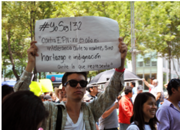
Yo Soy 123 protests in Mexico City

Social unrest is likely to increase in the near term. The government's increasing unpopularity, combined with economic problems and growing inequality will fuel many such protests. Historically, protests have been confined to blockades, disrupting traffic, and minor vandalism but that could change. Anti-mining movements, unions, and landowners are growing more powerful and have staged protests against some natural resource companies. These can cause expensive disruptions to the