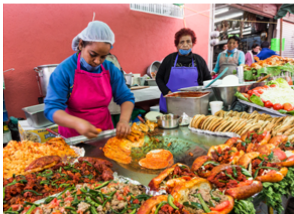
Mexican Street Food

Mexico's cuisine is a fusion of many groups and cooking techniques. 73 Corn, the crop that settled and civilized ancient Mexico, is prepared in many ways: roasted on the cob and smeared with mayonnaise and paprika; ground into masa for tortillas, tostadas, tamales, and gorditas; lime-soaked into nixtamal (hominy) and stirred into pozole soup or atole drink; and popped. 74, 75 Wheat and rice, colonial additions were used to make flour tortillas, the cinnamon-spiced rice drink horchata , European-style breads ( bolillos ), bakery sweets ( pastel , pan dulce ), and arroz con leche (similar to rice pudding). 76, 77, 78, 79 Beans, squash, chilies, tomatoes, and nopal round out the pre-conquest contributions along with wild game and seafood.