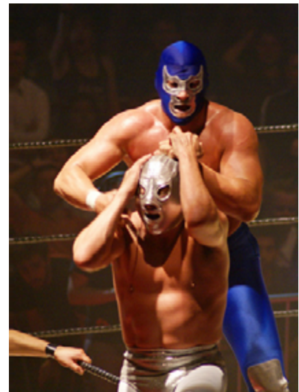
Lucha libre

Lucha libre (“free fight”), the Mexican version of professional wrestling, is less brutal than the U.S. version, but more acrobatic and just as eccentric. Cultural observers see the Mexican political system reflected in this spectator sport where the competitors are masked, the rules are inconsistently enforced, the referees can be bribed, the outcome is fixed, and participants risk injury or death when the system breaks down. 202, 203 Lucha libre gave rise to the Mexican “superhero” El Santo , who played the role of the “little guy” in the wrestling arena, fighting against the cheating los rudos (“bad guys”), and went on to star in magazines and movies. 204 Until recently lucha libre avoided referencing drug violence in its performances. 205