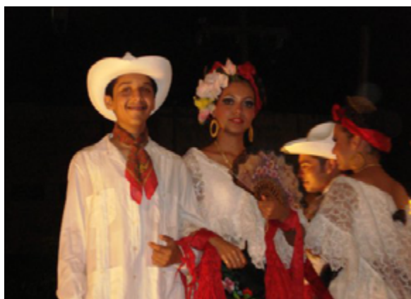
Typical Jarocho attire Veracruz, Mexico

Although Western-style fashions are commonly worn throughout Mexico, it is not uncommon to see traditional indigenous clothing often representing a fusion of indigenous and European styles. 92 Each group or region developed its own style of clothing which persists today. Traditional clothing was constructed with an eye to protecting people from the sun and heat. Clothing was generally made of natural fibers such as cotton, sisal, palm, wool, and silk. The clothing was generally brightly colored with traditional dyes of yellow, blue, red, purple, orange, and black. 93, 94, 95