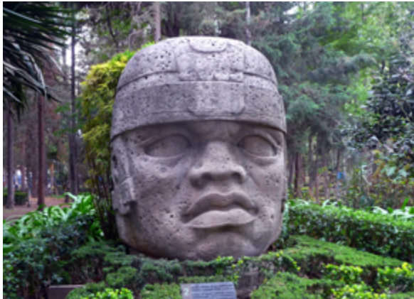
Olmec Colossal Head

The Olmecs developed the earliest of Mexico’s ancient civilizations along the Gulf of Mexico, from about 1500 B.C.E. Later groups named these “People of the Rubber Country” after the locally harvested latex that was used to produce balls used in a ritual game played throughout Mesoamerica. 20 Other aspects of Mesoamerican culture traceable to the Olmecs include monumental stone structures, human sacrifice, and hieroglyphic writing. 21, 22 After the unexplained collapse of the Olmecs,