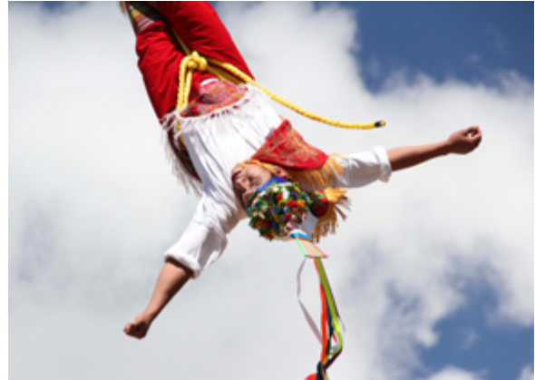
Voladores in Papantla, Veracruz, Mexico

Mexico's ancient cultures made art to last for millennia. Massive stonework, carved and painted with bright colors, recorded their myths and histories. 155 The national government has preserved pre-Columbian art in world-famous museums, and duplicated it in modern constructions such as the National Autonomous University of Mexico (UNAM) in Mexico City. 156, 157 Traditions of pottery, featherwork, and textile production continue as do unique ritual performances such as the voladores of Veracruz. 158 In a fertility ritual, these “flying men” fling themselves from the top of a tall pole. Tied to the pole with long ropes, they circle the pole, spinning through the air as if flying. 159, 160 Ancient art influences modern artists as well. The Ballet Folklórico de México performs re-imagined Aztec dances, and the recent film Eréndira Ikikunari tells the Purepecha legend of a young princess who resisted the Spanish conquistadors. Both productions draw inspiration from 16th century illustrated codices. 161