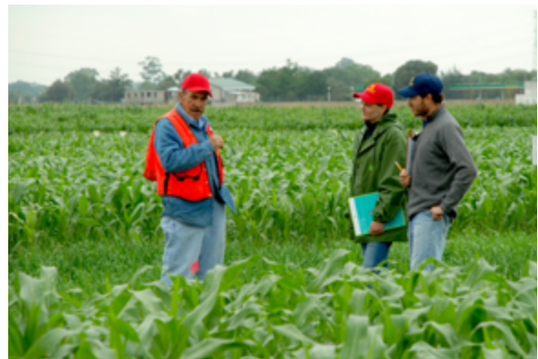
Vaquero Jalisco, Mexico

Mexico's primary economic sector is agriculture, which includes farming, ranching, forestry, fishing, and hunting. About 13% of the workforce is in agriculture and contributes roughly 4% of the GDP. 16, 17 Farming has been a central economic activity in Mexico since the domestication of corn 7,000 years ago. Today, the majority of farmers are subsistence growers, cultivating less than 5 hectares (12 acres) with staple crops of corn and beans. 18 About one-tenth of Mexico is farmland, but only about 20% is irrigated. 19, 20, 21 Raised field cultivation, practiced continuously in Xochimilco's chinampas ("floating gardens") outside Mexico City since pre-Columbian times, has been reintroduced as a sustainable agricultural method for modern peoples. 22, 23 Much small-scale farming remains outside the formal economy, and apart from international investments to industrialize agriculture. Once self-sufficient in staple food production, Mexico now imports grains. 24, 25, 26 Corn, beans, wheat, rice, barley, and potatoes are today's staple crops. 27 Tomatoes, avocados, sugarcane, coffee, and cotton are major cash crops. 28, 29 In addition, marijuana and opium poppies are cultivated, particularly in the states of Chihuahua, Guerrero, Jalisco, Durango, Sinaloa, and Oaxaca. 30 Mexico sends most of its agricultural exports to the United States, and the North American Free Trade Agreement (NAFTA) has significantly increased the export of fruit and vegetables. 31, 32