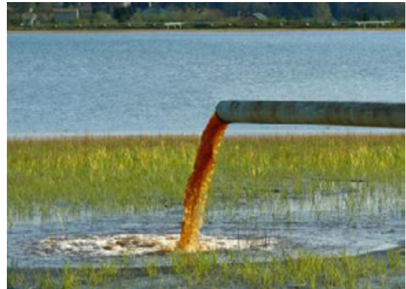
Untreated sewage flowing into lake Wikispaces / TES Teach

Mexico's 20th century population growth and agricultural "greening" of arid lands is no longer sustainable. 156, 157, 158 Water shortages are creating conflicts internally—for example, between the State of Mexico and the Federal District over depleted aquifers. An international conflict exists between Mexico and the United States over the Colorado River. Disruptive protest—blocking roads, occupying public spaces, etc.—has a long tradition in Mexico, and water issues have motivated both local and international actions in recent years. 159, 160