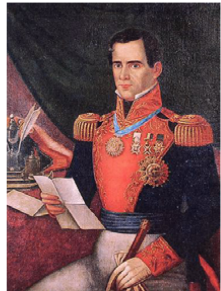
Antonio López de Santa Anna

In the first years of independence, Antonio López de Santa Anna emerged as Mexico's quintessential caudillo . 113, 114 A criollo from Veracruz, he began his career as a Spanish loyalist officer. He joined Iturbide in 1821, but turned on the Emperor by proclaiming Mexico a republic in 1823. A nationalist who aligned with whatever political group was useful at the time, he gave the young nation thrilling victories and disastrous defeats. In 1829, he repulsed Spain's attempt to reconquer Mexico (after Mexico had expelled most Spaniards) and soon became president. He would lose and regain the presidency 10 times in the next 30 years. 115, 116 In 1836, he enforced Mexico's sovereignty over rebels in the territory of Tejas . He took no prisoners at the Alamo and Goliad, but was defeated and captured at San Jacinto, where he agreed to acknowledge the independent Republic of Texas in exchange for his freedom. He lost his leg fighting against the French at Veracruz two years later; the severed leg was buried with full honors in Mexico City in 1842. However, his leg was dug up and dragged through the streets in 1844 because he imposed the draft and taxes after learning of United States plans to annex Texas. 117 He soon went into exile in Cuba, but returned to Mexico two years before his death. 118, 119