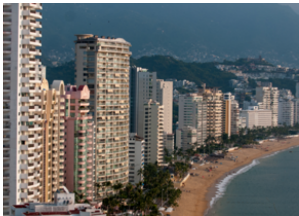
Acapulco Bay

The leisure class's long history has produced internal tourist destinations from Cuernavaca to Acapulco. The tourist industry in 2014 directly accounted for 6.8% of GDP and its total contribution to 2014 GDP was nearly 15%. 107 Roughly 7% of the labor force is directly employed in tourism but, if indirect employment is counted, 15.7% of Mexican jobs relate to the tourist industry. 108 The vast majority of tourism revenues come from leisure travel (90%), most of which is domestic (89%). 109