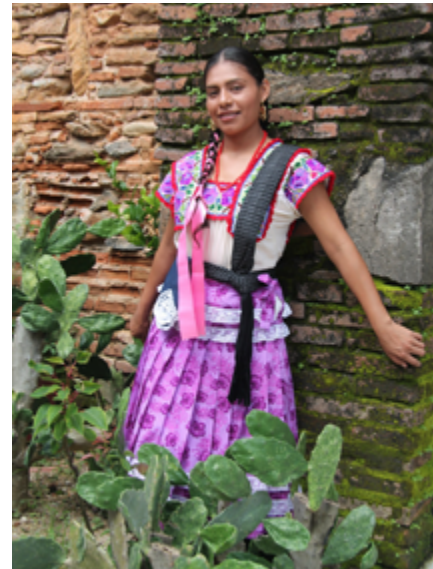
Oaxaca Indigenous_clothing

Women's clothing, on the other hand, has changed over the years and reveals a great deal of variety in design and color. 107 Traditional female clothing generally consists of a huipil or sleeveless tunic made from cotton or wool worn over a skirt. 108, 109, 110 Skirt designs reflected wide regional variations and tended to be either knee- or ankle-length. Skirts were made from cotton, wool, or silk and often contained some lace elements. They were frequently decorated with beads and elaborate embroidered designs. 111, 112 The quechquémtil is the female version of the poncho. Resembling a cape, the garment was usually made from bright colored cloth and embroidered. 113 The rebozo , a long scarf or shawl-like garment, completed the outfit. The color and patterns of the garment varied by region and group. 114, 115