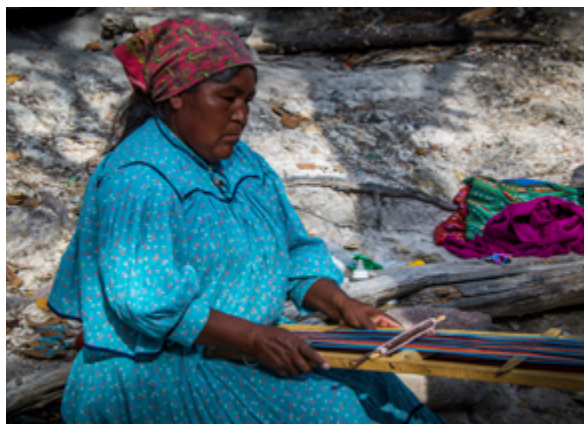
Tarahumara woman weaving at Cusarare Falls

There are about 60 surviving, government-recognized indigenous groups in Mexico. 10, 11 Collectively, they own or control thousands of hectares of land, mostly in forests and jungles, which includes more than half of Mexico’s recognized biodiversity-supporting lands. 12 The highest population concentrations of indigenous peoples are in the south and east, with pockets to the west in the Huichol country of Nayarit and Durango, and to the north in the Tarahumara region