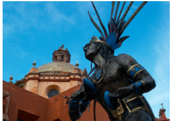
Chichimeca warrior

New Spain claimed territory from Colorado to Costa Rica, but never fully controlled large parts of Mexico. 83 Many indigenous groups resisted colonization, including Puebloans in the northern territories, Chichimecas in north and central Mexico, Zapotecs and Mixtecs in Oaxaca, and Mayans in Chiapas and Yucatán. 84, 85, 86 Resistance periodically flared into rebellion—from the Mixton War of 1540-1541 in New Galicia (present-day Jalisco, Nayarit, and Zacatecas) to the Tzeltal Revolt of 1712 in Chiapas. 87, 88