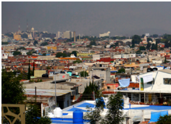
Overlooking Puebla

The Spanish colonial city of Puebla, now capital of the state of Puebla, rests a few miles east of the ancient Olmec city of Cholula. Like Mexico City to its northwest, Puebla is in a high valley (2,200 m/7,200 ft) surrounded by volcanic mountains. Located between Mexico City and Veracruz, Puebla developed as a travel stop and later as a manufacturing center. 97 Today it is famous for mole poblano (a chocolate-tinged chili sauce), Talavera tile and pottery, and production of Volkswagen Beetles. 98, 99