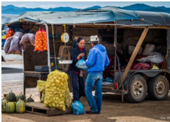
Chihuahua Mexico

Mexico's short-term security outlook is unsettled but not at serious risk of government failure. To secure its stability the current government needs to implement effective legislation aimed at improving human development, economic growth and employment opportunities, and improve the rule of law in the nation. 161 The ability of the current government to continue depends on its ability to maintain key alliances with smaller political parties. President Peña Nieto will have to continue to rely on a coalition government to pass legislation and address constitutional changes. This may become more difficult as his popularity, already the lowest in Mexico's history, continues to decline. 162, 163, 164, 165 There are signs, however, that the president may lose his slim majority in the Congress as minority parties reconsider their alliance. Nevertheless, it is unlikely that the ruling PRI party will lose power until the next election in 2018. 166 The growing strength of emerging cartels such as the New Generation Jalisco Cartel are likely to stymie any real success at ending organized crime and corruption throughout local governments. Threats of assassination remain a real risk for local mayors. In January 2016, a local mayor in the state of Morelos was murdered by armed gunmen who seized her from her home. 167, 168