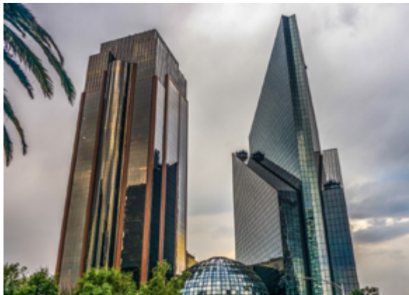
Mexican Stock Exchange

(BMV), grew to list shares in approximately 250 companies and a variety of other financial products. The BMV's estimated total market capitalization was USD 530 billion in 2001. 131, 132, 133 Since 2008, the BMV has been publicly owned and traded. 134