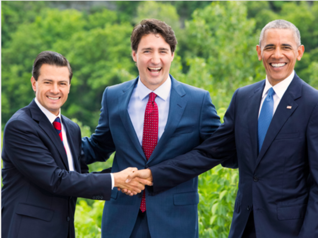
The Three Amigos meeting in Ottawa