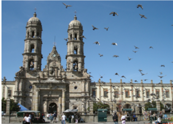
Basilica of Our Lady of Zapopan

Between 83 and 87% of Mexicans consider themselves Catholics. 47, 48 Pre-Columbian religious traditions pervade Mexican Catholicism and underlie the elaborate celebrations of village saint's days, Semana Santa (the "Holy Week" leading up to Easter), and Las Posadas of the Christmas season. 49, 50 The rituals surrounding Día de los Muertos (Day of the Dead), November 1, entered the UNESCO list of the Intangible Cultural Heritage of Humanity in 2008. 51, 52 Our Lady of Guadalupe, the "brown Virgin,"