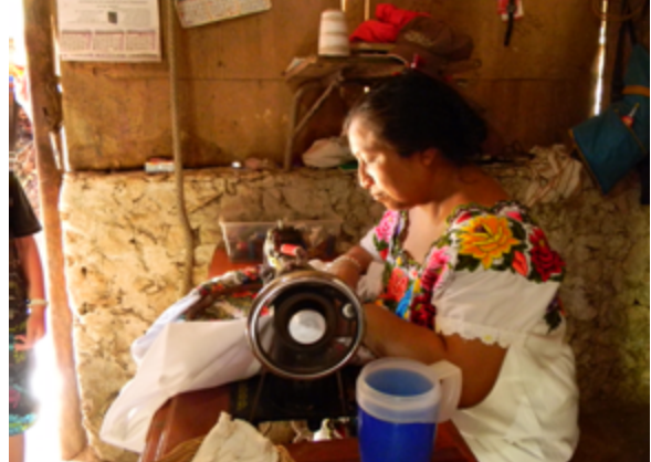
Mayan woman souvenir maker

on-air by her male co-host, was pressured to call the incident a hoax. 140, 141 In another 2015 case, female workers at a Mexican auto factory were fired after complaining their supervisor repeatedly harassed them. 142 Women are sometimes subjected to pre-employment pregnancy tests before they can get a job in spite of the fact that such a requirement is illegal. Most recent reports suggest that 14% of women were subjected to such tests. 143