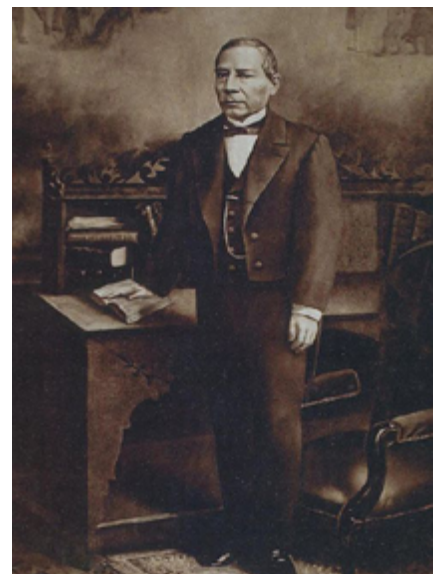
Benito Juárez

In 1854, Benito Juárez and other liberals announced the Plan de Ayutla , which called for the end of Santa Anna’s rule and a new constitutional convention. Juárez was a Zapotec orphan who learned Spanish from the Franciscans and later earned a law degree. Governor of Oaxaca during the Mexican-American War, he was national Minister of Justice when La Reforma began. 126 The liberals felt that church and military power were hindering the development of a strong republic. In 1854, Ley (“law”) Juárez stripped the church and the military of much of their traditional legal autonomy. In 1855, Ley Lerdo ordered the sale of corporate-owned real estate—church property, but also Indian ejidos (“common lands”)—into private ownership. 127 In 1857, a new constitution gave the republic a unicameral legislature; a four-year, single-term presidency; freedoms of speech, press, assembly, and education; amparo (similar to habeas corpus , the individual’s right to appear before a court); and no state religion. 128, 129, 130, 131