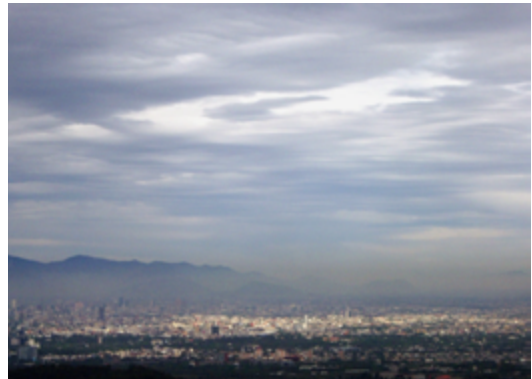
Mexico City smog

Human population pressures and industrial processes are endangering Mexico's diverse environments. The Mexican government has declared water a national security issue. 130 Water use is exceeding natural replacement rates, with water quality deteriorating and pollution occurring in the most populated areas. 131, 132 Unregulated or poorly planned land use including agricultural land-clearing, chemical fertilization, overharvesting, overgrazing has led to deforestation, soil erosion and desertification. 133, 134 Air pollution is no longer limited to Mexico City, but is a growing concern along the Mexican-U.S. border, as well as other transportation corridors and industrial regions. 135 Oil extraction practices threaten the marine resources of the Gulf of Mexico. 136 Environmentally safe waste disposal—from industrial and residential sources, in solid, liquid, electronic, and nuclear forms—has become a challenge as Mexico tries to grow an economy that can support a growing population. 137, 138