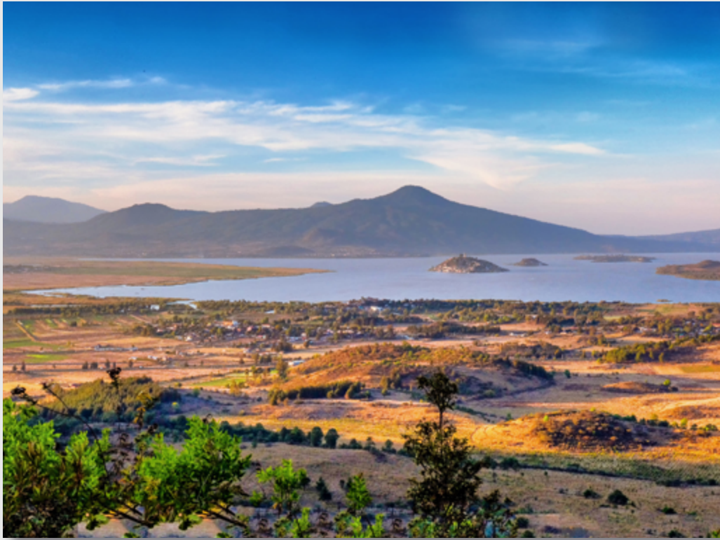
Mexico landscape