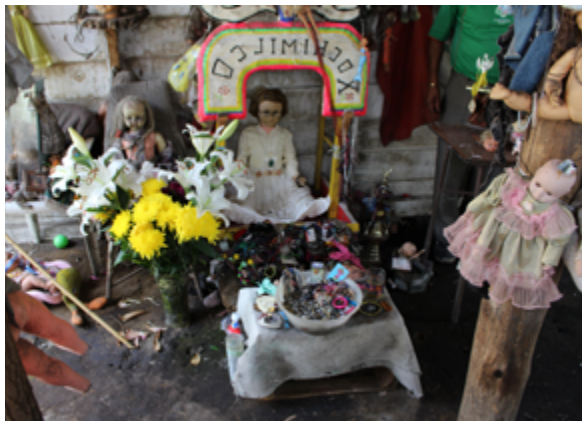
Milagrosa altar in Mexico City

Mexico has more than a dozen UNESCO World Heritage Sites that testify to the importance of colonial architecture, including the entire historic center of Mexico City. 162 Many of these are religious buildings and preserve the “Indocrisiano” art of early converts to Catholicism. 163 Catholic influence also made its way into traditional arts with clay figurines of the Virgin, metal retablos (devotional paintings) and milagros (healing charms), and streamers of papel picado (hand cut