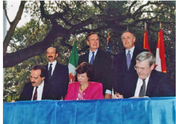
Signing NAFTA trade agreement

An overdependence on future income from oil discovered in the 1970s produced economic debt in the 1980s that the government tried to reduce by floating the peso. Massive falls in the peso (from 12 to the dollar in 1975 to 3000 to the dollar in 1992) led to hyperinflation and a painful bailout from the International Monetary Fund. 191, 192 Much of Mexico City literally fell to the ground in the 1985 earthquake. From the inadequate government response to the disaster emerged a new grassroots activism that fed into support for political candidates outside the PRI. 193, 194