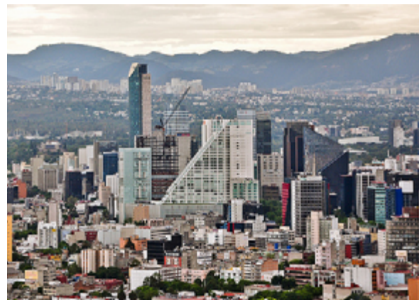
Mexico City skyline

The nation's capital sits 2,200 m (7,200 ft) high in the Valley of Mexico, surrounded by mountains reaching upwards of 5,000 m (16,400 ft), including the active volcano Popocatepetl. 59 The city was the world's largest city during the 1990s. Today, this urban area is home to nearly 25% of Mexico's total population. 60 Roughly 12.3 million people live in the city and 22.1 million live in the larger metropolitan region, one of the largest agglomerations in the world. 61 Once the Mexica (better known as the Aztecs), who were seeking the sign of an eagle upon a nopal cactus holding a snake, settled an island in a lake in 1325 (this sign is now a symbol on the national flag). This island became the site of the future Mexico City. When Hernán Cortés arrived in 1519, he found Tenochtitlan, a city of 300,000 Aztec subjects that, at the time, surpassed Spanish cities in size and sophistication. 62, 63, 64 Spaniards soon built their colonial capital directly upon the ruins of conquered Tenochtitlan using destroyed Aztec palaces and temples as building materials for their new zócalo (city plaza) and Roman Catholic cathedral. 65 In the 1960s, subway engineers excavating the Pino Suárez station discovered and soon built around an Aztec pyramid to the wind god Ehecatl; in the 1970s, electricians working in the city center unearthed the Aztec Templo Mayor, now a museum site of the National Institute of Anthropology and History. 66, 67