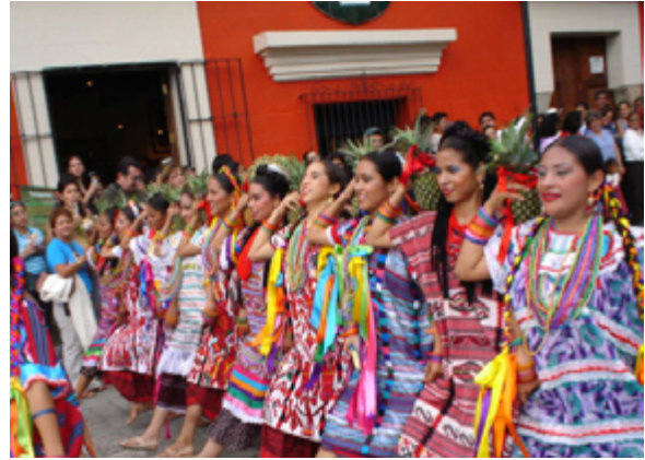
Mestizaje, Flor de Piña, Oaxaca

The majority (62%) of Mexicans identify as Mestizo. Roughly 21% of the population is predominantly Amerindian with another 10% identified as Amerindian. A small number of Mexicans (10%) claims a European ethnicity—they tend to be light-skinned and upper class. 6, 7