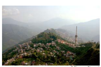
© Shreyans Bhansal Capital of Sikkim, Gangtok

The two Himalayan nations of Bhutan and Nepal do not share a border, but they are separated only by the small Indian state of Sikkim. Relations between the two states have been strained since the early 1990s when a stream of Nepali-speaking refugees left Bhutan. At the end of 2008, over 100,000 of these Bhutanese refugees still lived in seven UN-administered camps in the eastern Tarai districts of Jhapa and Morang. <sup>275</sup>