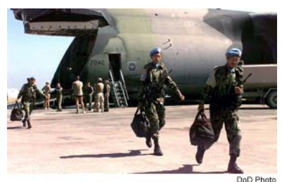
Nepal Army soldiers exit USAF C-5 transport aircraft

The U.S. has maintained formal relations with Nepal since 1947. Since then, the United States has always enjoyed friendly relations with the Kathmandu government. In 1951, the U.S. became the first nation to provide bilateral aid, and to date has cumulatively supplied well over USD 1 billion in ongoing bilateral developmental assistance. During the decade-long Maoist insurgency, an increasing percentage of U.S. aid