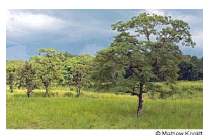
Chitwan National park

The Tarai region is a narrow strip of flatlands that in Nepal extend from the Indian–Nepalese border northward to the southern foothills of the Siwalik Range (also known as the Churia Range). The word "tarai" is assumed to originate from the Persian word for "damp," which aptly describes the marshy plains and their hot, humid climate. Today, the original subtropical forests and savannah vegetation have mostly been cleared for fields