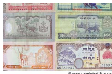
Nepali money

Nepal's banking industry began in 1937 with the establishment of the first commercial bank, the Nepal Bank. Nearly 20 years later, the Nepali central bank, Nepal Rastra Bank, was formed, allowing the country to finally exert some control over its foreign currency accounts. Prior to the Nepal Rastra Bank, the Indian rupee was commonly used for financial transactions in most parts of Nepal outside the Kathmandu Valley. The