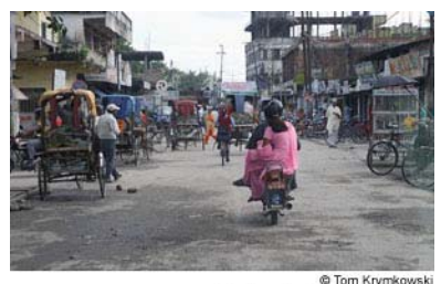
On the streets of Biratnagar

Biratnagar is Nepal's second largest city, and one of its leading manufacturing centers. Located near the Indian border in the eastern Tarai region, the city is the site of a jute mill that was constructed in 1936 Nepal's first large-scale manufacturing enterprise. <sup>27</sup> Shortly thereafter, factories producing matches, cigarettes, and rice and vegetable oils were built. <sup>28</sup> More recently, Biratnagar industrial operations have produced sugar, textiles,