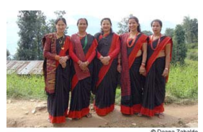
Nepalese women in traditional clothing

In a nation as ethnically and geographically diverse as Nepal, it is impossible to identify a style of dress that reflects more than a subset of the population. The clothing styles in the Tarai mirror those of northern India, whereas the peoples in the northern mountain regions dress like their Tibetan neighbors on the other side of the border with China. Younger people throughout the country are as likely to be wearing Western-style shirts and trousers as they are any traditional dress.