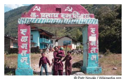
A family in Maoist-controlled Nepal

Less than a year later, in October 2002, the king dismissed the prime minister and his cabinet, and conferred upon himself executive control of the government. After another round of peace talks failed in August 2003, the level of violence escalated, as much of the countryside became swept up into the fight between the army and the Maoist insurgents. In February 2005, King Gyanendra formally dissolved the government,