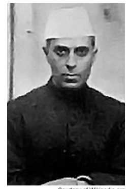
Indian Prime Minister Jawahalal Nehru

The narrow margin of the referendum did lead to reforms of the panchayat system, including the direct election of members to the Rastriya Panchayat. Political parties continued to be banned, although several, including the Nepali Congress, operated "unofficially" in the open. During the 1980s, discontent with the government grew, less with political oppression than with economic stagnation and highlevel corruption. In 1990, the government attempted to suppress a series of nationwide strikes and demonstrations, organized by the Nepali Congress Party and a seven-party communist coalition, the United Left Front. <sup>107</sup> Ultimately, the king was forced to back down. A new constitution was written, establishing direct elections for a