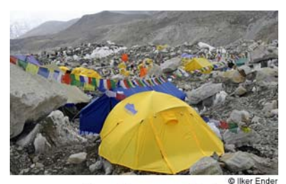
Everest base camp, Himalayas, Nepal

Tourism for many decades was an important, steadily increasing part of Nepal's economy. By 1999, foreign visitors totaled 491,000 a year. However, a December 1999 hijacking of an Indian Airlines flight bound for New Delhi from Kathmandu followed by growing conflict between the Maoists and Nepalese government forces severely reduced the flow of visitors to Nepal for several years. <sup>171</sup> Since the signing of a peace treaty in 2006,