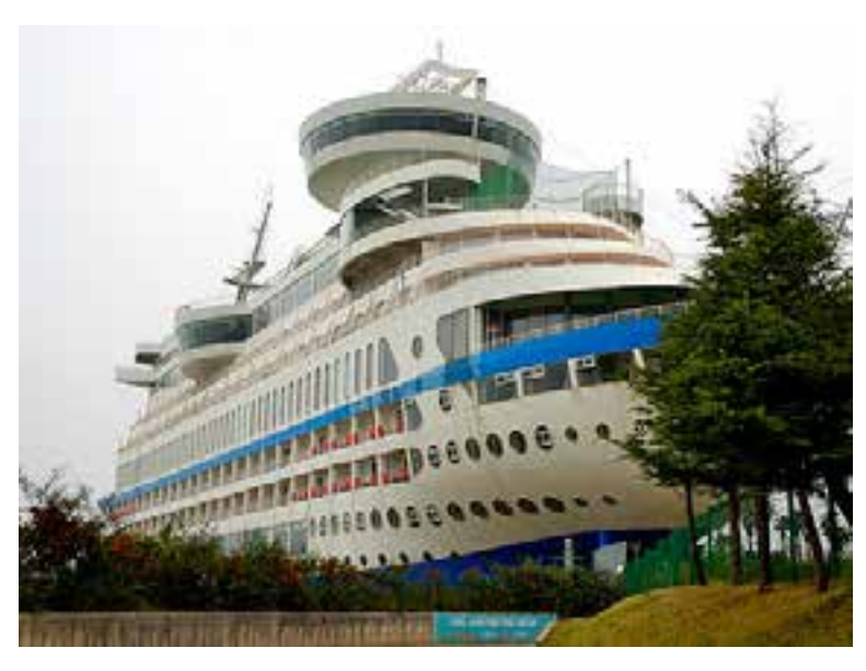
Hotel On a Hill

and petrochemicals.<sup>84,85</sup> The country has established a number of free-trade agreements to further increase trade.<sup>86</sup> China is the nation's largest trading partner; roughly 21% of all of South Korea's trade is with China.<sup>87</sup> Other important partners include the United States, Japan, and the European Union.<sup>88,89</sup>