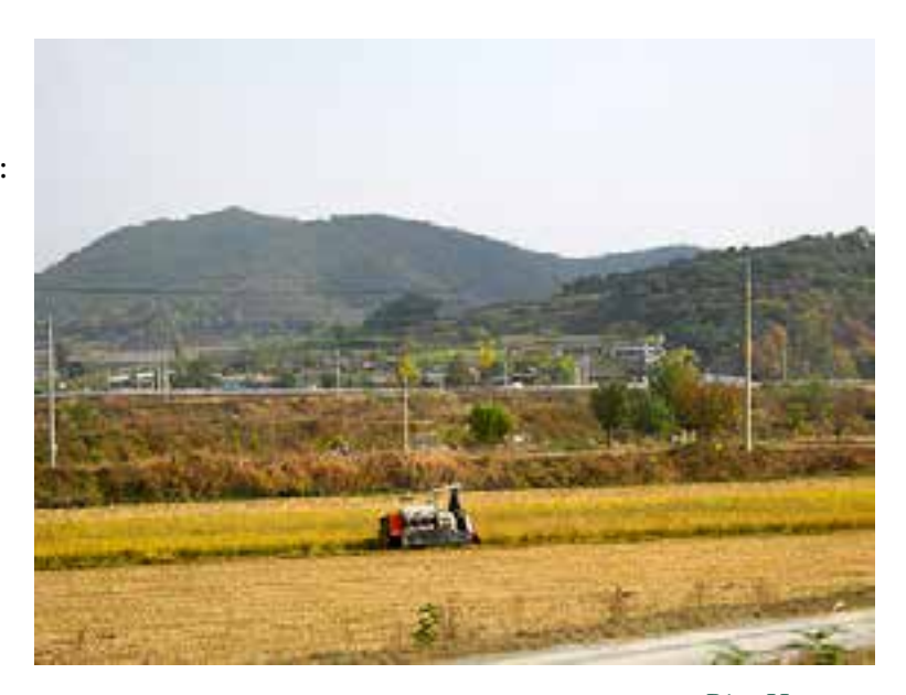
Rice Harvest

Little of South Korea's rugged landscape is arable: roughly 15% of the land is suitable for agriculture.<sup>24,</sup> <sup>25, 26</sup> Today, approximately 6% of the workforce in South Korea is engaged in agriculture.<sup>27</sup> In 1953, 70% of the labor force worked in agriculture, a number that began to rapidly decrease after the Korean War.<sup>28, 29</sup> The main agricultural crops in South Korea include rice,