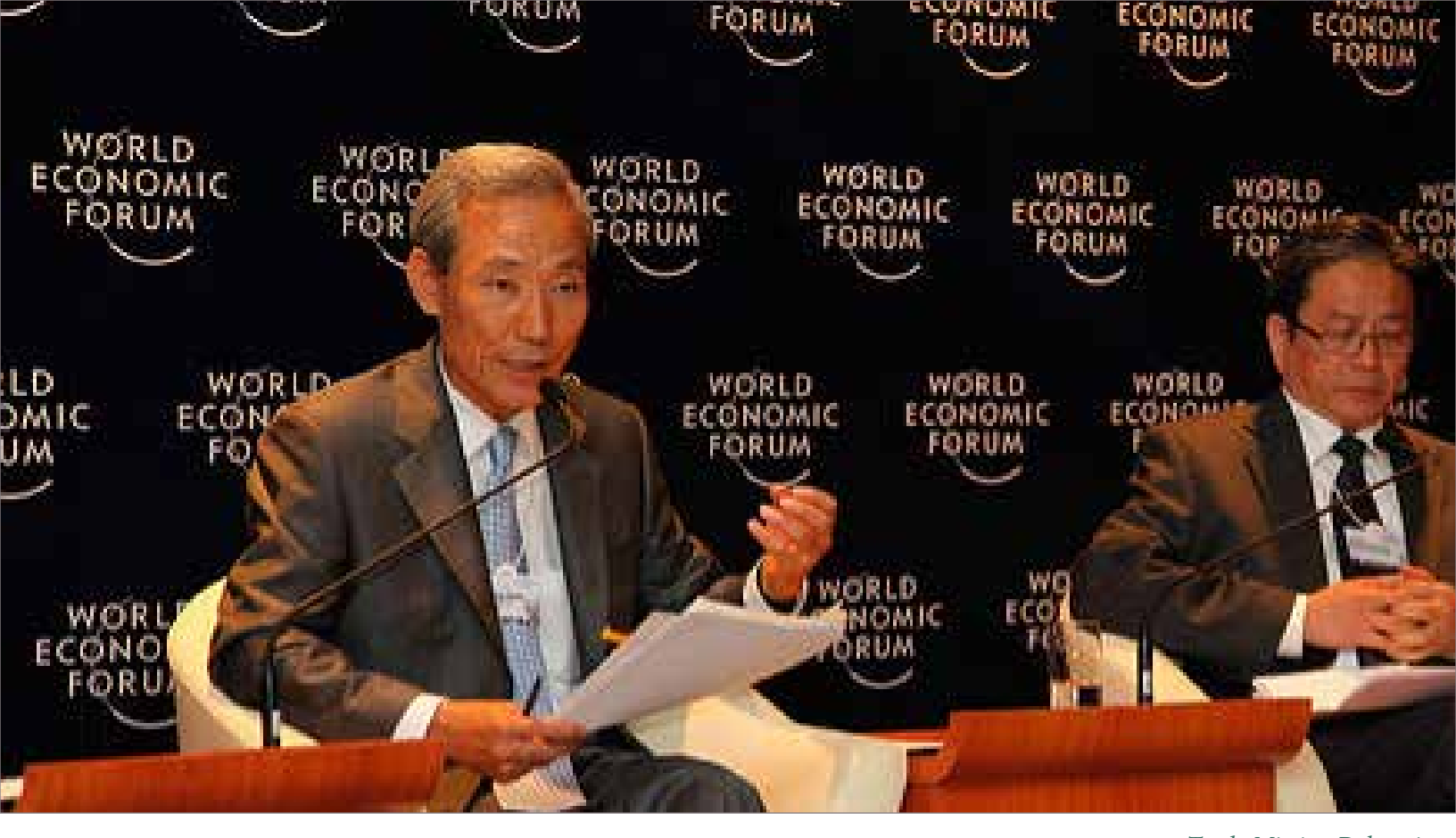
Trade Mission Delegation