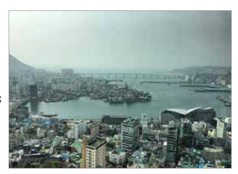
Busan, South Korea

Located at the mouth of the Naktong River on the southeastern coast, Busan is the capital of South Gyeongsang province (Gyeongsangnam-do). Dating to about 935, the city today is home to a number of colleges and universities including the National Korea Maritime University. It is developing into a major tourist hub because of its beaches.<sup>48, 49, 50</sup> Busan is the center of the