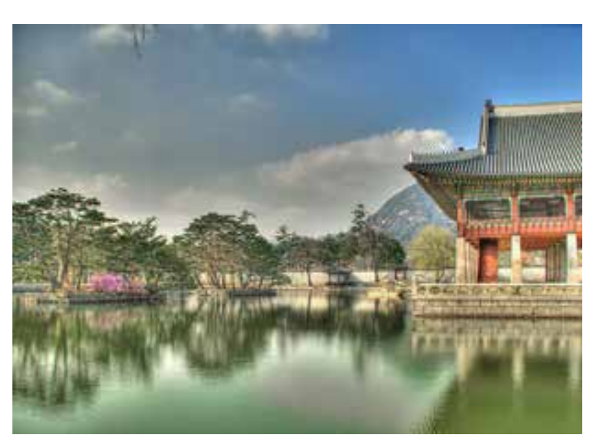
Chosun Palace

Although British, Russian, and French merchants had made their way to Korea by the 1840s, it was the Japanese who broke the isolationism in 1876 by forcing Korea into an unequal treaty. The treaty granted extraterritorial rights to Japan and opened three ports to Japanese trade. China, angered by the treaty, tried to counter the Japanese