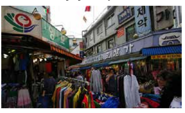
Namdaemun Market

South Korea's 49,115,196 people live in a relatively small land area. The population density is about 492 people per sq km (1,276 people/sq mi).<sup>130</sup> The majority of people live in apartment buildings, most of which have between 15 and 30 stories, although some have as many as 60.<sup>131</sup> Apartments are generally small, averaging between 33 and 49.5 sq m (350 and 525 sq ft).<sup>132</sup> Most