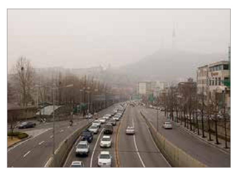
Smog hanging over Seoul

Gwangju is the capital of South Cholla province (Chollanam-do) in the southwestern section of the country. The city has been an important center of trade since the beginning of the Three Kingdoms period in 57 B.C.E. During the Korean War it served as a major military training center. Today Gwangju is one of the most important manufacturing and industrial centers, as well as an important transportation hub for southwestern Korea. In 1980, the city was the site of a bloody student uprising against the military government of then-President Chun Doo Hwan. The event is remembered every 18 May with a festival; the memorial park is a powerful reminder of the event. The city is also home to a number of historical sites and major universities.<sup>62, 63</sup>