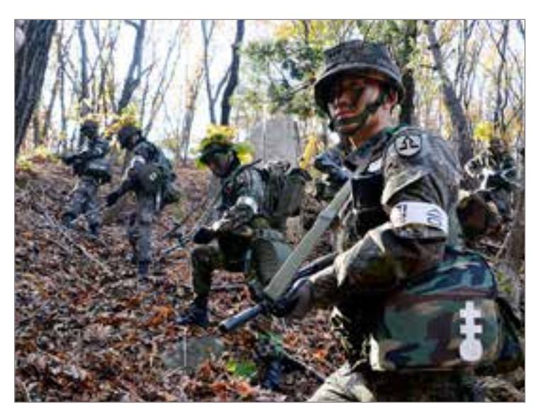
Soldiers from Korea's 52nd Infantry Division

The ROKN is modern and is developing advanced submarine technology. In addition to its marine vessels, the navy supports land troops with insertion and extraction operations and other amphibious operations. Naval and marine conscripts serve 26 months and 24 months, respectively. Although there is a lower percentage of conscripts in the navy, their short terms are proving problematic as ships and other systems become increasingly complex. Still, the navy enjoys high levels of morale and professionalism.<sup>104</sup>