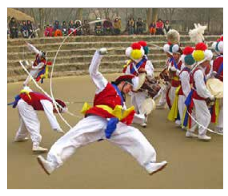
Korean Folk Village

Traditional Korean dances may be religious or secular. The religious dances are often performed by a shaman (moodang), who goes into a trancelike state. Other religious dances reflect Confucian tradition and incorporate the stiff, ceremonial forms that originated in China. The folk dances performed by farmers and accompanied by drums and gongs are the oldest surviving dances in the nation; they are regularly performed to drive away evil spirits. 144, 145, 146