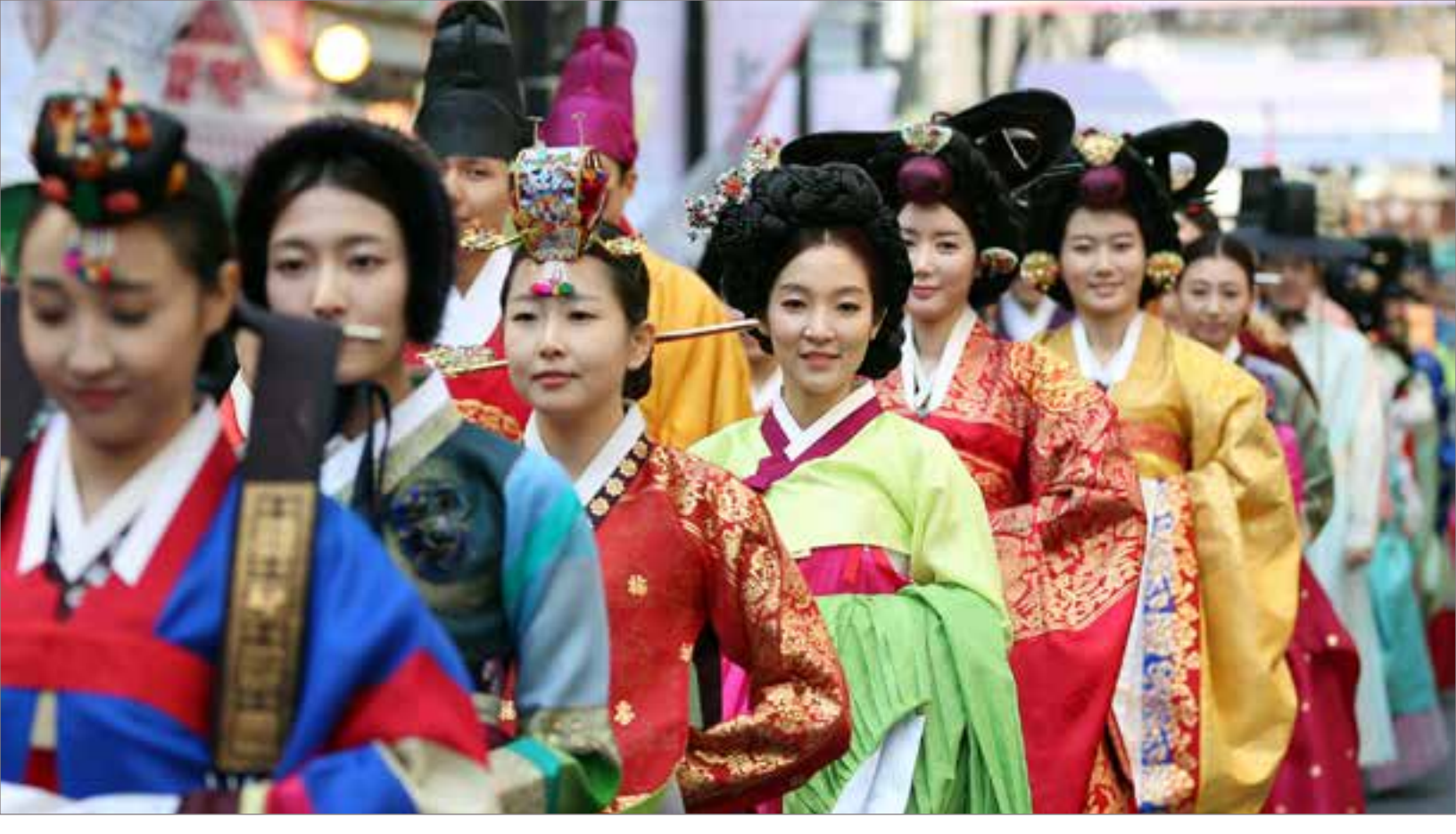
Hanbok parade