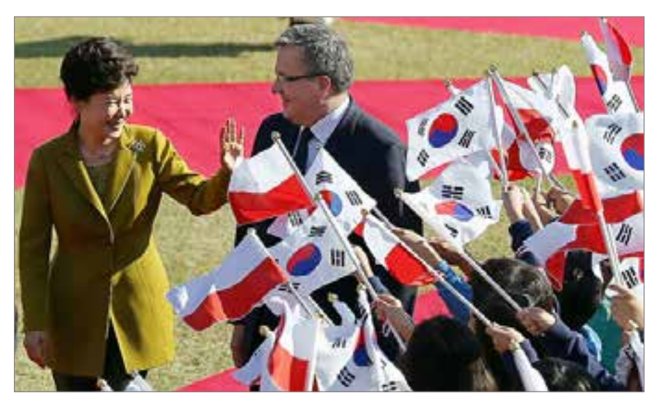
President Geun-hye Park

In addition to other foreign relations challenges with China and Japan, President Park battled domestic issues, including a struggling economy.<sup>133, 134, 135</sup> President Park's administration has been accused of corruption over allegations of interfering in the presidential campaigns and tampering in the electoral process. Some have even called for her resignation.<sup>136</sup> The government remained gridlocked and passed few pieces of legislation since Park's election. This sparked talk of constitutional reforms that would transfer political power from the president to the prime minister.<sup>137</sup>