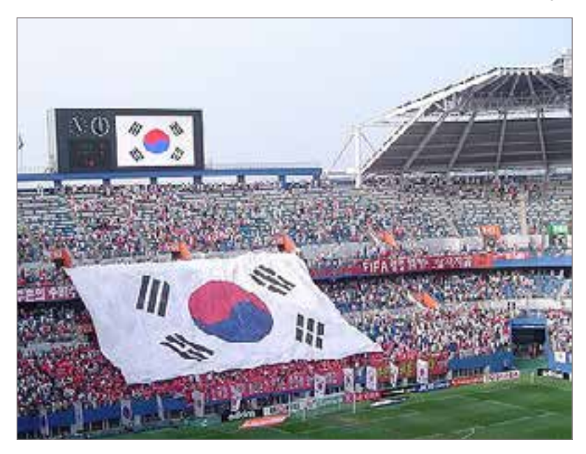
South Korean flag at World Cup

known sports is taekwondo. This 2,000-year-old traditional martial art became an Olympic event in 2000; in that year, South Koreans took home three gold medals. <sup>156,</sup> <sup>157</sup> Sheeruhm is a Korean form of wrestling that originated around 1,500 years ago. It resembles Japanese sumo wrestling. Unlike sumo, which originated as entertainment for the aristocracy, sheeruhm was developed for commoners. It was the most popular sport in the 1990s but has experienced a decline in recent years. Especially popular among fishermen and farmers, the sport is taught in middle and high schools. <sup>158, 159</sup>