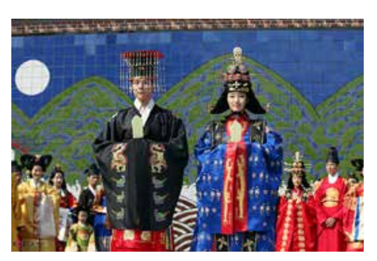
Korea Spring of Insadong

Koreans are a mixed racial group with characteristic Caucasian and Asian features. <sup>20, 21</sup> Despite extensive cultural contacts, Koreans avoided mixing with outside groups and hence did not experience the ethnic assimilation found in other parts of the world. Contemporary South Koreans, still keenly