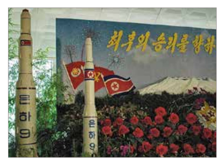
Models of North Korean rockets in Pyongyang

could cause serious disruptions and stresses on the South's economic system and resources. 116, 117, 118