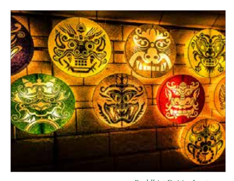
Buddhist Deities Lanterns

Buddhism came to Korea in about 372, becoming the official religion during the period of the Three Kingdoms (57 B.C.E–668 C.E.). The religion flourished under the Koryo Dynasty (935–1392) but lost favor when the Chosun (Yi) Dynasty came to power in 1392; Buddhism was blamed for government corruption, and Buddhist monks were expelled from Seoul. The religion experienced a