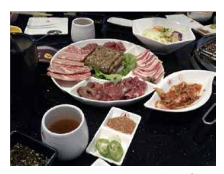
Korean Cuisine

Sticky white rice is served at virtually every meal and is accompanied by up to 12