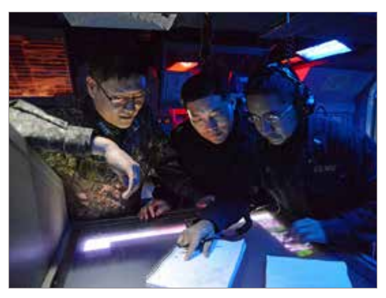
Korean and U.S. Navy exercise in East Sea/Sea of Japan