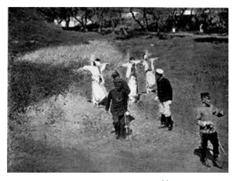
Martial law, Korea 1900s

The Koreans were theoretically entitled to the same status as Japanese citizens under the rules of colonialism. But the Japanese treated them as an inferior people and attempted to exploit the nation's natural resources. Life under Japanese rule was brutal. Until 1921, Koreans were not allowed to publish their