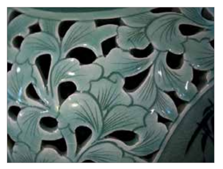
Korean celadon pottery

The history of Korean art dates more than 1,500 years, when hunting scenes were first painted on the walls of tombs. While some of the cave art shows a clear Chinese influence, hunting scenes from the period of the Goguryo Kingdom are uniquely Korean. Today in South Korea there is a vibrant culture of art, music, and dance. Schoolchildren learn traditional art forms and numerous traditional skills.