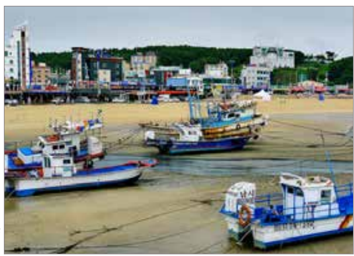
Incheon, Eulwangni Beach

Incheon is a port city located near the mouth of the Han River, 40 km (25 mi) west of Seoul and 32 km (20 mi) south of the demilitarized zone separating the two Koreas. General Douglas MacArthur landed there with United Nations forces in 1950, stifling North Korean invaders. A huge statue of General MacArthur stands in Jayu Park near the port. The tidal range in the area is the second largest in the