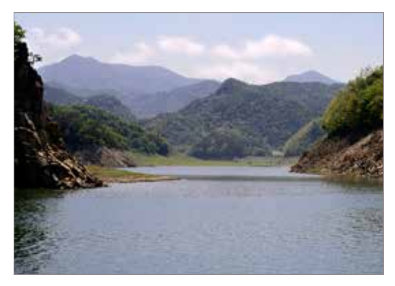
Boating in Jaecheon South Korea

The longest river in South Korea is the Naktong. It begins in the Taebaek Mountains and empties into the Korea Strait near the port city of Busan in the southeast.<sup>31</sup> The river is navigable for 350 km (217 mi) from its mouth near the city of Andong. Nearly one-quarter of its basin forms a rich agricultural area and supplies water for the cities along its path.<sup>32</sup>