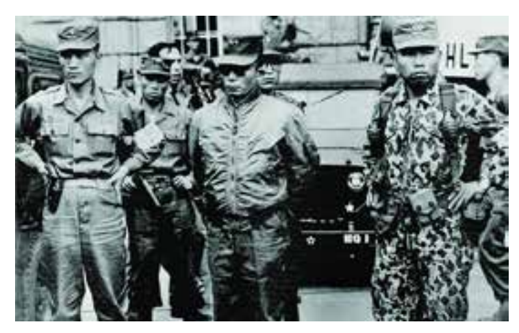
Park Chun Hee coup

election was fraudulent led to civil disorder. Rhee was forced to resign in April of that year after police killed 142 student protesters. The next day, all members of the vice-presidential family committed suicide. Left with a power vacuum following the resignation and deaths, General Park Chung-Hee mounted a successful military coup and became president in May 1961. 88, 89, 90