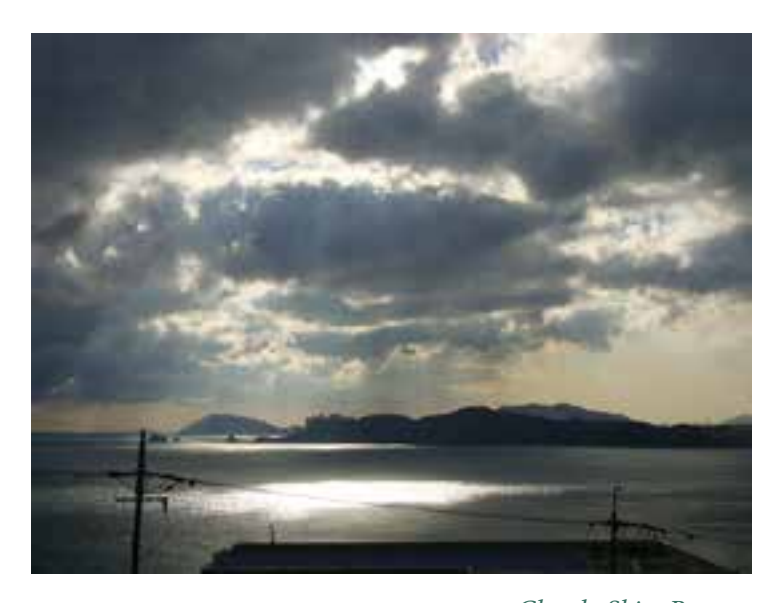
Cloudy Skies Busan