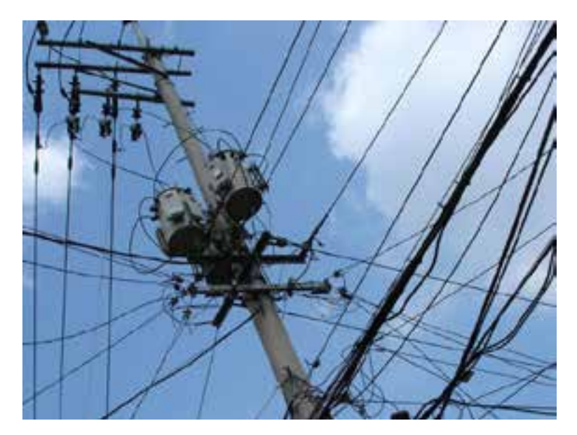
Electrical Tower

South Korea is one of the largest consumers and net importer of energy in the world.58, <sup>59, 60</sup> In 2014, South Korea was the world's fifth-largest importer of oil, the fourth-largest importer of coal, and the second-largest importer of liquefied natural gas (LNG).61,62 Although the nation has no oil reserves of its own, it is home to some of the world's most advanced oil refineries.63