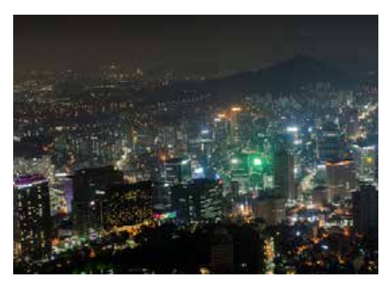
Seoul, South Korea

Located on the Han River in the northwestern region of South Korea, Seoul is the nation's capital and one of the largest metropolitan areas in the world. Its metropolitan population of 20–25 million represents about half of the South Korean population.<sup>39,40,41</sup> The population of the city proper is declining due to high housing costs and an aging population.<sup>42</sup> Seoul has