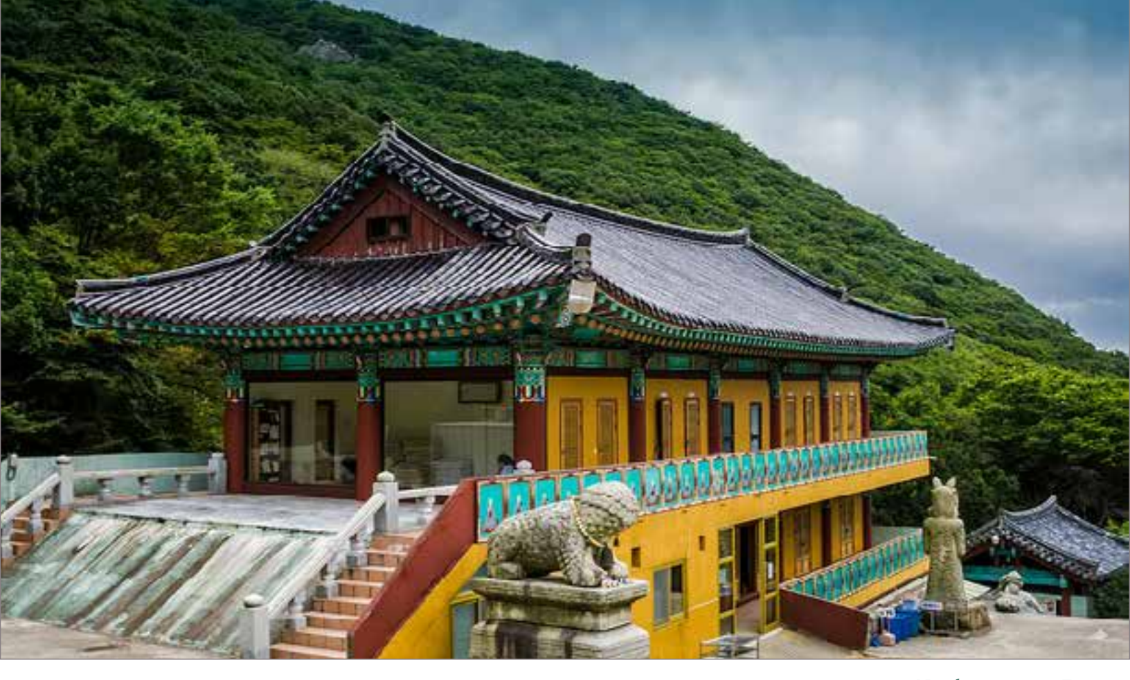
Namhansanseong Fortress