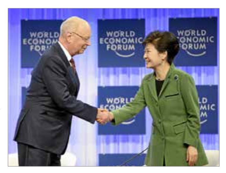
President Park Geun-hye in Davos, Switzerland

The South Korean constitution declares that all citizens are equal under the law and prohibits discrimination on the basis of gender. Yet South Korean women are frequently victims of discrimination. 110, 111 South Korea ranked 117 out of 142 countries on the 2014 Global Gender Gap report. 112 On that same index, South Korea ranked 124th on women's participation in the labor