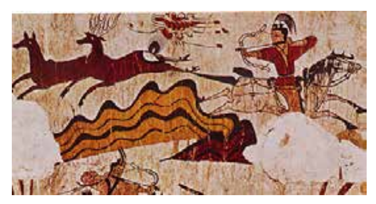
Goguryeo hunter mural

The Koreans organized into 70 independent clans grouped into 3 tribal confederations. Tribes in the East established the Silla Kingdom in 57 B.C.E., the first of three rival kingdoms. With its capital near Gyeongju, it was the richest and most cultured