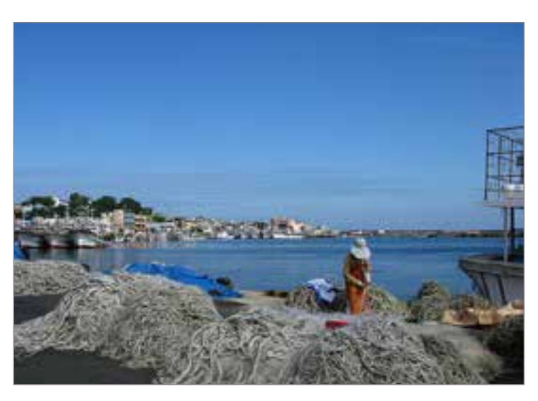
Korean Port

southeastern main islands, and stretches northwest past the Korean island of Cheju to China.<sup>25</sup>