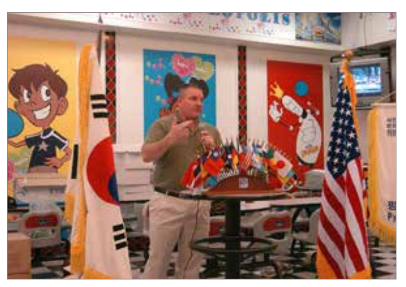
Korea / USA relations

Tensions with North Korea are high. But provocations by the North Koreans have not caused the South Korean government to waver on its policy of alignment. The South has responded forcefully to North Korean provocations but continues to engage the North by providing humanitarian aid and conducting high-level talks. Park's efforts have led to easing tensions with China. Foreign policy efforts have been less successful with Japan, and relations remain troubled.<sup>9, 10, 11, 12</sup>