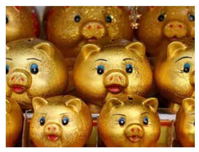
Golden Pigs

The national currency is the Korean won (KRW). In November 2015, USD 1 equaled approximately KRW 1,132. <sup>106</sup> In 1997, the Ministry of Strategy and Finance allowed the value of the KRW to be determined by supply and demand. The KRW is a floating currency, but the Bank of Korea can intervene if the exchange rate becomes too volatile. <sup>107, 108</sup>