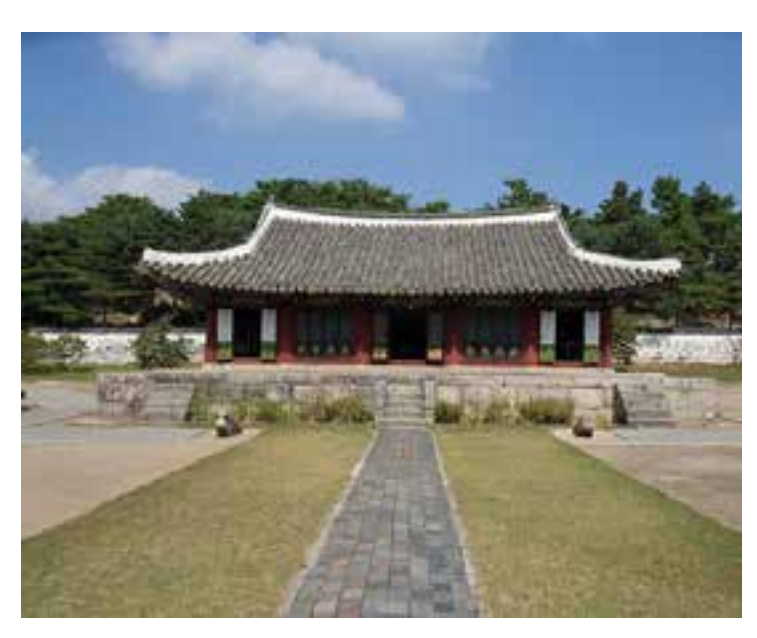
Koryo Museum, Kaesong

colleges in the 12th century. Perhaps the greatest changes came from the increasing influence of Confucian thought, particularly in areas related to politics and ethics. A new social order with an aristocracy emerged.<sup>39, 40</sup>