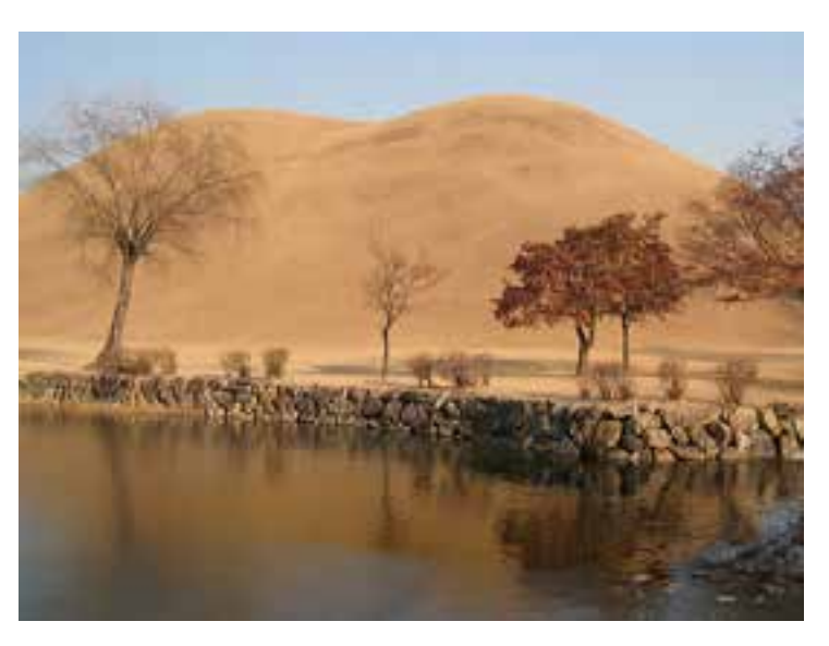
Silla burial mounds

The years of Silla rule are known as the Golden Age of Korea. During this time, the Silla kings tried to create an ideal Buddhist state. For the kingdom's first 215 years, art, literature, science, architecture, and culture flourished. Inequality lessened, and farmers gained more control over the land. Foreign trade opened to China and Japan.