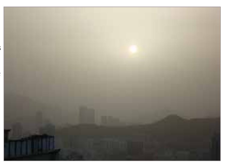
Yellow dust in Busan

Every spring, fine sand known as yellow dust (hwangsa) blows across the Korean peninsula from China and Mongolia. The toxic dust reportedly contains radioactive materials leaked from nuclear power plants in other countries, including China and Japan. 88, 89 The dust blankets South Korea and is most severe in the western parts of the country, including Seoul. Warnings frequently advise residents against going