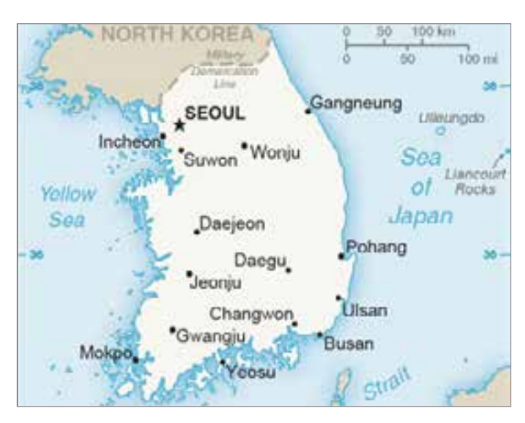
Map of South Korea

Mountains cover about 70% of South Korea.<sup>9</sup> The mountains are not particularly high, but many are extremely steep.<sup>10</sup> The Taebaek Mountains (Taebaek-san) run in a mostly north–south direction along the eastern coastline, and extend into North Korea. The tallest peak in