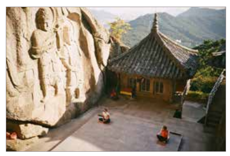
Seokbulsa Temple

The alphabet, Hangul, was devised by King Sejong in the mid-15th century. It comprises 28 characters, although only 24 are used today. The 14 consonants and 10 vowels are combined into blocks of syllables. Words may have more than one syllable block, and there is a space between each written word. Hangul is often called the single most efficient, scientific alphabet in the world; consonant shapes are based on the shape of the mouth when making the sound. There is a saying that a wise man can learn Hangul in a day and even a stupid man can master it in 10 days. The written form was vertical until the 1980s, but today the language is read from left to right.