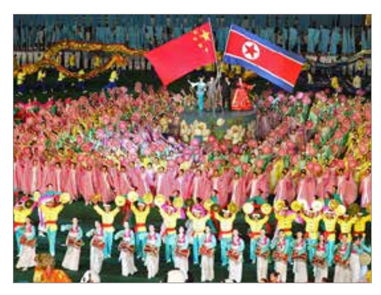
China and North Korea relationship

South Korean relations with China are characterized by fundamental mistrust and they center primarily on expanding trade.<sup>55, 56</sup> Fears that China is closing the technology gap with South Korea—creating the possibility that China could become South Korea's largest economic rival in the region—have caused friction in recent years.<sup>57, 58</sup> China is now South Korea's largest trading partner, accounting