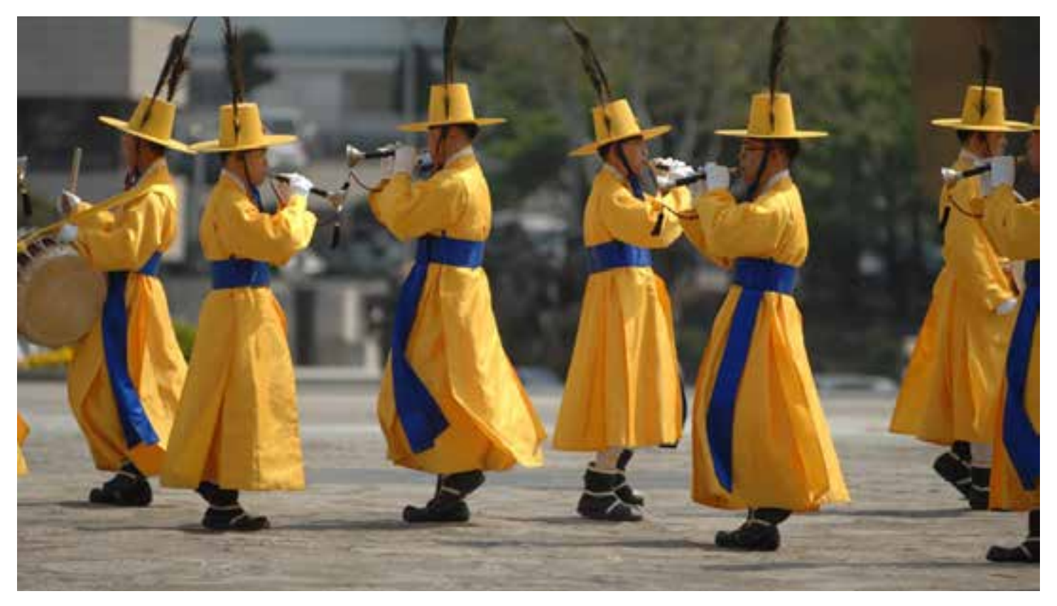
War Memorial of Korea