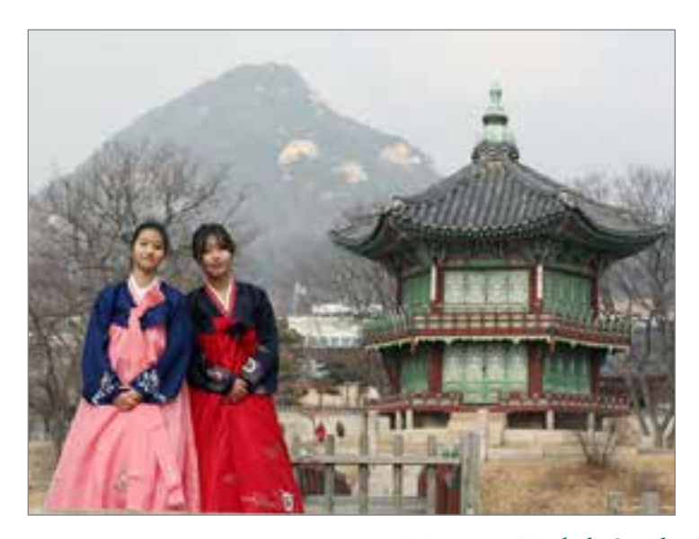
Women in Hanbok, Seoul

The traditional attire, known as hanbok, dates as far back as 57 B.C.E.; it is a loose-fitting garment with no zippers, buttons, or pockets. Although this traditional Korean attire was commonly worn until the 1960s, today most South Koreans dress in Western styles. Older Koreans in rural areas may still wear hanbok, including a tall black hat (sodkut) made from horsehair. But