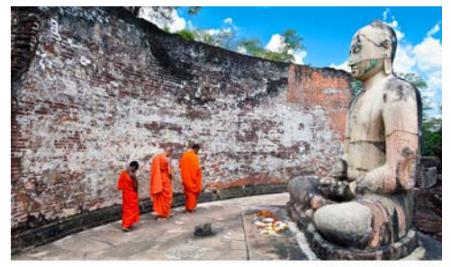
Buddhist monks in prayer

Sri Lankan society shares many cultural traditions and norms with its South Asian neighbors. Buddhism, which died out in India during medieval times, has thrived on the island since missionaries converted the ancient kingdoms in the third century C.E. Many people from North and South India, Central Asia, the Middle East, and elsewhere migrated to the island in ancient times. They discovered aboriginal Veddahs and forged a new civilization. Sri Lanka's religious and ethnic diversity stems from immigration and invasions from South India, Thailand, and Europe.