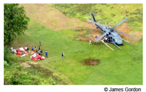
US food aid, Dambula

In the late 1980s, the United States was searching for a new naval base to replace Subic Bay in the Philippines, and considered Sri Lanka's deep-sea port at Trincomalee. However, political unrest and civil war plaguing the