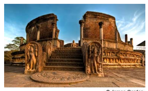
Sinhalese temple ruins

The Sinhalese origin legend, in the encyclopedic Pali text known as the Mahāvāṃsa , recounts the exploits of an Indo-Aryan prince, Vijaya. Banished from his homeland for gross misconduct, Vijaya—descended from a family