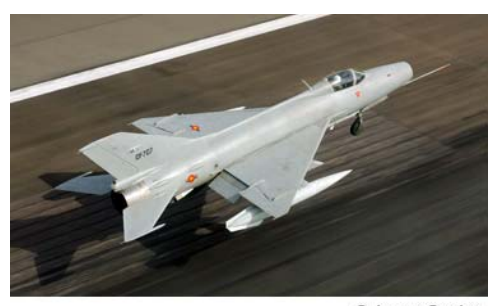
Sri Lankan jet, Chinese built

At the end of the Sri Lankan Civil War, China was a major supplier of weaponry and munitions. Now that the war is over, China is making major investments in Sri Lanka's infrastructure, funding projects for road construction, railway modernization, and other significant