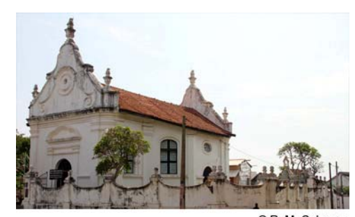
© R. M. Calamar Dutch church, Galle

In 1658, the Dutch replaced the Portuguese as the colonial power in Sri Lanka. Only the Sinhalese kingdom of Kandy remained independent. The Dutch brought many South Indian laborers and mercenaries, some of whom married into Tamil and Sinhalese families. Others mixed with Muslims (called Moors by Sri Lankans) on the island.<sup>77</sup>