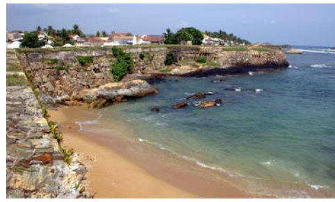
Portuguese fort loacation

The history of Portuguese colonialism in Sri Lanka was bloody and acrimonious from the beginning. Initially invited by the King of Kōṭṭe to fend off his rivals, they overstayed their welcome, and eventually seized full