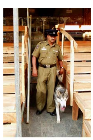
Police on patrol with K9

Sri Lanka's police force operates under the auspices of the Ministry of Defense. Aside from enforcing day-to-day laws, these units also assist in counterterrorism operations. There is a great deal of redundancy built into the organization. The Criminal Investigation Department (CID) investigates terrorism. The Security Coordinating Division has responsibility for intelligence gathering. The Bureau of Special Operations deals with interdiction of drug, contraband, and arms smuggling. The National Intelligence Bureau is comprised of the Directorate of Internal Intelligence (DII), which focuses on domestic intelligence matters, and the Directorate of Foreign Intelligence (DFI), which deals with international intelligence issues. The Special Investigation Unit is an internal affairs component, dealing with investigations and discipline of police misconduct. The Terrorism Investigation Division (TID) served as the investigative arm dealing