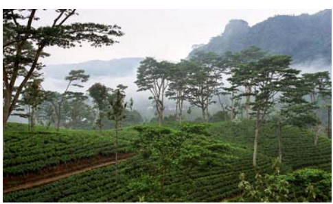
Forest cleared for tea plants

Since the beginning of the 20th century, deforestation has taken a serious toll on the forest cover of Sri Lanka. At the turn of the last century, 70% of Sri Lanka was forested. By the end of the century, that figure had dropped to 21%. <sup>46</sup> The related problem of soil erosion has been a major concern in Sri Lanka for decades and poses a direct threat to the country's tea plantations and tea exports. <sup>47</sup>