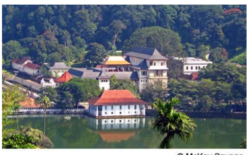
Temple of the Tooth, Kandy

Located in the Central Highlands, Kandy was the capital of the last independent Sinhalese kingdom and today is the cultural capital of Sri Lanka. In 1988, the United Nations' World Heritage Centre named this sacred city a World Heritage Site. <sup>36</sup> The Temple of the Tooth, a Buddhist temple complex, is located in the heart of the city, along the banks of Kandy Lake. It is believed to possess the Buddha's tooth relic. Kandy is the largest city outside the Colombo Urban Area.<sup>37</sup>