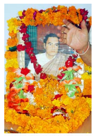
Shrine of Rajiv Gandhi

Sri Lanka and India share a legacy of British colonialism. Postindependence, one of the most pressing issues between the two countries has been the plight of the Tamils of Sri Lanka, whose welfare is a concern to India. During the Sri Lankan Civil War, relations between the two countries were severely strained because the southern Indian states, especially Tamil Nadu, was a base for recruiting and training operations of the Liberation Tigers of Tamil Eelam (LTTE). India's deployment of the Indian Peace Keeping Force (IPKF) to Sri Lanka in 1987 was unpopular there, sparking a major insurrection on the island. Sri Lankan leaders maneuvered carefully, trying to appease Indian demands while satisfying Sri Lankan voters. The IPKF mission was unsuccessful, and Indian forces were withdrawn by 1990. This failure and the LTTE's assassination of former Indian Prime Minister Rajiv Gandhi in May 1991, this experience distanced India from the