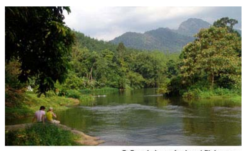
Tropical climate

The Sri Lankan climate is tropical, hot and humid. The only exception is the Central Highlands, where the majority of the tea plantations are located and temperatures average 18°C (64.4°F). By comparison, the mean annual temperature in the low country and coastal areas is about 27.5°C (81.5°F). Average rainfall on the island is 186 cm (73 in). The southwest monsoons carry rain to the central, western, and southern regions from June to October, whereas the northeastern monsoons occur from December to March. The climate beckons many tourists to Sri Lanka.