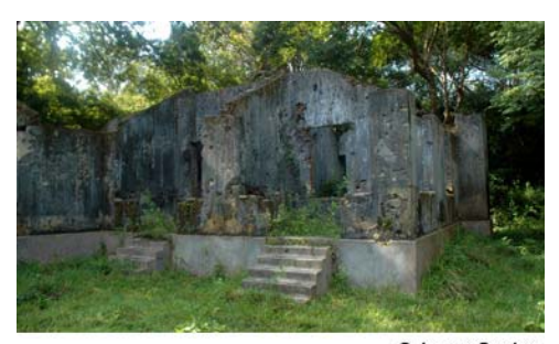
Reminder of the Civil War

Throughout the 1970s and early 1980s, Tamil secessionist movements gathered steam, especially the Liberation Tigers of Tamil Eelam (LTTE). In August 1983, amid an increase in communal violence, Sinhalese rioters killed a number of Tamils and destroyed Tamil properties in response to LTTE attacks. More than 100,000 Tamils fled as refugees to the neighboring Indian state of Tamil Nadu. The LTTE launched a guerrilla war, violently attacking Sinhalese and Muslim (Moor) civilians as well as military targets and moderate Tamil politicians. 96