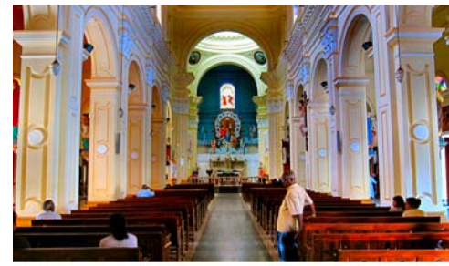
Roman Catholic church

The Portuguese introduced Roman Catholicism to Sri Lanka, with the first missionaries arriving in 1546. 237, 238 The Roman Catholic Church traces its roots to Jesus Christ and his Apostles. With the passing of millennia, a complex hierarchy emerged with the Pope at its pinnacle. During the same time, Catholic theologians developed an elaborate theology. 239, 240