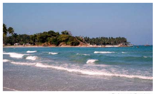
© James Gordon Trincomalee Beach, Sri Lanka

Strategically located, straddling several important shipping lanes, Sri Lanka has long held a significant position in regional geopolitics.<sup>3</sup> Today, China, India, and the United States are vying for leverage, to gain