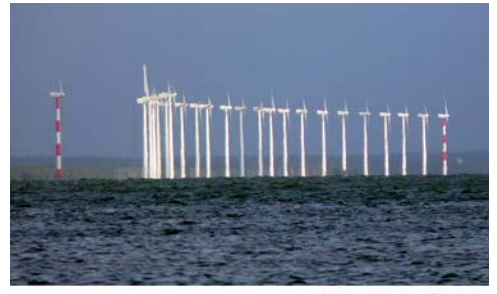
Wind turbines, Puttalam

Although Sri Lanka has no proven oil reserves, tests in the Mannar Basin, along the island's northwest coast, indicate a probable reserve. The government accepted