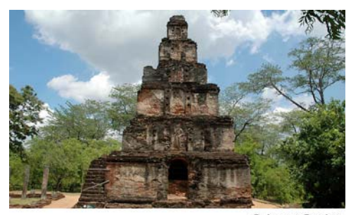
Ruins in Polonnaruwa

Although the kings had moved the royal seat to Polonnaruwa thinking it was more defensible, South Indian invasions continued. Kalinga Māgha led an invasion from the east coast of India in 1214 and ruled over the Polonnaruwa kingdom from 1215 to 1236.