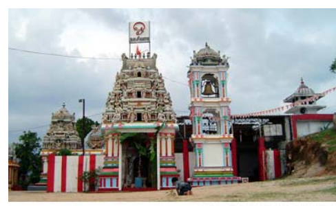
Hindu temple

The core of Hinduism is in the Vedas, ancient texts describing the beliefs and practices of the Vedic civilization, which developed in northwestern India during 2000 B.C.E. <sup>220</sup> The Upanishads serve as a continuation of the Vedas and focus on religious knowledge. The great epics, the Mahabharata and the Ramayana, explained issues of duty, destiny, and virtue.<sup>221</sup>