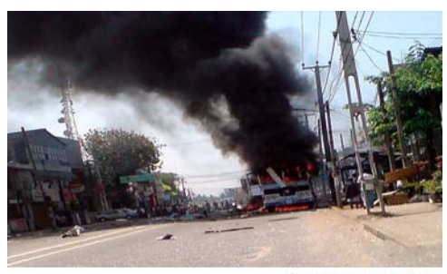
Bus bomb near Colombo

A related issue is the existence of LTTE supporters among the Tamil community in the West. Although the vast majority of the LTTE's senior leadership were killed in the closing days of the war, much of the group's international apparatus remained intact. Supporters among the Tamil abroad have formed the Transnational Government of Tamil Eelam (TGTE), frequently referred to as the "rump LTTE." Although not recognized as a legitimate body by any international government, and claiming to be a non-violent resistance movement, the