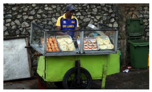
Roadside food cart

A typical Sinhalese dish may require more than a dozen herbs and spices, which are blended to create unique flavors that distinguish Sinhalese cuisine from related traditions from India. These spices include chili peppers, cumin, coriander, curry leaves, fenugreek, lemongrass, ginger, fennel seeds, garlic, onion, turmeric, cinnamon, and onion. Although many dishes include meat, Buddhists and Hindus do not eat beef and Muslims refrain from eating pork.<sup>246</sup>