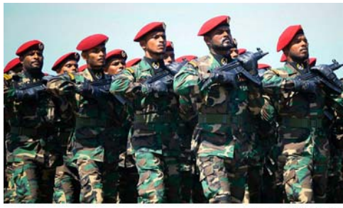
Army soldiers

Battle forces include 13 Infantry Divisions, with 1 Armored Brigade, 1 Air Mobile Brigade, 34 Infantry Brigades, 3 Special Forces Regiments, and 3 Commando