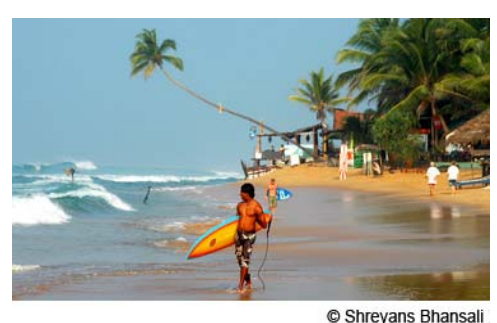
Surfing in Hikkaduwa

Sri Lanka has long pursued a policy of developing a sustainable tourist industry but suffered severe setbacks because of the civil war and the 2004 tsunami. 152 Now that the war has concluded, the government hopes to develop tourism to the point that it could produce USD 3 billion annually by the middle of this decade. It has designated numerous areas for development as tourist zones. 153 These include the World Heritage site of Sri Lanka's "second city" Kandy, which is renowned for the Temple of the Tooth, a major Buddhist temple that