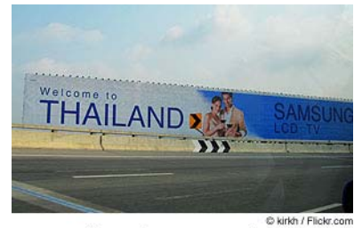
Korean Samsung sponsoring Thai tourism

Carabao's satirical lyrics from its 1984 hit Made in Thailand reflect an opinion sometimes voiced by Thais namely, that in their rush to embrace the cultural cachet of Western and Japanese brands, the Thai people have lost sight of the richness of their own culture and the quality of the products that they produce. This situation is most evident in Bangkok. Nonetheless, Thai "culture" (a word that really has no equivalent in the Thai language)