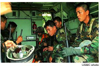
Royal Thai Marines inside an assualt vehicle

The Thai military consists of three main branches, with overall personnel estimated to be nearly 250,000. These branches are the Royal Thai Army (123,000), the Royal Thai Navy (77,000, including members of the Royal Thai Marine Corps), and the Royal Thai Air Force (47,500). An additional 200,000 personnel comprise the nation's reserve forces.<sup>269</sup> Under Thai law, all males are required to register for the military draft at age 18, but do not begin