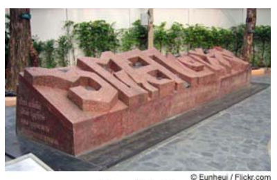
Memorial for the massacre of 1973

By 1973, student and worker protests against the government triggered escalating confrontations with the police and military forces. On 14 October 77 students were killed in violent protests in Bangkok.<sup>120</sup> When the army commander refused to use any additional force against the students, King Bhumibol stepped in and urged Thanom to go into exile.<sup>121</sup> The King subsequently chose a civilian interim prime minister to replace Thanom, and