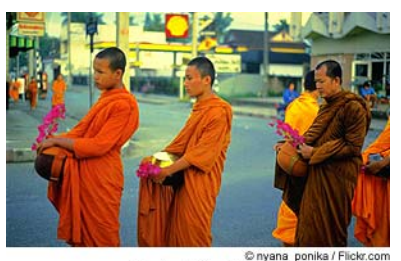
Monks Collection Alms in Chiangmai

Theravada Buddhism is the most widely practiced religion in Thailand. About 95% of the majority ethnic Thai population follows this school of Buddhist belief, which first became the state religion during the Sukhothai Dynasty in the 13th century.<sup>214, 215</sup> Throughout the country there are thousands of Buddhist wats , which are monastery temples that usually include prayer rooms, libraries, meeting halls, living quarters for monks, reliquaries, and bell towers that summon monks for prayers.<sup>216</sup>