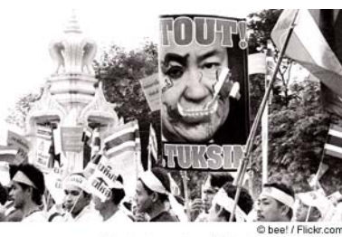
Protestors at a rally in Bangkok, 2006

Nevertheless, the government is moving ahead with plans to amend the eight-month-old 2007 constitution, which strengthened the powers of the government bureaucracy, military, and nonelected officials at the expense of elected government officials and political parties.<sup>324</sup> A recent national poll revealed that 55% of Thais believe that violence and other troubles could occur if the constitutional changes are pursued.<sup>325</sup>