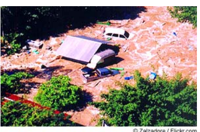
Flooding caused by the tsunami of 2004

Generally, Thailand is not affected by geophysical natural hazards, such as earthquakes and volcanic eruptions. However, its low-lying Andaman Sea coast has recently proven to be disastrously vulnerable to tsunamis generated by earthquakes. In December 2004, a massive earthquake in the coastal regions near the northwestern tip of Sumatra led to the deadliest disaster in Thai history.<sup>58</sup> The coastal provinces of Phang Nga, Krabi,