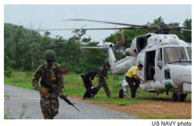
Royal Thai Navy helicopter

21 years of age for compulsory military service; 18 years of age for voluntary military service; males are registered at 18 years of age; 2-year conscript service obligation (2006).