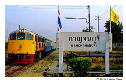
Train Station, Kanchanaburi

Thailand has an extensive network of roads and railways, especially in regions in which the topography is amenable to development.<sup>193</sup> It is also the home of one of Asia's regional air hubs, Bangkok's Suvarnabhumi International Airport. The country has several sea ports, with the largest ones located in Bangkok and Laem Chabang. The latter port, the largest in Thailand, is relatively new and is located southeast of Bangkok on the northern Gulf of Thailand.