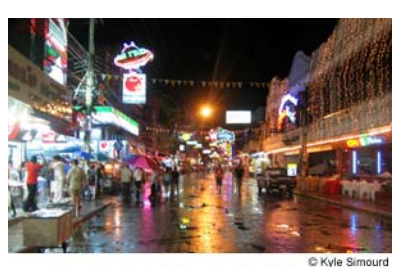
Rainy night in Pattaya, Thailand

Thailand has a tropical climate that features three distinctive seasons: the dry/cool season of the northeast monsoon (November–February), the hot season (March– April), and the rainy season of the southwest monsoons (May–October). However, within Thailand, variations from these general patterns do exist. For example, during the northeast monsoons, which for most of the country bring winds that blow in over land rather than the sea,