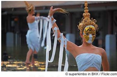
Traditional dancers in a shrine, Bangkok

Contemporary dramatic performance in Thailand spans a wide range of genres, from those originating from royal court performances centuries ago to more recently evolved styles. One of the traditional court styles is khon , which uses dance to dramatize stories from the Ramakien , the Thai version of the Hindu Ramayama epic.<sup>238</sup> The masked dancers' head coverings and costumes are extremely elaborate and often decorate the covers of