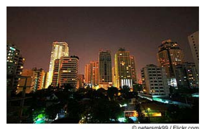
Bangkok skyline at night

Overall, the economy continues to depend on exports to sustain growth, as the growth rate of domestic demand (private and government consumption plus gross fixed investment) has continued to decrease.<sup>200</sup> Export revenues continued to grow strongly in 2007, increasing by 18.1%. However, Thai economists remain concerned about the high value of the baht , which impairs the competitiveness of Thai products on the international market. In addition,