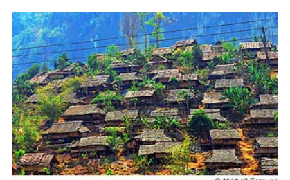
Refugee camp between Thailand and Burma

Thailand's most problematic neighbor is Burma, a country that has been ruled by two successive military juntas since 1962. Nine refugee camps along the Thai-Burmese border are home to more than 150,000 Burmese refugees, almost all of whom are members of the Karen and Kayah (also known as Karenni) ethnic groups.<sup>295</sup> The