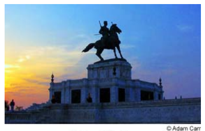
Statue of King Naresuan, Ayyuthaya

During the 16th century, Ayutthaya increasingly found itself in conflict with the Burmese, who conquered the Lanna capital of Chiang Mai in 1558 C.E. From 1569 to 1584 C.E., the Burmese gained control of Ayutthaya and made it a tributary state, but they were ultimately driven out by Crown Prince (and later King) Naresuan. The culminating Battle of Nong Sarai (1593) between Naresuan's army and the forces led by a Burmese crown