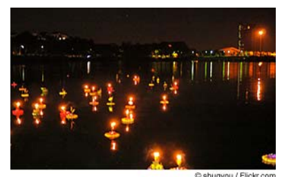
Loi Krathong offerigs floating down a river

http://www.rest.or.th/forum/medias/Hill_Tribes_and_Cultural_Tourism_in_Thailand.doc