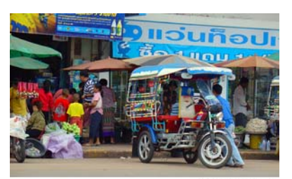
A tuk-tuk in Udon Thani, Thailand

Udon Thani (also known as Udorn) is the largest city in the northern part of the Khorat Plateau and, like Nakhon Ratchasima to its south, it went through a boom period during the Vietnam War when the United States military utilized the nearby Udorn Royal Air Force Base.<sup>46</sup> The city today is an industrial and commercial center for the surrounding region; its major products include rice, livestock, freshwater fish, and timber.<sup>47</sup>