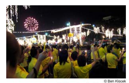
Celebrating the king's birthday

March 2008); House of Representatives - last election held on 23 December 2007 (next to