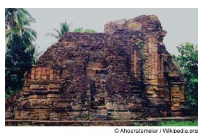
Ruins of Wat Kaew, Chaiya, Thailand

Between the 9th and 13th centuries C.E., the Khmer of Cambodia expanded their empire northwestward into the Khorat Plateau and ultimately into the central plain of Thailand. At its height, the Khmer domain extended over about one-half of modern Thailand, reaching as far as Chiang Mai in the northern mountains. The Khmer located their capital at Angkor, and today the city's temple complex (Angkor Wat) is one of the world's most