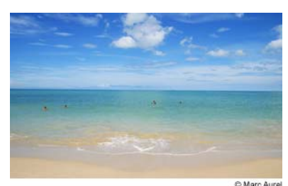
Khao Lak beach on the Indian Ocean, Thailand

From the northernmost portion of the Bay of Bangkok southward to the Malaysian border, Thailand's western edge is defined by a long, narrow stretch of land that forms the spine of the Malay Peninsula. At the northern end, Thailand's peninsular region is marked by an extension of the northern mountains. Here the peaks of the Bilauktaung Mountains define the border between Thailand and Burma. Near the town of Prachuap Khiri