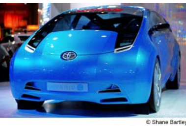
Car show in Bangkok

The rapid increase of foreign direct investment (FDI) into Thailand slowed significantly during 2006, partly as a result of political instability leading up to the military coup in September.<sup>165, 166</sup> After the coup, one of the first moves by the military's appointed cabinet was to propose an amendment to Thailand's Foreign Business Act that would have tightened restrictions on foreign ownership in some key industries. This move was seen as a response to