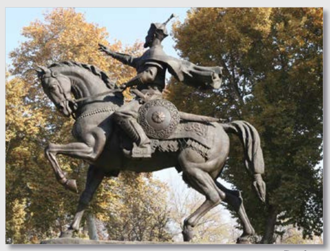
Timur Statue