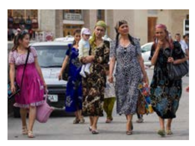
Women in Dresses

European-style clothing is common among modern, urban Uzbeks.<sup>37</sup> Islamic culture normally dictates modesty in dress, and clothing should not show much skin. Trousers and long-sleeved shirts are the appropriate wear for men. Similarly, long-sleeved blouses and long skirts are a good choice for women. Uzbek women often wear headscarves, and occasionally, the fuller covering for the head and face is seen.<sup>38</sup>