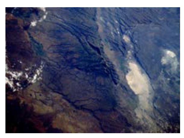
Turkmenistan-Uzbekistan border

Strain and cautious optimism define the relations between Turkmenistan and Uzbekistan. 40 The Uzbek minority Turkmenistan and the Turkmen in minority in Uzbekistan have experienced discrimination in times of economic decline.41 In 2002, charges of Uzbek complicity in an assassination attempt on Turkmenistan's president heightened tensions between the two countries.<sup>42</sup> Yet the leaders of the two countries have met several times and sought to expand cooperation and defuse tensions. 43,44 In