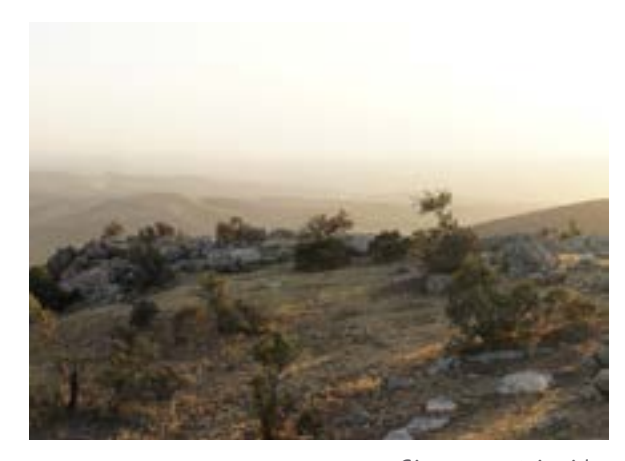
Gissar mountain ridge

Uzbekistan is a doubly landlocked country, meaning that its neighbors are also landlocked. It is one of only two such countries in the world. The nation features a diverse topographical landscape that includes high mountains and glaciers. At lower elevations, dry steppes and deserts predominate. Nearly 80% of Uzbekistan is covered with desert. The largest is the Kyzyl-Kum Desert (also spelled Qizilqum) in the north central region. The mountain areas of the far southeast and far northeast have elevations as high as 4,500 m (14,763)