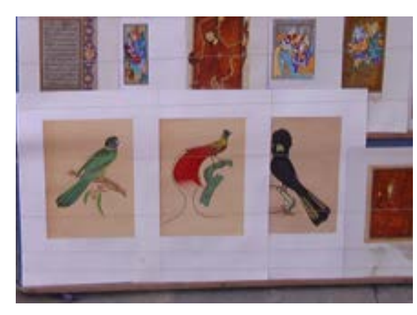
Artistic prints

Uzbekistan has a well-established literary tradition, dating back to Alisher Navai, a prodigious 15th-century pioneer in Turkic literature. Turkic literature. Uring the Stalinist purges of the 1930s, artists of all types, including writers, suffered greatly. They faced the prospect of being named an "enemy of the people," making them eligible for the death penalty. As a result, Uzbekistan's flourishing literary scene declined under Soviet rule. In order to earn a living, writers were forced to produce socialist realist prose that depicted communism in a