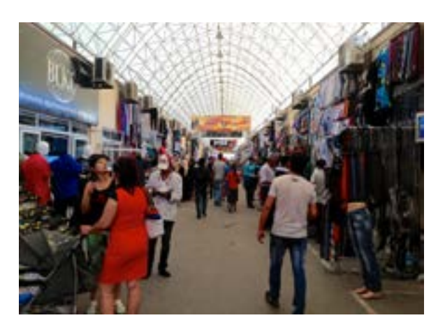
Ippodrom Bazaar

Official statistics indicate that Uzbekistan has made significant progress in improving its citizens' standard of living in recent years. The country has the third-lowest rate of poverty in Central Asia, with a per capita income of USD 6,500 in 2016.<sup>47,48</sup> Life expectancy is 73.8 years, making Uzbekistan 126th in the world. The infant mortality rate is 18.6 deaths per 1,000 live births.<sup>49</sup> In January 2017, the Uzbek government signaled it would devote increased effort and resources toward socioeconomic development.<sup>50</sup>