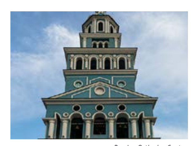
Russian Orthodox Center

By the 19th century, Russian interest in Central Asia had increased; the Russians were concerned that the British might gain control of the region. Shortly after the Russians began asserting control over Central Asia in the mid-19th century, the United States Civil War broke out. Because Europeans had relied on cotton from the American South to manufacture textiles, they needed to find an alternate source. The tsarist rulers of Russia saw Uzbekistan and surrounding regions as a suitable replacement site to grow cotton.<sup>21</sup>