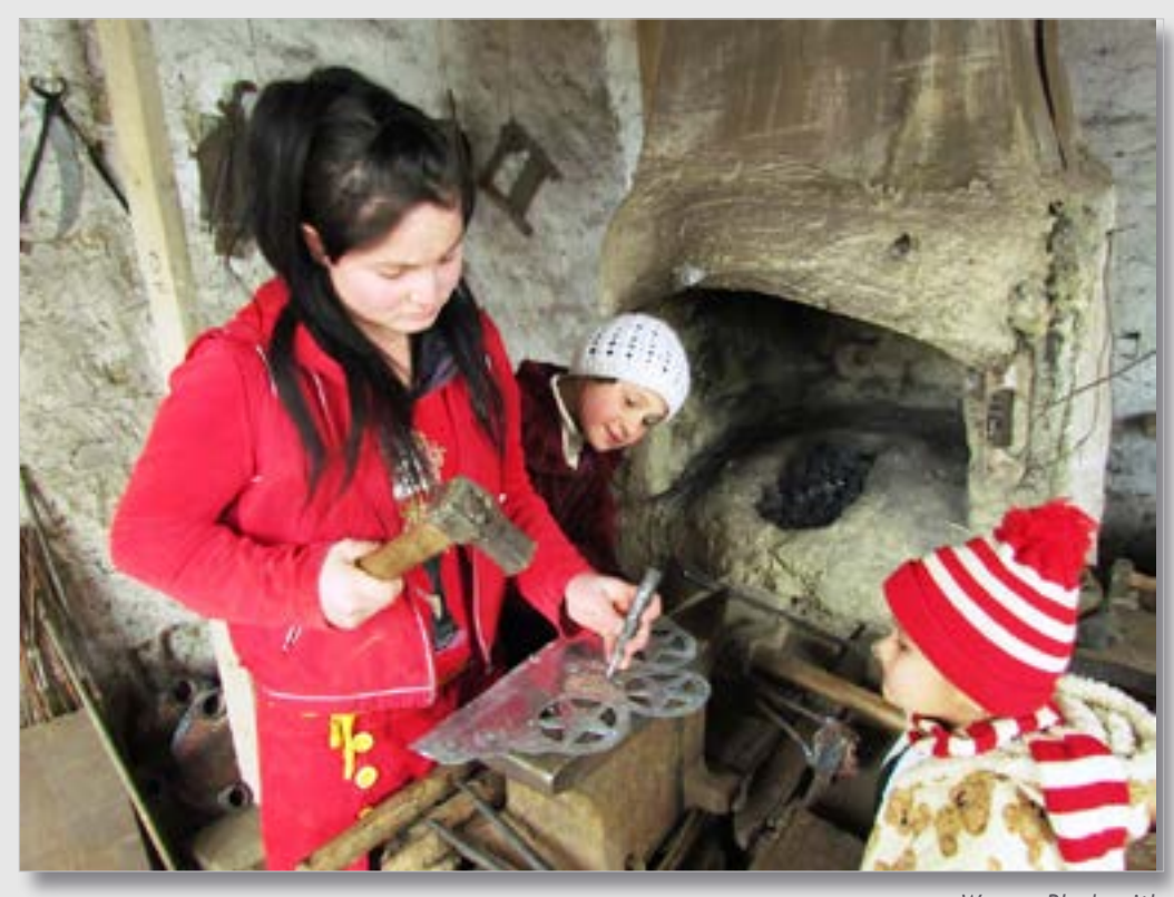
Woman Blacksmith