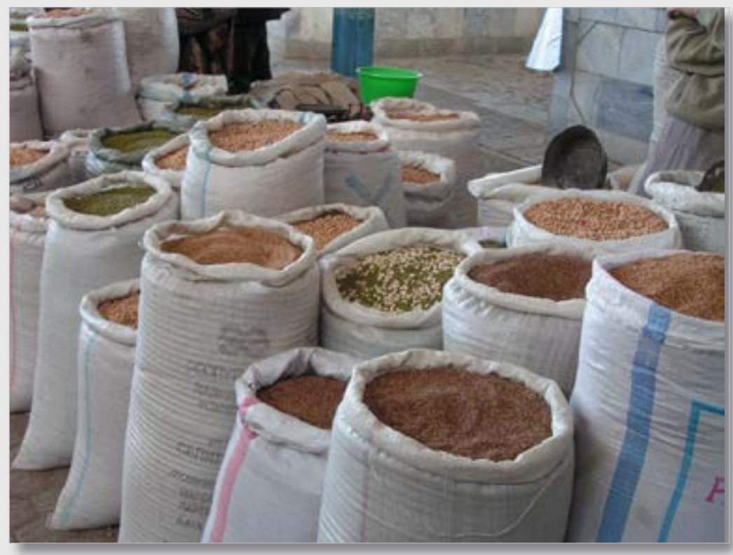
Grains in Samarkand