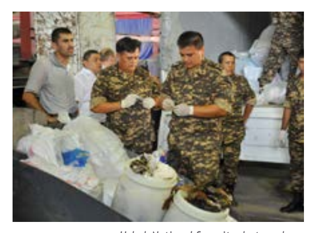
Uzbek National Security destroy drugs wikipedia

While the Uzbek government does not release crime statistics, the country is perceived as having a moderate level of crime. Violent crimes are reported in Tashkent's poorer neighborhoods. Muggings, petty theft, vehicle theft, burglaries, and credit card fraud occur regularly. Foreigners are perceived as wealthy and are often targeted. Criminality may be driven by increasing food and fuel prices and by the endemic corruption that permeates government and the private sector. 95,96