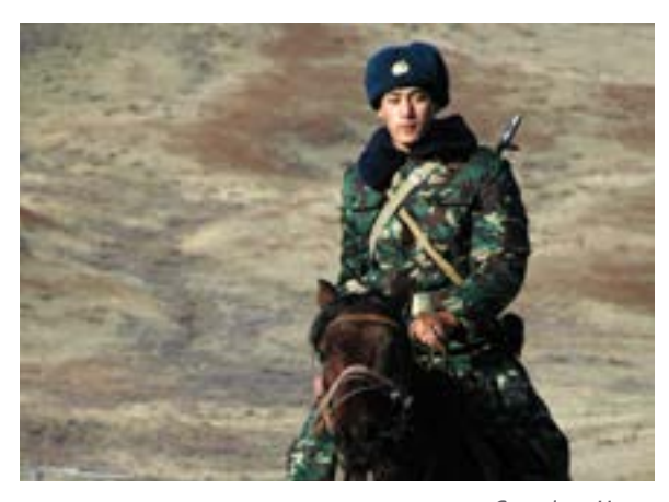
Guard on Horse

Charged with protecting the borders from infiltration by Islamist terrorists from neighboring countries, the Uzbekistani Border Guards rely heavily on highly mobile paramilitary units to engage in such counterterrorism operations. At the turn of the century, US military advisors assisted in training units. But with fewer than 1,000 personnel and inadequate equipment, the force is thinly spread over the long borders and must frequently coordinate with the armed forces when dealing with armed terrorists.<sup>85</sup>