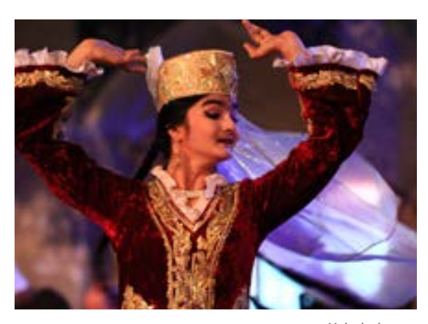
Uzbek dancer

Uzbeks, who account for 80% of the population, are primarily of Turkic, Mongolian, and Persian origin. Their name is believed to come from Öz Beg, a powerful 14th-century Mongol leader. Their Turkic-derived language is one of the most widely spoken in Central Asia. Sizeable minorities of Uzbeks are found in Afghanistan, Tajikistan, Kyrgyzstan, Kazakhstan, and northwest China. 5,6,7 Uzbeks are generally followers of Sunni Islam and are considered among the most religious Muslims and least Russified peoples in Central Asia.8,9,10