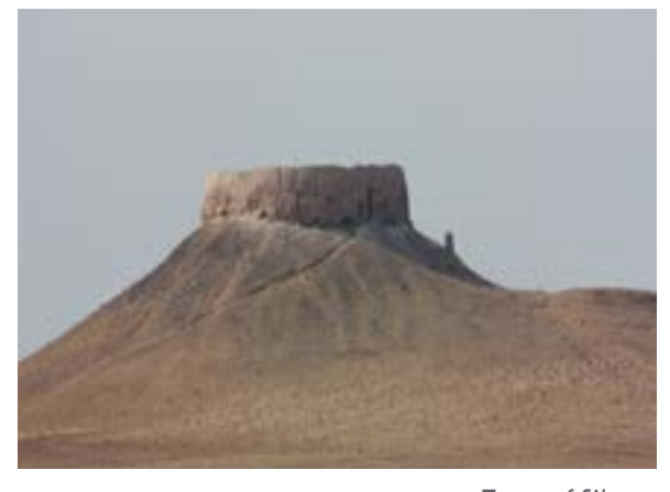
Tower of Silence

During the first millennium BCE, Indo-Iranian nomads arrived in present-day Uzbekistan. They constructed irrigation systems along the rivers of Central Asia and built settlements in Samarkand and Bukhara. These towns became thriving and wealthy resting points on the Silk Road, which commercially linked Europe and Asia.<sup>4</sup>