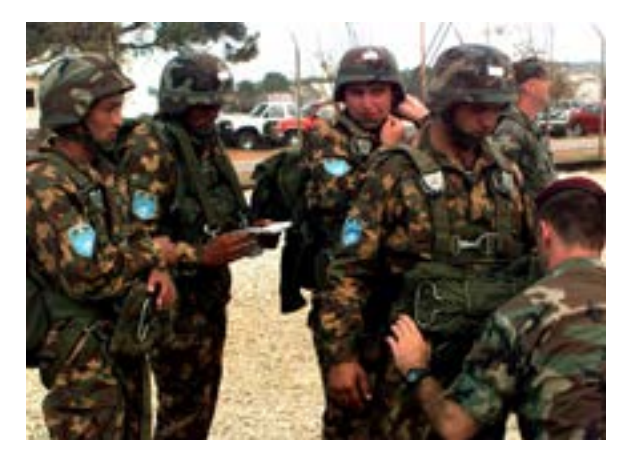
Uzbek Soldiers parachute training wikipedia

Estimated to have 50,000 troops, the army consists of 15 infantry brigades (11 motorized rifle brigades, one light mountain brigade, one air assault brigade, one airborne brigade, and one special forces unit), one tank brigade, and seven artillery brigades (including one multiple rocket launcher (MRL) brigade). Bases are located in Tashkent, Termez, and Fergana; garrisons are situated in Bukhara, Fergana, Samarkand, Tashkent, Termez, and Urgench. 66,67,68 The army relies on Soviet-made battle tanks, infantry fighting