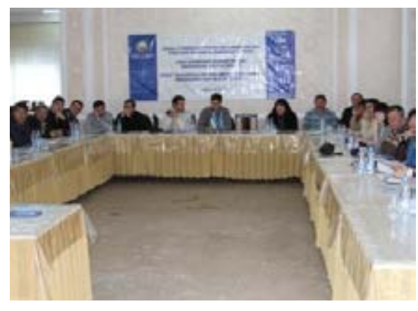
Uzbekistan tourism Flickr / United Nations Development Programe

Since independence, Uzbekistan has developed a reputation for unreliability due to its approach to trade, and for violating its own laws guaranteeing foreign investors' rights.<sup>39,40</sup> Despite these challenges, exports have been on a generally upward swing, reaching USD 12.9 billion in 2017.<sup>41</sup> Uzbekistan is the world's 100th largest export economy. In 2015, the country exported USD 5.85 billion and imported USD 10 billion.<sup>42</sup>