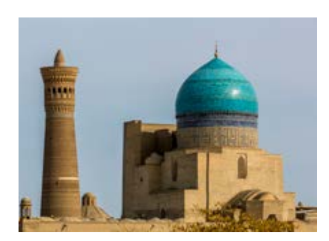
Poi Kalyan Mosque Complex

Karakalpaks are a Turkic people, like the Kazakhs. The Karakalpak language belongs to the Qipchaq family of Turkic languages. The Karakalpaks settled in the region surrounding the Amu Darya in the 18th century. In 1936, the Karakalpakstan region became an autonomous republic in the western half of the Uzbek Soviet Socialist Republic. Itretainedits autonomous republic status within independent Uzbekistan. Today, Karkalpaks in Uzbekistan suffer from economic stagnation, ecological and health problems from the receding Aral