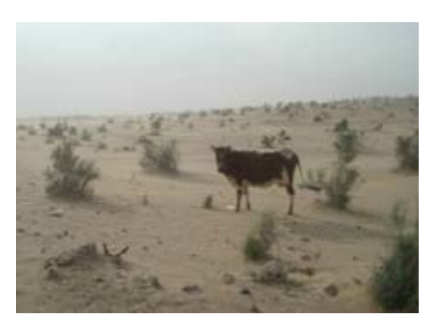
Samarkand City Center

The disappearance of the Aral Sea ranks among the world's biggest environmental disasters of the 20th century. As the water has receded, more than 60,000 sq km (23,166 sq mi) of former seabed have been left bare. 58 In addition to salt, the dry seabed is covered by a thick layer of chemical fertilizer residue. This debris is blown about in toxic plumes by strong winds, affecting crop quality and yields, natural ground cover, air quality, and the life expectancy of livestock and humans. 59,60