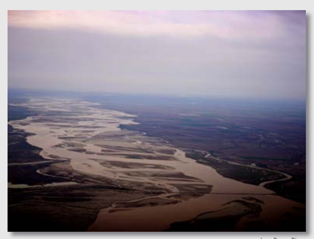
Amu Darya River