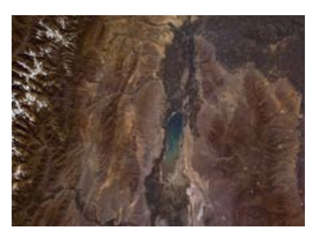
Nasa border view

Uzbekistan's relations with Kyrgyzstan have been problematic. The border between the two countries remains largely undefined, and each has small enclaves within the other's territory. 26,27 One border issue concerns an enclave that Uzbekistan acquired under Soviet rule, which has not been restored to Kyrgyz sovereignty. 28 Political instability and ethnic conflict in Kyrgyzstan, and the threat of Kyrgyz Islamist fundamentalists, have prompted Uzbekistan to tighten border controls, plant mines, and amass troops along the