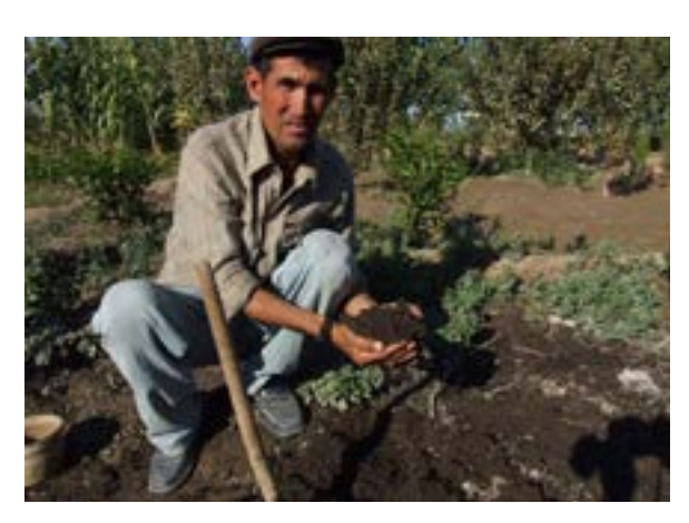
Energy efficient irrigation

Other than cotton, a considerable portion of Uzbekistan's international exports consists of extracted natural resources, particularly gold. Uzbekistan's Murunatu gold mine is the largest open-pit gold mine in the world, and the country is the world's 12th largest gold producer. Additionally, state companies operate 48 mines and processing facilities that produce lead, copper, zinc, molybdenum, tellurium, bismuth, and uranium.<sup>21,22</sup> Reliance on commodity exports has caused earnings to be affected by international price fluctuations.<sup>23</sup>