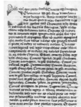
Croatian-Hungarian Agreement

Venice withstood Ottoman assaults to retain control over much of the Dalmatian coast up until the late 18th century. Between 1797 and 1809, Napoleon's forces defeated both Venice and Austria, allowing France to take control of Dalmatia, the formerly independent city-state of Dubrovnik, and western Croatia. These areas were incorporated into the so-called French Illyrian Provinces, which extended north of the Adriatic. While the region soon returned to Austrian control, French revolutionary ideas contributed to growing nationalism among the Croats. These sentiments coalesced in the Croat-led Illyrian movement of the 1830s and 1840s. In response to Hungary's efforts to institute Hungarian as the official regional language, the Illyrian movement promoted the Croatian language and called for the unification of the South Slavs. 89 In 1848, the Croats took up arms against the Hungarians when the latter group tried to revolt against the Austrian government. Yet the Croats suffered equally alongside the Hungarians as Austria implemented absolutist rule in the wake of the failed revolt. In 1867, Austria compromised with Hungary by establishing the Dual Monarchy, a power-sharing arrangement, under the auspices of the Austro-Hungarian Empire. 90