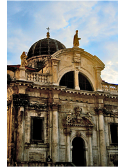
St. Blaise Church, Dubrovnik

Croatia's long history as a base of Christianity has endowed it with an abundance of Christian churches, cathedrals, basilicas, monasteries, and other religious venues. Many of these venues date to the ancient era. Smaller numbers of religious sites are oriented toward the country's small non-Christian population. Many regional religious venues were destroyed in the conflicts of the 1990s. Reflecting lingering ethnic and religious tensions, non-Catholic religious venues, especially Serbian Orthodox churches, remain subject to vandalism in Croatia. Some formerly church-owned property, primarily that of the Serbian Orthodox Church, has yet to be restituted following its confiscation by the socialist Yugoslav government several decades ago. The Catholic Church has reclaimed most of its properties. 190