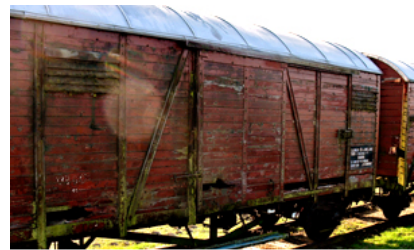
Train which carried prisoners to Jasenovac

World War II began in September 1939, leading to the Axis invasion and partition of Yugoslavia in 1941. Croatia and Bosnia and Herzegovina were restructured as the Independent State of Croatia. Nazi Germany placed Ante Pavelić and his Ustaša group in power following Maček’s refusal to collaborate. The fascist Ustaša implemented an intensive campaign to annihilate the region’s Serbs, Jews, and Roma (Gypsies). Their methods included “forced religious conversion, deportation, and extreme violence.” 99 A large number of victims were exterminated in massacres and concentration camps. (Estimates of those killed by the Ustaša remain a subject of great controversy between Croats and Serbs; high estimates reach upward of several hundred thousand.) 100 Reflecting the region’s bitter religious divisions, the Ustaša received the support of some high-ranking clergy members of the Croatian Catholic Church. The group’s methods were so brutal that the Germans themselves were said to be shocked by the violence. 101