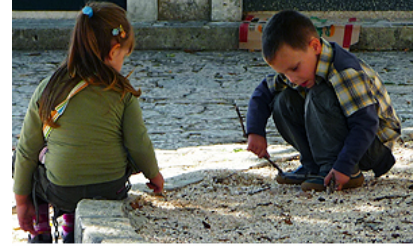
School age kids

The Croatian education system is largely public. Preschool, which is not mandatory, is provided by the state, although coverage is not comprehensive. 323 Rural areas often lack preschool and daycare services. 324 Elementary education, which is free and compulsory, consists of 8 years of schooling. Children enroll at age 6 or 7 and graduate at 14 or 15. Rural Croatians typically have access to a local elementary school. 325