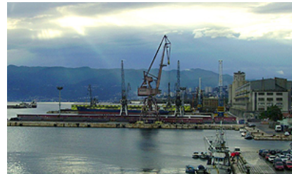
Rijeka seaport

Once the foundation of the Croatian economy, agriculture now accounts for only a small share of GDP (an estimated 6.3% in 2009) and a small share of the workforce (5% in 2008). 130 Agricultural production is centered in Slavonia, a fertile grain-producing region that is often described as the granary or breadbasket of Croatia. Large-scale commercial operations are the norm in this region. Scattered areas of farm and graze land are used for small-scale operations in the central