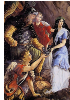
Arrival of the Croats to Dalmatia

In the 6th century, Slavs began to settle the Balkan region, portions of which were then occupied by the Avars, a group of Eurasian nomads. The Croats were among these settlers, who were mostly farmers and herders. While their exact ethnic and geographic origins remain unclear, the Croats are thought to have migrated from the north, from the plains of modern Poland, Ukraine, and Belarus. 72 The Croats gradually spread southward from the Pannonian Plains, over