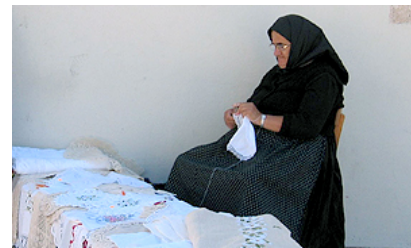
Woman selling lace

Croatian families are traditionally patriarchal, with the father seen as the head of the household. While this view remains common among conservative families (especially in rural areas), progressive attitudes toward gender roles have contributed to greater gender equality in Croatian society. Thus, while men are traditionally seen as the family breadwinner, it is common for Croatian women to contribute to the family's finances by working outside the home. In 2009, Croatian women comprised more than 46% of the labor force. 351 However, they continue to earn significantly lower