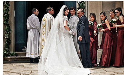
Wedding in Dubrovnik

Croatian weddings can be formalized through either religious or civil ceremonies. Croats are traditionally married in the Catholic Church. In most countries, civil ceremonies encompass the legal component of the marriage, as recognized by the state. However, the Croatian government has an agreement with the Catholic Church that allows marriages within the Church to be formally recognized by the state without civil registration. (The government has similar agreements with other