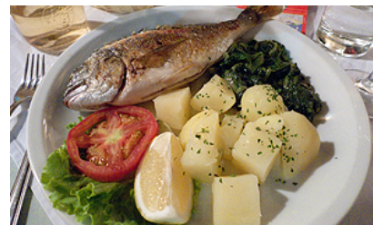
Fish dinner

Croatian cuisine varies widely by region. These regional differences reflect the country's geographic diversity and long history of exposure to varied cultural influences. Residents of the Adriatic coast and islands enjoy a Mediterranean diet characterized by seafood, lamb, pasta, vegetables, red wine, olive oil, and herbs. 212 A typical meal along the coast can consist of risotto with seafood or, in Dalmatia, fish