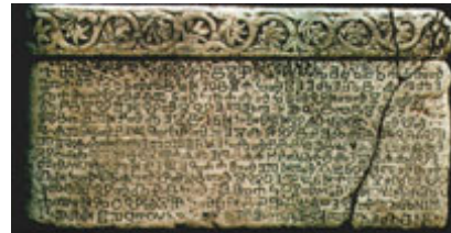
Baška tablet

Croatian has three main dialects: Čakavian, Kajkavian, and Štokavian. The Štokavian dialect has three styles of pronunciation: Ekavian, Ikavian, and Ijekavian. (The differences in pronunciation concern one of the language's formative vowels.) Standard Croatian, which is used for official purposes, is based on the Štokavian dialect and Ijekavian pronunciation. 152 While Croatian is the country's official language, several minority groups are permitted to use their own languages for education, media, and official correspondence at the local level. 153, 154