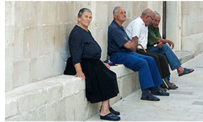
Woman resting outside a church

Traditionally, Catholic values played an important part in shaping gender roles in Croatian society. Croatian culture has since been influenced by the socialist policies of the Yugoslav government and the modern, liberal attitudes of Europe and the West. Among Catholicism's traditional values are prohibitions against birth control and abortion—issues that disproportionately affect women. Such prohibitions correspond with the traditional Catholic ideal of women as faithful wives and productive mothers. Contraception is legal in Croatia, although access, as well as formal sex education, is limited. Abortion is also legal, though it is denounced by the Catholic Church, which has strongly but unsuccessfully lobbied the Croatian government for its prohibition. 178 The majority of the population reportedly supports the right to have an abortion. 179 In terms of religious practice, women may serve as nuns within the Catholic Church but cannot be ordained as priests.