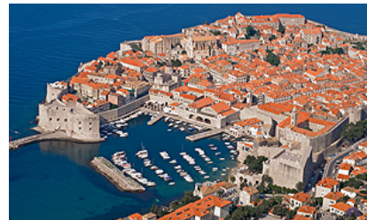
The walled city of Dubrovnik

Although smaller than many other Croatian cities, Dubrovnik is a major hub for the Croatian tourism industry. The city is located on the southern Adriatic coast, in the small stretch of Dalmatia separated from the rest of Croatia. It is situated on a former islet that was connected to the mainland to form a promontory. Known throughout much of its history as Ragusa, the settlement was founded by Romans in the 7th century