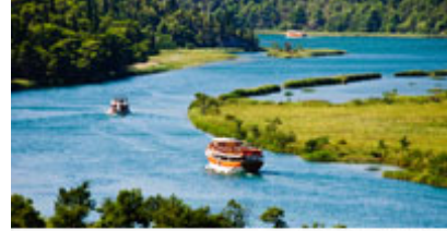
Krka is a river in Croatia's Dalmatia region

Croatia has 26 rivers that measure in excess of 50 km (30 mi). Drainage occurs in two major basins separated by the Dinaric Alps: the Danube River Basin of the north and the Adriatic Basin of the south. 34 In the north, the major waterways are the Drava and Sava. The Drava originates in Italy, flows through southern Austria, then through Slovenia into northern Croatia, where it forms most of the Croatia-Hungary border.