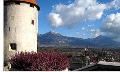
Croatian mountains

Croatia is located in southeastern Europe, on the northwestern Balkan Peninsula, across the Adriatic Sea from Italy. The country is shaped like a boomerang, with a lower arm extending in a southeasterly direction along the Adriatic Sea, and an upper arm extending eastward into the interior. Croatia shares borders with five countries. Slovenia lies to the northwest and Hungary is located to the northeast. On the eastern edge of its upper arm, Croatia shares a border with Vojvodina, an autonomous province in Serbia. To the southeast, Bosnia and Herzegovina occupies the region between Croatia's upper and lower arms. In the south, a small portion of Bosnia and Herzegovina extends to the Adriatic Coast, separating the southern tip of Croatia's lower arm from the rest of the country. This detached southern region shares a short border with Montenegro. Mainland Croatia's extensive coastline on the Adriatic Sea measures 1,777 km (1,104 mi). 7 The country also possesses 1,185 islands in the Adriatic. 8 Overall, Croatia comprises an area of 56,542 sq km (21,831 sq mi), making it slightly smaller than West Virginia. 9