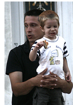
Father and son

In Croatia, household size and composition has been affected by numerous factors, including “the decreasing birth rate, the decline in fertility, rising levels of emigration and ageing, and the increase in the average age at which people get married and have children.” 345 The majority of households consist of two to four members, 346 with an average of three people (2001). Reflecting a gradual decrease in household size, families with three or more children comprise less than 10% of households (2001). 347 Rural families are likely to have more children than urban families.