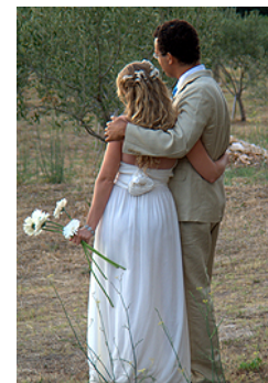
New couple

The Catholic Church, to which most Croats belong, views marriage as a sacrament, or sacred rite. In general, marriage remains an essential and highly valued institution in Croatia. For Croats, marriage follows casual dating, which is common practice among teenage youth and young adults. Couples may live together before marriage, but childbirth outside of wedlock remains stigmatized, in part due to Catholic beliefs. 361 Legally, the minimum age for