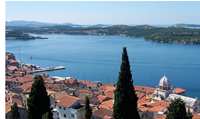
Adriatic Coast

Climate conditions vary according to region. The Adriatic coast and islands experience a Mediterranean climate with mild, damp winters and warm, dry summers. The northern coastal region is affected by a northeasterly wind known as the bora ( bura ), which blows from the interior out over the Adriatic Sea. Occurring September to May, this cold and often strong wind makes the north cooler and drier than the south. 25 During the same period, the southern coastal region of Dalmatia receives warm, humid sirocco ( jugo ) winds that bring moderate precipitation. 26 From north to south, average winter temperatures along the coast range from 2–9 °C (36–48 °F). 27 In the summer, cooling mistral ( maestral ) winds blow from the sea toward the coast, moderating the temperature and contributing to dry weather. 28 Indeed, sustained dry spells during the summer can lead to water shortages that necessitate rationing. 29 Average summer temperatures range from 24 °C (75 °F) in the north to 26 °C (79 °F) in the south. 30