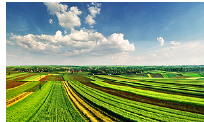
Pannonian Plain from the Serbian side

Historically known as Croatia-Slavonia, the upper arm of Croatia is dominated by the Pannonian Plain and its hilly outlying reaches, the Peri-Pannonian Plains. The Pannonian Plain is an expansive basin stretching throughout Central and Eastern Europe. It extends into northern Croatia from neighboring Hungary and Serbia. This region consists of flat and rolling lowlands marked