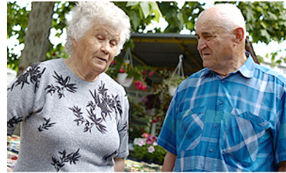
Older couple at the marketplace

Divorce is traditionally discouraged, and it is not recognized by the Catholic Church. Croatia retains a relatively low divorce rate, typically ranging from 15–20%. 369,370 Divorce is more common in cities than in rural areas, where traditional, conservative values are stronger. 371 Croatian law requires divorcing couples to split evenly any property obtained during the marriage. Both spouses retain equal responsibility for supporting the children produced within the marriage. 372