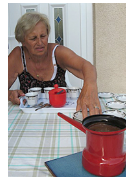
Serving coffee

Meals are typically casual social affairs. When dining at a home, guests should wait to be seated until the host directs them to a certain spot or invites them to seat themselves. Meals typically include an appetizer, soup, main course, and dessert; wine may be served throughout the meal. Table manners are similar to the dominant culture in the U.S. Guests wait for the host to begin eating. The fork and knife are held in the left and right hands, respectively, while the napkin is kept in the lap. 208 At formal engagements, it is polite to keep elbows off the table. Meals are typically casual rather than rushed, and conversation occurs throughout. Guests are expected to eat heartily; eating very little might cause offense. 209