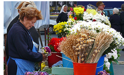
Selling flowers on Zagreb's central market

For meals and social engagements at a home, guests should arrive around 15 minutes later than the arranged time. Although such practice is not widespread in Croatia, guests may need to remove their shoes upon entering the home. 205