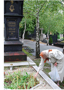
© Michael Daines Woman tending a grave

The body of the deceased is traditionally washed and clothed in preparation for burial. A wake, or display of the body, is held prior to the funeral, traditionally in the home of the deceased. 376 Catholic rites include a funeral Mass at a local church and a prayer service at the gravesite. The body, enclosed in a coffin, is traditionally carried to the gravesite by pallbearers, who are followed by a procession of mourners. The burial is usually followed by a reception at the home of the deceased. 377