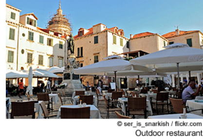
Outdoor restaurant

Croatian cities have a wide variety of dining establishments, including formal restaurants ( restoran or restauracija ), those associated with lodging (at an inn) or a self-standing site (taverns) with average fare ( gostionica or konoba -primarily in Dalmatia), pubs ( pivnica ), cafés ( kafić or kavana ), bistros, pizzerias, and self-service cafeterias ( samoposluživanje ). 256 Zagreb has many exotic restaurants, but most Croatian dining establishments specialize in regional fare. 257 Customers may typically choose their own table at restaurants. It is common for menus to have English translations. 258