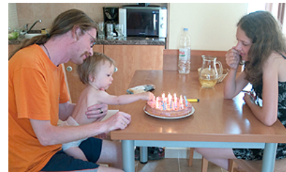
Celebrating a birthday

Nuclear families, comprising a married couple and their children, are the norm in Croatia. This pattern is especially the case in urban areas. Yet it is also common for Croatian households to contain three generations, including children, parents, and grandparents. 342 Croatian custom is to care personally for elderly relatives, rather than placing them in a retirement home. Living arrangements are also often determined by finances, as younger or older family members may not