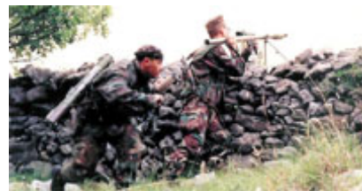
Soldiers preparing to fire

Franjo Tuđman, who would serve as Croatia's president from 1990–1999, initially enjoyed the success of securing Croatia's independence and victory in the war. Yet economic strife—due in large part to the devastation caused by the war—and corruption scandals contributed to a decline in public support for Tuđman and the HDZ. Tuđman's death in December 1999 was followed by elections in January 2000 that placed a