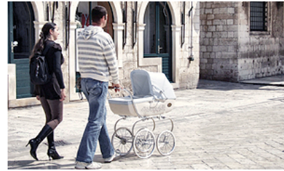
Strolling in the streets of Dubrovnik

The Catholic Church emphasizes family propagation. While children are highly valued, modern Croatian couples have, on average, delayed childbirth and had fewer total children than Croatians in decades past. 366 Contraception and abortion are both legal, although the Catholic Church discourages the former and denounces the latter. Perhaps reflecting the resurgence of traditional values, the annual number of abortions has decreased dramatically in Croatia since it became an independent country. 367