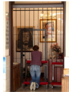
Prayer in daily life

Identification with Catholicism surged among Croats during the country's early years of independence as the religion was widely embraced as a symbol of Croatian identity and nationality. Its practice has since been fostered among younger generations by the introduction of Catholic instruction in school, which is optional but strongly encouraged and widely attended. Traditional Catholic values remain strongest among older generations. Studies have noted that younger generations have adopted Catholic values alongside permissive, liberal attitudes to form a more "individualized faith" that is not representative of traditional Catholic dogma. 180,181 Catholic practice in Croatia continues to carry not only religious but social and political implications. As