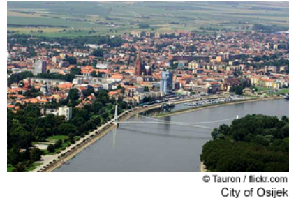
City of Osijek

Located on the upper arm of this boomerang-shaped country, Osijek is the major urban center of the fertile Slavonia region. It lies on the far northeastern border, near Hungary and Serbia. The city is situated on the Drava River, in close proximity to its confluence with the Danube River. While long the site of settlement, the modern city developed in the 19th century as an industrial and manufacturing center. 53 Local industry was severely hampered in 1991, when Osijek suffered significant damage as a result of a sustained shelling campaign by the Yugoslav army and rebel Serbs. 54 The city and surrounding region (eastern Slavonia) have historically been home to sizable Serb communities. Yet their numbers greatly decreased due to the conflict and lingering ethnic tensions, which remain pronounced in war-affected areas such as eastern Slavonia. 55 Osijek has revived since the war, and it remains a regional industrial and transportation hub. It is a market and processing center for Slavonia's agricultural produce. The city's population was 90,411 at the time of the 2001 census. 56