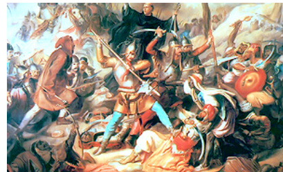
Ottoman-Habsburg wars

The Byzantine Empire collapsed in the mid 15th century amid the expansion of another regional power, the Muslim Ottoman Turks. In the early 16th century, the Ottomans captured much of the Croatian region as part of their push into Europe. The Hungarian-Croatian crown came under the control of the Hapsburg emperor of Austria, who set up an extensive Military Frontier ( Vojna Krajina ) that ran through Croatia along the Ottoman border. 84 The frontier was guarded by Serbs, Hungarians, Germans, and other recruits who received land for their service. Their settlement gave rise to the "ethnic patchwork" that persists in the Krajina and Slavonia regions of Croatia and the Vojvodina region of Serbia. In both the short and long term, the settlement of Orthodox Christians, namely Serbs, gave rise to religious tensions in the predominantly Catholic region of Croatia. 85