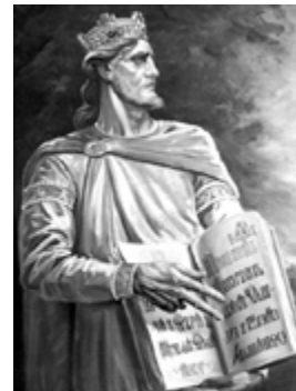
King Zvonimir of Croatia

Croat kings remained independent until the late 11th century, but the kingdom weakened as it suffered from infighting and external