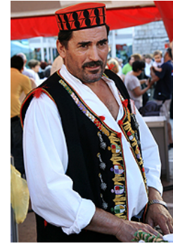
Dalmatian resident in traditional dress

Ethnic Croats comprise the majority of the Croatian population—nearly 90% according to the 2001 census. 145 Of the country’s many ethnic minority groups, the largest is that of Serbs, who comprise approximately 4.5% of the population (2001 census). Additional ethnic groups include Bosniaks, Italians, Hungarians, Albanians, Slovenes, Czechs, and Roma. 146 Most of the Croatian population belongs to the Slavic ethnic group. The languages spoken by both Croats and Serbs belong to the South Slavic linguistic group. 147 Within the large Slavic group of peoples, religious affiliation and language/dialect are associated with a specific ethnic identity. Croats, for example, are traditionally Roman Catholic, while most Serbs are Orthodox Christians. 148 Bosniaks are Muslim Slavs.