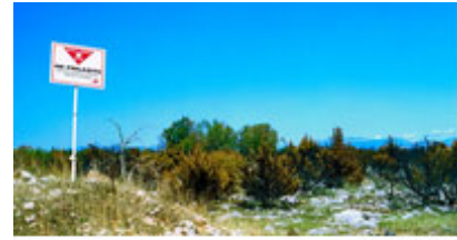
Sign warning about landmines

Croatia is a signatory of the Mine Ban Treaty, which is also known as the Ottawa Treaty. Formed in 1997, this pact requires all signatories to cease the “use, stockpiling, production, and transfer of antipersonnel mines.” Signatories also agree to clear all mines from their territory within 10 years of signing the agreement. 335 Croatia became a State Party to the agreement in 1999 and has since destroyed the vast majority of its stockpile of antipersonnel mines, which it inherited from the former Yugoslavia. It retains a relatively small number of mines for “training and research purposes.” Croatia has yet to complete the demining process; some areas remain contaminated with landmines and explosive remnants of war (ERW), a result of the 1991–1995 conflict. Croatia has received a 10-year extension on its deadline—now set for March 2019—to complete the demining process. 336