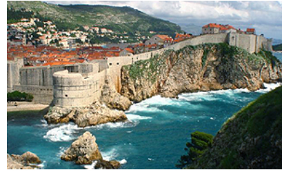
Stari Grad Dubrovnik

Croatia, or Hrvatska , is a southeastern European country populated primarily by ethnic Croats, who belong to the larger South Slavic ethno-linguistic group. Croats traditionally practice Roman Catholicism and speak Croatian, which is closely related to Serbian and Bosnian. Their ancestors settled in the region as early as the 6th or 7th century C.E. The Croatian region has historically occupied the transitional zone between major political and cultural divisions. Competing influences in the region have included the Western and Eastern Roman Empires, the Catholic and Eastern Orthodox Churches, and Christian Europe and the Muslim Ottoman Empire. 1