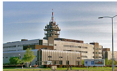
Radio television headquarters at Prisavje, Zagreb

Croatia's constitution contains provisions for freedom of speech and of the press. While these rights are generally respected and upheld by the government, Croatian media outlets remain subject to political and commercial pressures. Croatia hosts both state-owned and independent media outlets. Croatian Radio-Television (HRT) is the national public broadcaster. As state-owned outlets continue to dominate the market, public television remains "the main source of news and information" for the general population. 141 The majority of Croatia's local media outlets are either partially or fully owned by local governments. They are therefore "particularly vulnerable to political pressure." 142 Moreover, because media ownership is not always public knowledge, political influence over certain media outlets may be concealed.