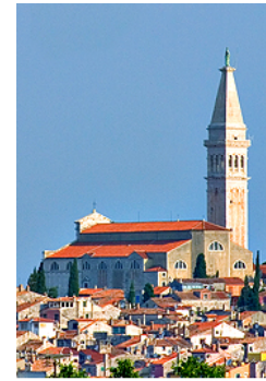
Church of S. Eufemia, Rovinj

Croat ties to the Catholic Church date back over 1000 years. While their early history remains unclear, the Croats were likely exposed to Christianity shortly after their initial settlement in the region, which is thought to have occurred in the 6th or 7th century C.E. Their widespread conversion to the Western, Latin-rite form of Christianity is often dated to the 9th century. 159 Formal recognition of this conversion can be dated to 879 C.E. when Branimir, the Croat ruler, was said to have pledged allegiance to Pope John VIII of the Western Christian Church in Rome. In doing so, Branimir shunned the Eastern Christian Church based in Constantinople, the capital of the Byzantine Empire. 160 Beginning in the 5th century C.E., the Western and Eastern Churches began to diverge and would permanently split in 1054; the Western Church became the Roman Catholic Church and the Eastern Church became the Eastern Orthodox Church. 161