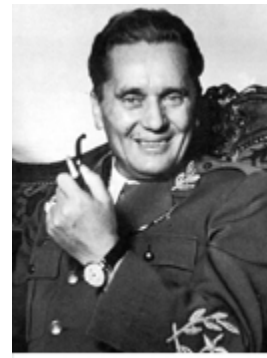
Josip Broz Tito

The communists took control of Yugoslavia following their victory in the war. Croatia became a republic within the Socialist Federal Republic of Yugoslavia, which was headed by Tito. Power within the newly reorganized country was initially concentrated with the single-party communist government in Belgrade. The government quickly implemented communist policies such as the nationalization of property and economic operations. However, in 1948, Tito cut ties with Soviet leader Joseph Stalin, thereby making Yugoslavia one of the only countries in the region to remain independent of Soviet influence and authority. 105 (Yugoslavia would ultimately become a founding member of the Non-Aligned Movement, situating itself between the Western and Eastern Blocs during the Cold War.) Over the next two decades, the Yugoslav government gradually implemented various decentralization measures that distributed power to regional governments and local economic operations. Such reforms were instituted as part of Tito's unique form of "self-managed" socialism. 106