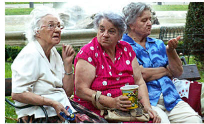
Women in the park

Men greet each other with a firm handshake and direct eye contact. It is customary to exchange verbal greetings according to the time of day. 200