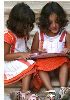
Two Girls in Poreč, Croatia

Croatian names comprise a given name (first) and a family name (second). Examples include Ivo Jakovčić (male) and Ana Višnjić (female). (On official forms, they would be listed with family name first and the given name second.) Family names are passed down on the father's side. Married women traditionally adopt their husband's family name. 379 Croatian children are often named after Catholic saints. Many given names also derive from the names of saints or other historical figures. A traditional practice is to name children after the Catholic saint of the day they were born. (Each day of the Catholic calendar is devoted to a particular saint.) Among older generations, so-called Name Days, when a person's patron saint is honored, can be more important than birthdays. 380 Another Croatian