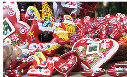
Licitar are cookies with red glazing

Numerous Catholic holidays and observances mark the annual calendar. The Croatian government recognizes the following Catholic observances as national holidays: Epiphany (6 January), Easter (March/April), 183 Corpus Christi Day (May/June), Assumption Day (15 August), All Saint’s Day (1 November), Christmas (25 December), and St. Stephan’s Day (26 December). 184 Of these holidays, Easter and Christmas are the most