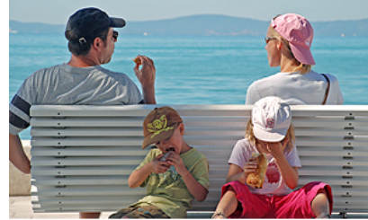
Young family relaxing on a bench

Children are socialized to respect their elders and maintain good manners and discipline. 358 While they may be expected to perform chores, a child’s primary duty is to attend school, which is mandatory at the elementary level.