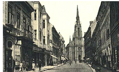
Novi Sad in the Interbellum period

World War I was sparked by the assassination of Austria's Archduke Francis Ferdinand by a Serb nationalist. The war brought extensive destruction and loss of life to the Balkan region. The Austro-Hungarian Empire dissolved in 1918 upon its defeat in the war. Following lengthy negotiations, the Kingdom of Serbs, Croats, and Slovenes was established on 1 December 1918. The kingdom included the territories of Serbia and Montenegro (both of which were already independent); the Croatia region (including Dalmatia, Croatia proper, and Slavonia); Bosnia and Herzegovina; Slovenia; and Vojvodina. 94 Ideally, the new kingdom represented a merger of South Slavs, but in practice, it was dominated by Serbs from the capital in Belgrade. As power in the kingdom was increasingly concentrated in Belgrade, Croatian opposition to the arrangement mounted under the Croatian Peasant Party, led by Stjepan Radić. Radić called for a federal system that would give Croatia autonomous powers within the kingdom. In 1928, Radić was fatally wounded on parliament grounds by a Montenegrin member of a Serbian political party. The incident provoked fellow Croatian representatives to withdraw, exacerbating the political crisis in the kingdom. 95