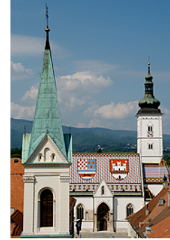
St. Mark's Church, Zagreb

In the Balkans, religious affiliation is strongly associated with ethnic and national identity. Religious interests have thus played a major role in regional politics and conflicts. Under the Kingdom of Serbs, Croats, and Slovenes (known as the Kingdom of Yugoslavia from 1929–1941), the Catholic Church of Croatia competed with the Serbian Orthodox Church for power and influence. Yet, as the kingdom was dominated by Serbs, the Serbian Orthodox Church benefited from a “special law by which it became the de facto state religion.” 163 After Axis forces invaded and partitioned Yugoslavia during World War II, the Independent State of Croatia (1941–1945)—led by the Ustaše, a Croatian pro-fascist party—was supported by the Catholic Church. 164 With the complicity of many Croatian Catholic clergy members, the Ustaše carried out large-scale massacres, deportations, and forced religious conversions of Serbs, Jews, and Roma (Gypsies). Although many clergy members denounced the violence, the Church’s collaboration with the fascist regime contributed to the bitter ethnic and religious tensions between Croats and Serbs. 165