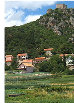
Town on the mountain side

Agriculture and related industries form the basis of the rural economy. Agricultural production is centered in Slavonia, the fertile grain-producing region of the northeast, which is often described as the granary, or breadbasket, of Croatia. While most Croatian farms are small, large-scale commercial operations are present in Slavonia. Corn, wheat, barley, and oats are the major cereals grown in this region. 288 Other important crops include soybeans, sugar beets, sunflowers, and potatoes. 289