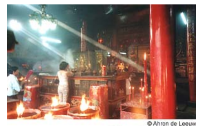
Chinese temple, Jakarta

For centuries, the Chinese traded and lived in Java and other islands of the Indonesian archipelago. In the 19th century, their numbers greatly expanded when they were brought to Java by the Dutch to work on plantations and in mines. The newly arrived Chinese workers did not assimilate, since the Dutch adopted a social and legal system of stratification which separated ethnic groups. The lines especially divided Europeans, Indo-Europeans,