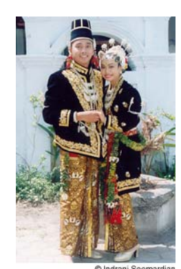
Traditional wedding attire

For formal events, Javanese men often wear a black jacket covering a white shirt, and a floor-length jarik made of batik, wound around the waist. Men may also wear a keri , or short ceremonial knife symbolizing manhood, tucked into their waistband. Another traditional ceremonial style for men is the beskap , a black formal jacket with a high neck. Traditional shoes that accompany this garment are called selop , flat in design and made of shiny black leather. Rather than wearing the beskap , a man may choose a formal satin or silk shirt in a batik design, worn over black pants. Black leather shoes also complement this particular style.