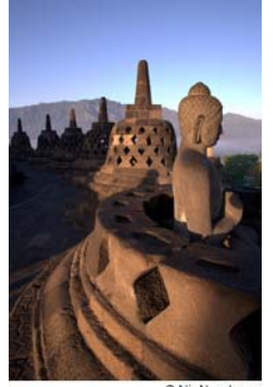
Nir Nussbaum Rorobudur

In the 1890s, fossil remains of early hominids called Homo erectus were found on Java. Homo erectus , who had migrated to Java and the surrounding islands, lived between 500,000 and approximately 1.7 million years ago. <sup>74</sup> Although these hominids were considered to be a predecessor of Homo sapiens , the ancestors of modern humans, more recent dating eliminates the idea of a direct evolutionary link.