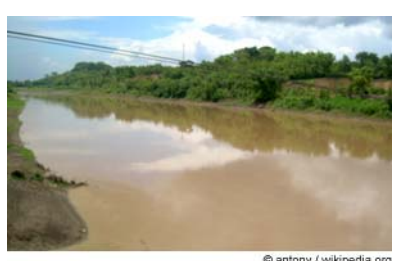
Bengawan Solo River

As with most of the smaller rivers in Java, the Bengawan Solo River (also called Solo River) runs northward. It begins at Mount Lawu in central Java and empties into the Java Sea near Surabaya. The river has been dredged to run north at its mouth because of silting in its original channel. At 600 km (383 mi) in length, the Bengawan Solo River (also known as the Solo River) is Java's largest river. 42 Water from the river is stored for irrigation,