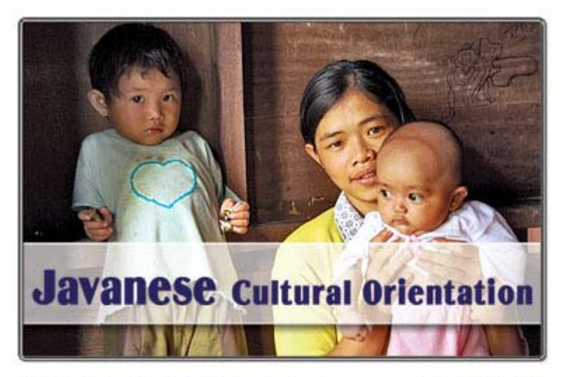
Technology Integration Division