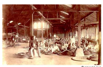
sawung gue Courtesy of Wikipedia

The Colonial Era: Portuguese and Dutch Aside from Marco Polo, who visited the region in 1292, and a few merchants and monks, the Portuguese were the first Europeans who visited Indonesia. They came to Java in the 16th century only to be overpowered by Dutch traders by the close of that century. In 1619, Batavia (later named Jakarta) was founded by the Dutch and became the administrative, political, and business center of the new Dutch empire.