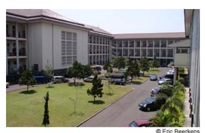
Gadja Mada University

Students who can afford the cost can choose to attend a university, several of which are found in Java's cities. They include the oldest university in the country, University of Indonesia in Jakarta, founded in the 1930s. The oldest since independence is the Gadjah Mada University in Yogyakarta, founded in 1946. Two universities are also located in the city of Bandung on Java. <sup>188</sup>