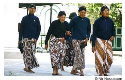
Men in traditional sarongs

Casual dress codes are similar for Javanese men and women in other respects. Both women and men wear tennis shoes or thongs on their feet. When working outdoors such as in rice fields, men and women wear a cone-shaped hat that shades their faces and protects their heads from the heat.