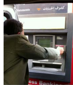
ATM in Amman

The national currency is the dinar (JD). Prices are sometimes given in piastre or qirsh (100 piastre or qirsh equals one dinar). Since prices are often quoted without a unit, it is necessary to determine if the price is being quoted in piastre or dinars. 287 Exchanging money is easy and can be done at banks or authorized money changers. Older U.S. notes are sometimes refused; use newer bills. 288 Credit cards are widely accepted at more expensive hotels and restaurants as well as at larger souvenir shops. ATMs are widely available, but access in smaller towns may be limited. 289