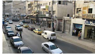
Streets of Amman

Rapid and unplanned urban growth has created water supply problems and transportation and infrastructure issues; it has also led to insufficient housing, the growth of informal settlements, and large pockets of unemployment. In Amman, for example, the public water system is unable to meet current demands because of poor water infrastructure and a lack of reservoirs. 236 Although nearly 98% of all households are connected to water supply networks, supplies have been rationed since 1987. Water is available only one or two days a week. Therefore, people must build cisterns or find other containers to store dwindling supplies of water. 237, 238