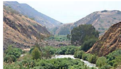
The Jordan River Valley

Jordan is a relatively small country in the Middle East that bridges the Mediterranean Levantine region with the oil-rich Arab Gulf. With a total area of 89,342 sq km (34,495 sq mi), Jordan is slightly smaller than Portugal or the American state of Indiana. Jordan’s Levantine neighbors are Israel and the Palestinian West Bank to the west and Syria to the north. Gulf neighbors include Iraq in the northeast and Saudi Arabia to the east and south. Although Jordan does not share a land border with Egypt, the two are separated by the narrow northern tip of the Gulf of Aqaba. 1