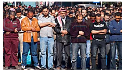
Prayer on Friday

A typical Jordanian, whether Muslim or Christian, lives life according to religious moral principles. Man's dependence on God is so ingrained in the Jordanian psyche that "Praise be to God" ( al-Hamdullah ) is a typical response when one is asked how they are doing. Answers to other questions, or statements about the future, often include the phrase "if God wills it" ( in sha' allah ). 129