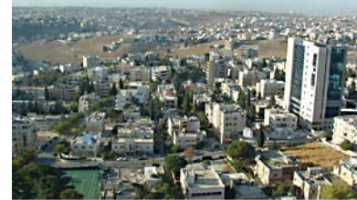
Aerial view of Amman

Jordan's capital, Amman, has grown substantially in the last 100 years. Although it was the ancient Ammonite capital and centuries later a Roman city named Philadelphia, by the 19th century it was little more than a village with several hundred residents. Waves of refugees, first Circassians from the Caucasus in the 19th century and then Palestinians in the 20th century, added new life to the city. Today Amman is Jordan's political and economic heart and is home to more than 1 million people. 31, 32