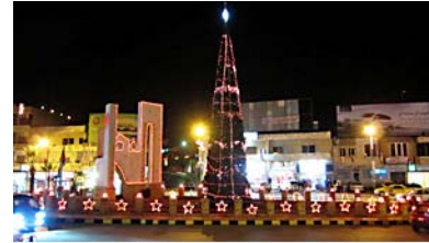
Christmas decorations in Amman

For most of Jordan’s Christians, Easter is the holiest day (typical among Eastern Christian churches). Easter is preceded by 40 days of fasting and preparation (known as the Great Lent) in which observers avoid meat, typically eating meals with fish, cheeses, and fruit. Easter is celebrated with lengthy church services followed by feasts.