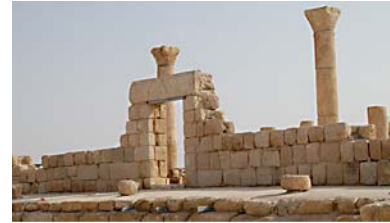
Ruins at Mount Nebo

Jordan's proximity to holy sites from several faiths has shaped the country. Mount Nebo, northeast of the Dead Sea, is the traditional site from which Moses, after fleeing from Egypt, surveyed the promised land for the House of Israel. The wilderness near the Jordan River was home to John the Baptist, and the river itself is where Jesus was supposedly baptized. Following the advent of Islam, the religion quickly spread from its origins in the Arabian Peninsula to Jordan and beyond. For centuries Jerusalem, just 70 km (44 mi) southwest of Jordan's capital, has been considered the third holiest place in Islam, following Mecca and Medina in Saudi Arabia.