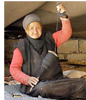
Bedouin woman in Jordan

Jordan's population, although it has few ethnic differences, is characterized by nationalist divisions. The population is 98% Arab, but that figure is divided among several groups. 93 Native Jordanians are descendents of the region's indigenous Bedouin inhabitants. The Palestinian Arab population makes up roughly 60% of the population. This group came to Jordan primarily in 1948 and 1967, fleeing Palestine because of regional conflict with Israel. Although Palestinians often feel distant from the Jordanian government because of a perceived lack of effort to secure an independent Palestinian state, they are loyal to the monarchy. Iraqi refugees, also primarily Arab, have flooded into Jordan since the American invasion of Iraq in 2003. 94