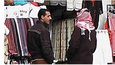
Men having a discussion

In Jordan, people are commonly referred to by both their first and last names. People of the same age or sex can use each other’s first name if they have been previously introduced. Titles are frequently used when addressing adults. For women, the title um (mother) is both common and respectful. Abu (father) is used for men. These titles are generally followed by the name of the oldest son. For instance, if the oldest son were named Ahmed, then his parents would be addressed as um Ahmed and abu Ahmed . 165