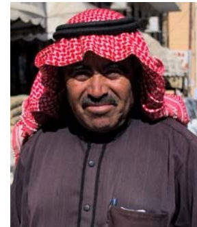
Man in Amman

Jordanian men typically dress in Western-style clothing, although some wear the traditional headgear known as the kuffiyah . Also called the hattah , the kuffiyah comes in two sets of colors: red-and-white checked (typical of Jordanians) or black-and-white checked (typical of Palestinians). 210 The headpiece is folded into a triangle and secured to the head with a double-coiled rope known as an ' aqal '. 211 The ' aqal ' may yield several clues about the wearer. For instance, if the ' aqal ' is worn at an angle, the man is single. An ' aqal ' worn straight on the head indicates that the man is married. 212, 213