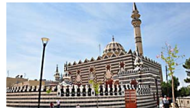
Mosque in Jordan

The central place of worship in Islam is the mosque. Most mosques consist of a large room where a prayer leader (known as the imam) directs long rows of worshippers. The direction of Mecca is marked in a niche ( mihrab ) in the wall so that worshippers know in which direction to pray. A pulpit ( minbar ) often rests near the mihrab and offers a place for sermons to be given during Friday prayers. Towers, known as minarets, attached to or directly adjacent to the mosque allow the muezzin to call worshippers to prayer throughout the day. 142