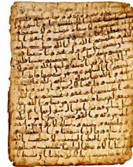
Pages of Quran manuscripts

After the death of Muhammad, the umma fractured, primarily over the succession of authority. 109 Some felt Abu Bakr, a longtime companion to Muhammad, should lead the community while others felt Ali, Muhammad’s cousin and son-in-law, was the rightful leader. Supporters of Ali and his family became known as the Shi’ites ( shiat Ali in Arabic, meaning “the party or sect of Ali”). They have long felt abused and mistreated by Islam’s majority sect, the Sunni (supporters of Abu Bakr). Roughly 85% of the world’s Muslims are Sunni; Shi’ites are primarily centered in Iran and Iraq, with a notable presence in Lebanon. 110