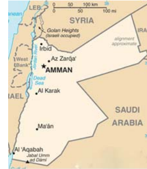
Map of Jordan

Jordan, officially the Hashemite Kingdom of Jordan, is a small Middle Eastern nation that is distinct from its neighbors. Formed by a British mandate, it developed in the wake of World War I and eventually gained independence. Despite its relatively recent emergence on the world stage, Jordan has a long history. Some of civilization’s oldest artifacts have been found in Jordan; it is home to a number of unique geographic and man-made sites including the ancient city of Petra, which is carved into sandstone mountains, and a Roman theater in Amman.