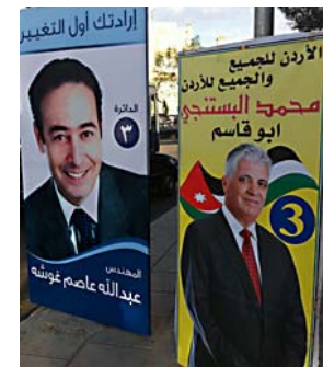
Jordanian election posters

Jordan is a constitutional monarchy, its ruling family having been in place since the creation of the country and its constitution having been in effect since 1952 (although amended many times). 66 The king is the country’s head of state. He wields control over all branches of the government. The king appoints the country’s prime minister as well as the cabinet, who are collectively responsible for coordinating the work of various government agencies. 67 The crown has typically passed from father to firstborn son, although the king may decree a change in the line of accession. For many years King Hussein’s brother, Hassan, was the country’s crown prince and heir apparent. But just before his death, Hussein named his son Abdullah heir. Despite less than a century’s residence in Jordan, the royal family has found legitimacy in religious terms. The family claims descent from the Prophet Muhammad through the Hashem family, giving the country the official name of the Hashemite Kingdom of Jordan. 68