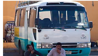
Bus in Aqaba

The most popular forms of transport in Jordan are minibuses and public buses. 299 Minibuses stop running at midday on Friday and rarely run in the evenings. 300 The large blue-and-white buses are operated by the JETT company and run selected routes between major cities. Buses to smaller towns are often minibuses that leave only when full; service on these routes may be infrequent. 301 Unrelated males and females may sit next to each other on buses. 302