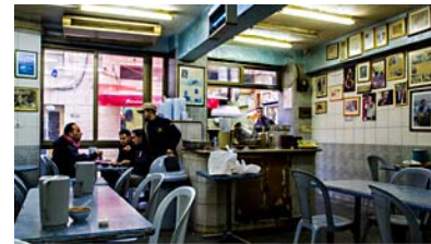
© Zack Zaiium Cafe in Amman

Urban restaurants serve a wide variety of cuisines, including Chinese food, American fast foods, and other Western dishes. 272 Because most Jordanians generally prefer to eat at home, dining out is often reserved for business affairs or family celebrations. 273 Dinners in restaurants often begin after 9 p.m. 274 Unlike in private homes, where all foods are served at once, restaurants usually begin with mezze or muqabalat (appetizers). Typical appetizers are hummus, pureed eggplant ( baba ghanouj ), and a salad made from tomatoes, green onions, fresh mint, and parsley mixed with bulgur wheat and lemon juice ( taboula ). 275 Food is normally served on individual plates, although more traditional restaurants serve food on a common platter ( sidr ), as is typically done in Jordanian homes. 276 Food may be eaten with the hands, but utensils may be provided. When using cutlery, follow the European tradition of keeping the knife in the right hand and the fork in the left. 277