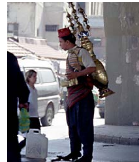
Coffee vendor in street

Urban areas have a variety of shopping alternatives, from conventional department stores to traditional souks, or marketplaces. The Gold Souk in Amman is recognized as one of the best in the country. This mazelike cluster of shops and stalls offers products such as gold jewelry, spices, and perfumes. 284