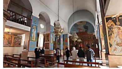
Greek Orthodox church

Jordan's Christians are predominantly Greek Orthodox (two-thirds of the Christian population). Like other Eastern Orthodox churches that split from Western Christianity in the 11th century, adherents of Greek Orthodoxy do not recognize the authority of the Catholic Pope. Burning incense and praying in front of important religious icons are typical religious practices. Remaining Christians include Greek Catholics, Roman Catholics, Syrian Jacobites, and Protestants.