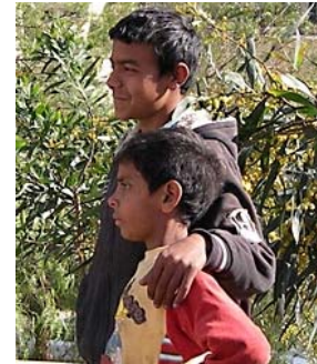
Man with son in Amman

Any visitor, no matter how long the visit, is likely to be offered a beverage such as tea, coffee, soda, or fruit juice. For longer visits, guests are expected to leave shortly after being served coffee. If guests are visiting the area, they may be invited to dinner. Rules of politeness dictate that initial offers should be politely declined as many as three times before being accepted. 194