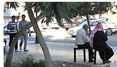
Friends in Amman

Eye contact varies with the situation. As a sign of respect for older and more senior persons, direct eye contact is common, especially if a tribal leader or family elder is talking. Among friends, in less formal settings, direct eye