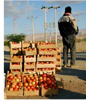
Tomato seller

Deserts constitute roughly 80% of Jordan's land, making Jordan the third most water-insecure nation in the world. 332, 333, 334 Desertification caused by poor water infrastructure, lack of rain, and poor farming practices threatens to take over vital agricultural lands. 335 Partly as a result of water issues, the economic significance of agriculture has diminished. The sector employs less than 3% of the nation's workforce and accounts for only 4.5% of GDP (gross domestic product). 336 Two-thirds of hired agricultural workers come from outside Jordan. 337