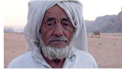
Elderly man

Islamic families attach great value to the family and hold elders in high esteem. Elderly parents are respected and hold relatively high status within the family. 431 In Islamic tradition, serving one's parents is an honor and a duty, second only to prayer. 432 433 Jordan's elderly, who account for about 5% of the population, are mainly supported and cared for by their family members. 434, 435