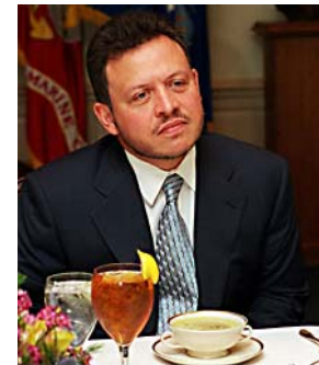
Abdullah bin Hussein

Jordan was born in the wake of World War I. Prior to the war, many in the region grew tired of Ottoman rule. Frustration led to revolts in 1905 and 1910. When the war in Europe erupted, the Ottoman Empire sided with Germany and Austria, so Britain encouraged local Arab rebellions, hoping to overextend Ottoman resources. The Arab rebellion was a success and at the war's end, many Arabs hoped for an independent Arab state. 54, 55