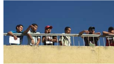
High school boys

Basic education in Jordan comprises grades 1–10 and is compulsory and free for all citizens. At the end of 10th grade, students may opt to go on to a secondary education school for 2 years. Secondary students follow one of two tracks. Track one is a comprehensive educational path leading to a diploma ( tawjihi ) for students who pass the general secondary exam. Track two is an applied educational path for vocational training. 364 The nation has 5 public universities, 12 private universities, and 1 public 4-year university. 365