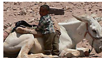
Child near Petra

Upon the birth of a child, families hold a sebu'a'a , or 7-day open house. Neighbors and relatives drop by with small gifts. In rural areas, the ceremony is accompanied by the slaughter of a sheep, which is cooked and served to guests. Christians often serve a spiced rice pudding with nuts and candied anise seeds ( moghli ). Female members of the family may hold a separate party for the mother. Muslim fathers whisper the Islamic call to prayer ( adhan ) into the baby's ear. Although Protestants may wait longer before holding the ritual, Christian children are normally baptized shortly after birth. 477