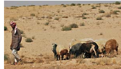
Sheep herder

Most Jordanians have their origins in the desert-dwelling Bedouin tribes, whose exact numbers are unknown. The tribal structure of Arab society is clearly visible in the culture and traditions of the Bedouin, who are famous for their hospitality. The clan is the center of Bedouin social life, and each family has its own tent. A collection of families ( hayy ) constitutes a clan ( qawm ). Clans make up a tribe ( qabila ). 378 379 Most of the Bedouin population is now settled, although 5–10% remain nomadic. 380 The majority of Bedouins live in the desert regions extending east from the Desert Highway. But the largest concentrations are near Wadi Rum and Petra, where many of the Bedouin depend on tourism for a living. 381, 382, 383