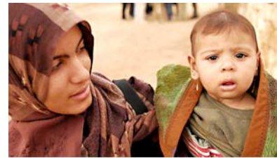
Beggar and child

Jordan's government has an active campaign to rid the streets of beggars. According to a government study, 95% of beggars were less needy than they claimed. As many as 40% had pensions, were getting money from the national aid fund, or had second income sources. Some are members of organized criminal gangs. In 2008, for example, nearly 20% of beggars caught by police were exploited children from the Hussien Palestinian refugee camp. The number of beggars increases significantly during the month of Ramadan, when people tend to be more charitable. Begging is a crime in Jordan, and the government advises that people should politely refuse to give money to beggars or hawkers. 314, 315