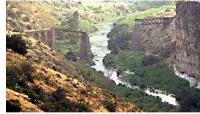
Yarmuk River

The Jordan River, forming the northern third of the country's western border, is Jordan's most important river. The Jordan River has two main tributaries: the Yarmuk forms part of Jordan's northern border with Syria and the Zarqa begins north of Amman and flows west into the Jordan River. Most of the year the Yarmuk and Zarqa Rivers are depleted by heavy irrigation. 21 Upriver dams and irrigation have depleted the amount of water in the Jordan River; it once carried 1.3 billion cubic m (343 billion gal) of water annually into the Dead Sea, but today it delivers only 100 million cubic m (26.4 billion gal), much of which is sewage. 22