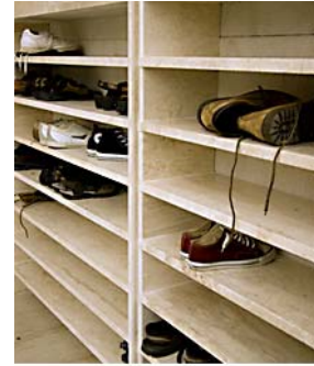
Shoes at Amman Mosque

Shoes are never worn in the mosque and should be removed before entering the building. Look for an area with mats or carpets and a collection of shoes outside the walls of the mosque. Sometimes this area is considered an extension of the mosque itself, and therefore shoes may not be placed on the mats. Observe what others do before placing your shoes. Most mosques in Jordan, with the exception of Amman’s King Abdullah I Mosque, are not open to non-Muslims. 150