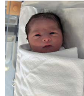
© Mohd Khawaja Baby girl in Jordan

The birth of a child is generally cause for celebration and joy among Jordanians, who typically have large families. 460 Most parents show a strong preference for boys. 461 Between 25% and 33% of all births are unplanned—a result of lack of information about or a reluctance to use family planning methods. 462, 463 Since most births take place in healthcare facilities, both maternal and infant mortality rates are much lower than in previous years. 464 All births, except those occurring outside marriage, must be registered within 30 days in order for children to have access to essential services. 465, 466