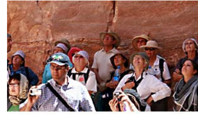
Tourists at Petra

Jordan, lacking oil resources and a suitable climate for agriculture, has one of the smallest economies in the Middle East. Among other Arab countries, only Bahrain has a smaller gross domestic product (GDP), yet Bahrain's economy is offset by its small population. Bahrain's GDP per capita is nearly eight times higher than that of Jordan. 80, 81, 82 In 2010, Jordan's GDP was USD 34.5 billion. The service sector drives two-thirds of the economy while industry accounts for 30%.