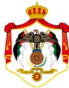
Jordan Coat of Arms

Religion gives legitimacy to Jordan's ruling family. The first part of the country's full name, the Hashemite Kingdom of Jordan, refers to the monarch's claim to be part of the Hashem clan of the Quraish tribe, Muhammad's own clan. By claiming descent from Islam's prophet, Jordan's monarchs have found legitimacy, despite that fact that just a century ago the family was not based in Amman, but in the Arabian Peninsula. 120, 121 Moderate rule and the claim to religious authority have helped Jordan's monarchs remain firmly in power, as evidenced by anti-government protests in the spring of 2011. Although protestors called for political and economic reforms, they did not demand that King Abdullah II step down. 122