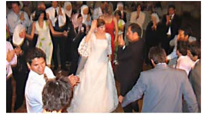
Wedding in Amman

Wedding receptions are generally segregated by sex, but less-traditional Muslim families may host a mixed reception. The dabkah , or traditional line dance, performed by the groom and male members of his wedding party, is a feature of many Muslim receptions. Brides also dance as the other women sing and dance around her. In some ceremonies, the bride sits atop a platform while female members of the family place gold jewelry on her. Before the groom arrives, women put on conservative clothing in keeping with Islamic requirements of modesty. When the groom arrives, the new couple performs a dance together. The bride puts on a white cape before the couple departs. Family members follow the couple in cars to the hotel where the newlyweds will spend their first night together. 470