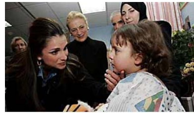
Queen Rania comforting patients

Approximately 68% of the population is formally covered by insurance programs, 47% of which come from two public entities: the Ministry of Health (MOH) and the Royal Medical Services (RMS). 254 Public hospitals, often overcrowded and lacking the most modern equipment, account for 37% of all hospital beds. One-quarter of all doctors are employed by the MOH. 255 About 62% of the nation’s doctors are employed in the private sector, which runs 56% of the hospitals in the country. Private healthcare is generally available to the wealthy. Private healthcare centers and hospitals often have better equipment and are less crowded than public hospitals. 256, 257