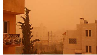
Dust storm in Jordan

Jordan has an arid, warm climate with some variation across different geographic regions. The climate in western Jordan is Mediterranean but becomes more continental farther east. 13 Precipitation primarily occurs in the northern highlands and, as a result, this area has the highest population concentrations. 14 Jordan is especially dry between April–October, and only 3% of the country receives more than 30 cm (12 in) of rain a year, the minimal amount of water needed to grow rain-fed wheat. 15 The desert steppe receives less than 13 cm (5 in) of rainfall a year. 16