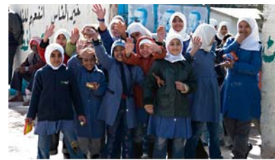
School kids in Baqa'a

In the Middle East, Jordan is distinguished by its policy of gender equality in schools. The educational standard for both sexes is the same at all levels of education. Despite gender-segregated schools, courses for males and females are identical. Both Muslims and Christians attend the same classes. This has provided Jordan with one of the most highly educated labor forces in the Arab world. Virtually everyone under the age of 24 (99%) can read and write. 266 Educational attainment is higher in urban areas. In Amman, for example, more than half of the population has achieved a secondary education or more. 267