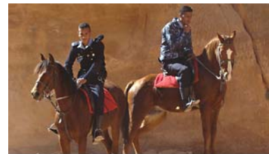
© Richard White Mounted police, Petra

The crime rate in Jordan is low. Petty crimes, such as pickpocketing and purse snatching, are the most common forms directed against foreign nationals. Petty crimes are especially problematic in the downtown areas and in wealthier sections of the capital. 306, 307, 308 More serious crimes of sexual harassment, stalking, indecent exposure, and rape occur, but in much smaller numbers. Women should avoid taxis and avoid traveling to unfamiliar areas at night, especially when traveling