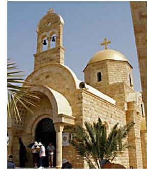
Church near Jordan River

Jordan’s Christian history dates back to the beginning of Christianity. Churches exist in several parts of Jordan. One archeological site claims to be the oldest place of Christian worship ever found, dating to the years immediately following Jesus’ death. 146 St. George’s Church, a Greek Orthodox Church in Madaba, was built in the 19th century, but is home to a mosaic that dates to the 6th century. Included in the mosaic is a detailed map of ancient Jerusalem. 147 Churches are typically small, reflecting small congregations, and are located in cities with Christian populations or near significant sites, such as the baptism site of Jesus at the Jordan River. 148