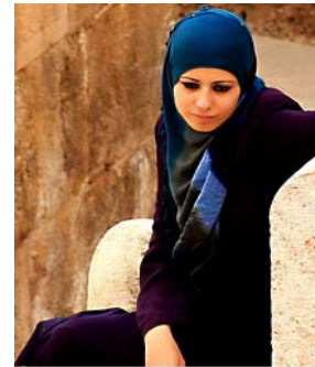
Woman in jilbab

Although the country is driven by its strong Muslim and Bedouin heritages, Jordan is relatively liberal. 171 Males and females are not segregated, official dress codes do not exist, and women can file for divorce. 172, 173, 174 The Jordanian Constitution does not explicitly prohibit sexual discrimination, although it states that all citizens are equal. 175 As a result of this ambiguity, women face discrimination in pension and social security benefits, inheritance policies, divorce, and freedom of movement, including travel. Women, under shari'a law, receive only about 50% of what a male heir receives. Non-Muslim widows have no inheritance rights. 176 Women, regardless of nationality or citizenship, can be prevented from leaving the country by any adult male relative registering a hold on travel with the authorities, who regard such issues as private family matters. 177 Domestic violence, spousal rape, and honor killings are not uncommon. 178, 179 Approximately 15–20 women are murdered each year in honor killings in