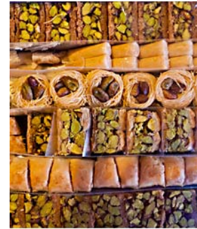
Sweets for Eid in Jordan

The two major holidays in Jordan, as in the rest of the Muslim world, are Eid al-Adha and Eid al-Fitr. Eid al-Adha, the Feast of the Sacrifice, commemorates Abraham’s willingness to offer his son Isma’il (Ishmael) as a sacrifice. The holiday occurs in conjunction with the yearly pilgrimage to Mecca. Eid al-Adha is Islam’s highest holy day and is also known as the “greater Eid.” Jordanians celebrate the Eid by feasting on lamb. Typically each household has its own sheep, which is divided among the household, extended family, and the poor. The lamb is a reminder of the sheep God provided to Abraham to sacrifice in place of Isma’il. 133, 134, 135