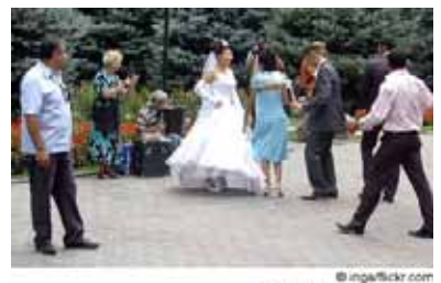
Bingstickroom Kazakh wedding party

In Kazakh society, marriages were traditionally arranged by the families of the bride and groom. These negotiations were often made long in advance, sometimes shortly after the boy and girl to be married were born. As social contracts, the arrangements served to expand clan and familial networks rather than foster a romantic union between two individuals. Exogamy, in which persons marry outside their clan, was strictly observed. Marriages occurred at a young age, with the bride typically younger than the groom. <sup>185</sup>