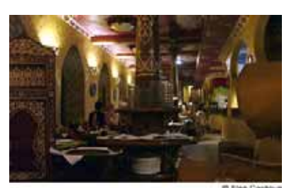
Restaurant in Almaty

While coffee is widely available, the most commonly served beverage in Kazakhstan is tea ( shay ); black tea is typically served with milk or cream, while green tea is usually served straight. Tearooms are a popular venue for socializing.