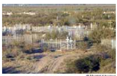
Graveyard in western Kazakhstan

Kazakh funerary practices exhibit both Islamic and pre-Islamic elements. Traditionally, the body of a dead person was kept in the yurt home for three days, contrary to the Muslim practice of burying a person within 24 hours of death. Seventy-two hours is the amount of time it was assumed his soul needed to ascend to heaven. It also enabled family members time to assemble for the funeral. Per Muslim custom, the body is washed by