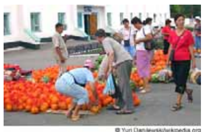
anlewski/wikipedia.org Market in Shu