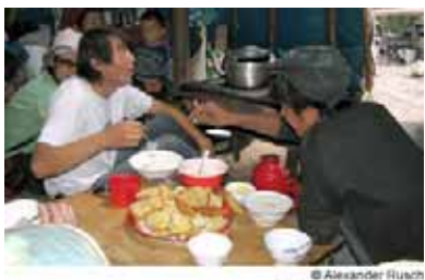
azakh mon antine

Boiled sheep heads are traditionally presented to honored guests as delicacies. In these cases, the guest customarily carves the meat and distributes it to the family members according to their position in the family hierarchy. For example, ears are traditionally given to the youngest children to make them more attentive to their parents' commands, and eyes are given to the honored guest's closest friends so that they will look after him. <sup>173</sup> The