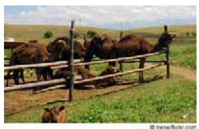
Camels near Almah

Until the late 19th and early 20th centuries, the Kazakhs practiced a nomadic pastoral lifestyle, in which tribal communities migrated seasonally with their livestock. The annual migratory cycle included a long stay at a winter campsite, a slow spring trek to summer pastures, and a quick fall descent back down to the winter site. Sheep and goats were the most common livestock, followed by horses and, in semi-desert and desert areas.