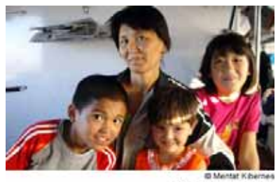
Mother and children

In the household, women are traditionally responsible for cooking, cleaning, and childcare while men earn a living (e.g., care for the family's livestock) and maintain the property. The downward mobility that most Kazakhs experienced after the U.S.S.R dissolved, when many government employees were terminated, created a need for all able-bodied members of the family to seek paid employment outside the home. The ideal arrangement for