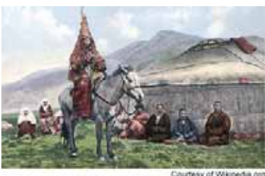
Kazakh hride on horsehark on 1914

Traditionally, women played a strong role in nomadic Kazakh society, making the family's clothing and preparing the meals under difficult conditions. These responsibilities empowered them with decision-making authority within the household. After Kazakhstan became part of the Soviet Union (U.S.S.R), gender equality was promoted according to the notion that both sexes should contribute to society's economic production outside of