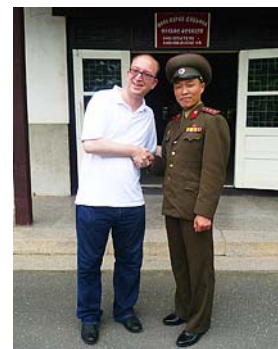
Handshake with foreign tourist

Handshakes differ according to gender and status. A man offers his right hand using his left hand to support or grip the wrist of his right hand as a gesture of respect. When women greet each other, they extend both of their hands so that they are holding both of each other's hands. A bow of the head accompanies handshakes for both men and women. When a child greets an adult, the child always bows. 179 When a visitor initiates a greeting, it is customary to bow and offer to shake hands with the eldest person first. 180 If a man is shaking hands with a woman, the grip should be very light and short.