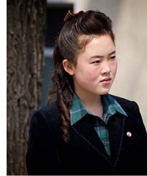
Female state employee

During the mid-1990s when the economy went into a sharp downturn, entrepreneurship began to proliferate as a means of household survival. Light industries were the first to cease production and many North Korean women became active in trading and selling activities to put food on the table. Men remain employees of the state, even though most factories operate in name only. Resigning is not an option, since that would be considered an act of disloyalty. Instead they can pay, in most cases many times their monthly salary, not to show up but remain on the books. Interviews indicate it is often the wife who decides whether her husband’s skills on the open market are worth such a large payment. 348