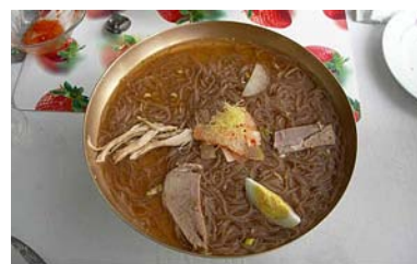
Cold noodle soup

Due to the scarcity of meat, much of the diet is vegetarian. Tofu is a common meat-substitute. A popular traditional dish that few North Koreans are in a position to enjoy is Bulgogi , marinated beef strips broiled over charcoal. Official sources report ordinary citizens have been moved to tears when presented with bulgogi by Kim Jong Il. 193