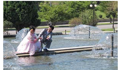
Newlyweds splashing each other

A woman’s moneymaking ability has become a desirable attribute in a wife as well. North Koreans speak of “golden couples,” referring to a husband in government and a wife in private commerce. 366 Whereas in the past men would have been ridiculed for marrying a divorcee, this is no longer the case. If she is a successful entrepreneur, she may be viewed as preferable to a never wed woman with no work history. According to a news report, “The choice of a divorced partner is especially popular among discharged soldiers in rural locations. The men see it as a chance to marry a city woman and escape the poverty of the countryside.” 367 Marriages between urbanites and farmers enable the couple to live in either location.