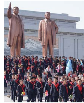
Kim Jong Il joins father

In response, Kim Jong Il declared North Koreans were undergoing an endurance test that he called the Arduous March, borrowing the name used to describe the efforts of Kim Il Sung and his guerrilla fighters against the Japanese in the late 1930s. By appropriating the name, Kim Jong Il linked the current period of hardship to the earlier revolutionary one. 70 The message was clear: He expected the people to make the same sacrifices his father's generation did. Complaints would be interpreted as disloyalty. By the end of the 1990s, the worst of the famine was over. Estimates put the death toll at anywhere from 600,000 to three million people. 71 Others fled. Of the thousands that cross into China every year, some 24,000 citizens of the DPRK have successfully secured refuge in South Korea. 72