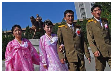
The wedding party

Both sets of parents host separate receptions for between 30 to 50 guests. A defector recalled this created a friendly competition to show off. 378 The bride's family prepares a banquet including fruits of five different colors served in dishware she will use in her new home. While the state has assumed the traditional responsibility of the groom's side for providing the couple with accommodation, the bride's family remains responsible for their cooking utensils, a cupboard full of quilts, which are laid out for guests to admire, and other daily use items. 379 A refrigerator has become a "must have" item, even if there is no electricity to run it. 380