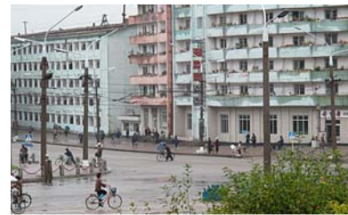
Urban housing complex

Before enforcement subsided over the last decade, mobile police units ( kyuchaldae ) made unannounced home visits to ensure residents were not misusing electricity for cooking purposes. 239 After circulation of smuggled foreign film cassettes became commonplace, the police would shut off the power to entire buildings to undertake a unit by unit search. They would ask to inspect video players to see if any foreign entertainment was lodged inside. 240 Discovery of contraband could dispatch the entire household to a labor camp from which they would be unlikely to emerge alive. Despite their newfound access to both contraband goods as well as the possibility of buying one’s way out of trouble, most people continue to go to great lengths to keep contraband hidden. One defector in Seoul keeps in touch with family back in North Korea via a cell phone smuggled in from China that her relatives keep buried in a hill. 241