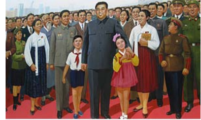
Kim Il Sung propaganda mural

Even by the standards of 20th century state socialist regimes, the transformation of North Korea into a totalitarian quasi-cult where citizens literally worship the Kim dynastic leadership is extraordinary. 336 Nonetheless, traditional values underpin its society. The government took deeply ingrained Confucian cultural norms such as filial piety and deference to authority and used them to cast Kim Il Sung as the national father figure. 337