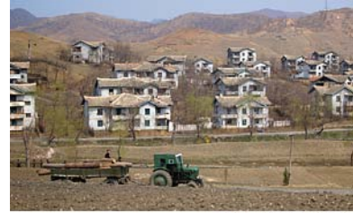
Farm village

Approximately 40% of the North Korean population lives in rural areas. 280 Few people live in the inland areas of Chagang and Yanggang provinces because these areas are unsuitable for agriculture and the climate is brutally cold. Instead, most rural communities are found in the coastal lowlands and the Yalu and Tumen river-valleys, where towns and villages dot hill slope bases. Farmers live in small low-rise apartments or simple thatched-roofed houses often without running water, heating systems, bathrooms, or kitchens. 281 They confront a short growing season, due to the country's northern latitude, along with a high ratio of population to arable land, estimated to be 14% of total territory. 282 For this reason, the government's emphasis on agricultural self-sufficiency, part of Kim Il Sung's juche ideology, is fundamentally misguided. 283 When one factors in economic mismanagement, lack of inputs and machinery, weather alternating between heavy monsoonal rains and drought during critical points in the crop cycle, the results have proved tragic. While few expect a return to the conditions which prevailed in the 1990s that led to widespread famine, food shortages remain a recurring possibility for rural North Koreans who have virtually no other means to earn a living than farming. 284