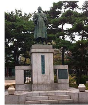
© Michael Sean Gallagher Statue of nationalist in Seoul

The Tangun legend allowed the Korean people to maintain a claim to being a distinct race and strengthened their resolve to resist colonial efforts to make them Japanese. 50 Inspired by the Russian Revolution of 1917 and similar action in China on behalf of the working class and peasant class, Korean nationalism grew stronger in the face of colonial rule. In the 1920s, the Koreans established a multitude of underground communist organizations to resist the Japanese. Guerrilla groups carrying out attacks on the Japanese came to include Soviet or Chinese communists who were also fighting the Japanese. It was during this time that the Korean fighter Kim Song Ju, later renamed Kim Il Sung, based in Manchuria gained a reputation as a guerrilla fighter with notable leadership skills. 51