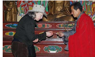
Visitor with Buddhist monk

When taken to Buddhist temples, for example, visitors have encountered elderly caretakers who are introduced as monks. This is met with skepticism since many of these "monks" do not wear traditional monastic garb and appear to be married in violation of the celibacy pledge maintained by most Korean Buddhist orders. 156 In sum, although some of the religious activities carried out by practitioners seem authentic, many seem "staged" for visitor consumption. 157