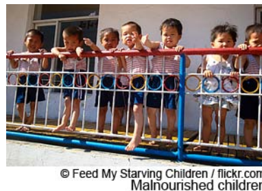
Malnourished children

Malnutrition imposes long-term negative health effects on the entire population, including urbanites. 248 Life expectancy in the country dropped from nearly 73 years in 1995 to about 66 years in 2010. Infant mortality and maternal death rates increased during the same period. 249, 250 Malnutrition has stunted nearly half of all children under the age of five; 9% suffer from wasting; and 25% are underweight. 251 Regional variations are significant, however. In one province where the food distribution system failed back in the 1990s, a study found 82% of the children were malnourished. By contrast, in Pyongyang, the percentage was approximately half that number. 252