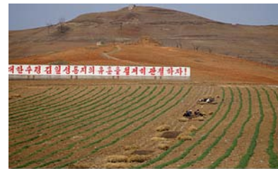
Cooperative farming

Perhaps taking the Korean saying “10 years is enough to change the landscape” literally, Pyongyang sought ways to increase grain production after the establishment of the Democratic People's Republic of Korea (DPRK) in 1948. Toward this end, the amount of land under irrigation was expanded by building a system of pumps and reservoirs reliant on electricity to run. 285 The government also adopted a Chinese model of dense seed