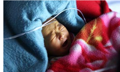
Hospitalized child

Tuberculosis is a threat to those suffering from malnutrition. According to an organization involved in relief work, “[b]etween 2006 and 2008, the number of reported cases doubled to 344 per 100,000 people.” 316 However, treatment facilities are insufficient to accommodate the demand. In addition, drugs supplied by international humanitarian groups are at risk of ending up for sale on the open market. 317