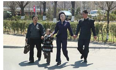
Pyongyang family outing

After the establishment of the DPRK, nuclear families became the norm, in part because the state regarded the extended family or lineage as a relic of the pre-socialist era. 354 Family size shrank from 6.5 children per woman in 1966 to 2.5 children in 1988. 355 To what extent this declining demographic trend reflects Kim Il Sung’s 1974 pronouncement that a woman should not bear more than three children is unknown. 356 It remains slightly above 2 children per woman. 357 Nonetheless, they may have to support their children well into adulthood. One woman noted proudly, “My [adult] son comes to me because I feed him, and he obeys me.” 358