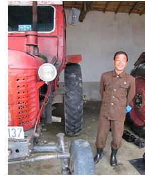
Cooperative farm worker

Such sweeping reorganization would not have been possible if land ownership had remained in private hands. In 1943, approximately 75% of rural households were either landless or close to landless. 289 After Japanese colonial rule ended, however, the traditional landlord class fled south. 290 Their property was distributed to those who worked the land, a highly popular move. 291 Collectivization of individual plots into cooperative farms did not commence until the mid-1950s, when several thousand cooperative farms, each encompassing multiple housing clusters, were created. Contact between residents of neighboring hamlets was traditionally minimal unless they relied on shared resources. 292 Now some 300 families were jointly responsible for cultivating an area of approximately 500 hectares (1,236 ac). 293 Cooperatives were provided with tractors, a symbol of socialist agriculture. In 1977, the regime boasted there were six tractors in use for every 100 hectares (247 ac). 294