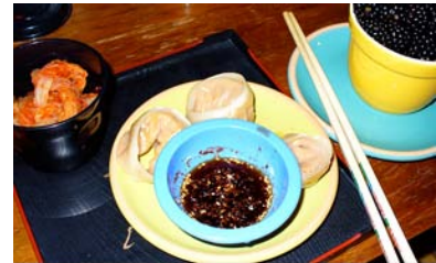
Eating with chopsticks

Eating customs vary but generally, conversations during meals are limited. North Koreans avoid, wherever possible, using their fingers to touch the food as eating with hands or fingers is impolite. They typically slurp their soups and drinks. It is an acceptable way to cool hot dishes rather than blowing on them. They use chopsticks to eat all foods except rice, for which a spoon is used. North Koreans consider it poor manners to eat while walking on the street. 186