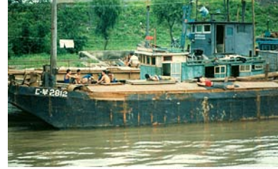
North Korean boat Amnok River

River transportation is a less common mode of moving passengers and goods. 311 Two of the main rivers used to transport freight are the Amnok (Yalu), running along part of the border with China, and the Taedong, flowing from central North Korea to the southwest.