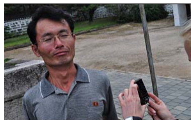
North Korean tourist guide

Although no official statistics are available, crime against foreign nationals is presumed rare in North Korea where visitors are escorted everywhere. 276 One seven-year British resident felt safe everywhere he went. Shortly prior to his departure, however, he took a swing at a local after the man, who appeared inebriated, began insulting him. Male drunkenness is so common in North Korea it figured into how the matter was judged. 277 A member of a foreign journalists' tour reported finding a man passed out in front of the restaurant where his group was scheduled to eat. Their guide immediately summoned passersby to surround the man to prevent anyone from taking pictures. 278 After slipping away from his Chinese tour group, an Asian American college student walked the streets of Pyongyang without interference despite the fact he was 1.9 meters (6 ft 4