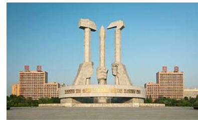
Korean Workers Party monument

North Korea dropped Marxism-Leninism from its constitution in the 1990s. 81 Nonetheless, its governance system is similar to other state socialist countries where power emanates from a political party to which the administrative apparatus is subordinate. Mass campaigns are launched through the KWP, which is symbolized by a Leninist hammer and sickle, representing workers and farmers, that flank a traditional Korean writing brush representing intellectuals, in this context technocrats, a three-group alliance. Under Kim Jong Il, the military assumed a more important role in national affairs, reflected in his “military first” ( songun chongchi ) reorientation, that is presumed to have come at the KWP’s expense. 82 The names of military figures were listed before top party officials in rankings and public events. The current chief of state is his son, Kim Jong Un, appears to be restoring the KWP as the center of political gravity. 83 Approximately 12-14% of the populace are KWP members. 84 A popularly elected 687-member Supreme People’s