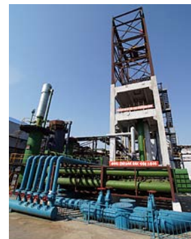
Fertilizer Plant in Hamhung

Though rich in mineral resources, including a large number of rare earth metals, it is estimated that North Korean mines operate at less than 30% of capacity. 113 Lack of electrical power and poor transportation infrastructure pose significant obstacles to increasing production. The DPRK simply does not have the resources to exploit a sector estimated to be worth USD 6 trillion by the South Korean government in 2009. 114,115