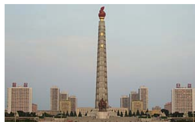
Pyongyang Juche Tower

Pyongyang, which literally means “flat land,” lies on the banks of the Taedong River, approximately 48 km (30 mi) to the west off the Yellow Sea. Although Pyongyang's recorded history begins when a Chinese trading colony formed in 108 BCE, according to legend it is one of the nation's oldest cities, founded in 1122 BCE. 33