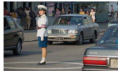
Traffic policewoman

The capital city's broad boulevards were long legendary for their emptiness. Many people appeared to walk to their destinations. Due to the chronic electricity shortage, the government relied on sharply dressed “traffic ladies” to direct the few vehicle drivers. 269 A Beijing-based tour operator has observed the recent installation of traffic lights and the redeployment of traffic ladies as enforcers over successive recent visits to North Korea. 270