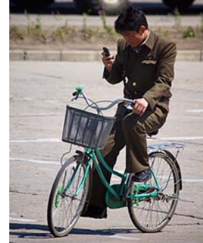
DPRK cell phone user

Koryolink operates with technology provided by an Egyptian company that has negotiated exclusive rights to the market until 2015. 95 Users are not able to retreat into a private world; Rodong Sinmun , mouthpiece of the KWP, sends out daily texts of approved news to subscribers. 96 While ordinary citizens do not have access to the internet, the DPRK has a domestic equivalent, known as the intranet ( kwangmyong ). It includes a search engine, news groups, and an email program that operates with Red Star, North Korea's homegrown alternative to Windows. 97