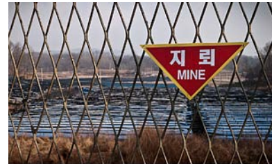
DMZ landmine warning

The number of landmine casualties in North Korea is unknown. The country admits it has laid mines in the Demilitarized Zone (DMZ) along its border with South Korea, and there are unconfirmed suspicions that areas along the east coast have also been mined. Following severe rains on the Korean Peninsula, boxes of mines believed to have washed down from North Korea were found near a South Korean island. 333 Several similar incidents have occurred in recent years. 334, 335