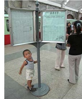
Metro station newspaper board

While North Koreans generally read communal newspapers, personal radio and television ownership is the norm. Traditionally procured through a state distribution system, these devices can only be tuned to official programming. Paper seals are placed over the buttons to alert authorities to tampering. Defectors have detailed harrowing unannounced visits from security officials to make sure the seal had not been damaged, which would indicate someone tried to listen or watch unapproved programming. 86 There are two state-run television channels that broadcast intermittently during the day, with a third on weekends that shows old Chinese movies. 87 North Koreans can now buy radios and television sets on the free market that have been retrofitted to allow for adjustable tuning. 88 DVD players, initially smuggled in from China, are now manufactured locally. Department stores in Pyongyang stock LCD TVs and USB drives. 89 Surveys suggest that as many as 50% of those who cross the border have watched unapproved entertainment and 25% listened to foreign broadcasts before leaving North Korea. 90 In another development, the Associated Press (AP) opened a bureau in Pyongyang in January 2012, giving foreign journalists and photographers regular access to the country.