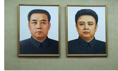
Pictures of leaders

The Korean Peninsula has a diverse religious heritage that includes shamanism, Buddhism, and Confucianism. In contrast to the rest of Northeast Asia, Christianity made rapid inroads on the peninsula. While today South Korea claims some of the world's largest Christian congregations, before World War II two-thirds of Korean Christians lived in present-day North Korea. 121 In 2002, Pyongyang estimated there were some 12,000 Protestants, 800 Catholics and 10,000 Buddhists in the Democratic People's Republic of Korea (DPRK). 122 According to more recent Pew Forum surveys, Christianity is gaining adherents. There may be as many as 480,000 Christians inside the country. 123 They presumably worship in illegal, underground house churches or within their own homes. One defector explained her family worshipped together every Saturday evening, emphasizing, "We had to be very quiet. We whispered when we prayed, sang songs or read the [banned] Bible. We often covered our heads to muffle the noise." 124