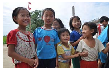
North Korean children

Kim is the paternal family name, Jong is the generational name, while the third is unique to each son. The next generation of males will likely have the same third name but a different second name. Circulating name parts ( dollimja ) enable each generation to know how far removed they are from their original lineage founder. 392 Women keep their paternal family name when they marry, and so, their names are different from those of their husbands and children. 393