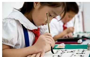
Primary school

Primary and secondary enrollment is compulsory in North Korea, where all pupils complete a year of kindergarten, four years of primary school, and six years of middle school. 253 The principal oversees day-to-day organizational matters for a school while the vice-principal, who also serves as the school's KWP party secretary, is responsible for maintaining adherence to party-set ideological standards. 254 Teachers are provided with detailed instructions on how to cover their assigned subject, even if it is math.