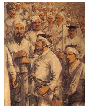
Donghak rebels

founded in 1860 by a Confucian scholar. He quickly gained a large number of followers. Chondogyo did not incorporate the idea of an “eternal reward” for one’s good deeds, focusing instead on securing righteousness in the material world and in everyday life. Motivated by this vision, many practitioners tried to improve and reform society. They participated in both the 1890s Donghak Rebellion and the March 1st Movement of 1919, a series of nationalist demonstrations that called for Korean independence. 137 Though its influence has waned in both Koreas, at international religious conferences, Chondogyo groups, along with Buddhist and Christian organizations approved for participation, sometimes represent the DPRK. 138