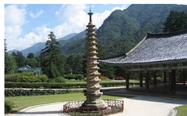
DPRK Pohyon Temple

The DPRK is officially an atheist nation. 139 Nonetheless, the constitution “grants freedom of religious belief and guarantees the right to construct buildings for religious use and religious ceremonies.” 140 In reality, Pyongyang severely restricts religious activity to a few approved churches where visitors note the absence of children among the worshippers who are not allowed to bow their heads or close their eyes during services. Individuals who attempt to privately practice a Christian faith risk arrest and imprisonment. North Korean nationals caught proselytizing have been executed. 141