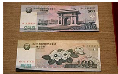
North Korean won

In late 2009, Kim Jong Il announced a currency devaluation. In one week's time, 1,000 North Korean won (NPW) would be worth 10 NPW. 105 The news prompted unheard of protests when people realized their bank balances would be wiped out since the amount they were allowed to convert into new won was limited. One defector reported his family's life savings, equivalent to USD 1,560, was reduced to USD 30. 106 Though intended to tame inflation and presumably undercut private traders who had amassed monetary wealth, it caused a buying panic as people spent every old won they had before their money became worthless. Citizens would henceforth seek to keep their funds in foreign currencies, effectively rendering the new won worthless. 107 A newspaper noted, the situation "combines one thing North Korean authorities don't like (markets) with another thing they wish they didn't need (foreign cash)." 108