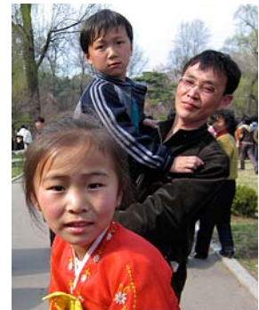
Father with his children

Those trying to advance in the ranks of the KWP would be unlikely to seek a divorce for that reason. North Koreans who are determined to end their unions may have to pay “commissions” to court personnel to obtain a decree. 375 The courts routinely award the couple’s property and children to the husband, which forces the wife to forge a new life. 376