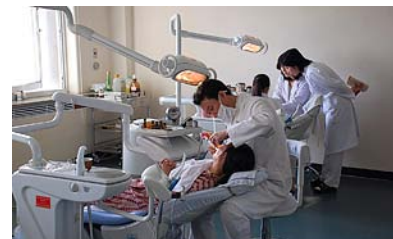
Pyongyang Maternity Hospital

Acute shortages of drugs, vaccines, sterilizers, and essential medical equipment, compromise delivery of medical services. 245, 246 Nowadays, surgery is routinely performed without anesthesia. Shortly before she defected in 1998, a doctor reported that patients had to bring their own bottles if they required intravenous fluid. Most brought beer bottles. “If they would bring in one beer bottle, they’d get one IV. If they’d bring two bottles, they would get two,” she explained. 247