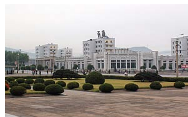
© Raymond K Cunningham Jr. Chongjin

Located in northeastern North Korea along the coast of the Sea of Japan (East Sea), under Japanese colonial rule (1910-1945) Chongjin was developed as an iron and steel production center. After the establishment of the DPRK, the city's strategic location and transportation links to both the Soviet Union and China helped ensure its strategic importance. The industrial base was expanded to include shipbuilding, synthetic textiles and chemicals. Residents describe the city's economic