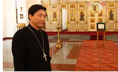
Orthodox priest in Pyongyang

Visitors also need to be aware of North Korea’s restrictions concerning general religious conduct, whether inside places of worship or outside of them. They should avoid behavior that could be considered proselytizing and not distribute religious materials or even give them away occasionally to a local person. 164 Visitors should not engage in conversations about religion and avoid any kind of religious socializing in groups, unless the government sanctions it. Finally, if visitors wish to attend a religious service or presentation, they can do so only if it is state-approved.