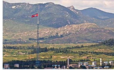
North Korea from DMZ

Virtually all of the nearly 25 million citizens living in the isolated nation of North Korea are ethnic Koreans who share a common background, culture, and language. 1 Their nation-state came into existence after the victorious World War II Allies divided the Korean Peninsula approximately in half at the 38th parallel, ending 1,000 years of territorial integrity. The 1945 division was intended to be temporary. However, it remains one of the most heavily militarized boundaries in the world. 2