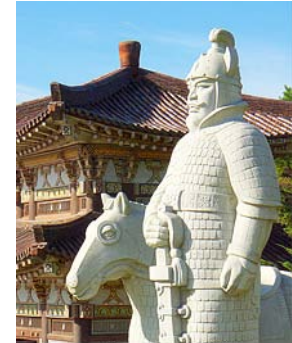
Tomb of King Tongmyong

Following the demise of this early kingdom, various independent states ruled parts of the peninsula for centuries. In 918, the Koryo Dynasty was established. Profound social and cultural changes followed, including the introduction of a civil service examination system which led to the creation of a scholar-gentry class ( yangban ) that dominated the aristocracy. The Koryo gave way to the Chosun Dynasty in 1392. 45