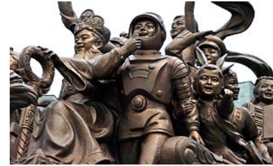
Children's Palace monument

“Thank you, Father Kim Il Sung” is the first phrase North Korean parents train their toddler children to repeat. 165 Literally, every piece of information these children encounter as they grow up has been designed to deify the Kim leadership and underscore the benevolence of the Korean Workers’ Party (KWP). 166 It is unclear whether the regime can sustain the pretense, as the citizenry gains greater access to information from the outside world. In April 2012, the government took the unprecedented step of admitting a satellite launch had failed. Two previous attempts to launch a satellite also failed. In both instances, government propaganda claimed they were successful. Moreover, state media informed the North Korean people these circling satellites were broadcasting songs singing the praises of the Kim leadership. 167