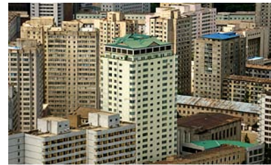
Pyongyang housing

In exchange for food and housing, DRPK citizens were expected to devote themselves to the revolutionary cause. Beyond meeting production quotas, workers were required to participate in collective social activities, such as studying the writings of the national leader or participating in mass events. 215 Mothers would drop their pre-school age offspring at day care centers before 8:00 a.m., where children could also be boarded. 216 After arriving at their own place of work, they could remain on the job until 8:00 p.m., which might be followed by an additional two hours of study and self-criticism sessions. Annual leave or vacations simply did not figure into the daily lives of urbanites. 217 A middle-aged defector from the coastal city of Chongjin recalled the rare Sunday when neither she nor her late husband was required to report for work and their four children were not busy with school. They enjoyed only two family outings to the beach despite its extremely close proximity. 218