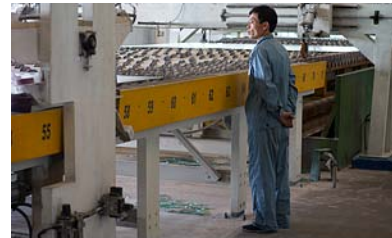
Glass factory employee

Non-payment of salaries coupled with the withdrawal of state subsidies for essential goods like food makes life challenging for factory workers. According to former college professor who defected, the average monthly salary of a North Korean worker is approximately KPW 2,000 (USD 15) while 1 kg (2.2 lbs) of rice costs KPW 4,000 (USD 31). 222 North Koreans increasingly rely on ingenuity to survive. At one Pyongyang shoe factory, only about 100 of the 750 workers still show up. While the others remain on the books as employees; they buy the materials from the factory, make the shoes at home and sell them privately. After paying management a fixed amount, they can keep the rest. 223