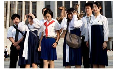
Students at university

North Korean universities and technical colleges offer a specialized curriculum such as engineering, agriculture, industry, medicine, foreign language study, music, fine arts, and so on. In addition to studying, students are required to participate in productive labor. For urbanites, this can include stints in the countryside. In 2011, university classes were cancelled for ten months, ostensibly to enable college students to help build “a great, prosperous and powerful nation.” 256