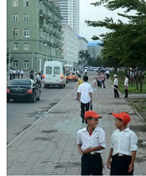
Pyongyang street

After the Korean War ended, thousands of people in the North Korean countryside migrated to urban areas. Approximately 17.7% of the country's population resided in the nation's cities in 1953 (the year the war ended), according to official statistics. Estimates from the Central Intelligence Agency place that statistic at 60% for the year 2010. 205 South Korea, despite claiming better agricultural conditions for farming, was 88% urban in 2010. Demographers expect the differential to accelerate. 206