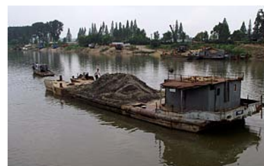
Boat on Taedong River

At 397 km (247 mi), the Taedong is North Korea's third-longest river. It has a navigable length of 245 km (152 mi). 31 The Taedong River begins in the Nangnim Mountains of central North Korea and flows toward the southwest. It passes through Pyongyang and discharges into a long, narrow inlet of West Korea Bay, the Yellow Sea that lies to the west of North