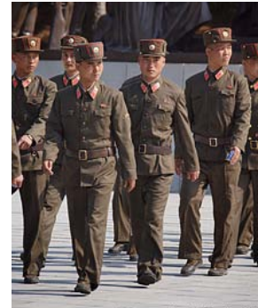
DPRK military soldiers

(KWP), local people’s assemblies, and local administrative committees elect officials at the local level. The committees are extensions of the national bodies of the KWP and the Supreme People’s Assembly (SPA) as well as the cabinet. 319 There are no checks and balances on state power in North Korea. 320 At the same time, the administrative hierarchy of authority is riddled with principal-agent problems that result in diversion of goods from their intended purpose. 321 Fertilizer allocated by the central level, for example, ended up for sale on the open market in June 2012. Despite the prospect of punishment, farmers sold the fertilizer in order to recoup what they spent on gasoline and truck rental fees to transport it from the distribution center to their fields. 322 Aware of the situation, a former ambassador, upon receiving a request for fuel aid, pointed out “others” (e.g. the military) would likely appropriate whatever assistance his government could provide the cooperative. He was informed that wouldn’t happen because the farm manager was the chair of the local KWP committee, a position that gave her the power to fend off any effort by the local military commander to appropriate the fuel. 323 Still, farmers face the ever present threat that in the event of food shortages, the military will simply come in and seize whatever it needs to feed the troops. 324