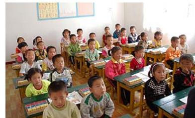
Cooperative primary school

Each cooperative has at least one primary school. There is one middle school for every two or three cooperative farms. Each rural middle school has approximately 500-600 students, with an average class size of around 30 students, typically operating in two shifts. Despite the impact of food shortages on children, the system excludes those who have developmental disorders from schooling; there are no known special education programs in North Korea where disabilities are viewed as a source of shame. 318