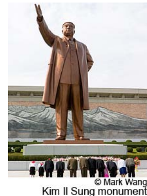
Kim Il Sung monument

After the war, Kim Il Sung's authority was solidified through the creation of a personality cult of such unprecedented proportions that it troubled others in the communist bloc, since it crowded out Marx and Lenin. 58 To sustain the myths surrounding his leadership, Kim ordered all references to Soviet support, which had been critical to his rise to the top, excised from the public record. 59 In 1955, he unveiled the concept of juche (independent self-reliance). Referred to as the nation's guiding ideology in North Korea, juche established Kim Il