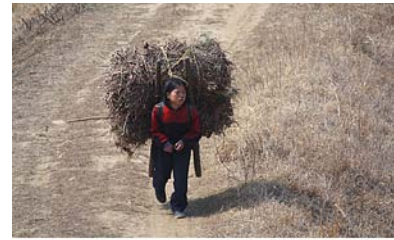
Girl taking wood to school

Children are accorded a special place in North Korea. Government and party leaders spend a great deal of time visiting collective venues dedicated the instilling the correct values in the next generation. 349 This includes indoctrinating them to view the United States as an evil place and the American people as monsters. Nonetheless, according to a British journalist, “the littlest North Koreans show more fascination than fear when they encounter the rare American in Pyongyang, invariably waving and calling out ‘Hello’ in English.” 350