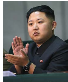
Kim Jong Un

In December 2011, Kim Jong Il died. According to the local media, it was not only the North Korean people who mourned his passing; a crane circled a statue of Kim Il Sung before landing on a nearby tree to hang its head in sorrow. 73 Swiss-educated Kim Jong Un, now referred to as Supreme Leader, succeeded his father, who was given the posthumous title of KWP “eternal general secretary.” 74