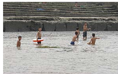
Children swimming in Yalu River

At approximately 800 km (500 mi) in length, the Amnok River (Yalu River) is the longest river in North Korea. Beginning from its headwaters at Mount Paektu, the river flows in a general southwesterly direction along much of North Korea's border with China, the northeastern region of Manchuria. It empties into Korea Bay, an arm of the Yellow Sea on the west coast. The river has three main tributaries in North Korea and is navigable by small craft for 678 km (421 mi). 26,27 Since the 1950s, silting has greatly increased, and large ships have much more difficulty traveling upstream from the mouth of the river. From November through February, the river is covered with ice and closed to shipping. 28