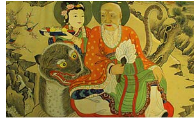
Painting of mountain spirit

Shamanism is Korea's earliest documented faith. Common among hunting and gathering cultures, it is predicated on the belief that a shaman ( mudang ) can contact or influence gods and demons in the spirit world. There are still shamanists in South Korea today. 129 It is unknown how many people subscribe to such beliefs in North Korea.