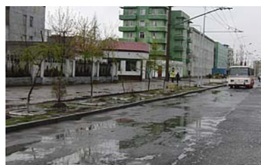
Slick city street

Cold, dry winters and hot, humid—often rainy—summers characterize North Korea's continental climate. 22 Over half the precipitation throughout the country occurs in the summer (June–September), when total annual rainfall is approximately 1,000 mm (39.4 in). 23 Average temperatures in North Korea generally decrease the further north one goes, although elevation and proximity to the coast are modifying influences to this trend. Higher elevation locations also see greater extremes between daily highs and lows. Because of ocean currents and the mountain ranges that hug North Korea's eastern coast, winter temperatures there tend to be some 3° to 4°C (5° to 7°F) warmer than North Korea's western coast. 24 At Pyongyang, located in the southwestern part of the country, the average temperature in July is 29°C (84°F) but in January falls to an average of -13°C (8°F). 25