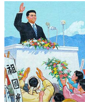
Mural of Kim's Homecoming

After the Japanese were defeated in 1945, the Soviet Union occupied the northern half of the peninsula, secured the border at the 38th parallel, and set about creating social and political administrative structures similar to their own. 52 Amongst the local population, they found a number of candidates for leadership, including a leftist Presbyterian deacon. Instead, they chose 33-year old Kim Il Sung, who had returned home by Soviet ship a month after the war ended. The scion of a Christian family that settled in Manchuria, he had spent 20 years away from the peninsula and no longer spoke Korean like a native. 53 He reportedly rehearsed his initial speeches in front of Soviet advisors. This was part of Moscow's exhaustive grooming process to prepare him for civilian leadership. 54 On 9 September 1948, when the DPRK was formally founded, Kim Il Sung was declared premier. The following year the Korean Workers' Party (KWP) was established by merging other organizations into a single communist party.