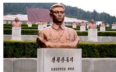
Revolutionary Martyrs Cemetery

Authorities reserve those Confucian rituals for the leadership. When Kim Il Sung died in 1994, his funeral procession was an elaborately staged spectacle. Mourners filled Pyongyang’s broad boulevards and expressed their grief in frenzied fashion; crying, wailing, and fainting as the funeral cortege passed by them. A more subdued but nonetheless publicly choreographed funeral was similarly staged for Kim Jong Il when he died in 2011. Tens of thousands lined the streets, weeping and wailing. 387 Wailing ( kok ) is a traditional Korean response that reflects not only the family’s sadness over the loss of the deceased, but guilt over the prospect their lack of attention might be responsible for the person’s demise. 388