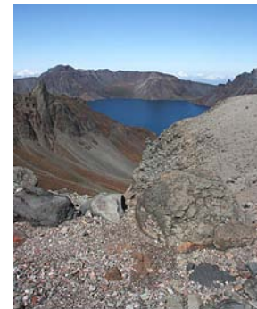
Mount Paektu and Lake Heaven

The Kaema Highlands, called the roof of the Korean Peninsula, extend across the northeastern part of the country, with an average elevation of 1,000 m (3,281 ft). 12 Mount Paektu, with an elevation of 2,744 m (9,003 ft), is the highest mountain on the peninsula. 13 Lake Chon-ji (Heaven Lake) lies inside its volcanic crater. 14 The mountain, which straddles the border with China, is venerated as the ancestral home of all Koreans. 15 According to legend not widely accepted outside North Korea, Kim Jong Il was born in a camp on Mount Paektu in the 1930s where his father was fighting the Japanese. 16 Prior to his death in late 2011, the evening news bulletin broadcast into every home began with an emotional ballad detailing the leader's mythical qualities; making reference to his birthplace. In the words of a scholar, "[t]his kind of flowery language... does reflect a uniquely North Korea[n] understanding of the connection between territory and race." 17