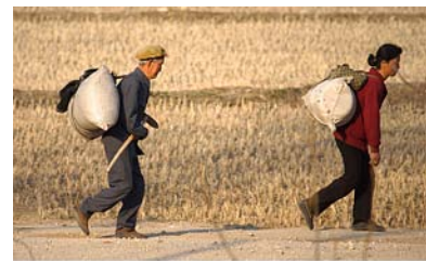
Carrying goods to market

In response to declining grain production, in 1991 the government unveiled a “Let’s Eat Two Meals a Day” campaign that legitimized reduced rations. 297 As shortages grew more acute by the mid-1990s, the PDS proved unable to deliver. While 61% of the population received rations through the PDS in 1994, the number had plummeted to 6% three years later. 298 The social contract in which the state provided for the basic dietary needs of the populace was in tatters. 299