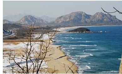
East coast of North Korea

The partitioning of the country North Koreans refer to as Chosun and South Koreans call Hanguk created two mutually hostile states, the Soviet-backed Democratic People's Republic of Korea (DPRK) in the North and the U.S.-backed Republic of Korea (ROK) in the South, in competition for recognition as the sole legitimate representative of the Korean people. 3 The split had more than political implications. The North has a plentiful resource base including 200 different types of minerals. 4 The agricultural South traditionally served as the peninsula's breadbasket. 5 At the time of partition, the North was wealthier. 6 Through the 1960s, the DPRK was more industrialized than the ROK and claimed a higher per capita income as well. 7 Now it is routinely described as one of the poorest nations in the world, while the ROK may supplant Japan as Asia's second largest economy. 8