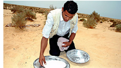
© Alvise Forcellini Man cooking bread

Hardships from drought and debt regularly force Tunisians, especially young men, to seek work away from their families. In the years following independence, many Tunisian males traveled to European countries or to oil-producing countries like Libya and the Gulf states to work as both skilled and unskilled laborers. 501 Their remittances play a significant role in supporting many Tunisian families. 502