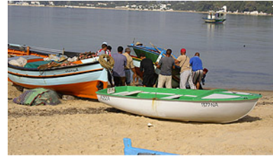
Men working together

Tunisia's biggest work problem in urban areas is the lack of work. Historically, cities have had most of the country's jobs. Tunis claimed 69% of the national employment opportunities in 2002. 321 Urban unemployment rates have been a few percentage points lower than rural rates, despite the impact of rural-to-urban migration and increased competition for available jobs. 322 However, by 2010, unemployment among "high-skilled young individuals" (e.g., graduates of city-based universities) had risen to 44%; many of those unemployed had been out of work for more than a year. 323 Women suffer disproportionately from urban unemployment, as do workers in the poorer cities of the interior. 324, 325, 326 In protest of the lack of work-related opportunities, unemployed Tunisians shut down operations at the Gafsa Phosphates Company in mid-2012 with demands for more transparent hiring practices. 327