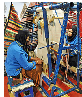
Talking while working

When exchanging greetings, Americans and Europeans generally prefer to maintain a distance of about 1 meter (3 ft) from each other. Arabs prefer a shorter distance; so one should not be alarmed if personal space feels much smaller. 274 Touching also is common among family and friends of the same sex in Tunisia. Women may brush or kiss each other's cheeks several times in greeting, and men may walk together hand-in-hand or arm-in-arm. However, such public displays of affection between members of the opposite sex