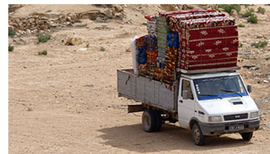
Truck transporting rugs

2,165 km (1,345 mi) of passenger and freight railway lines cross the country. 356 In the 19th century, European colonization brought two different gauge rail systems to Tunisia: standard gauge rails to the north and the slower narrow or metre gauge tracks for the phosphate mines to the south. 357 The Lezard Rouge (Red Lizard), once the pleasure train of the bey of Tunis, runs on narrow gauge through the scenic Seldja Gorge. Tourist service, suspended most of 2011,