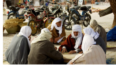
Elders playing a game

A third of Tunisia's population live outside of urban areas, in the northern mountains and valleys, interior plains, and southern oases and deserts of the country. 394 Some rural Tunisians continue in traditional ways of life—farming, herding, and seasonal nomadism. Others make a living in phosphate mines and oil fields, or seek migrant work in cities or abroad. 395, 396