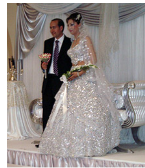
Tunisian wedding

Until 1956, Islamic law gave Tunisian men rights to polygamy and to repudiation ( talaq ), unilateral divorce without judicial intervention. 519 In 1956, Tunisia's Personal Status Code outlawed polygamy and repudiation, and gave women rights to initiate divorce. Since the passage of the law, divorce rates have varied. In the 1960s, men were still the majority of those requesting divorce. By the 1980s, requests came equally from men and women. Among women, reasons for divorce expanded from "assurance of food support" to include ill treatment and domestic violence, while the wife's moral conduct became a more common reason among men seeking divorce. 520 Although the divorce rate was recently reported as below the world average, al-Nahda leader Rachid Ghannouchi claims Tunisian divorce rates are the third-highest in the Arab world. 521, 522