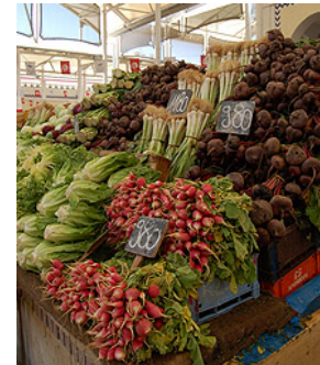
© Jay Owens Tunisia agricultural market

Tunisia's economy has diversified from a traditional emphasis on agriculture to include industrial and service sectors. Mining, manufacturing, banking, tourism, farming, and fishing all have contributed to the country's 5% average economic growth rate over the past 40 years. 167 Since independence, the government has applied both socialist and neoliberal approaches to manage the economy. Funding for water and power infrastructure, price subsidies, education, and public-sector employment helped establish a modest but rising standard of living for a healthy, well-educated workforce. It also created high expectations for opportunities and services in a country of limited resources and revenues. When the country faced inflation and growing budget and trade deficits, the government acted to liberalize (privatize) the economy, increase foreign investment, and reduce public welfare spending. These actions, according to some analysts, increased corruption, the unequal distribution of wealth, unemployment, and poverty. Regional socioeconomic imbalance between the prosperous coast and the impoverished interior also grew. These problems fueled the 2011 revolution. The difficulties of resolving them are