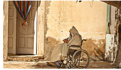
Elderly man in wheelchair

However, these rates are lower in rural areas, where about 80% of the population has access to safe drinking water and 60% has access to improved sanitation. 442 Travelers should take potable water when visiting rural areas, where water sources may be contaminated or seasonally dry. 443