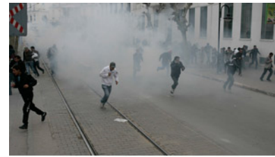
Protests against the president

In mid-2011, Tunisian courts tried and convicted Ben Ali in absentia for committing economic crimes and causing civilian deaths, while the search continued for national assets that his family hid in foreign real estate, yachts, planes, and bank accounts. 136, 137, 138 Protests in 2012, sometimes turning violent, have focused on obtaining more jobs and better wages, more public respect for Islam, and more government support for civil rights and freedom of expression. 139, 140, 141