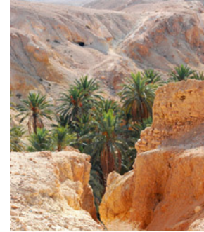
Desert oasis

A northern and coastal Mediterranean climate of mild, rainy winters and hot, dry summers gives way to drier, more extreme weather in the interior plateaus and the desert south. Winter lows in the northern mountains can drop to near freezing at night and only reach daytime highs of 10–12°C (50–54°F). Winter nights in the Sahara can be equally cold, but summer days may reach 50°C (122°F). Annual rainfall averages 80 cm (31 in) in the north but only 10 cm (4 in) in the south. The northwestern mountains may receive 150 cm (60 in) of rain annually, making them the wettest part of North Africa. 12, 13, 14, 15 The majority of Tunisia's population of 10.7 million live in urban areas that developed in the Mediterranean climatic region. 16, 17 Those who live in the less hospitable interior have found ways to adapt, from underground cave homes to hilltop ksour (granaries). 18, 19