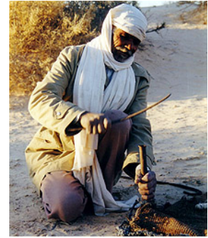
Desert man making tent

Rural Tunisians have adapted to the differing climates and environments of their regions with a variety of working rhythms and housing styles. 463 Wet and dry seasons dictate when farming occurs. Crops are generally planted early in the year and harvested as they ripen during the spring or summer months. Traditional whitewashed farm houses are topped by domed brick roofs that funnel air currents for summer cooling and winter heating. A low wall around the homestead keeps out sand and stray animals. 464