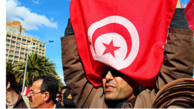
Jasmine Revolution protester

Tunisia is situated on North Africa's Mediterranean coast. Geographically, culturally, and politically, it is part of the Maghreb (Arabic for "the West"), the North African region that also includes the modern nations of Libya, Algeria, Morocco, and Mauritania. 1, 2 Since ancient times, Tunisia has been a stopping point and a destination for sailors and overland invaders. Phoenicians, Romans, Arabs, Spaniards, Turks, and French occupied the land until Tunisia's independence in 1956. 3 Today, a strong sense of national identity unites a population who are 98% Sunni Muslim, Arabic-language speakers of mixed Arab-Berber descent. 4, 5