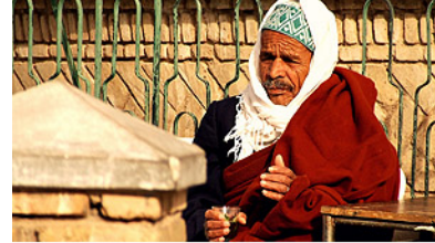
Old man drinking tea

Most Tunisians are Arabic-speaking Sunni Muslims descended from Berbers, Phoenicians, Romans, Arabs, Spaniards, Turks, and others who have intermarried and assimilated into a shared society and culture. Ethnicity is typically mixed and rarely a source of social conflict. A few Berber groups, who settled in the far south or in the hills near the Algerian border, retain a distinct ethnic identity, reinforced by some monolingualism among their Berber language speakers. 168, 169, 170, 171, 172