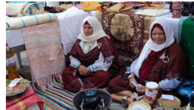
Festival of food

The Islamic New Year commemorates the Prophet Muhammad's Hijra (migration) from Mecca to Medina in 622 C.E. When Muhammad began preaching in Mecca, socially prominent families and some merchants became concerned that his sermons would lead to changes in the existing social order.