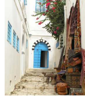
Alleyway in Tunisia

Visitors have often described Tunisia as more liberal or tolerant in attitude and more relaxed in practice than other Arab Muslim countries, perhaps resulting from Tunisia's first two presidents, who promoted national traditions that were separate from ethnic and religious influences. 253, 254 At the same time, the common phrase "In sha'allah" ("God willing") is a reminder of how Islamic traditions still permeate daily life in Tunisia. 255