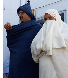
Husband and wife

Traditionally, Tunisian marriage was the union of two families. Especially in rural areas, marriage among cousins was preferable, and fathers would give daughters younger than 15 to older men. Families still take an active interest in seeing their children married (mothers are known to scout prospective brides for their sons at the public baths). 509 However, within a few generations of the passage of the Personal Status Code, a large majority of surveyed Tunisians reported that they, and not their parents, chose their own spouses. 510 New social spaces, from shopping malls to Internet chat rooms, permit “dating” beyond the scrutiny of family and community. 511