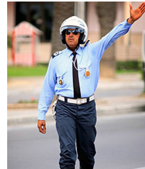
Police officer

Following the revolution in 2011, defense forces as well as police have been involved in maintaining order and security. Border areas with Algeria and Libya have long been sites of smuggling, illegal migration, and occasional insurgency. The 2011 Libyan civil war has been blamed for a recent rise in arms trafficking. Tunisia declared its Saharan territory a closed military zone in 2012. 479, 480 Therefore, extra checkpoints in areas approaching the frontier tend to be permanent highway fixtures. Vehicle searches are routine.