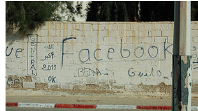
© Wieland Van Dijk Rise of Facebook

Tunisia has comparatively well-developed telecommunications infrastructure for North Africa. 153, 154 Dozens of print, radio, and television broadcasters provide information and entertainment in Arabic, French, and English. 155 The mobile phone count (11 million in 2009) exceeds the national population, and the Internet connects some 3.5 million Tunisians domestically and internationally. 156 Tunisians can browse Google in their local language and domain, and almost 2 million use Facebook. 157, 158