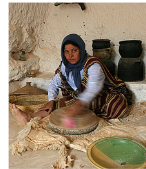
Woman preparing bread

Land and water insecurities have contributed to Tunisia's decades-long decline in agricultural employment. 433, 434 Irrigation is not feasible for small rural farmers in the center and south, who are idle for long periods between infrequent rains. 435 Industrial laborers from rural areas