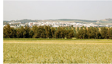
Plot of land

Tunisian traditions of land use evolved from Berber and Bedouin practices, and later from Ottoman-interpreted Islam. Land could be collectively owned by a tribe ( arsh ); endowed to support a family, religious, or charitable group ( habous or waqf ); dually controlled, e.g. by a farmer and his political patron ( hanshir ); or individually held ( melk or mulk ). 417, 418