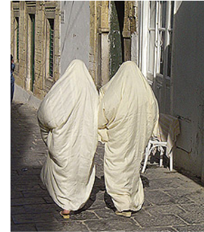
Covered women

However, not all Tunisians observe the code equally, and Muslim preferences for gender segregation, modesty, and male authority continue to influence social life. Since the 2011 revolution, some Tunisians fear that Islamist influence in the new government will turn back women's legal rights in the future constitution and other laws. 225, 226, 227 Recently, Tunisian women have begun to express a growing sense of insecurity in public places, fueled by the activities of religious extremists and criminals. 228, 229, 230