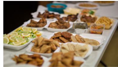
Ramadan feast

Ramadan, the ninth month of the Muslim calendar, is believed to be the time when Allah called the Prophet Muhammad to Islam. It is a month of fasting, prayer, charity, and goodwill. From sunup to sundown, even Tunisians who are not otherwise observant Muslims will abstain from eating, drinking, smoking, and engaging in sex during daylight hours. 235 They may dress more modestly during the month. Although non-Muslims are not expected to observe the fast, they should not eat or drink in public or in front of a fasting Muslim. 236