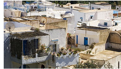
Sidi Bou Said

The Tunisian revolution reached Tunis in December 2010. 27 Protests in January 2011 led to deaths, destruction of government and private property (including the main train station), and an army-enforced curfew. 28, 29, 30 Since the departure of former president Ben Ali, the post-revolution government has faced continued demonstrations in the city against insults to Islam, economic inequality, and political repression. Violent incidents have brought about temporary states of emergency on several occasions. 31, 32, 33