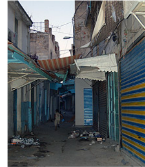
Tunis medina at dusk

Tunisian cities, especially tourist areas, have their share of pickpockets, purse-snatchers, and beach, car, and hotel burglars. Items left out in residential yards or garages also often are stolen. 367 Male gigolos at beach resorts may target wealthy-looking tourists of both sexes. 368