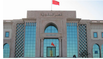
Tunis government building

While the 1959 constitution designated the president as commander-in-chief of the armed forces, the military serves the nation, not the president, as demonstrated when the army refused a presidential order to fire on protestors during the 2011 revolution. 146, 147 Former president Ben Ali (who served as a security chief before taking the presidency) controlled an internal security apparatus that carried out political surveillance and repression, which the interim government has moved to disband. 148, 149, 150 Civil and criminal law is patterned after the French legal system, with some personal matters shaped by shari'a (Islamic law). Since the revolution, conservative Islamists have tried to increase the role of shari'a in the new constitution, with little success to date. The trials of some Ben Ali-era officials have called into question the effectiveness of post-revolution judicial reforms. 151, 152