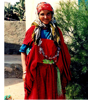
Village woman

With its southern Mediterranean climate, Tunisia has two basic seasons: very warm and very cool. A stroll down Tunis' wide Avenue Habib Bourguiba demonstrates both the Tunisian admiration for fashionable European dress and the desire to be comfortable and modest. The most practical dress for the summer months is lightweight, loose-fitting cotton attire. For men, this means trousers and short-sleeve shirts; for women, knee-length skirts and longer-sleeved blouses are appropriate. Apart from tourists at the beach, it is not appropriate for men and women to wear shorts in public.