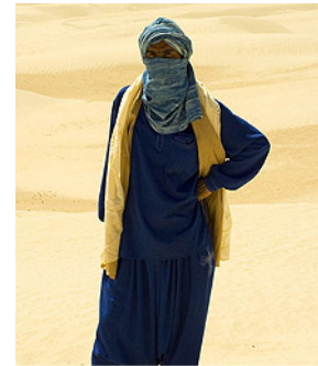
© See Wah Chang Man in Sahara

Although the forces of French colonialism, family planning, and urbanization have reduced the average size of the traditional Tunisian family to just above four persons, family-centered values of mutual respect and support among kin remain strong. Rural migrants reproduce their family and community residential patterns in cities when possible, and urban residents retain close ties to their relatives in rural areas, visiting frequently and for extended periods. 489, 490, 491, 492