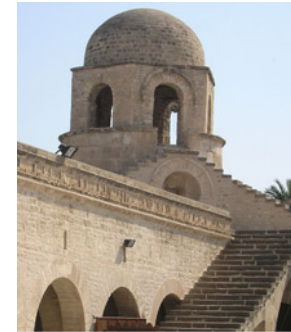
Great Mosque in Sousse

Sufism, a mystical approach to Islam, has influenced both Sunni and Shi'ite Muslims. 195 In Tunisia, the veneration of holy figures, known as maraboutism, grew from Berber beliefs and practices, folk Islam, and Sufi mysticism. Marabouts are healers who perform miracles and confer blessings on sages or holy warriors. Their zawiya (graves), found throughout Tunisia, are sites of pilgrimages and local festivals, where believers come seeking baraka (spiritual blessings) or healing from infirmity. 196, 197