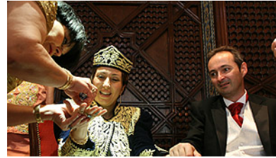
Wedding ceremony

The Tunisian wedding is a week-long affair in the countryside and lasts several days even in the city. It is costly and complicated, with crowds of guests at the receptions and festive dinners—with music and dance sponsored by the families of both bride and groom. In the first days, the groom prepares or shops for gifts for the bride, while the bride is prepared with henna decoration. 533 To reach the party on the last day, a motorcade (or camelcade) through the neighborhood is customary. 534