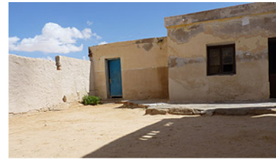
Bedouin family home

In Tunisia's rural interior, people grow, raise, catch, or make most things they need for daily life. Men make their livings and their reputations in the public sphere, leaving the management of the household—gardening, goat herding, grain grinding, weaving, cooking, sewing, compound cleaning, laundering, and childrearing—to women. When men must leave home for migrant work, their farming tasks also fall to women. 454