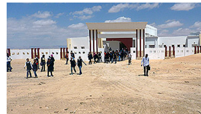
Rural high school

Independent Tunisia's program of educational reform led to more schooling in rural areas. However, in sparsely populated areas children often travel several miles a day to attend elementary or secondary school. Rural children also may be kept out of school when their help is needed to harvest crops, tend animals, or otherwise support family finances. 450 Thus, illiteracy rates are still higher among the rural population, particularly among girls and women. 451