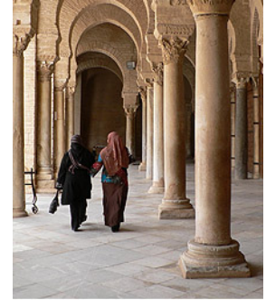
© John Morris Women in a mosque

Tunisia’s 1959 constitution made Islam the state religion, which is likely to carry over into the new constitution expected in 2012. 205, 206 Although the old constitution further required the republic’s president to be Muslim, this did not stop Tunisia’s first two presidents from adopting un-Islamic laws. For example, the Personal Status Code outlawed the traditional Muslim male practices of polygamy and divorce-at-will. The 1956 law also limited the operating hours of mosques and the administrative power of Muslim religious leaders ( imams ). 207, 208