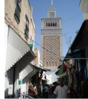
Mosque and market

Islam is a set of religious actions—beginning from one’s submission to Allah—that defines an entire way of life. 217 Many Tunisians consider it offensive to say that one does not believe in God; the observance of Islam—including prayer, fasting, dietary and dress codes, and numerous family and public rituals—permeates daily life. 218 However, since the introduction of secular practices during colonial times, urban Tunisians in particular have observed their Muslim traditions and gone about their work and business in the same rhythm as most European countries. Although Friday is a day-long holiday of prayers in most Arab nations, Tunisian Muslims return to complete their workday after attending congregational prayers during their lunch hour. 219 A 2012 opinion poll reported that 62.5% of Tunisians were practicing Muslims, but 40% of those prayed at home rather than at a mosque. 220