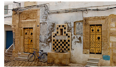
Sousse medina doorways

Sousse is situated in the Sahel coastal strip on the Gulf of Hammamet, 100 km (60 mi) south of Tunis. The original Phoenician settlement was Hannibal's base in the Second Punic War and later Pompey's headquarters in his battle against Julius Caesar. 46, 47 Third-century Christians left behind several kilometers of underground catacombs filled