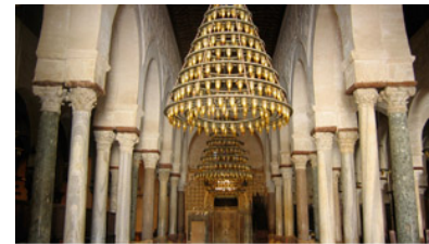
© Paul Livingstone Great Mosque prayer hall

Accordingly, conformity to social expectations is encouraged more than expressions of