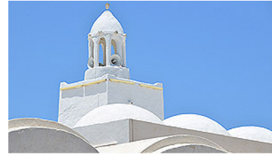
Mosque in Jerba

At the beginning of the 16th century, the Spanish were competing with the Turkish Ottoman Empire for control of the Mediterranean. The Barbary pirate Khair al-Din, or Barbarossa (“Red Beard”), operated from the Tunisian island of Jerba. He took Tunis for the Ottomans, defeating the Hafsids who had allied with Spain. 102 By 1587, Ottoman governates stretched across the Maghreb. Armies maintained order and collected taxes, while navies collected ransoms and slaves. Although trade eventually replaced piracy as Tunisia’s main source of revenue, the United States and European powers paid the bey (governor) of Tunis for immunity from piracy until the early 1800s. 103, 104