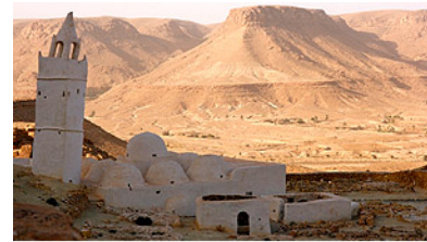
Old mosque in Chenini

The mosques of Tunisia are considered to be among the most beautiful in the Islamic world, and many are exemplars of classical Muslim art and architecture. They also are significant sites of Tunisian intellectual and political activity. The Zeitouna ("olive tree") Mosque of Tunis once housed the oldest university in the Arab Muslim world and was for centuries a major seat of Maghrebi Muslim learning. 241 Closed by the Bourguiba regime, the mosque will soon re-open as a private institution for Islamic studies. 242, 243 Kairouan's Grand Mosque of Uqba, the oldest in North Africa, has become a meeting place and media icon for the new Tunisian Islamist organization Ansar al-Sharia. 244, 245, 246