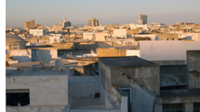
View of Tunisian rooftops

Since independence in 1956, Tunisia's urban population has more than doubled, as rural residents moved to cities in search of better jobs, homes, schools, and hospitals. The current annual urbanization rate of 1.54% is predicted to decline to 1.08% by 2030. 312 The government has tried to manage the urbanization process in several ways. Slums have been periodically razed and replaced by government-built and controlled "affordable housing." However, renting formal housing remains out of reach for lower-income residents, and controlling the unauthorized development of "informal settlements" continue to be a challenge. 313