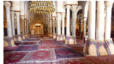
Mosque interior, Kairouan

The Arabic term islam means “to submit” or “to surrender.” Thus, a Muslim is one who submits to the will of Allah, the one true God, according to Islamic ideology. 185 Their holy book is the Quran, which followers believe was revealed to the last of the prophets, Muhammad, in the late seventh century C.E. Muslims also adhere to the sunna (teachings) and hadith (sayings) of Muhammad, who is held to be the last of the prophets to follow in the monotheistic tradition of Abraham (Ibrahim). Islam has five basic tenets or pillars: giving charity to the poor ( zakat ), praying five times a day ( salat ), fasting during the month of Ramadan ( sawm ), declaring one's faith in Allah ( shahada ), and embarking on a pilgrimage to Mecca if possible ( hajj ). 186 Mecca is the birthplace of the Prophet Muhammad and the location of the holiest of Islamic sites, the Kaaba.