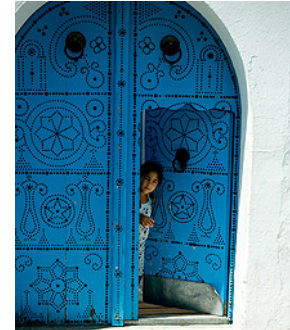
Girl greeting the door

When entering a room or making a social call where several men are gathered, it is customary to greet and shake hands with everyone, even if you have met them on a prior occasion. 269 The left hand should not be used in a handshake, nor in other social interaction, nor in eating, due to Muslim conventions of cleanliness. However, in Tunisia, this prohibition is sometimes unobserved, particularly in urban areas. 270