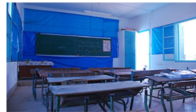
Inside a classroom

Despite its widespread availability, the quality of Tunisian education has been questioned in recent years. Observers have noted that graduates are not prepared for the few skilled positions available. A 2006 study found that Tunisian university students hoped for jobs with large, private enterprises upon graduation but expected to have to make their own jobs by starting their own businesses instead. The same study reported that Tunisian graduate students had much less professional experience, even in family business, than similar students from other countries. 346 One recent international analysis suggested that students might be kept in school “in order to avoid their being categorized as unemployed.” 347