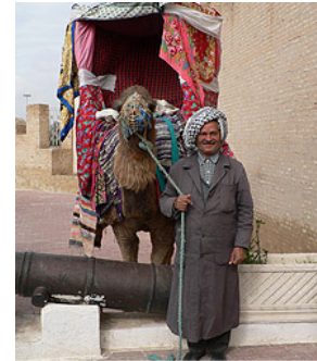
Man with camel

Walking is the most common means of rural transportation. 470 Donkeys pull carts and carry people in the north, and camels are still used in the south. However, because livestock share the right of way, the dangers of driving increase in rural areas, where roads also may be unpaved, night lighting is poor or nonexistent, and extreme wind and blowing sand can create hazards. 471 In addition, the lack of cell phone service and traffic police can make breakdowns and accidents more serious. Repair shops, which are located at gasoline stations, tend to be near towns.