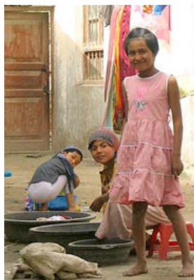
Courtyard of a Uighur house

In rural areas and old quarters of cities, Uighur families traditionally live in mud-brick, adobe-style homes. These homes typically have flat roofs and walled, gated courtyards where fruit trees, grape vines, and small gardens can grow. In the Yining (Ghulja) region, a two-room layout is standard. This includes an “all-purpose” room known as a dawan , which serves as a living and dining room, as well as a sleeping chamber. The other room, known as the saray , is used for hosting and entertaining guests. Typically, both rooms have a supa (also known as a kang ), which is an elevated area of the room where meals are served and family members sleep. The supa often houses a fireplace that heats the raised platform from below. It may also contain storage space beneath the platform, or it may consist of solid earth topped with brick flooring. 388 Multiple housing units inhabited by related families may open onto a single courtyard, which forms a family compound. Some traditional