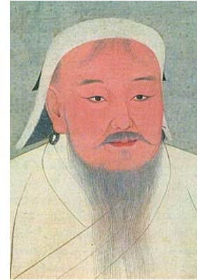
Genghis Khan

In 744, the Uighurs, a confederation of Turkic nomadic tribes, established an empire based in Mongolia. (Uighur is thought to mean “alliance” or “union.”) Their territory extended into northern Xinjiang following the decline of Tang power. After their empire was toppled by a Kyrgyz invasion in 840, the Uighurs moved southward. Most of them settled along the northern slope of the Tien Shan and in the Turpan Basin of Xinjiang. From a capital at Qocho (Gaochang) in the Turpan region, Uighur power extended over the Urumqi area, the Hami Basin, and the settlements of the northern Tarim Basin; this domain became known as Uighurstan. The Uighurs intermarried over the following centuries with the Indo-European and other Turkic peoples who inhabited or came to the region. Thus, while they are not the direct ancestors of the modern Uighurs, they are among their predecessors. (The modern Uighurs, whose culture is significantly different than that of the earlier group, were not known as Uighurs until the 20th century, when the term was broadly applied to the sedentary Turkic-speaking Muslims of Xinjiang’s oases.) 63, 64, 65