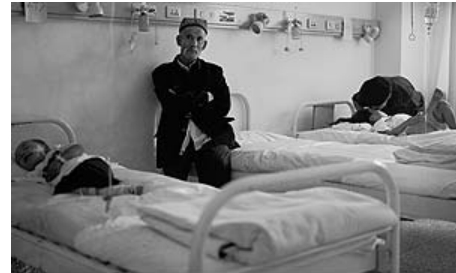
Hospital room in Urumqi

As in greater China, population growth and environmental pollution have greatly affected public health in Xinjiang. Xinjiang’s already limited health care services have been strained by its growing population, driven by the influx of Han. Moreover, the intensive industrialization of the region has led to increased air and water pollution, factors that contribute to higher mortality rates from respiratory and heart disease, as well as from cancer. Urumqi, in particular, has been cited as one of the most polluted cities in China. Its exceptionally high level of air pollution—as seen in its blackened skies—is a product of the city’s heavy consumption of coal, the most of any Chinese city. 295