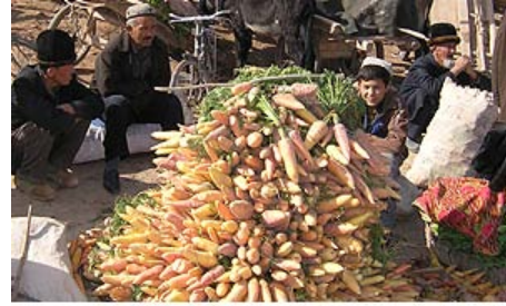
Kashgar carrot stall

In bazaars and at small-scale businesses, bargaining is the norm. Depending upon the item, the bargaining process may be lengthy and involved. A vendor's initial asking price will typically be high; customers should respond with counteroffers until a reasonable price can be reached.