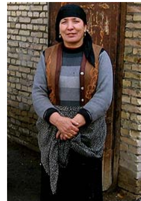
© Chris Erway Woman in Korla

As in the pre-collectivization era, rural Uighur men remain associated with physically intensive jobs, including agricultural work (plowing, harvesting, and irrigation) and construction. Business activities, including marketing, are also viewed as men’s work. Women’s duties primarily concern the maintenance of the household, including cooking, cleaning, child-rearing, and care-taking. Rural women are also tasked with basic animal husbandry duties, such as feeding and watering livestock. Uighur women traditionally produce certain handicrafts, such as the doppa , or traditional Uighur skullcap. While they assist men in producing other handicrafts, they often do not receive recognition, as most handicrafts are still seen as men’s domain. Uighur women, especially those in poorer families, may also assist in agricultural work, though they may not be acknowledged for this work. Traditional perceptions about the division of labor may therefore mask the actual duties of Uighur men and women. 214