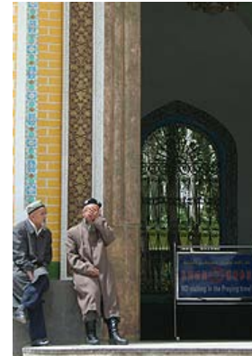
Kashgar mosque entrance

The term Id Kah may also apply to the major mosque of a given city or town. While generally not as large as holiday mosques, jami masjid , or Friday mosques, are local mosques where Muslims attend Friday communal prayers. These mosques are typically located in urban areas. 196 Smaller mosques are found throughout cities, towns, and rural regions. “Orphan” mosques, or yetim , may be found in remote, isolated areas; they historically provided a site of worship to travelers. Reflecting Sufi traditions, mazars , or shrines built around the tombs of revered holy men, are also found throughout Xinjiang. Festivals may occasionally be held at these sites, and some may have mosques attached to them. 197 Overall, according to the PRC government, there are 24,800 venues for religious activities, including mosques, in Xinjiang. 198 Following PRC guidelines, most are overseen by the government.