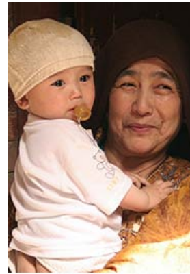
Grandmother in Kashgar

Uighur naming conventions vary from region to region according to family and local custom or influence. Historically, Uighurs did not widely use surnames, or family names, until the 1930s–1940s. Instead, they simply used a given name. Thereafter, Uighurs adopted different naming conventions according to regional cultural influences (e.g., Russian, Chinese, Persian, or Turkic). Today, Uighurs generally follow the practice of using a given name, listed first, and a surname, listed second. (This practice contrasts with that of the Han, who list their family name first.) Two names are required when precise identification is necessary, such as on an official passport. It is more common in everyday situations for Uighurs to be referred to by their given names. Uighur surnames are generally derived from the father’s given name, which becomes a family name. This naming convention has been described as an “unstable surname” form because it does not involve the passage of a single, established family name from generation to generation. “True” surnames are thus uncommon among Uighurs. 449