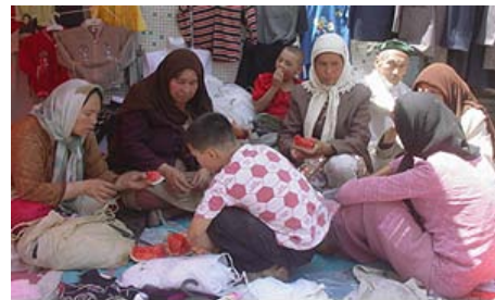
Uighur family having lunch

Nowruz is an ancient festival marking the coming of spring, or the beginning of a new year in the natural cycle. This pre-Islamic tradition came to Central Asia and Xinjiang from Persia (Iran), where it is celebrated as Persian New Year. The festival is typically held around 21 March, the vernal equinox.