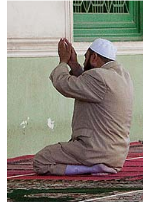
Man Praying in a Kashgar mosque

Traditionally, Uighurs are devout practitioners of a moderate form of Islam. The religion has played a major role in their social and political history, and most Uighurs continue to view it as an essential component of their culture and identity. 141 Indeed, the modern use of the term “Uighur” derives from a broad categorization of the “Turk[ic]-speaking Muslim oasis dwellers” of Xinjiang. 142 The Uighurs’ Muslim heritage reflects a long history of contact and exchange with Central Asia, from where the religion first spread into Xinjiang in the 10th century. The ancient Uighurs originally practiced shamanism, Manichaeism (a Gnostic religion), and, later, Buddhism. 143 By the 15th century, the majority of Uighurs and other Turkic-speaking peoples of central and southern Xinjiang had converted to Islam. 144 Today, their practice of Islam is one of several traits that tie the Uighurs more closely to the peoples of Central Asia than to mainstream Chinese culture.