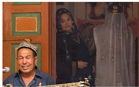
Wedding party in Kashgar

Uighur weddings are typically elaborate, joyous affairs that serve to display familial wealth and hospitality while securing social connections. The actual wedding ceremony may follow many previous meetings between the involved families concerning the negotiation and approval of the marriage. These traditionally include a tea ceremony in which the groom's family offers gifts to the bride's family as part of the marriage pact, 432 as well as a lively engagement party at which the parents of the bride may offer betrothal gifts in return. 433 The wedding itself is typically a large, communal event that involves several stages and may continue over multiple days. A special meal for the elderly may be held before the wedding; separate, gender-specific parties for the bride and groom (similar to bachelor and bachelorette parties) may also be held. 434