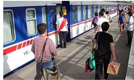
Urumqi train station

The major railway in Xinjiang is known as the Lanzhou-Xinjiang, or Lanxin, Railway. Its main line runs generally east–west through north-central Xinjiang, connecting the region with greater China to the east and Kazakhstan to the west. Entering Xinjiang from the east, this line runs south of Hami, north of Turpan, through Urumqi, and westward across the southern Junggar Basin into Kazakhstan via the Dzungarian Gate, or Alatau Pass. From a hub at Daheyan (north of Turpan), a newer branch of the line runs southwestward across the northern Tarim Basin to Kashgar.