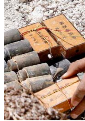
Unexploded landmines

The People’s Republic of China is not a signatory to the Mine Ban Treaty, also known as the Ottawa Treaty. The U.S. is also not a signatory to this agreement. Negotiated in 1997, this pact requires all signatories to cease the “use, stockpiling, production, and transfer of anti-personnel mines.” Signatories are also required to clear all mines from their territory within 10 years of signing the agreement. The PRC is thought to have the largest supply of anti-personnel mines in the world; its stockpile is estimated at 110 million. It is known to have mined areas along its borders with Russia, India, and Vietnam. 384 Within Xinjiang, the area most likely to be affected by mines is the southwestern frontier of the disputed Aksai Chin region.