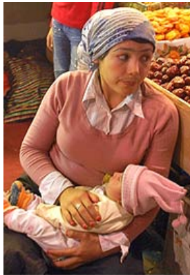
© Tian Yake Mother and child

Childbirth can be controversial in China, where family planning policies are enforced by the government. The PRC government generally limits couples from having more than one child. This policy primarily applies to Han who live in urban areas. Exceptions are made for the nation’s ethnic minorities, certain rural residents, and couples in which both partners are an only child. 407 The policy was implemented in 1979 to limit the country’s explosive population growth; PRC officials claim it prevented 250 million births within the first two decades of its implementation. 408 The policy is enforced through the imposition of steep fines against couples who have a second child without government permission. Forced abortions and sterilization have been widely reported. Job loss, demotion, and other administrative punishments may also result from non-compliance. 409 While the policy has slowed population growth, analysts claim it has contributed to social problems such as a