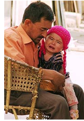
Father and child

Uighurs have described the one-child policy as “unfair and anti-Islamic.” (Many Han also oppose the policy.) 412 As an ethnic minority, Uighurs are exempt from the one-child limit but remain restricted to having two or three children depending upon whether they live in urban or rural areas. This is a small number for rural Uighur couples, who would traditionally have twice as many children or more. 413 As part of the government’s implementation of the policy, Uighur women may be subjected to regular exams at family planning bureaus. These may include inspections of implanted birth control devices (intra-uterine devices or IUDs) and pregnancy tests. 414 Women found to be pregnant without proper approval may face forced abortion and/or sterilization. This may also apply to women who do not allow the requisite four year intervals between children. In Xinjiang in 2008, local officials attempted to perform a forced abortion on a Uighur woman who was more than six-months pregnant with her third child. 415 PRC authorities allowed the woman to have the child after her case drew international attention. 416