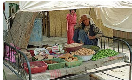
Vendor in Xinjiang

In general, small-scale agriculture is a low-paying, seasonal profession in which labor is concentrated during the growing season and minimal profits come when the crop is harvested. These factors greatly contribute to high rates of poverty and unemployment among Uighurs. In 2008, the average income for farmers in Xinjiang was 3,503 yuan , or about USD 513, well below the national average of 4,761 yuan , or USD 697. 341 The average income in rural southern Xinjiang, however, is said to be “much lower.” In the rural outskirts around the city of Hotan (Khotan), for example, the average income is 2,226 yuan , or USD 326. 342 Because of the low average income provided by seasonal agriculture, Uighur men migrate to regional cities in search of employment during the off-season. 343 Yet, off-farm employment opportunities are limited. This is especially the case for Uighurs, who have difficulty competing against Han for jobs, due in part to discriminatory hiring practices. One Uighur scholar estimated that, in contrast to official figures, up to 1.5 million capable Uighur workers were unemployed. 344