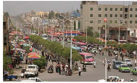
Kashgar street

Situated in the far-western reaches of the Tarim Basin, this remote oasis city retains a strong Uighur majority within an otherwise diverse population that includes Tajiks, Kyrgyz, and Uzbeks. The greater region—the western part of the basin—has been known as Kashgaria. The city itself lies between the Taklamakan Desert and the foothills of the Tien Shan (to the north) and Pamirs (to the west). This location, at the convergence of historic Silk Road routes, has long made Kashgar a major trading hub. Today, such activity occurs throughout the city’s bustling bazaars and markets. Fed by wells and the Kashgar River, the surrounding oasis produces cotton and a variety of fruits and grains. The city is also known as a center for handicrafts, including textiles, leather goods, and pottery. In recent years, improvements in regional transportation—air, train, and highway—have reduced the city’s remoteness. 50 An extensive, ongoing modernization of the historic quarter of the city—supposedly to eliminate earthquake risks—has also affected its historic character. 51 It has a population of approximately 229,500 (2002 estimate). 52