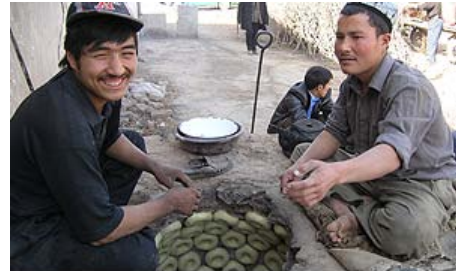
Men baking nan in Kashgar

Laghman , known in Mandarin as lamian , is another popular dish. It consists of homemade noodles covered in one of various meat sauces—usually mutton, tomatoes, peppers, and garlic. Kebabs ( kawab )—meat chunks grilled on a skewer—are also common. Chuchura is a meat-dumpling soup. Manta , also known as mantı , are meat dumplings are specially prepared by steaming. 239 Roasted whole lamb may be served at large social events. Other dishes include qordaq , a vegetable and meat stew, samsa , baked buns stuffed with mutton and onion, and souman , fried noodles served with meat and vegetables. 240 Various raw and fried vegetables are used to make cold and hot salads. Breads include nan , a common flat bread, girde nan , a bagel-like bread, and sanzi ( sangza ), fried pastries that are typically eaten as snacks during holidays.