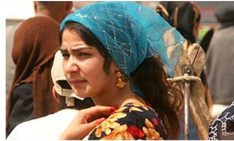
Uighur woman in Kashgar

In some Uighur communities, especially in rural areas, tradition requires Uighurs to marry within their cultural sphere. 403 This practice serves to cement communal bonds and contributes to the maintenance of strong local identities. 404