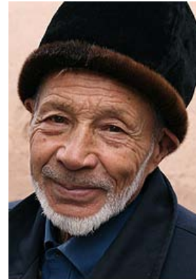
Elderly Uighur man

Generous hospitality is a cultural tradition and a matter of great pride for Uighurs. 223 The PRC government’s security policies have reportedly made Uighurs leery about hosting foreigners, whose presence may raise suspicion with authorities. 224 The most common form of hospitality is an invitation for tea or a meal at a person’s home. In such cases, the guest will likely receive the best the host has to offer. As a sign of respect, guests should wear, conservative clothing to a host’s home. Guests should remove their shoes upon entering the household. Guests are generally not expected to bring a gift; it is the host’s honor to provide for the guest, rather than vice versa. It is, however, an acceptable gesture for guests to bring small presents for the children of the household. Traditionally, Uighurs will refuse to accept a gift several times before ultimately accepting it with gratitude. 225