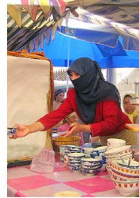
Street vendor in Khotan

Manners of dress vary among Uighurs depending upon their location, job, age, and means. Modern, western-style clothing is widely worn, especially in urban areas, among younger generations and those who work in the civil sector. Civil sector employees, such as teachers and government officials, may be prohibited from wearing items of traditional Uighur dress, especially those with religious connotations. 243 Traditional dress is more common in rural areas and among older generations and conservative Muslim families. It is widely worn on special occasions. Whether they dress in modern or traditional fashion, Uighurs are known to place great value on clothing and personal appearance. 244