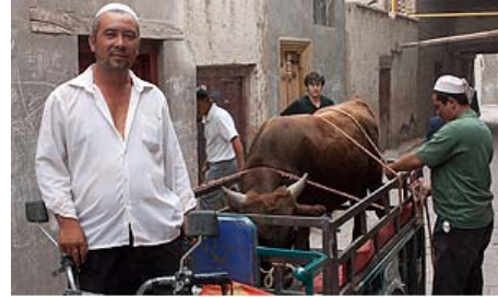
Men in Kashgar

According to Islamic custom, Uighurs traditionally do not touch unknown or unrelated persons of the opposite sex. In traditional, rural areas even well-acquainted persons of the opposite sex do not make physical contact in public. Male visitors should not try to shake hands with Uighur women, and female visitors should not take offense if Uighur men do not shake their hand. Instead, Uighur women commonly greet both men and women with a slight bow. 218 Young Uighur women and girls may greet each other with a hug in which they touch their faces (right cheek) together. 219