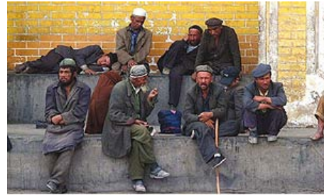
Uighur men outside a Kashgar mosque

The Chinese Communist Party (CCP), the sole administrative party of the PRC, is officially atheist. “Freedom of religious belief” is provided by the country’s constitution, but the government regulates and, in many cases, restricts religious practice. Broadly, the PRC government formally recognizes only five religions according to its purview of “normal” religious activity: Buddhism, Taoism, Islam, Catholicism, and Protestantism. The activity of each of these religions is overseen by their respective “patriotic religious associations” (PRAs), which are under the domain of the State Administration for Religious Affairs (SARA). By law, all religious groups and sites of worship must be registered with the state. It is illegal to proselytize (attempt to convert others) in public and in unregistered religious venues; it is illegal for foreigners to proselytize in any setting. 160