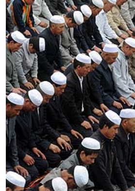
Group prayer at a mosque

Additional Islamic or Sufi traditions are restricted or banned outright. For example, Muslims in China can only participate in the hajj , the annual pilgrimage to Mecca (one of the five pillars), through government-sanctioned tours operated by the IAC. Uighurs are subject to especially tight travel restrictions—including the seizure of their passports—to prevent their movement into adjoining Muslim countries in Central and South Asia. 177 Sufism, in particular, is viewed by Chinese officials as a corrupt form of Islam, and its texts and traditional practice of zikr , or ritual prayer meetings, have been banned. This policy contrasts with that of Central Asian countries, where Sufism is encouraged as an alternative to Islamic fundamentalism. 178