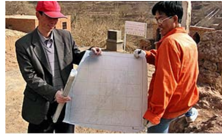
Planning a new road near Turpan

Xinjiang is subdivided into a complex hierarchy of administrative units, which include (in descending order) prefectures, counties, townships, and villages. 363 In general, each of these units is headed by a government leader and a corresponding Chinese Communist Party (CCP) official(s), as well as an administrative committee known as a “people’s congress.” The people’s congress for each layer of government elects its respective government heads.