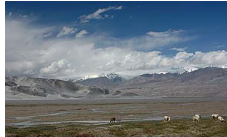
Xinjiang Uighur Autonomous Region

The Xinjiang Uighur Autonomous Region is located in far northwestern China. Within China, it borders the provinces of Gansu and Qinghai to the east, and Tibet (or the Xizang Autonomous Region) to the south. Xinjiang's international borders make it strategically important to China. In the southwest, it borders the disputed area of Jammu and Kashmir, where India, Pakistan, and China have conflicting territorial claims. Here, the disputed territory of Aksai Chin, which India also claims, is occupied and administered by China as part of Xinjiang. 7 To the west, Xinjiang borders Afghanistan, Tajikistan, and Kyrgyzstan. To the northwest, it shares an extensive border with Kazakhstan, the home of the largest Uighur population outside of China. 8 In the north and northeast, Xinjiang shares borders with Russia and Mongolia. Overall, the region measures 1,664,900 sq km (642,821 sq mi), accounting for approximately one sixth of China's total land area. It is the country's largest administrative region. By comparison, it is larger than the combined area of Texas, California, and Montana. 9