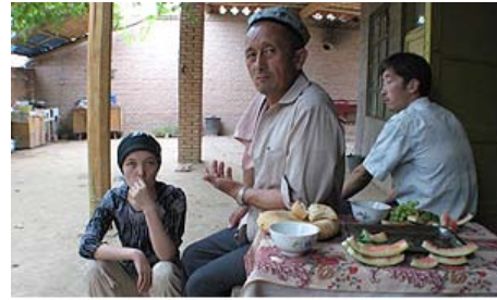
Uighur family having lunch

Meals are traditionally served on a large cloth on the floor—known in Central Asia as a dastarkhan , or at a low table. 226 Traditional Uighur homes have a raised area, known as a supa or kang , where meals are typically eaten, guests are entertained, and people sleep. This area will be covered with carpets and may be heated from below by a fireplace. 227 Guests should wait to be seated by the host in a particular place. They should not step on the dining cloth or in front of anyone who is already seated. They should avoid pointing the soles of their feet at others while sitting down, and they should not stretch their legs out. Sitting is typically done in a crossed-legged, sometimes atop pillows. Prior to eating, guests will be provided the opportunity to wash their hands. Washing may be done by passing around a pitcher of water and a bowl. Guests should not splash the water or shake their hands dry, but rather use the provided cloth. Uighurs believe that shaking water from the hands is impolite and unlucky. 228