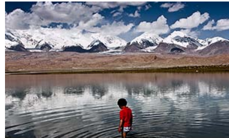
Pamir Mountains

The Tarim Basin comprises most of southern Xinjiang. Like the Junggar Basin to the north, it is a desert plain encircled by steppe lands and high-elevation mountain ranges; it generally slopes southwest to northeast. Because the Tien Shan and other ranges prevent the Tarim Basin from receiving moist air currents from the west, it is extremely dry—more so than the Junggar Basin. The region is dominated by the Taklamakan Desert, which covers some 327,000 sq km (126,255 sq mi). Encompassing huge shifting sand dunes, this largely barren and inhospitable desert is subject to seasonal sandstorms known as qara buran , or “black winds.” 20