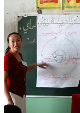
Teacher training in Shanshan

Another challenge encountered by rural Uighurs is the dilemma posed by disparities in the language of instruction at educational facilities. Uighurs have historically had the option of attending “minority-language schools,” which primarily use Uighur, or “Chinese-language schools,” where Mandarin is used almost exclusively. The government now requires all institutions to use Mandarin as the language of instruction beginning in the third grade, with minority languages taught as a secondary subject. 357 However, due to the slow and incomplete implementation of this policy, some schools reportedly continue to use Uighur as the primary language of instruction. This is due, in part, to a lack of Uighur teachers who are fluent in Mandarin, although efforts have been made to train them or replace them with Mandarin-speaking teachers. While many Uighurs desire the opportunity to study their native language and culture, those who do not attend Chinese-language schools may fail to develop the Mandarin language skills required to pursue an advanced education or a career in the civil sector. 358 Rural students, in particular, are less likely to develop such skills, as many of them come from regions where Uighur is still the most widely spoken language. 359