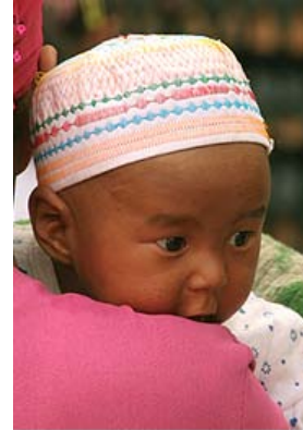
Infant in Kashgar

Birthing conditions vary widely according to a mother's means, location, and access to health care. Especially in remote villages, female relatives and/or a midwife gather to assist in the process. By custom, Uighur women are allowed to return to their parents' home to give birth to their first and/or second child. (This contrasts with Han custom.) 420 Even Uighur women who give birth in a hospital may go directly to their parents' house in accordance with this custom. Such practice was traditionally associated with rites celebrating the women's entrance into motherhood such as a hair-braiding ceremony during which the new mother's hair was styled into two braids, a sign of her enhanced status. 421 This hairstyle remains a sign of marriage and motherhood among Uighurs.