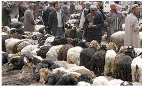
Livestock market in Kashgar