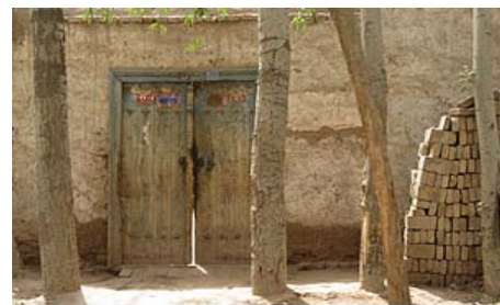
Front door of a Uighur house

The majority of Uighurs continue to earn their living through traditional, small-scale oasis agriculture and animal husbandry. (As of 2006, an estimated 82% of Uighur households engaged in farming. 336 ) Others may work in craft production, commerce, or in various trades. Many Uighurs grow cotton, a water-intensive cash-crop that is among the more profitable crops grown in Xinjiang. Various food crops—primarily grains and fruits—are grown throughout the region, with each oasis producing local specialties. The Turpan region, for example, is known for its grapes and the Hami for its melons. 337 Uighur farms are typically small, averaging 0.7 hectares (1.7 acres). 338 This contrasts greatly with the large-scale commercial farms, especially in northern Xinjiang, that have been developed by the PRC government and related organizations. One such organization is the Xinjiang Production and Construction Corps, known locally as bingtuan . This organization, which is predominantly composed of Han, is responsible for 40% of the region’s cotton production. 339 Disparities between the amount of resources needed to run large-scale versus small-scale farms (e.g., water), as well as their respective profits, have contributed to perceptions that Uighurs have benefited less than Han from PRC-directed agricultural development in Xinjiang. 340