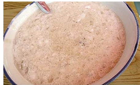
Dogh, an Uighur dessert dish

A dessert known as dogh , or durap , which consists of shaved ice, yogurt, and syrup, should be avoided because it may be prepared under unsanitary conditions and cause illness. 308 For similar reasons, it is recommended that one choose bottled water over tap water. Ice should also be avoided.