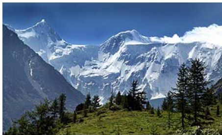
© Vít Hněvkovský Altai mountain range

Xinjiang essentially comprises two massive basins surrounded and divided by formidable mountain ranges. The terrain varies widely from snowy, high-altitude peaks to desert lowlands and depression; both earth's second-highest and third-lowest points are located in Xinjiang. The majority of the population lives in transitional areas between mountains and desert. Extreme climate conditions make large portions of the region inhospitable. 10