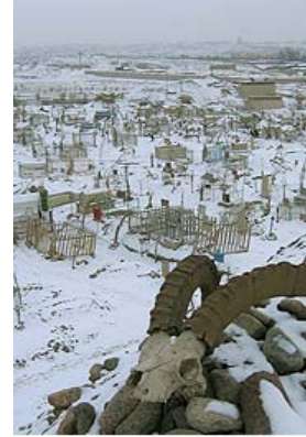
Cemetery in Korla

The burial is generally held within one to three days of the death. 442 The body may be stored at the local mosque until the funeral. On the day of the funeral, men carry the body on a covered stretcher to the burial grounds. Following Islamic tradition, women may be restricted from attending the burial ceremony, especially in rural areas where custom remains strong. 443 When women do attend, their graveside prayer services may be segregated from those of the male attendees. The men are led in prayer by a Muslim cleric. They may also say funerary prayers at the local mosque. 444 Because Muslims are traditionally buried facing Mecca, Uighurs in Xinjiang are buried facing west. 445 Uighurs of high social status or wealth may be buried in large tombs or mausoleums. 446