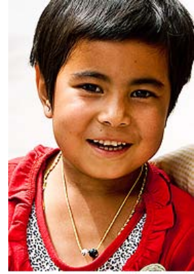
Girl wearing amulets and beads

In Xinjiang, as throughout Central Asia, Islam and Sufism are often infused with or practiced alongside folk traditions and beliefs, especially in rural areas. A primary example is the belief in jinn , or evil spirits, which are thought to cause sickness or misfortune. Uighurs employ several traditional methods to repel such spirits. Often hung from trees in rural villages, the qonchaq is a pouch wrapped in colored cloth that is thought to ward off jinn . Fire may also be used to repel these spirits, particularly during traditional ceremonies. Uighur women and children may also wear amulets to protect them from the “evil eye.” These include tomar , leather pouches stuffed with notes carrying Islamic prayers, and koz monchaq , black plastic balls marked with white dots. Uighurs may also rely on religious healing methods that derive from the ancient practice of shamanism. 158 Orthodox Muslims and religious leaders typically do not approve of these folk practices as they do not relate to traditional Islamic belief. Such notions may be perceived by educated Uighurs as superstitious. 159