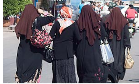
Women in traditional dress

Traditionally, Islamic societies do not differentiate between secular and religious life. When the PRC was established in 1949, Kashgar was home to a thriving Muslim establishment that wielded political power, operated judicial systems, and collected taxes on extensive land holdings. 183 Today, the government's regulations and restrictions on Islamic practice have eliminated the reach and autonomy of Muslim institutions. Moreover, the PRC has, in effect, pressured Uighurs to choose between observing the guidelines of their religion and those of the state.