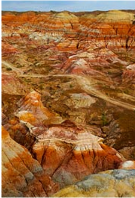
Gurbantunggut Desert

From the snowy peaks and dense forests of its upper and middle elevations, the Altai descend into mountain steppe, or grasslands, before blending into the northern reaches of the Junggar Basin. Notably, the southwestern slopes of the Altai—those in Xinjiang—are rolling and relatively gentle compared to the more rugged terrain found on the opposite slope. 12 This region is dominated by ethnic Kazakhs, who traditionally practice nomadic pastoralism in the highland pastures.