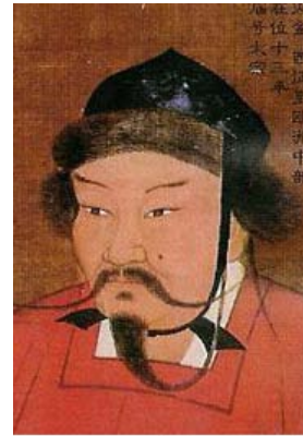
Ogedei Khan

The Mongol armies of Genghis Khan swept through Xinjiang between 1216 and 1218. The Uighurs, who had already submitted to Mongol rule, supplied troops to the Mongol army and adopted administrative roles in the growing empire. 68 Upon the death of Genghis Khan in 1227, the Mongol Empire was divided among his male heirs. At that time, the empire stretched from the Caspian Sea to the east coast of China. Xinjiang and much of Central Asia were left to Chagatai, Genghis' second son, whose territory became known as the Chagatai Khanate. 69 After further expansion, the great Mongol khanate to the east became known as the Yuan Dynasty (1279–1368) under Genghis' grandson, Kublai Khan. Dissention within and between the various divisions of the Mongol Empire led to its collapse in the 14th century.