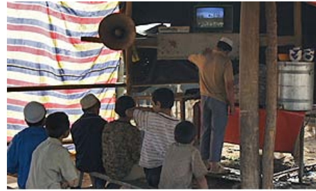
Boys in Kashgar watching TV

China's electronic and print media are managed and monitored by various state organizations, including the State Administration of Radio, Film, and Television; the General Administration of Press and Publication; the Ministry of Information Industry; and the CCP Central Propaganda Department. These government offices establish and enforce regulations for print and broadcast material. Major newspapers and television and radio stations are state-owned and operated. Access to the internet is also regulated, and additional government agencies track, monitor, and restrict its use. 124 In recent years, expanded privatization of commercial and media interests has provided for greater variety of coverage, but controls remain tight. 125