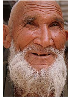
Elderly Uighur man

As a Central Asian crossroads, Xinjiang has historically been home to diverse peoples. According to the PRC, it is today home to representatives of 55 ethnic groups, or “nationalities,” the three largest of which are Uighurs, Han, and Kazakhs. While they are widely distributed throughout the region, Uighurs are concentrated in the oases of the southern basin. Despite the influx of Han, Uighurs retain a slight majority in terms of population, accounting for 9.65 million, or roughly 46% of the populace, as of 2007. Han, who are by far the predominant ethnic group in China, number approximately 8.24 million, or roughly 40% of the population. They are concentrated in the urban centers of northern and eastern Xinjiang, although their presence has also grown in the south. Kazakhs, with a population of 1.48 million, comprise roughly 7% of the Xinjiang populace. Of Muslim heritage, they are concentrated in the grasslands of the northern highlands and the Ili River valley, where they traditionally practice animal husbandry. 132