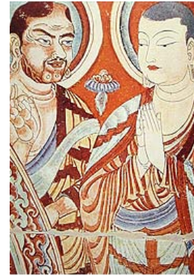
Buddhist fresco in the Tarim Basin, 9th century

The territory comprising modern Xinjiang historically served as a crossroads for diverse Eurasian peoples. Archeological evidence of permanent human settlement in the region dates back to the Neolithic Era (8000–2000 B.C.E). At that time, small-scale agriculture supplemented hunting and gathering as the means of subsistence. By the early 2nd millennium B.C.E. (during the Bronze Age), regional peoples had increasingly adopted animal husbandry. The Iron Age, which began in Xinjiang about 1200 B.C.E., was marked by the spread of nomadic pastoralism. One early nomadic group in the region was the Saka (Saks), also known as the Sai or, more broadly, as the Scythians. Regarded as skillful horsemen and warriors, these Indo-European nomads established themselves throughout Central Eurasia, including parts of Xinjiang, during the first millennium B.C.E. Other early inhabitants of the Xinjiang region included the Yuezhi (Yueh-chih), Wusun (Usun), and the Xiongnu (Hsiung-nu). 56