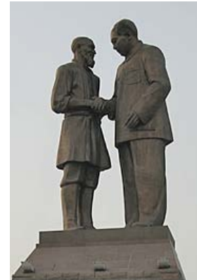
Statue of Mao in Hotan

The People's Republic of China (PRC) is a communist state administered by the Chinese Communist Party (CCP). Formally established on 1 October 1955, Xinjiang is one of China's 5 autonomous regions, or zizhiqu ; the country also has 22 provinces, 4 municipalities, and 2 special administrative regions (SAR). The region is headed by a CCP regional secretary, who is the de facto leader, and a chairman of the regional government; both of these figures are appointed by the central government. 119 The regional government also comprises various levels of people's congresses, or legislative bodies, headed by the Xinjiang Regional People's Congress.