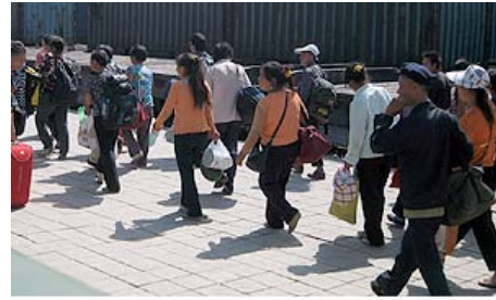
Han migrants arriving in Kashgar

A major factor in the growth of Xinjiang's urban areas—and one that has been extremely controversial among Uighurs—has been the large-scale in-migration of Han. Han, the predominant ethnic group in China, have long had a presence in Xinjiang, but their numbers have grown considerably over the last several decades. In 1949, when the PRC was established, Han comprised 6% of the regional population. Today, they comprise roughly 40%. 259 The PRC government has historically enabled this process through official resettlement programs or, more recently, through economic development campaigns. 260 Many Uighurs claim the government has encouraged Han in-migration to change the ethnic composition of the region. PRC officials have described the process as a necessary factor for economic development. 261 The majority of Han migrants have been poor peasants from the east who came to Xinjiang in pursuit of economic opportunity. 262 Most of them have settled in urban areas. As a result, aside from Uighur-dominated cities such as Kashgar and Hotan (Khotan), most of Xinjiang's cities have Han majorities. 263