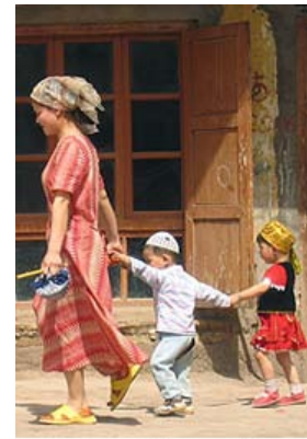
Woman and children in Kashgar

The respective roles of Uighur men and women vary according to family, location, and socio-economic background. For example, the daily life and duties of a Uighur woman from a forward-thinking family in Urumqi would likely be drastically different from those of a woman belonging to an ultra-conservative family in Kashgar. The former might be a well-educated, career-minded individual whose job in the civil sector would require her to limit her religious observance, at least in public. The latter would likely be a devout practitioner of Islam whose religious and familial obligations might require her to wear a veil in public and limit the majority of her work activity to the home.