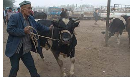
Kashgar Sunday market

The association of men with the public sphere and women with the domestic sphere contributes to the perception of men as the primary breadwinners. However, many Uighur women, especially those from poorer families, contribute greatly to the family's economic activity.