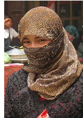
Veiled woman in Hotan

Marriage is an essential rite of passage for Uighurs. It would be considered a serious and potentially shameful inadequacy for a Uighur not to marry in his or her lifetime. 397 For Uighurs, the selection of marriage partners remains heavily influenced by customary views and practices. Traditionally, Uighur marriages were social contracts between two families rather than romantic unions between two individuals. Marriages were typically arranged by the families, often when the bride and groom were very young. 398 Today, arranged marriages are still common in rural areas, although the match may require the consent of the potential bride and groom. In these cases, the families of prospective marriage partners will meet before introducing their offspring to each other. If both the young couple and their families approve the match, the marriage may proceed, although typically only after protracted negotiations over dowry. It is increasingly common for Uighurs, especially those living in urban areas, to individually meet and choose their marriage partners. However, even in such cases custom dictates that a couple receives parental permission before the marriage occurs. 399