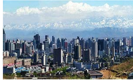
Urumqi skyline

While Uighurs are found throughout Xinjiang's urban areas, many of the region's major cities, especially those in the north, have strong Han majorities. 39 The following cities are those with significant Uighur populations.