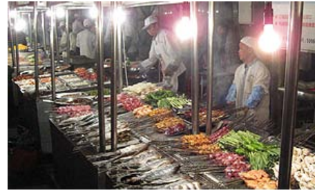
Meat vendors in Xinjiang

Xinjiang's urban centers host a wide range of shopping venues. Modern commercial districts are home to multinational chain and department stores with upscale merchandise. The traditional marketplace, especially for Uighurs, is the bazaar. Bazaars may range from rustic alleyways in old city districts to modern complexes combining small-scale businesses with corporate chain stores. In Urumqi, the modern bazaar complex is located just across from the remnants of the traditional bazaar that it replaced. The former is dominated by Han merchants, while Uighurs frequent the latter. 310