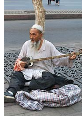
An elderly Uighur Muslim

Shoppers should carry small bills for use in bazaars and other small-business venues, where vendors may not have change.