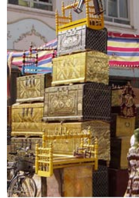
Dowry chests for sale in Kashgar

Divorce and remarriage are relatively common. Uighurs have higher divorce rates than other groups in Xinjiang, 425 and the region has had the highest rates of divorce in China in recent years. 426 There is reportedly no social stigma attached to divorce and remarriage within the Uighur community. Under PRC law, both men and women have the right to initiate the separation. Notably, Uighur women have enjoyed this right for centuries. 427 Divorce has commonly arisen from arranged marriages in which the bride and/or groom were joined at a young age and later found to be incompatible. Freedom in partner selection is reportedly much greater for second marriages. 428 Remarriage is expected, even for the elderly and especially for men. 429