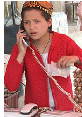
Market stall with telephones, Kashgar

The development of Xinjiang has involved a vast expansion of its telecommunication capabilities. This includes landlines, cell phones, and internet access. 283