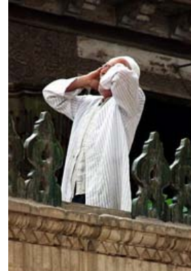
Call to prayer in Kashgar

Islam is a monotheistic religion, meaning that its followers profess faith in a single God. In the Muslim community, or ummah , God is known as Allah. The Arabic term islam means to “to submit” or “to surrender.” A Muslim, therefore, is one who submits to the will of Allah. Muslims believe that Allah revealed his message to the Prophet Muhammad, a merchant who lived in Arabia from 570 to 632 C.E. They consider Muhammad the last of a long line of prophets that included Abraham (Ibrahim), Moses (Musa), and Jesus (Esa). Allah’s message, as relayed by Muhammad, is recited in the Quran, the sacred scriptures of Islam. Additional sacred texts include the Hadith , a collection of the sayings of Muhammad, and the Sunnah , which describes the practices of Islam by way of Muhammad’s example. 148