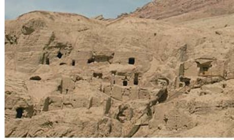
Mazars in Xinjiang

Sufism, known in the Muslim world as tasawwuf , is a mystical form of Islam. Its basic objective is to obtain a direct, personal connection with Allah. Followers seek to achieve this by adhering to the Sufi path, or tariqah , a long-term course of practice that involves intensive devotion and study. Sufi practices include ritual prayer ( dhikr or zikr ), meditation, and various ascetic or ecstatic activities. Sufi spiritual leaders ( shaykh ) are known in Xinjiang as ishan . Traditionally viewed as “living saints,” these holy men are believed to possess special spiritual power known as baraka . Ishan act as mentors and spiritual guides to students who form brotherhoods—also known as ishan —around their teachings. 153