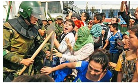
Uighur riots

In the 1990s, ethnic tensions, independence campaigns, and long-running grievances against the government manifested themselves in additional public protests and concerted acts of violence. In January 1990, a student demonstration was held in the city of Yarkant (Yarkand) after PRC authorities shut down a privately run Islamic school. 89 Later that year, an Islam-inspired riot in protest of various PRC policies erupted at Baren in southern Xinjiang, resulting in attacks on local security forces and government infrastructure. Chinese officials claimed the incident occurred as part of an Islamic extremist separatist movement. 90 (This event is often described as the “turning point” in PRC policy toward the region.) The PRC feared further instability and responded by enhancing its restrictions on the practice of Islam; this resulted in the closure of many mosques and Quranic schools. 91