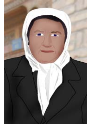
Uighur in mourning

Uighur burial rites are shaped by both Islamic custom and traditional folk practices. Specific rites may vary from community to community (i.e., oasis to oasis) and according to a family’s background. Broadly, for Uighurs, funeral rites serve the dual purpose of comforting the living while facilitating the transition of the deceased into the afterlife. 440 The death of a family member draws relatives, friends, and community members to the household of the deceased. The active participation of extended kin and community members in the process allows the immediate family members of the deceased to focus on mourning rather than the organization of the funeral. 441