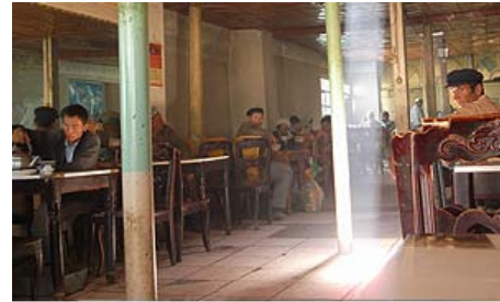
Uighur restaurant in Urumqi, Xinjiang

In Xinjiang, restaurants and other food vendors often cater to specific ethnicities, namely Uighurs, Han, Hui (Dungans), or Kazakhs. Most Uighurs will not eat at non-Uighur restaurants due, in large part, to their Islamic beliefs concerning haram (taboo) and halal (acceptable) foods. Uighurs especially avoid Han restaurants due to their heavy use of pork, a haram food that is strictly avoided by Muslims. For related reasons, some Uighurs may refuse to eat any food that is not prepared by a fellow Uighur or, at least, a fellow Muslim. 304 Uighurs sometimes eat at Hui restaurants, but they typically do not buy meat from Hui butchers. 305, 306 Uighur cuisine, however is said to be enjoyed by Han.