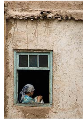
Woman in Kashgar

Traditional Uighur homes and compounds allow extended families to live in close proximity. In rural areas where tradition remains strong, custom may require newlywed couples to move in with the groom’s family, even when it is not a financial necessity. In this situation, members of four generations may live under the same roof. After an agreed-upon amount of time, the couple may move into their own home. 390 Relatives who do not live in the same compound often live in the same neighborhood. In Yining, Uighur residential neighborhoods are known as mehelle , each of which may carry an unofficial name used by its residents. 391