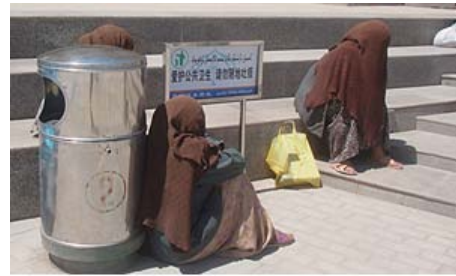
Veiled women in front of a mosque

Today, Xinjiang remains subject to the strictest controls on Islamic practice in China. 170 Following national guidelines, all Muslim groups and venues must register with the state. The government supervises the operation of most mosques, the traditional sites of Muslim worship. The majority of imams , or Muslim prayer leaders who give sermons at mosques, are employed by the state. They are required to train at the Institute for the Study of Islamic Texts, Xinjiang's only government-sanctioned madrassah , or school for Islamic clerics. The coursework at the institute is determined by the Islamic Association of China (IAC), which prescribes what it deems as "acceptable" Islamic teachings. The dissemination or use of religious texts that the IAC deems inappropriate is illegal. Imams are subject to surveillance to ensure their conformity with state policy. 171 They are also required to attend "reeducation" sessions to ensure "patriotism" and compliance. 172