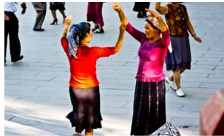
Uighurs dancing in Urumqi

As throughout the greater Muslim world, the notions of honor ( namus ) and shame ( ayip ) play a role in Uighur society. 205 These concepts are tied to the Uighurs’ traditional cultural norms, which are strongly rooted in Islam. Adherence to religious and social customs, such as proper hospitality etiquette or the proper interaction with members of the opposite sex, is a means of maintaining honor. Likewise, a breach of social norms can cause dishonor and shame, especially in conservative communities. Traditional values and practices have often conflicted with those promoted by the PRC government and its sole administrative party, the atheist Chinese Communist Party (CCP). Various PRC government policies, such as collectivization (under Mao) and restrictions on religious practice, have undermined Uighur traditions, which are often seen by Han as “backward” and “outdated.” 206, 207