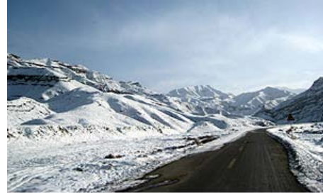
Road in the Tien Shan Mountains

Xinjiang's continental climate is determined by the surrounding mountains rather than by ocean air currents, which are too far away to be influential. Because the mountains impede the flow of moist air into the basins, the region is generally dry, sunny, and prone to temperature extremes—both seasonally and throughout the course of the day. The average annual rainfall for Xinjiang is approximately 165 mm (6.5 inches), although precipitation levels vary from the north to the south. 27 In the northwest, openings amid the regional mountain ranges allow Siberian air currents to enter the Junggar Basin (as well as the Ili River Valley). As a result, the north is wetter and colder than the Tarim Basin of the south, which is more thoroughly enclosed. While the north may receive between 150–500 mm (6–20 in) of annual precipitation, only 20–150 mm (0.8–6 in) may fall each year in the south. 28