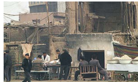
Kashgar's Old City

Urban modernization programs have been a significant component of the PRC’s development campaigns in Xinjiang. While they have contributed to a higher standard of living in urban areas, they have also been a point of contention between the Han-dominated PRC government and the Uighur community. According to observers, such development projects have often been carried out by the PRC government with little consideration or understanding of Uighur culture. For example, in Urumqi, the government constructed a modern five-story market complex as part of its “Xinjiang Minority Street” project. Yet the “exotic-looking” complex did not reflect Uighur needs or traditions and is said to remain largely unused by Uighurs. The government has also appropriated historic venues, including religious sites, for commercial purposes. In doing so, it has recast them with a cultural and historical significance that accords with PRC policy, rather than with local tradition. 277,278 In Kashgar, Han-