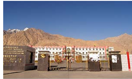
China-Pakistan border security

Despite intensive security efforts, Xinjiang’s international borders—especially with Central Asia—remain porous. 378 This is due to their sheer length and rugged terrain. Uighurs may receive special attention at checkpoints as they are subject to travel restrictions imposed by the PRC government. 379