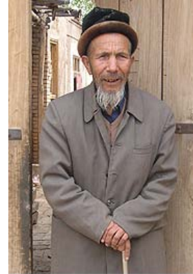
Man in Kashgar

Uighur men also commonly shake hands; this may occur after or in place of the traditional blessing of peace. Elder males and respected figures are often greeted with a light handshake using two hands. In this case, the younger, subordinate man should use his left hand to lightly grasp the back of the elder's right hand during the handshake. 216 He should also address the elder using his appropriate title, if known.