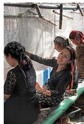
Women weaving carpets in Hotan

The family is the most important social unit in Uighur society. Extended families and their broader kinship networks serve as lifelong support systems for their members, both socially and economically. 387 This is especially the case in rural Xinjiang, where traditional ways of life remain strong and state-run social services and employment may be limited or undesirable. The family remains the central arena for preserving and propagating Uighur culture. This is a significant concern for many Uighurs amid the ongoing integration and development of Xinjiang by the People’s Republic of China (PRC) government. Because of these and other factors, Uighurs place utmost importance on familial welfare, relations, and cultural propagation; marriage and childbirth are absolute norms. Yet traditional Uighur practices concerning life-cycle events, as well as other familial practices, have been increasingly affected by government policy.