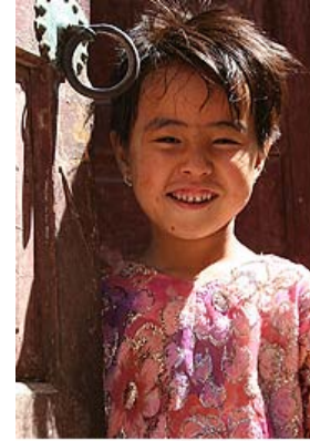
Uighur girl in Kashgar

Uighur and Mandarin (or Standard Chinese) are the most widely spoken languages in Xinjiang; both are used in official capacities. Uighur, the first language of the Uighur people, belongs to the Turkic group of the Altaic family of languages. It is closely related to Uzbek and more distantly so to Kazakh and Kyrgyz. 136 Within Xinjiang, Uighur is commonly spoken as a second or third language among non-Han ethnic groups. 137 A significant language gap persists between Uighurs and Han. Han, as well as the Hui, speak Mandarin as their first language and are generally not fluent or even functional in Uighur. Uighurs who work as government officials and teachers are required to know Mandarin; and depending on their background and schooling, younger Uighurs and those who work in service positions likely have some familiarity with the language. However, many Uighurs, especially those of older generations, may have a low level of proficiency in Mandarin. 138