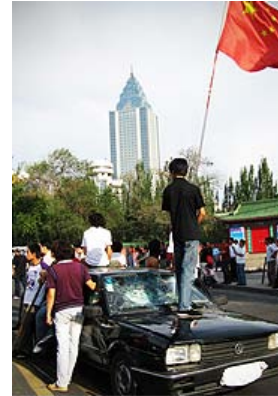
© David Vilder Han Chinese rioting in Urumqi, 2009

Throughout this time, two highly publicized campaigns initiated by the PRC—the “Open up the North-West” program of 1992 and the “Great Development of the West” program of 2000—targeted Xinjiang for intensive economic development. These campaigns involved massive investment in regional infrastructure and the development of Xinjiang's rich natural resources, particularly oil and gas. 98 They also entailed the continued in-migration of large numbers of Han. While the development programs have raised the general standard of living in Xinjiang, economic disparity persists between Han and Uighurs, the latter of whom have generally remained poorer. Such disparity has been attributed to systemic discrimination against Uighurs, whose religious affiliations and linguistic background often impair them from competing against the better-connected Han for jobs and resources in the largely state-controlled economy. 99