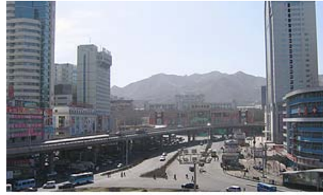
Central train station, Urumqi

Xinjiang has undergone rapid urbanization over the last few decades. 254 As of 2008, its urban areas were home to approximately 8.45 million people, or roughly 40% of the region's total population. 255 The expansive growth of urban centers has occurred as part of the People's Republic of China (PRC) government's intensive economic development of the region. The government, which maintains a commanding influence over the economy, has for several decades pursued industrialization programs targeting the extraction and processing of Xinjiang's rich energy and mineral resources and large-scale commercial agriculture. Booming urban centers have emerged around sites of industry, particularly in northern Xinjiang. At the same time, the region's ancient cities—such as Urumqi and Kashgar—have undergone modernization programs involving the construction of new transportation links, commercial districts, and high-rise buildings. Urbanization is expected to continue at a significant pace in coming years; by 2015, urban residents are expected to comprise some 47% of the total population. 256