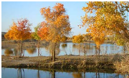
Tarim River

Running through the north, the Ertix River originates in the Altai Mountains and flows generally westward into northeastern Kazakhstan; it ultimately empties into the Arctic Ocean through the Ob River system in Russia. Also originating in the Altai, the Ulungar River flows generally westward through the northern reaches of the Junggar Basin, where it empties into Lake Ulungar. Another important waterway in the north is the Manas River, which originates in the Tien Shan and flows northward into Lake Manas, a once desiccated lake that has reportedly been revitalized in recent years. 34 Ebinur (Aibi) Lake is a huge saline lake in the far southwestern part of the basin.