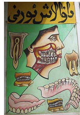
Dentist's sign, Kashgar

The health care system in Xinjiang has dramatically expanded under the PRC. 287 The quality and availability of care varies widely, however. In general, health care services in China do not meet the standards of those in the U.S. 288 As an indication of the stark divide between Xinjiang’s urban and rural areas, approximately 80% of the region’s health care services were located in urban centers as of 2001. 289 Urumqi is said to have the best hospitals in the region, although they, too, have been described as “under-equipped” and staffed with “ill-trained” doctors. 290