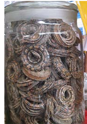
Dried snakes at a Kashgar market

As part of its broader efforts to reform the national health care system, the PRC government implemented a rural cooperative medical system in Xinjiang in 2003. This program, which has been expanded nationwide, provides government-subsidized health insurance to poor rural families. Administered at the county-level, the program focuses on inpatient and major medical treatment. 353 According to the PRC government, nearly 95% of Xinjiang’s rural population was covered under the program as of 2008. In 2009, the government also claimed that “health services in farming and pastoral areas have significantly improved, and a three-tier disease-prevention and healthcare network has been established in counties, townships, and villages.” 354