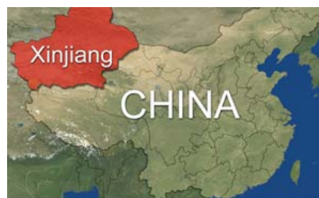
Map of Xinjiang, China

Uighurs (Uyghurs) are a Turkic Muslim people who speak a Turkic language of the same name. The majority of Uighurs live in the Xinjiang Uighur Autonomous Region, an administrative division of the People's Republic of China (PRC). Located in China's far northwest, Xinjiang (formerly Sinkiang) is a vast, thinly populated region comprising arid basins and high-altitude mountains. Its name means "new frontier" in Chinese; this description reflects the region's remoteness from eastern China, the historic power base of successive imperial dynasties and, since 1949, the communist PRC government. For Uighurs, the region is better known as Sharqi Turkistan , or Eastern Turkestan. 1