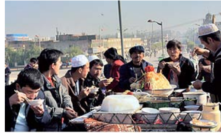
Busy food stall just after their end of Ramadan

Rozi Heyt marks the breaking of the Ramadan fast and the return to normal habits. Uighurs traditionally celebrate this event with a large feast with family and friends. They may also exchange gifts and offer alms to the needy. Uighur men customarily buy their wives new clothes during this and other important religious festivals. 191 Uighurs from throughout the western Tarim Basin congregate in large numbers at the Id Kah mosque in Kashgar to commemorate the holiday. 192