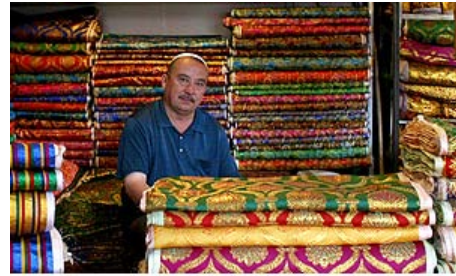
Textile vendor in Kashgar

Historically, animal husbandry (or pastoralism), oasis farming, and trade were the primary economic activities in Xinjiang. Despite earlier efforts to develop the region, its economy was overwhelmingly agricultural when the PRC took power in 1949. Xinjiang—like greater China—suffered major socioeconomic setbacks from the Great Leap Forward and Cultural Revolution. Sustained economic growth came to the region only after Chinese leader Deng Xiaoping initiated reforms, beginning in 1978, that reformed and opened up the isolated, state-controlled Chinese economy to outside market forces. Following the break-up of the Soviet Union in 1991, international market forces had a significant effect on Xinjiang's economy through expanded trade with the newly independent Central Asian republics. 103 As a result of the PRC's intensive development campaigns, the Xinjiang economy has grown considerably over the last few decades. According to the PRC, Xinjiang's local GDP (gross domestic product) reached 420.3 billion yuan (roughly USD 61.5 billion) in 2008, an almost 2000% increase from 1978. Notably, industry has now replaced agriculture as the driving economic force. Like that of greater China, the Xinjiang economy has public (state-owned and operated) and private sectors. 104