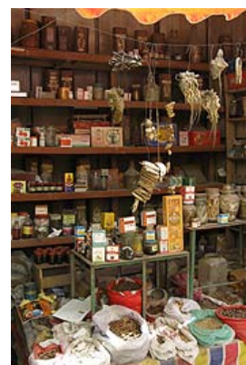
Medicine shop

As of 2001, only 20% of Xinjiang's health care facilities were located in rural areas. 347 This disparity in health care coverage leaves many rural residents without access to modern medical attention. Moreover, throughout China, the quality of health care is significantly lower in rural areas than in cities. 348 Broadly, medical care in the PRC, even at advanced hospitals in urban areas, is generally below U.S. standards of quality. 349