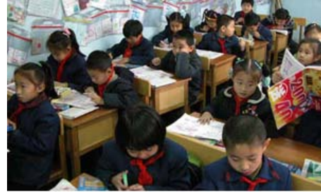
Uighur children in school

A significant product of the PRC era has been the vast expansion of Xinjiang's education system, which has contributed to a rise in literacy rates. Throughout Xinjiang, primary and junior secondary schooling—a total of nine years—is free and compulsory. Upon completing basic education, students must pass an entrance exam to attend high school. High school facilities are typically located in urban areas, as are the region's 32 universities and colleges. 297 Ethnic minorities, including Uighurs, benefit from “favorable enrollment policies” regarding admission to higher education institutions; these include special examinations and acceptance scores. 298 Akin to affirmative action programs, such policies are designed to increase minority enrollment. Urban ethnic minorities are typically better prepared for entry into higher education facilities because they are more likely to receive sufficient instruction in Mandarin at the primary and secondary levels. 299 In general, the availability and quality of education is greater in urban areas.