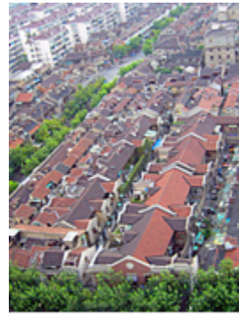
Shikumen in Shanghai

Housing, however, can be hard for residents to find in Shanghai because of spiraling property values. City officials have responded to the problem in targeted ways. Many people who have lived in the same neighborhood for years have been relocated from the inner city to make room for income-generating businesses. These residents are often not satisfied with their relocation sites on the fringes of the city, as shown by the number of protests and petitions to the city. Along with the disruption of their social networks, they have found transportation in their new neighborhoods to be a problem. City planners have acknowledged these relocations as a “significant problem” in their redevelopment programs. 192 The demolitions have been ongoing, taking place against rundown, old houses and dilapidated tenements known as shikumen . Built around the turn of the 20th century, the tenements housed Chinese people who lived in Shanghai’s western section. The space these buildings occupied has often been replaced with boutiques, bars, and restaurants. 193, 194 City planners, sometimes working with business enterprises, have also replaced slum areas with new housing and have built residential complexes close to work areas or factories in the suburbs. 195 Since the mid 1990s, many of the state-owned units have been sold to private individuals, and the private sector is increasingly involved in providing new housing. 196