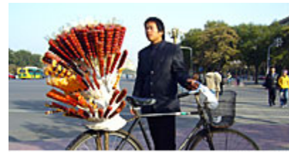
Ethnic Han street vendor

Besides being China's largest ethnic group, the Han Chinese are the largest ethnic group in the world. In China, they are concentrated along the Yangtze River as well as China's other main river valleys of China and in the Northeast Plain. Their language is Mandarin Chinese, and in the Wu region they also speak the Wu dialect of Chinese.