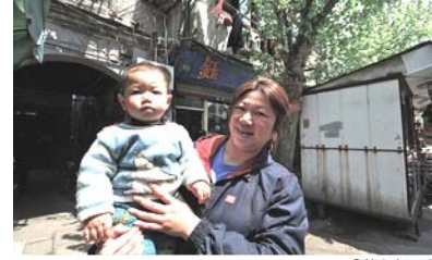
Mother and son

A Han Chinese name includes two parts, a surname composed of one or two syllables and a given name often composed of two words. The surname is from the father's lineage. In ancient China, surnames were often linked to totems, animals or beings from nature that were worshipped for certain qualities. Also, they may have represented the name of a person's village of origin, a person's profession, or a season of the year.