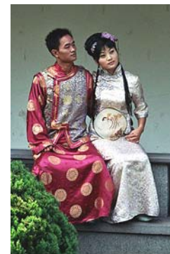
© Stefan Schneider Traditional wedding clothes

Marriage customs in China were much more formalized in the past compared to the customs that exist today. However, some conditions that surround marriage have not appreciably changed. For example, marriage has been affected by a surplus population of males in Chinese society. The ratio of males to females balanced out during the socialist period, but has since returned. The intentional surplus is a result of the traditional devaluation of females and the need of a male heir to carry on the family name and care for elderly parents. In the past, the shortage of women led to the widespread abduction, sale, or negotiation of women for marriage. This linked to a custom known