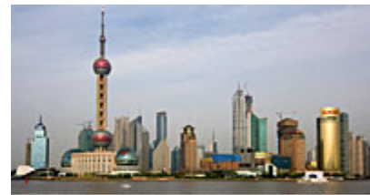
Shanghai skyline

Wu language speakers in China today live in an area that encompasses Shanghai, Zhejiang Province, southeastern Jiangsu Province south of the Yangtze River, and Chongming Island in the Yangtze River Delta. Wu is spoken as far north as Nantong and as far east as Zhenjiang, both cities in Jiangsu Province. Its reach does not include the nearby city of Nanjing (Nanking), where Mandarin is the main language. The southern extent of Wu is around the city of Wenzhou in Zhejiang Province. 5,6