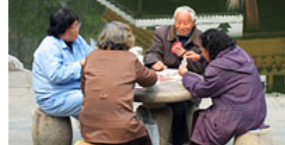
Chinese seniors playing cards in a park

Shanghai's labor market is additionally impacted by a large number of retirees, the segment of Shanghai's population that is growing fastest. Each year, 100,000 seniors retire, threatening not only the pension system but also the ability of the labor market to avoid labor shortages. This situation has motivated movement of factories inland, away from the eastern seaboard, to areas where the workforce is younger and less costly. 178