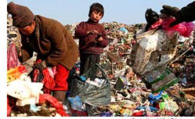
Family sifting through garbage in a Jiangsu landfill

In the late 1970s, China's government shifted from a collective system to an emphasis on individual households, in order to determine use of resources. Even though rural households gained the use of agricultural land for their own benefit under these reforms, most of the post-reform 223 economic growth that China experienced has remained in the cities. According to 2006 estimates, over 21 million rural inhabitants live below China's "absolute poverty" line, earning around USD 90 per year, and another 35.5 million earn less than USD 125 per year. 224 Economic growth has also been uneven by region; for example, greater poverty is found in western China than in eastern China. 225, 226