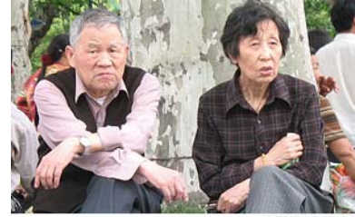
An elderly couple enjoying an outing at the park

Husbands and wives do not demonstrate their affections publicly. This trait is in accordance with the Chinese principle of maintaining social harmony by controlling one's natural impulses. It is acceptable to show emotions inside the family, but public conduct should be subdued, indirect, and respectfully polite. Further, if there is conflict between partners in a marriage, it is treated as a private matter, not to be discussed with strangers.