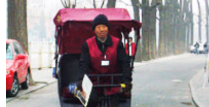
Subei Rickshaw driver

The Subei people of northern Jiangsu Province form an ethnic minority that constitutes a large number of Shanghai's urban poor. Many immigrated to Shanghai to find work after severe flooding in their region in 1911, 1921, and 1931. The Chinese government does not count them as a separate ethnic group but simply includes them among the Han, so their number in Shanghai is unknown. However, the Subei consider themselves a separate group and their population was estimated to be around one fifth of the city's population in 1949. They speak Mandarin and other Chinese dialects.