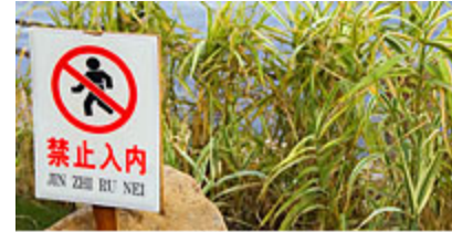
A warning sign in simplified and Pinyin characters

As a result of China's nationalist views and concurrent increasing emphasis on Mandarin as a unifying language, the Shanghai dialect is disappearing with each new generation. It bears around a mere 31% lexical similarity to Mandarin, 92 and the Chinese government has restricted its usage. To preserve the Shanghai dialect, linguists have been compiling a dictionary of Shanghainese. It is designed to be compatible with language software so that it can be used online for translation purposes. 93