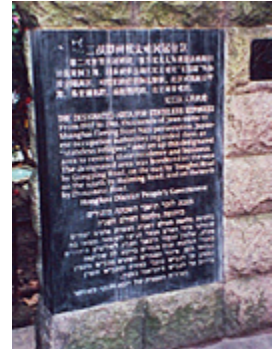
Jewish memorial in Shanghai

A Jewish community thrived in Shanghai before and during World War II, and a small community remains today. Most practitioners meet in private homes to worship, because Judaism is not officially recognized in China and there is little access to synagogues. During the war, approximately 30,000 Jews who escaped Nazi persecution in Europe received refuge in the city. The community had seven or more synagogues there, as well as its own newspapers and schools. After World War II ended, most of the Jewish people left Shanghai and the synagogues fell into disrepair, and were torn down or used for other purposes. One is now being restored in a government effort to “revive Jewish heritage” in a city that was at one time a refuge for thousands of Jews. 115