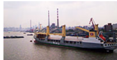
Entering the Port of Shanghai

The world's busiest port, Shanghai ships out 11.8% of all exports from China. 74 With respect to its national market, the city imports more goods than it ships out. However, the opposite is true with Shanghai's foreign trade, where the value of exported goods is greater than the value of goods imported. Nationwide, most Chinese goods are shipped to the U.S. (21%), Hong Kong (16%), and Japan (9.5%). 75 Exports from Shanghai's