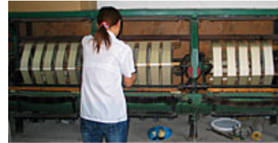
A silk factory in Shanghai

China's leading manufacturing and industrial center, Shanghai in 2005 produced 5.3% of the national GDP and 8% of China's industrial output. 72 This level of activity has resulted from the presence of a highly trained workforce, effective transportation networks, a well-established research base that supports industry, and modern communications systems. Shanghai's modernized machine tool industry produces precision instruments, lathes, and assembly equipment for electronics and computers. The city's textile mills have been reorganized to maximize their productivity and Shanghai is a primary source of cloth manufacturing, producing cotton, silk, and other fabrics.