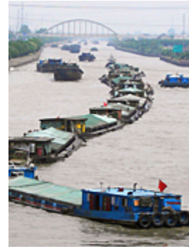
Grand Canal south of Yangtze

The Grand Canal, over 1,700 km (1,100 mi) in length, links the city of Hangzhou to Beijing. It is a north-south artery that has served transportation, shipping, and military purposes for centuries. In ancient China, it was heavily used for grain transport, connecting central and southern China’s agricultural center to the northern empire’s political center. Its oldest section was built in the 4th and 5th centuries B.C.E. in the Zhou Dynasty, and it was expanded around 600 C.E. in the Sui Dynasty. Of the six million men who worked on the canal, approximately half died in the process of building it, which contributed to the demise of the Sui Dynasty.