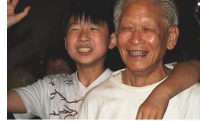
Father and son

Established in 1979 as a temporary measure to limit growth of the population, 255 China's one-child policy has limited family size and still remains in effect. The ruling applies more strictly to urban Han Chinese; rural people and minorities are less likely to be affected. A second child is allowed in rural areas after the first child reaches the age of five, but sometimes only if the first child is female. In some remote areas, a third child is allowed.