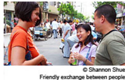
Friendly exchange between people

It is often the case in Western culture for people to be casual and revealing with their emotional reactions, as seen in the expression “He wears his heart on his sleeve.” Such is not the case in Chinese culture, where it is customary to keep one's private feelings hidden and not display them to the world. Rather than communicating friendliness, for instance, a smile or a neutral expression may simply be a calm reaction to a variety of conflicting emotions that a Chinese person is feeling. It may reflect a desire or intention to allow harmony to restore itself naturally, without reacting or attempting to change anything. An impassive expression is common, because facial expressions and body language reveal one's thoughts, and group consensus is more important among the Chinese than individual feelings.