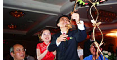
Newlyweds lighting a candle

At the wedding ceremony, the bride and groom go to the family altar and bow to their parents, their family ancestors, Heaven and Earth, and each other. A feast is held after the ceremony for family and friends who attended the wedding. Wine is served and the newlyweds toast all their guests.