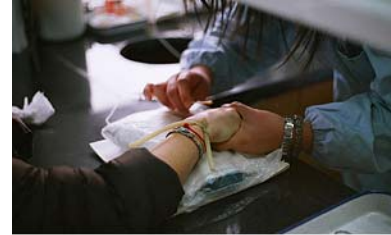
Inside a hospital in Hangzhou

Rural areas of China lack the same level of investment in medical services that urban areas receive. There are fewer hospitals and clinics in the countryside and also fewer physicians or medical personnel, especially those who practice Western medicine. Because the population has such inadequate access to health care, mortality rates are much higher in rural China. Many people receive no health care at all, because they cannot afford to pay for the services.