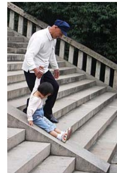
Old man and his granddaughter

China's one-child policy has created some difficulty for families, as the burden of caring for both the husband's and wife's parents falls on one family when there are no siblings. The children may not be able to take on the financial and physical demands of this responsibility. 274