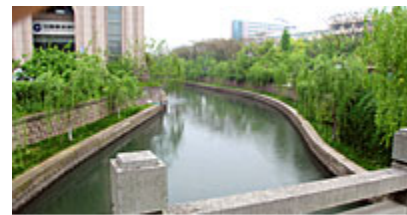
The Grand Canal in Hangzhou

In the 12th and 13th centuries, the Wu region, then centered around the city of Hangzhou (the present capital of Zhejiang Province), was China's richest area. This prosperity was the result of intense irrigation and cultivation of the land, productive fisheries off the coast, and other natural resources. Construction began in 604 C.E. on the first segment of the Grand Canal linking Hangzhou to the north. The canal improved