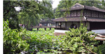
Humble Administrator's Garden in Suzhou

Around the 5th century B.C.E., the Wu language originated near Suzhou, a city that has since been a center of Wu culture and was briefly part of a Wu state. Located near the Grand Canal and Tai Lake, Suzhou attained prosperity as a center for silk production beginning in the 14th century. It was also a tourist site, favored for its elaborate gardens, arching bridges, and many picturesque canals. Several of its classical gardens are listed today in the World Heritage List of the United Nations Educational, Scientific, and Cultural Organization. Much of the city and its structures have been preserved in their ancient form, with streets and waterways designed as they were in earlier centuries. Suzhou also remains a center of literary and artistic achievement, renowned for its art schools and their students who produced poetry, calligraphy, and paintings.