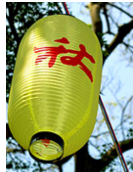
Autumn Moon Festival lantern

Many people believe the origin of this event is the celebration of the Moon Goddess in ancient times. Others believe that it honors 14th century Chinese rebellions against the Mongols and the actual use of mooncakes as part of the strategy. According to legend, the Chinese rebels often hid tactical instructions inside the small cakes (which were not part of the Mongol diet), using them to communicate with each other.