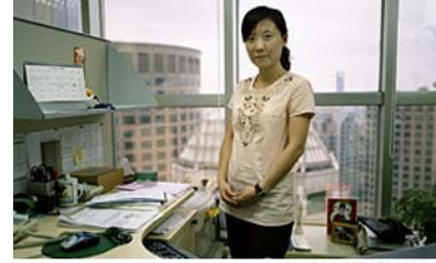
Woman office worker

In the past, divorced women in China found themselves in extremely difficult positions socially and financially. They traditionally lost custody of their children when they divorced. The fathers were considered more economically able to raise their children, and the mother could even end up homeless with no source of income. This economic situation is still a reality for women in the countryside. 281 In urban China today, however, more options exist for both women and men, and attitudes are changing. Lifestyles in general are more mobile and women are becoming more independent. Their family roles are changing, becoming more powerful, because they are seen as capable of entering a profession that can benefit their entire family. Urban women are increasingly the ones to initiate divorce, and they retain greater control over their lives when they divorce, compared to previous years. Professional women in a city such as Shanghai have found it easier to divorce, being able to support themselves and remain independent. 282