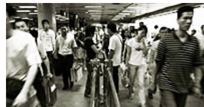
Typically dressed people in a metro station

In China, clothing should be adapted to the weather. The weather is often hot and humid in the Wu region, so light, cool clothes that can be easily washed and cared for are appropriate. Everyday wear can be casual but should be conservative, not revealing. Women often wear trousers, and in fact many temples do not allow admittance to women unless they are wearing long pants. Blouses have sleeves although they are usually short because of the climate.