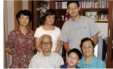
Family portrait in Shanghai

Life in villages is based on the extended family and follows patrilineal descent. In traditional families of past years, the extended family included those related by blood and marriage, who combined their finances and shared quarters. Sons brought their wives to live in the father's household, and daughters left their natal families to marry and join the families of their husbands. When a son was born to the family, the child's mother gained status and security within the family group that she belonged to through marriage. Families devoted themselves to the family ancestors as well, extending ritual veneration to ancestral shrines that they placed in their homes.