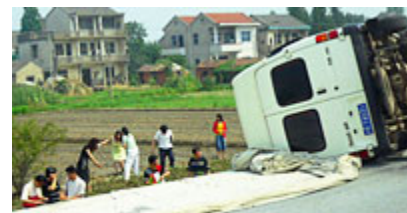
Overturned vehicle on the way to Hangzhou

Drivers should plan their trip ahead, study maps, and know which roads to take. They should also consider the possibility of mechanical breakdowns and ask the car rental agency in advance what to do in case this happens. If the car breaks down while driving and the driver does not already know where to go for help, he or she should ask someone where the nearest mechanic is located