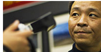
Ambiguous facial expression

Chinese people often will nod their head when speaking with others, but this does not mean they agree with what is being said or even that they understand it. It is mainly a neutral, accommodating gesture. It may be motivated by a desire to protect the speaker from losing face from having said something that the Chinese receiver does not understand.