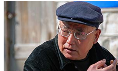
© Ming Xia An elder man in a rural village

In rural villages, villagers hold elections to nominate members who will serve on a village committee. Many villages, including those in Zhejiang Province, have adopted an open election system in which villagers directly nominate the people whom they believe are best qualified. They also choose the village chief, the authoritative person who heads the committee and provides direction, resolves disputes, and helps visitors in rural areas.