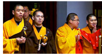
Buddhist monks in Shanghai

After its founding in the 6th century B.C.E., Buddhism remained undifferentiated for many years. However, it eventually developed into two main streams—Mahayana and Theravada. Mahayana emerged between the 1st century B.C.E. and the 1st century C.E. It gained influence in central and northern Asia, finding a home in countries such as China, Tibet, Japan, and Korea. In the 3rd century B.C.E., Theravada Buddhism became