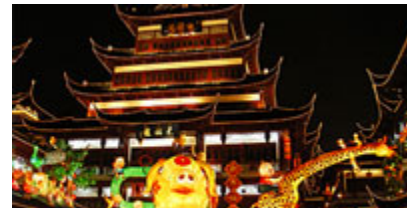
New Year's festivities in Shanghai

Chinese New Year, also referred to as Spring Festival or Lunar New Year, is the predominant traditional celebration in China and for Chinese people internationally. Signifying an auspicious beginning to a year that will be prosperous and filled with good fortune, it is celebrated in China and wherever large numbers of ethnic Chinese reside. The date of this 15-day “season” is determined by the astronomical Chinese calendar, which follows the movements of the celestial bodies. In 2008, the first day of Chinese New Year fell on 7 February, and in 2009 the first day of the New Year celebration will be 26 January. 135