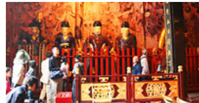
Visitors inside a Buddhist temple

In general, visitors to any temple should follow protocols that are posted in writing or that they see others observing. Once inside, if people are praying or meditating, visitors should observe silence as talking can interrupt prayers or be interpreted as rude behavior. They should not bring food or drink into a temple, nor should they point their feet directly at a Buddha statue or symbol, as this is considered offensive. Finally, they should not take photographs inside or outside places or worship without permission.