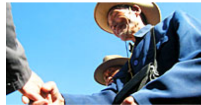
Greeting a local elder

Chinese often greet foreigners with a handshake. If the visitor initiates this greeting, he or she should shake hands with the eldest person first. If a male is shaking hands with a Chinese woman, the grip should be very light, and not prolonged. Embracing or kissing on the cheek is not acceptable except among family members. Also, because direct eye contact is considered disrespectful, similar to an invasion of privacy, many Chinese will look at the ground as they greet another person.