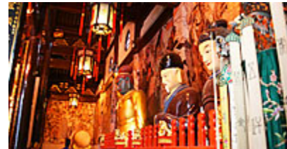
Inside a Taoist temple

Around the 2nd century C.E., Taoist beliefs were emerging in China. They became prominent during the Han Dynasty and subsequent dynasties. This religious-philosophical system is indigenous to China, developing alongside folk religion and sharing many of the same beliefs. Taoism deeply influenced some schools of Buddhism that were trying to adapt to China's culture, such as the Chan (Zen) school.