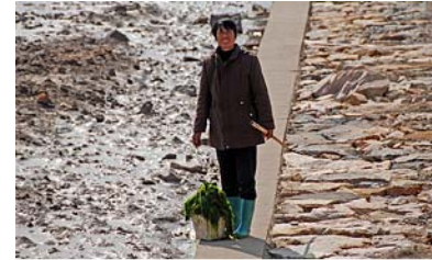
A farmer in Zhejiang Province

After the People’s Republic of China was founded in 1949, the state became the owner of all rural land and a series of land reforms was carried out. The first was a Soviet-style reform that consisted of appropriating land owned by landlords and wealthy owners and redistributing it to peasants who had no land. Reforms continued in the mid 1950s, when the government moved the small peasant landowners into collectives, creating an institution known as the People’s Commune. Under this system, property was controlled centrally, removing the individual farmers’ freedom to manage their own farming operations. The result of this change was a pattern of persistent low production.