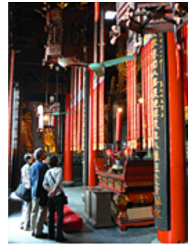
Visitors inside a Buddhist temple

Visitors should dress modestly, with awareness that Chinese culture is quite conservative. Also, strict rules apply in Buddhist temples worldwide not only about conduct but also about appearance. Visitors who enter a temple should not wear skimpy, revealing, or dirty clothing. The dress code includes clean shirts and long pants for men and long skirts or pants along with blouses or sweaters that cover the shoulders for women. Both should remove their shoes before entering (unless they observe that it is customary to leave them on) and refrain from touching paintings or statues.