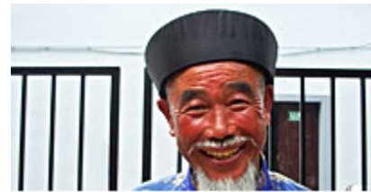
A friendly smile

The concept of “saving face” is also a powerful underlying force when communicating with Chinese people. A visitor can speak in a way that causes the recipient to either lose face, resulting in negative outcomes, or save face, resulting in more positive communicative outcomes. In the former case, losing face is caused by interacting rudely, showing lack of respect, disagreeing publicly, or speaking in a confrontational way. Alternately, it is possible to give face or cause another to save face by speaking politely, showing up to support someone, showing one’s respect. This clearly is the route to getting things done in cooperative ways.