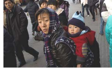
Woman carrying a child

The division of labor in Chinese households in rural areas falls along gender lines. Women are responsible for running the household, socializing their children, and caring for the welfare of family members. Women are not confined to the household, however, and are fully expected to help with all stages of agricultural production.