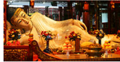
Inside the Jade Buddha temple, Shanghai

In Shanghai, the Jade Buddha Temple is an example of a traditional religious structure that is still in restricted use. Built in the late 19th century and relocated to Shanghai in 1900, this Chan (Zen) temple suffered destruction in the 1911 Revolution, when part of its complex was burned. The city later provided restoration funds for the entire temple complex. During the Cultural Revolution, it remained undamaged by the Red Guard, who in general were destroying cultural sites that symbolized China's dynastic history but left this particular one alone. In the modern era, tourists visit this temple, which houses monks who run a Buddhist study center. The temple holds two white jade Buddhas that remain objects of reverence today, with many people visiting to burn incense and offer prayers. 142