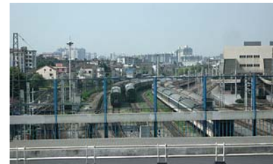
Passenger trains in Hangzhou

The state-owned systems link rural farms, coal mines, forests, and factories.