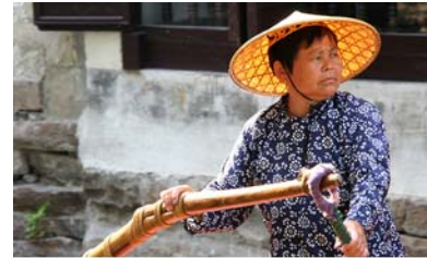
© Emma Chen Woman working in Zhou Zhuang

In rural areas close to cities, a close link exists between city and village. This is a pattern found within much of the Wu region. Peasants who live close to an urban market must adapt their agricultural production and lifestyle to the increasing demands of the growing market. There may be greater options for jobs in the cities, leading rural residents to migrate to the city in search of work. Sometimes they continue living on their farms and