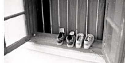
Shoes outside a family home

Do not use obscene or indecent language within earshot of Chinese citizens. Many may be familiar with American slang.