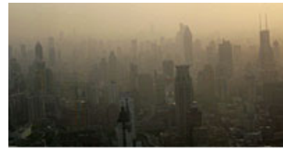
Shanghai as viewed from the Jin Mao Tower

Beginning in 1950, the CCP created a planned economy under which the government determined pricing, distribution of services and products, and production schedules. In the late 1970s, officials—aware of the need for reform—redirected the planned economy into a socialist market economy over a period of years. Under this system, the state sector remained in control alongside elements of a free market economy and foreign investment. The government also replaced collective farming with an individual household contracting system, giving farmers a motivation to cut costs and produce more. In 1984, the state extended reforms to urban areas. From these and other changes, economic growth resulted. In the 1980s, China’s average national gross domestic product (GDP) was among the world’s highest at 10.2% yearly. 65 China became a member of the World Trade Organization (WTO) in 2001, and the private sector continued to grow rapidly. The country’s high rate of GDP continued into the 21st century, although it dropped to 10.1% for 2004 and 9.9% for 2005. 66 Even more indicative of high growth