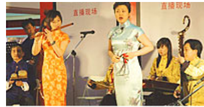
Female performers wearing Qi Pao dresses

In the early years of the Republic of China (1911–1949), the predominant fashion for Chinese men was the Ma Gua (a gown worn with a Mandarin jacket). The long gown ( Chang Pao ) worn alone was also fashionable. Depending on the activity, the fabric and design varied from formal and elegant to more casual. Chinese men who worked for foreign companies also began wearing Western-style business suits.