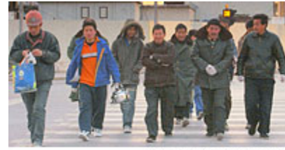
Chinese workers at the end of their shift

Shanghai's labor market is highly diversified. Approximately 200 million people have moved from rural areas to China's cities in search of work, 170 taking advantage of lowered restrictions on internal migration. Many of these migrants in the 1980s and 1990s relocated to Shanghai and ended up being a major source of low-cost unskilled labor. They were attracted to Shanghai for a variety of reasons, beginning with the city's booming economy. Central government policy after 1949 had designated Shanghai as a manufacturing center, and market forces began to expand the economy after reforms that started in 1978. Shanghai and other principle cities in China also became more autonomous at that time and began to seek out higher levels of international investment and trade. 171 In the 1990s, growth in Shanghai accelerated even more, although it declined in some areas, such as textile production. The city's widespread transportation networks and modern communications systems have helped to promote economic activity. Not only has the Shanghai municipality become a center of technology, research, manufacturing, and industry, it is also one of China's strongest financial centers. 172 Besides attracting migrant workers, the powerful economy has attracted thousands of highly skilled workers and professionals. Relocating to Shanghai from all over the world, they have boosted the city's tax revenue by becoming working residents. 173