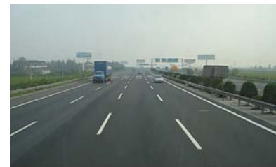
Shanghai - Hangzhou highway

Currently, there are no military checkpoints in the Wu region (Shanghai, North Jiangsu Province, and Zhejiang Province). If checkpoints are set up for any reason, drivers or pedestrians going through the checkpoint should comply with authorities, follow instructions, and politely produce any requested documents.