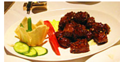
Dinner at a fancy restaurant

There are many rules about dining etiquette in China, whether at a guest’s home or in a restaurant. Following the rules means that a guest gains face and also gives the host face as well. To start, guests should sit where they are directed. The host always faces the door and sits in a place of easy access, where he can get up easily to greet others or go into the kitchen if necessary. Once the food is on the table, the host is the first to begin eating. He is also the first to offer a toast.