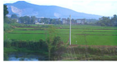
Rice paddies near Nanjing

With its rich floodplain soils and monsoon climate, the Wu region of China has traditionally been a farming society. China's agricultural heart since early times has been the river valleys, especially the Yangtze River Valley. Because of intense early irrigation and cultivation of the land, peasants in early centuries were able to support themselves by growing rice and other crops. The Grand Canal, running through the Wu region, enabled growers to transport their produce from the south to markets in the North China Plain, reaching the political center of the northern empire. Around the Wu cities of Wuxi and Suzhou, the land was covered with a network of canals that helped to make it a center of agricultural production in dynasties from the 14th through early 20th centuries. Hangzhou also has long been a center for rice growing. Situated at the southernmost point of the Grand Canal, Hangzhou is connected to other waterways and canals that link to the Yangtze River Delta near Shanghai. This access to water and transportation networks ensured Hangzhou's predominance as a farming and shipping center.