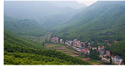
Hills in the Zhejiang Province

The western and southern parts of the Wu region consist of rolling hills and low mountains that generally do not exceed more than 1,000 m (3,280 ft) in height. 8,9 In Zhejiang Province, which constitutes most of the Wu region, hills comprise over 70% of the total land area. 10 The land is mountainous toward the southern part of the region, where the coastline is very rocky and indented. Forests and groves of bamboo carpet the hills, plateaus, and valleys in many areas, and the wood is harvested for trade.