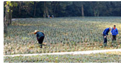
© Alexandra Moss Villagers harvesting tea leaves

Historically, the area around the Yangtze River Delta and to the south has been a powerhouse of agricultural growth. This includes Zhejiang Province's northern region, along with the prosperous lands that reach into the Shanghai area and southern Jiangsu Province. For centuries, a highly developed irrigation system that includes the Grand Canal and a network of waterways sustained agriculture in the region. In 1949, farmers in northern Zhejiang and southern Jiangsu provinces began cultivating two rice crops yearly. In Zhejiang Province, approximately 80% of the arable land is under irrigation, one of southern and eastern Asia's highest irrigation ratios. Agricultural output here is diversified and includes rice, barley, wheat, sweet potatoes, and corn. Industrial crops such as jute, cotton, tobacco, sugarcane, and rapeseed are grown for manufacture.