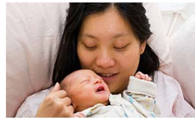
Mother and newborn child

It is customary for newlyweds to look forward to the birth of a child, since life in China is still very family-centered. In poor villages and households, children represent a source of assistance. They can help the family with farm work, housework, and caring for younger brothers and sisters. Children are also seen as part of a social security network which ensures the parents will be cared for in their old age, especially if the child is a son.