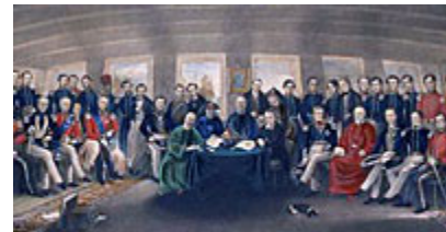
Signing of the treaty of Nanjing

After the overthrow of the Ming Dynasty, the Manchu Qing Dynasty (1644–1911 C.E.) gained control, reaching the zenith of its centralized power in the mid 1800s and then declining. Faced with problems associated with population growth and declining revenues, the Qing rulers tentatively entered into commercial relations with Great Britain and western nations in the late 1700s. Britain, however, wanted more than the limited trade it received and resorted to introducing opium into China, which produced a profitable market. Opium addiction became widespread and acute in China by the 1830s, and the Chinese government attempted to stop the illegal trade. The British retaliated with armed warships and the first of two of China's Opium Wars began in 1839. The First Opium War ended in 1842 with the signing of the Treaty of Nanjing, which