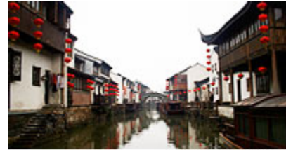
Fishermen on the Yangtze River

The Wu region is one of China's most popular tourist destinations. Jiangsu Province has a large number of historical cities, such as Nanjing and Suzhou, and many structures in these cities date back to antiquity or have historical significance. The area holds many Buddhist temples and relics as well as scenic attractions such as Tai Lake and other lakes, bridges and canals in the cities, and Suzhou's classical gardens.