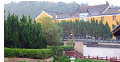
A Buddhist temple on Putuo Shan

Putuo Shan (also called Putuo Mountain) is a small, scenic island in Hangzhou Bay. It is located east of Zhoushan (Chou-shan) Island, the largest island in the Zhoushan Archipelago. Putuo Shan is one of China's four sacred Buddhist mountains and the only one located in the sea. Founded around 916, it became a pilgrimage site in the Song Dynasty (960–1279 C.E.), associated with the cult of Avalokitesvara (Chinese Guanyin), goddess of mercy. Guanyin's image was brought to Putuo Shan from a Buddhist center on the mainland nearby. During the 11th century, a temple in honor of the goddess Guanyin was reconstructed and expanded and it later became one of Chan (Zen) Buddhism's major temples.