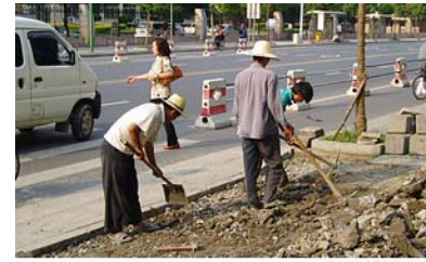
Migrant workers in Hangzhou, Zhejiang province

The individual household usage system stimulated agricultural production through the mid 1980s. In 1985, however, grain production dropped and stagnated into the 1990s, exposing a number of weaknesses in the household responsibility system. First, it led to a number of small, fragmented units, some with better quality land and irrigation rights. Much of the land was wasted in the form of boundaries and paths that separated the plots. The second problem was that eligibility to receive land rested on one's status as a villager. This egalitarian principle held true no matter when such status was acquired and no matter who held it, whether a long-time village resident or a newly relocated spouse from a different village. This led to further fragmentation of the small plots and a costly redistribution system in which many farmers pursued short-term gain and exhausted the land. Last, many farms had too much land and not enough labor, while others were overstaffed, especially in areas that were urbanizing in the face of industrial growth. This led many farmers to leave the land and migrate to the cities in search of work.