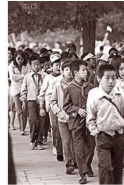
Young students in Hangzhou

Children are required to attend school for nine years, although the shortage of schools and teachers in rural China makes this less likely for children who grow up in such areas. Class sizes tend to be very large in country schools and many children have to walk or be transported long distances to their schools. Many rural children drop out of school or never attend, beginning agricultural work in the fields as early as six years of age. In such cases, they have few options in their lives, few possibilities of escaping poverty.