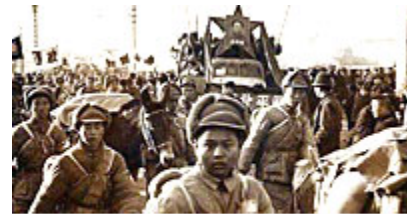
PLA forces enter Beijing

Many of the 20th century political changes that buffeted China were concentrated not only in Shanghai but throughout the Wu region. After Chinese nationalists overthrew the Qing Dynasty and established the Republic of China in 1911–1912, Zhenjiang Province came under the control of warlords, as the republican rule was not firmly established. The same province became the power base for the Kuomintang (Nationalist Party) power base in the 1920s, led by Chiang Kai-shek.