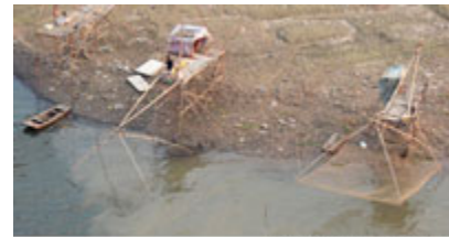
Fishermen on the Yangtze River

Northern Zhejiang Province, the offshore Zhoushan Archipelago, and the Yangtze Delta together comprise one of the world leading centers of aquaculture, the farming of fish (especially carp), shrimp, shellfish, and scallops. Plants such as edible algae and seaweeds are also harvested. Besides the many large aquaculture facilities, small ponds are also a source of farmed marine products. Many cultivators in Zhejiang Province have small lakes or ponds where they raise fish, supplementing their income from farming.