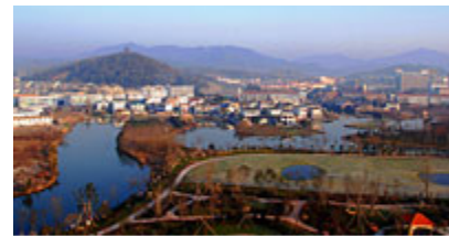
Zhoushan City

The Zhoushan archipelago (island chain) is located in the southern Yangtze River Delta in Hangzhou Bay. It extends in a northeasterly direction off the coast from the city of Ningbo, and its many islands are actually the submerged peaks of mountain ranges in Zhejiang and Fujian provinces. Rugged and steep, they were at one time part of the southwestern Korean peninsula mountain ranges. Set among a much larger number of islands off China's coast, there are hundreds of islands in this group, the largest being Zhoushan (Chou-shan). 20 Because they lie at Hangzhou Bay's entrance, they accumulate large amounts of silt from the delta of the Yangtze River, slightly to the north. Over the