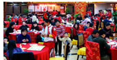
© Paolo Vasta Inside a busy restaurant

In Shanghai, restaurants appeal to a local and international range of modern and traditional tastes and eating styles. Shanghai cooking is famous for its