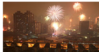
Fireworks during the Spring Festival in Shanghai

There are a number of non-religious public holidays in China. New Year's Day on the first day of January is a secular worldwide holiday. More important to Chinese culture is the Chinese New Year (also called Spring Festival), marked as a holiday in 2008 from 7 February through 9 February. This begins a 15-day celebratory period throughout the country and in international Chinese communities. Although Chinese New Year has some religious overtones, it is simultaneously a secular event in which artists perform dragon and lion dances to chase away harmful spirits. The celebration also includes Chinese opera performances, family reunions, elaborate fireworks, and ceremonies to satisfy spirits of the ancestors.