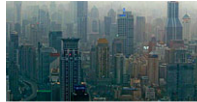
Shanghai as viewed from the Jin Mao Tower

A city of momentous change, Shanghai sits on the bank of the Huangpu River, a tributary of the Yangtze, near the mouth of the Yangtze River. Shanghai, which translates to “on the sea,” began as a fishing village over 1,000 years ago. Today it is China's largest port and the first to open to trading with the West. It became an international city partly as a result of war reparations from the First Sino Japanese War (1894–1995), which forced China to allow Japan and Western nations to make direct investment in the country. The French, British, and Americans had been awarded small territorial zones in Shanghai, immune from Chinese law, after the end of the first Opium War between China and Britain in the mid-1800s. It was in the late 19th century, however, when Shanghai's international community began to grow substantially. In the early 20th century and beyond, Shanghai became home to powerful international houses of finance and commerce.