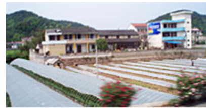
Farm in Zhejiang province

Technological progress in agriculture has led to higher crop yields, which, when combined with rising population, has resulted in a surplus of rural laborers. Thousands of these laborers from the Wu region's Zhejiang Province and southern Jiangsu Province have migrated to the large cities of the region, such as Shanghai. Here, they form a cheap labor pool and enter into the status of second-class citizens. Before they leave the countryside, however, they must get permission, in the form of a permit, in order to leave their original residence. Many acquire the permit, but are later forced to return home if the urban economy declines, or they simply do temporary, seasonal work in the city. 231 Back in their rural homes, they often remain unemployed or underemployed.