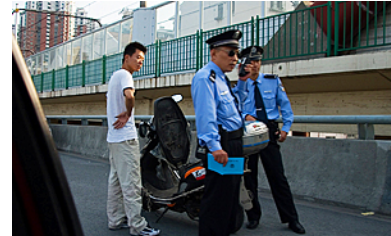
Shanghai police officers

In Shanghai and other urban areas, poverty is widespread and stealing is common. Stealing generally occurs in crowded places, where the thief is more likely to get away undetected. Sales scams are also common, in which salespeople will misrepresent the goods they are selling, claiming the value is higher than it is.