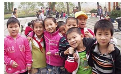
School children in Hangzhou

Schools in rural areas must rely on self-funding, compared to urban schools, which receive state financing. Because of this inequity, the quality of rural education is generally lower throughout China, with regional variation. The Chinese government has reported that 8% of the country's rural residents are illiterate, and many regions, especially in the west, have no schools. 247 In the wealthier eastern part of the country (including the Wu region), rural schools are likely to be better funded.