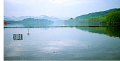
Light rain on the West Lake in Hangzhou

Wu territory is part of China's eastern monsoon climatic zone, characterized by humid, subtropical conditions. There are four distinct seasons, the coldest in January and the warmest in July. Average daily temperatures range between 15–18°C (59–64°F). Both sunshine and rainfall are abundant, with most of the rain occurring in May and June. The rainfall in Hangzhou, located approximately in the middle of the Wu region on the coast, reaches around 1,450 mm (57 in) yearly. This area is also subject to annual typhoons in mid-summer. 14, 15, 16