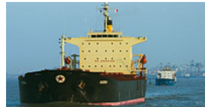
Tanker on the Yangtze River

China's energy demands have been surging nationwide. Countrywide, China is the third largest oil importer (for net imports) in the world, after the U.S. and Japan. 81 For 2006, the country's oil consumption was projected to increase to "38% of the total growth in world oil