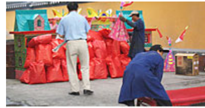
© Meghan Elizabeth Funeral preparations at a Buddhist temple

After a person dies, family members use red paper to cover all household representations of deities to shelter them from exposure to the body of the deceased or the coffin. Household mirrors are taken away because it is believed that if anyone views the coffin's reflection, that person's family will suffer a death in the near future. The family also hangs a white cloth across the entrance to the house.