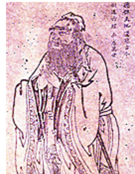
Confucius from Tang Dynasty

Confucianism, which developed in the early centuries B.C.E., has been described as a philosophy, a way of life, a religion (although not organized), and a social ethic. Because it emphasizes a political and moral system that will govern order among social relationships, all centered around a ruler, it was favored by early Chinese dynasties. Its ethical values regarding human interaction have strongly influenced life in China for over 2,000 years. They can be seen in family life as well as in government, education, and societal institutions.